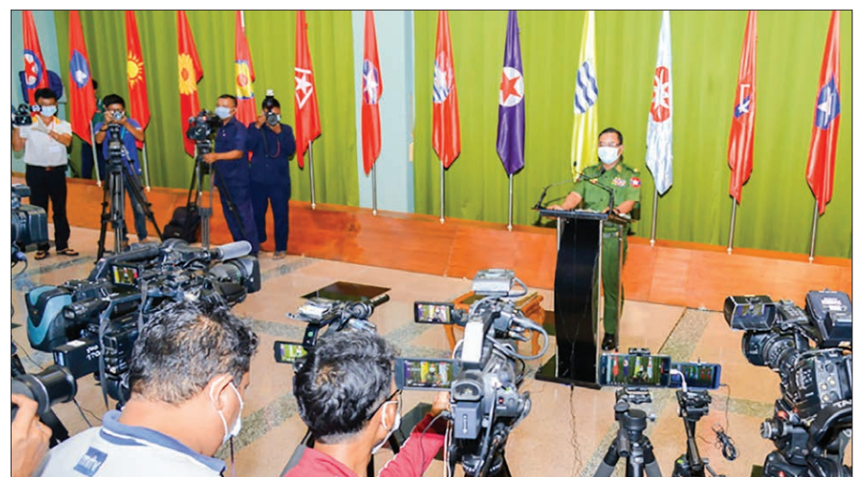
Tatmadaw True News Information Team holds a press conference on 4 August.

THE Tatmadaw True News Information Team held a press conference at the Defence Services Museum in Nay Pyi Taw yesterday.