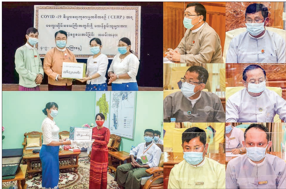
Union Minister Dr Win Myat Aye joins a ceremony to present cash assistance to PWDs under CERP on 4 August.