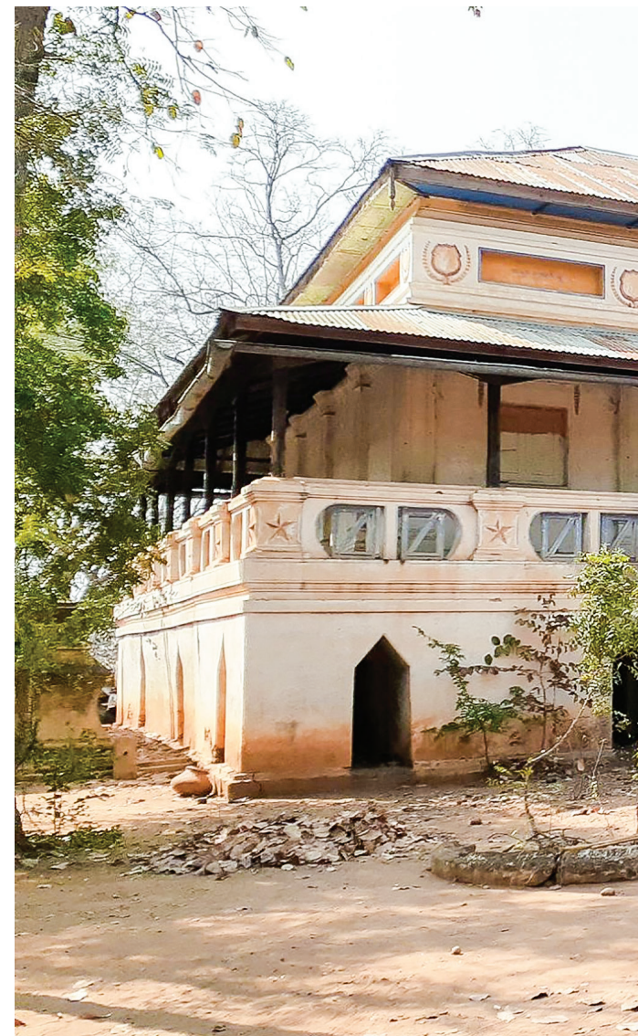
Sayadaw U Bud Brick Monastery.