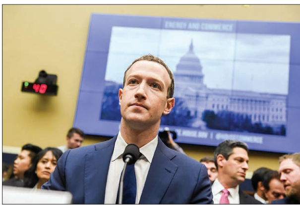
Facebook CEO and founder Mark Zuckerberg testifies during a US House Committee on Energy and Commerce hearing about Facebook on Capitol Hill in Washington, DC, April 11, 2018.

"Anyone who is saying the election is going to be fraudulent, I think that's