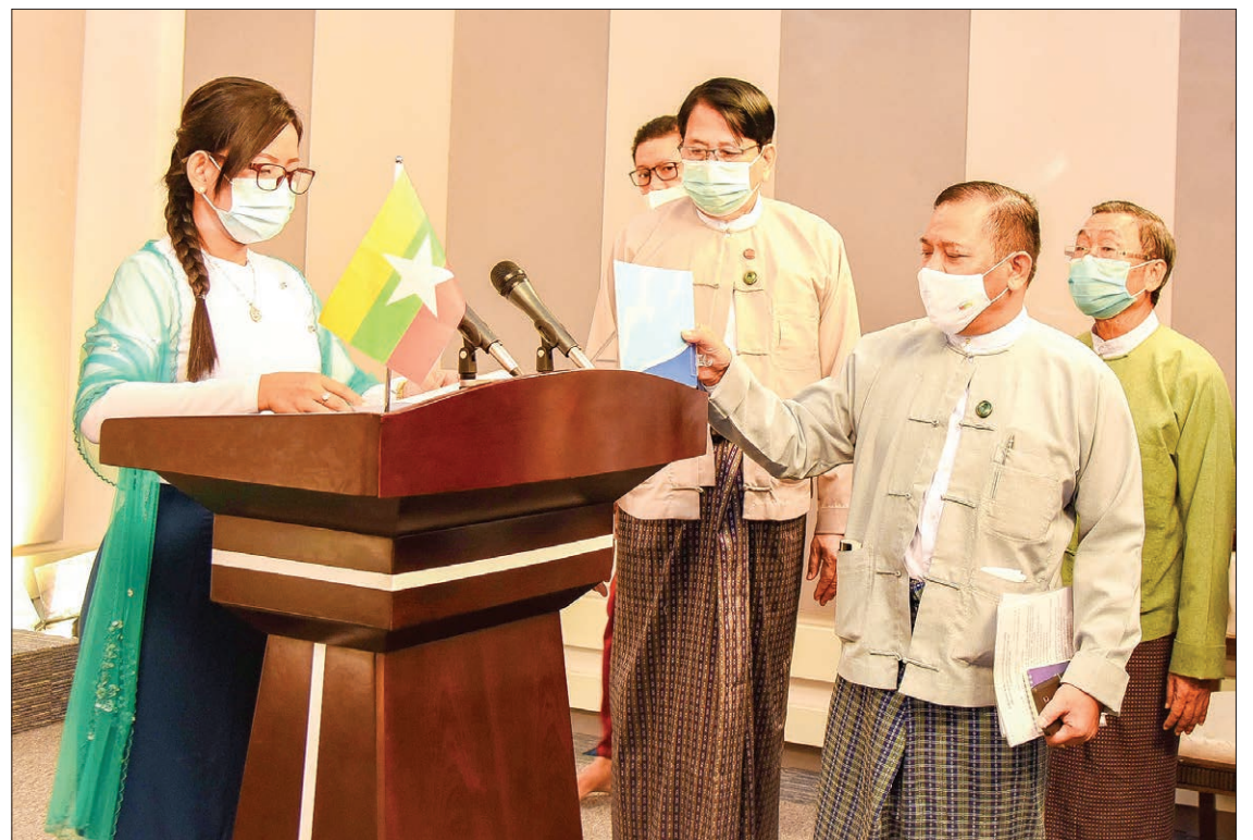
Union Minister Dr Pe Myint inspects preparations for making broadcast campaign programmes of political parties on 4 Sept.