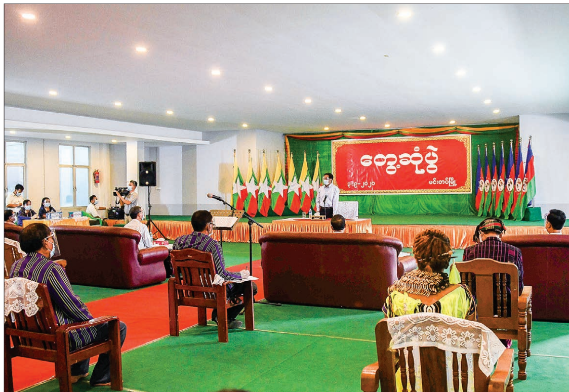
Vice President U Henry Van Thio speaks during the meeting with town elders in Mindat, Chin State on 3 September 2020.

Development projects would include upgrading Mindat college into university level, upgrade of Kanpetlet-Sami-Paletwa road into Myanmar-India trade route, development of road network in the state, constructions of Surbung airport in the northern part of the state and Lailenpi airport in the southern part which was