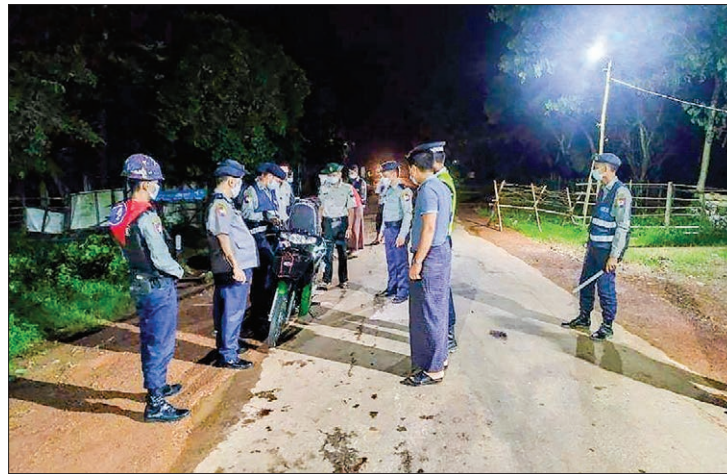
Police check a motorcycle in Yangon on 3 September after a curfew was imposed to prevent the spread of COVID-19.

Authorities took legal action against 647 people including 618 males and 29 females, 111 vehicles and 18 motorbikes on 2 September and 324 people including 308 males and 16 females, 73 cars and 24 motorbikes on 3 September under Section 188 of the Penal Code in Yangon region for breaking of the curfew.