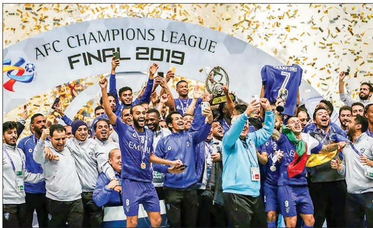
Saudi Arabia's Al-Hilal won the AFC Champions League last year.

KUALA LUMPUR — Asia's football body is "confident" of completing its coronavirus-hit Champions League this year, a