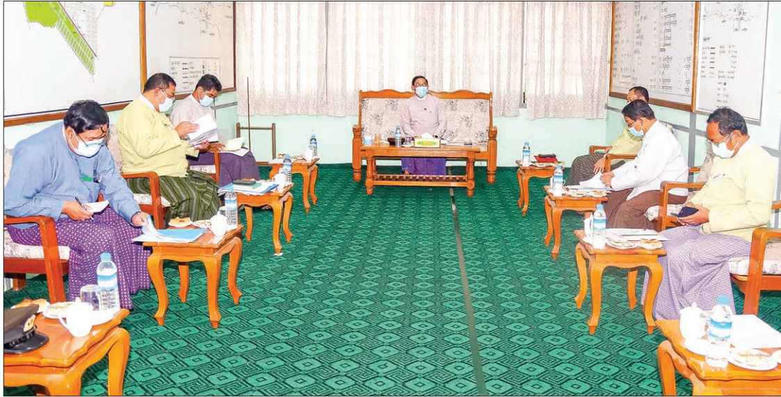
Union Minister U Min Thu discusses administrative procedures for successful holding of 2020 General Election on 4 September 2020.

UNION Minister for the Office of the Union Government U Min Thu held a meeting with chairperson and members of Tatkon election sub-commission at the Government Administration Office in Tatkon, Nay Pyi Taw yesterday.