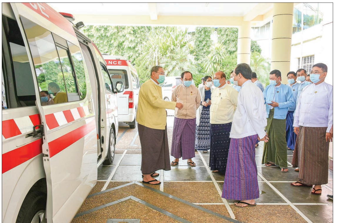
Ministry of Planning, Finance and Industry hands over four ambulances to Ministry of Health and Sports on 4 September.

Ministry of Planning, Finance and Industry for manufacturing the vehicles and the Ministry of Investment and Foreign Economic Relations for international assistance.