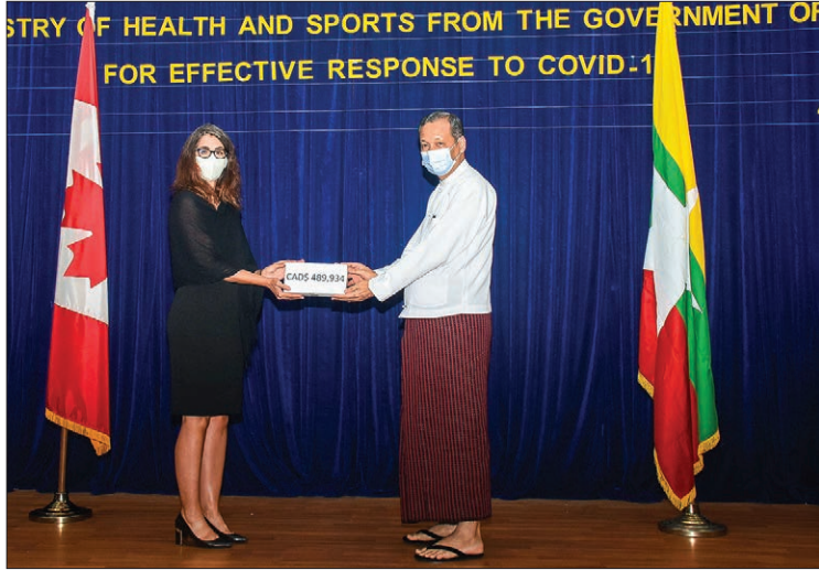
Ministry of Health and Sports receives N-95 masks from Embassy of Canada on 4 Sept.

THE Embassy of Canada donated N-95 masks worth of 489,934 Canadian dollar to the Ministry of Health and Sports yesterday in Yangon to mitigate and prevent the spread of the COVID-19 in Myanmar.