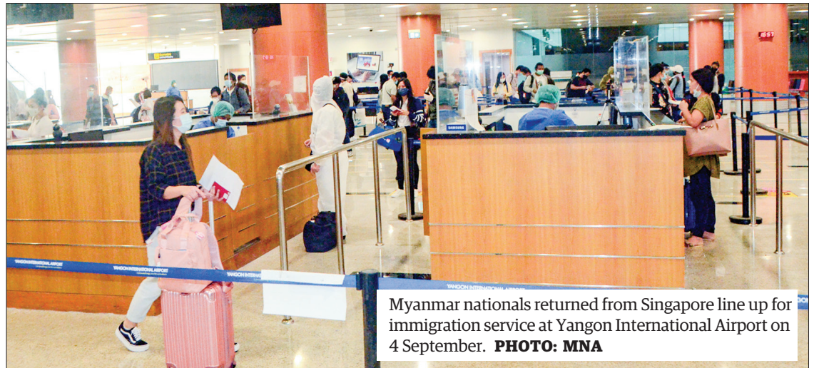
Myanmar nationals returned from Singapore line up for immigration service at Yangon International Airport on 4 September.

Committee on Coronavirus Disease 2019 (COVID-19), the Ministry of Foreign Affairs cooperated with the relevant ministries and Myanmar embassies from respective countries, and has organized 16 relief flights to pick up Myanmar nationals stuck in Singapore to date.—MNA (Translated by Khine Thazin Han)