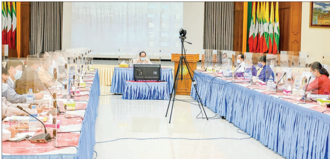
Union Minister Dr Myint Htwe presides over daily meeting of his office on update situations of COVID-19 on 4 September 2020.

THE Ministry of Health and Sports held a coordination meeting at its headquarters in Nay Pyi Taw yesterday to review the control measures against COVID-19.