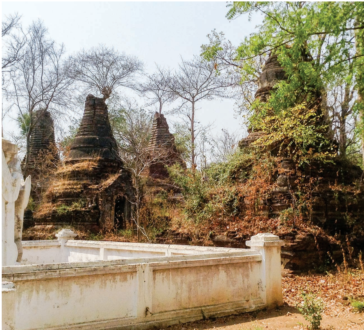
Ancient Pagodas in Nyaungkan Village.