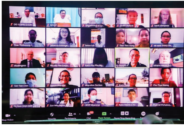
Union Minister U Thein Swe (R) joins the meeting of National Advisory Committee via videoconference on 4 September 2020.

The officials of Ayeyawady Region need to conduct the educating programmes regarding the migration in line with the health guidelines of Nation-