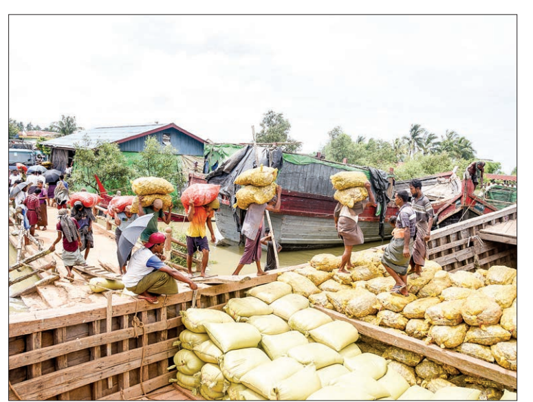
Workers load goods into a vessel for export.

The products traded between the two countries in-