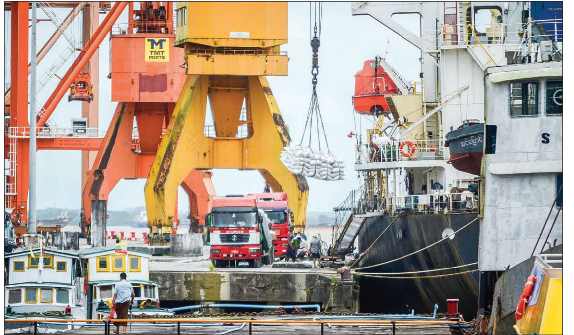
(FILES) Rice bags are being loaded onto lorries at a port in Yangon on 18 September 2017.

In the current financial year, 694,222 tonnes of rice and broken rice were exported