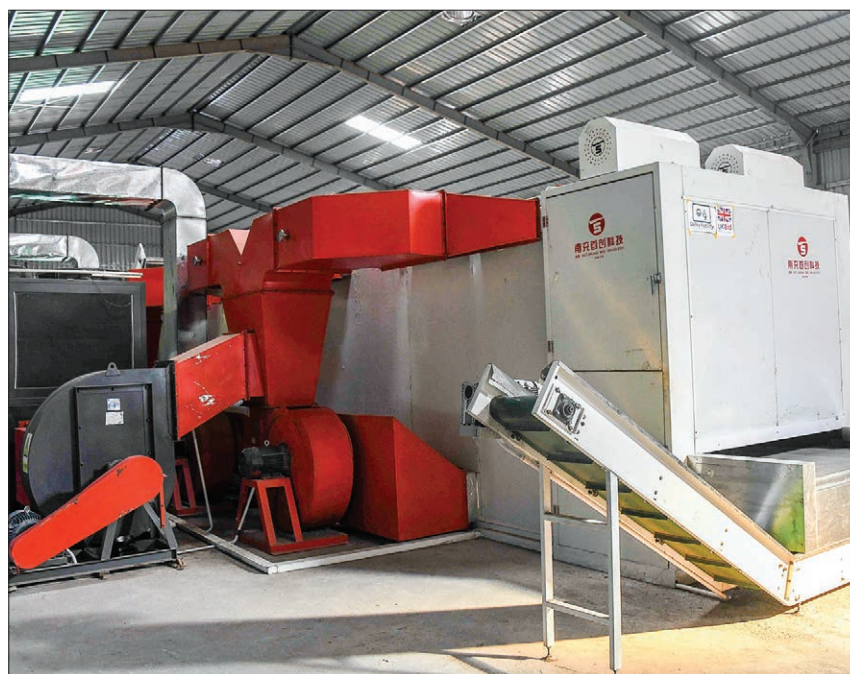
Vice President U Henry Van Thio and party inspect elephant foot yam drying factory in Mindat Town, Chin State on 3 September 2020.