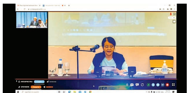
Myanmar officials of Anti-Corruption Commission attend first intersessional meeting against corruption.

They also discussed implementations of Myanmar Sustainable Development Plan-MSDP (2018-2030) goals in accordance with Sustainable Development Goals-SDGs and Anti-Corruption Strategy Plan (2018-2021), ongoing year-by-year work plans and anti-corruption cooperation. —MNA (Translated by Kyaw Zin Tun)