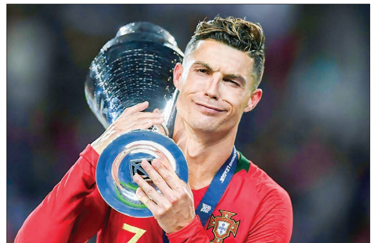
Cristiano Ronaldo hoisted the Nations League final trophy in Porto last year but is a doubt when Portugal start theirs at the same stadium against Croatia.

all competitions last season, a record for a Juve player, and insists he remains ambitious, laying out his season 'goals' on Instagram last week. "Victories. Commitment. Dedication. Professionalism. With all my strength and with the precious help from my teammates and all of the Juventus staff, we work once again to conquer Italy, Europe and the World!" he wrote.—AFP ■