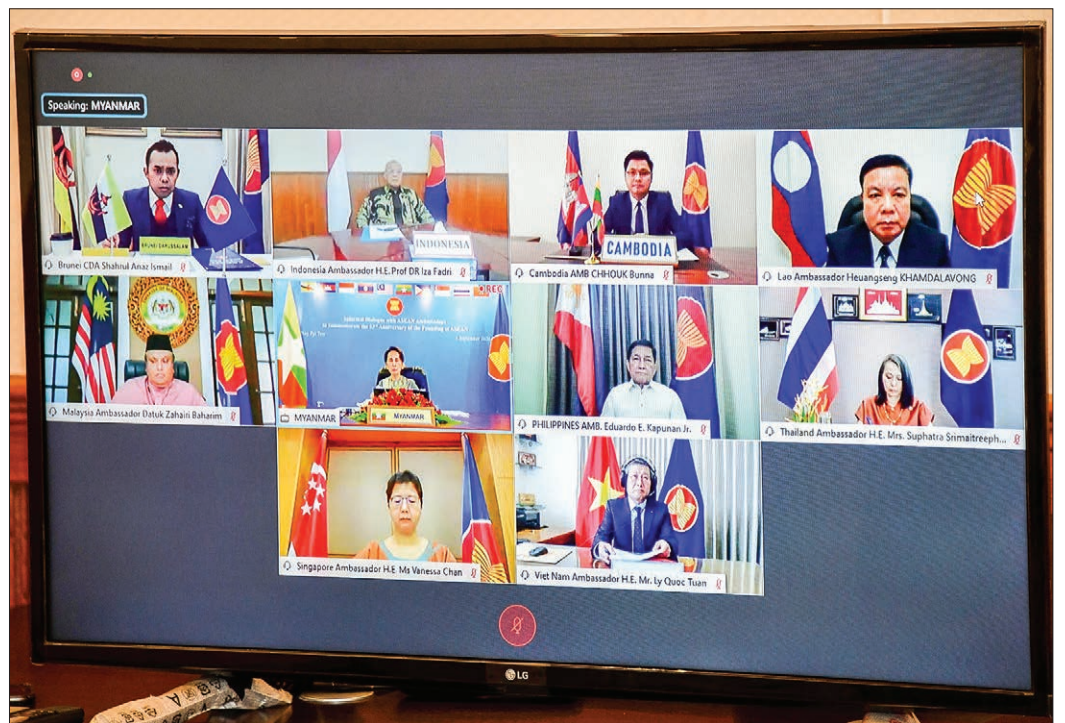
State Counsellor Daw Aung San Suu Kyi holds meeting online with ASEAN Ambassadors in commemoration of the 53rd Anniversary of the Founding of ASEAN Day on 4 September 2020.

I N commemoration of the 53rd Anniversary of the Founding of ASEAN, State Counsellor and Union Minister for Foreign Affairs Daw Aung San Suu Kyi held a videoconference with the ASEAN Ambassadors to Myanmar yesterday at 10 am from the Ministry of Foreign Affairs, Nay Pyi Taw and exchanged views on national efforts of ASEAN Member States and shared information, experiences and best practices in response to the COVID-19 pandemic. The Ambassadors from Viet Nam, Cambodia, Indonesia, Lao PDR, Malaysia, the Philippines, Singapore, Thailand and Charge d' Affaires a.i. of Brunei Darussalam participated in the videoconference.