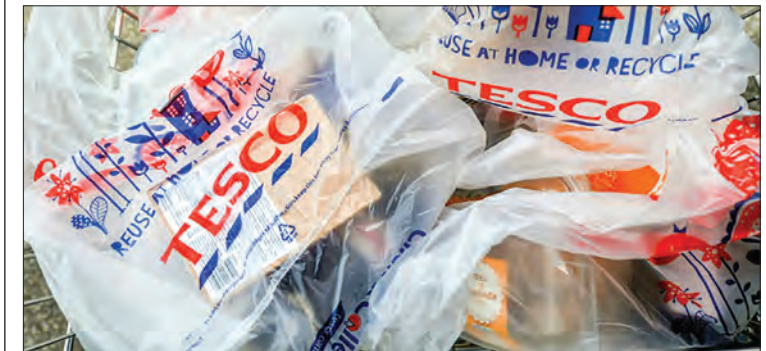
Britain's biggest retailer Tesco is to sell its businesses in Thailand and Malaysia to Thai conglomerate CP Group.

sands of jobs as part of a massive cost-cutting programme.— AFP