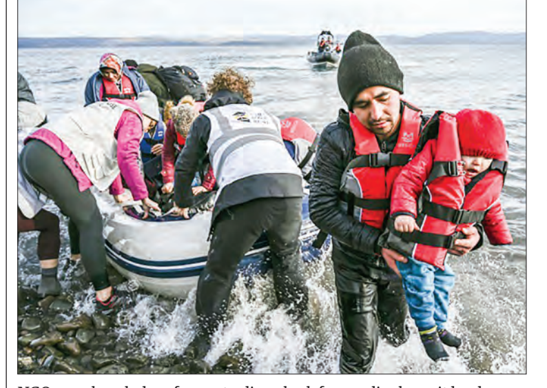
NGO members help refugees to disembark from a dinghy as it lands ashore the Greek island of Lesbos.

"Hey Greece! I appeal to you... open the gates as well and