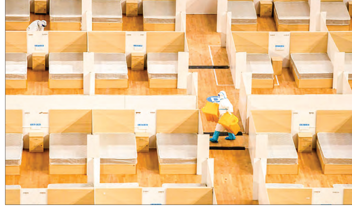
A staff member removes waste after the final patients were discharged from a temporary hospital set up to treat people with the COVID-19 coronavirus in a sports stadium in Wuhan.

On Monday, all the new cases in the province were in the capital city Wuhan, where the