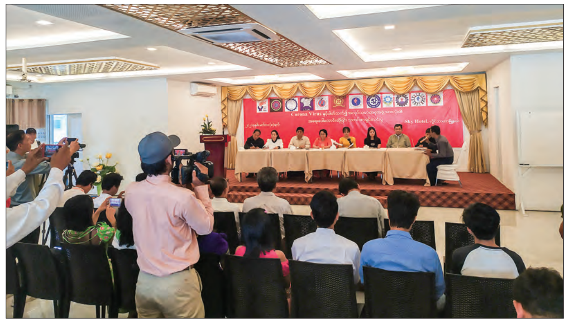
Labour organizations hold press Conference on factories closure after COVID-19 outbreak at the Sky Hotel in Hlinethaya, Yangon yesterday.

The 12 workers' groups answered questions at the press conference. They called for the formation of an inspection group to look into the shortage of raw materials, and asked the authorities to govern volatile commodity prices, authorize the inspection group, and provide guidelines on preparations for a possible virus outbreak.