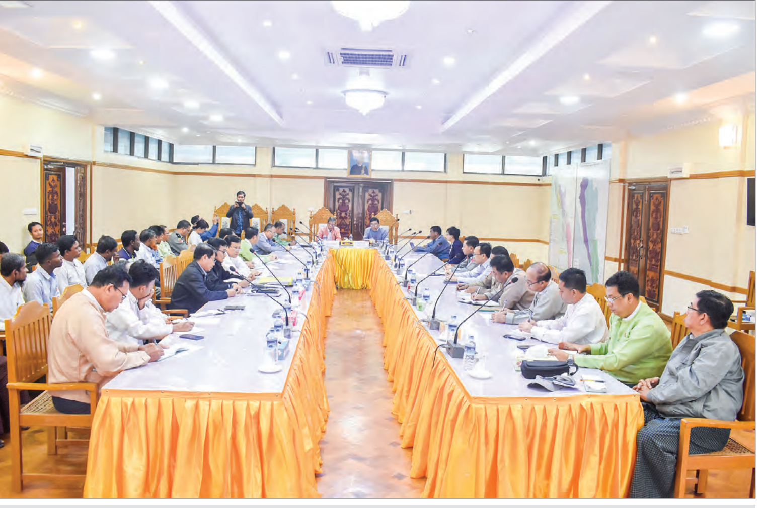
Union Minister Dr Win Myat Aye holds the meeting with Rakhine authorities and communities over implementation of recommendations by ICOE.

In his opening remark, the Union Minister explained the tasks of his office for implementing recommendations of ICOE in the areas of social cohesion; providing necessary assistance in collaboration with international donors to Rakhine, Muslim and other ethnic minorities who were displaced by the 2017 conflict; accelerating its implementation of the 'National Strategy on Resettlement of Internally Displaced Persons (IDPs) and Closure of IDP Camps, resulting in the successful reintegration of the IDP's into society; re-examining the processes involved in the issuance of the National Verification Card (NVC) and its consequences through effective implementation and coordination of the ministries; ensuring equitable access to the delivery of education, health and all other essential services; removing