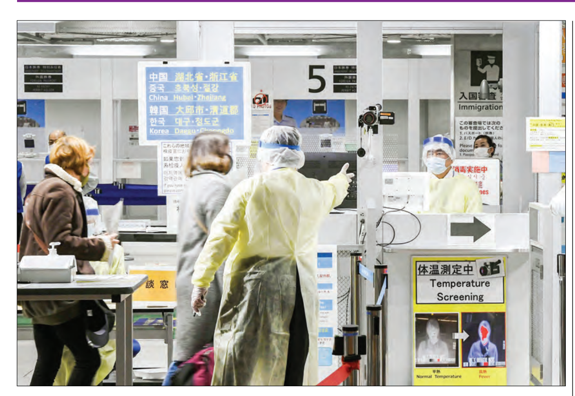
A quarantine officer (foreground) directs passengers arriving from South Korea through quarantine counters at Narita airport on 9 March 2020.