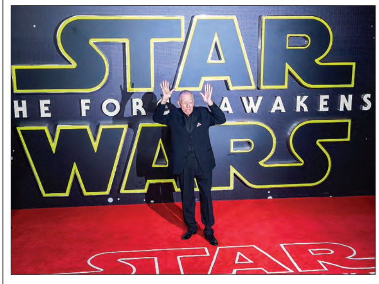
In the file photo, Swedish actor Max von Sydow poses for a photo at the opening of the European Premiere of "Star Wars: The Force Awakens" in central London on 16 December 2015.

The stores allow pre-registered customers to skip the cashier and allow their credit cards to be billed for their purchases, with the technology detecting what they take and return to the shelves. — AFP ■