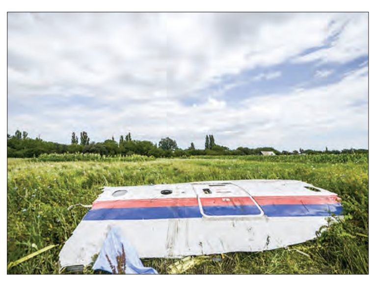
Most passengers on the doomed flight were Dutch.