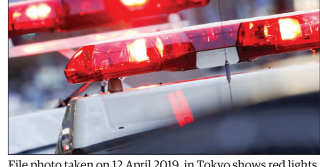
File photo taken on 12 April 2019, in Tokyo shows red lights of police cars.

Yoshiya Tateyama, a 56-year-old Canadian national hailing from Japan's southwestern prefecture