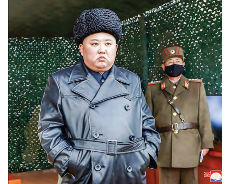
Kim Jong Un oversaw a Korean People's Army 'long-range artillery' drill at an undisclosed location.

Three projectiles fired successfully from a single Transporter Erector Launcher (TEL) would be "a new milestone" for the North's short-range ballistic missile programme, tweeted