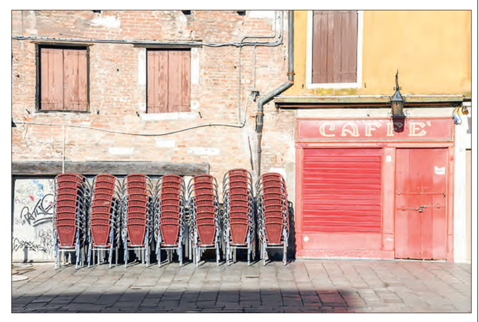
A closed bar in Venice, as large parts of northern Italy go into lockdown to prevent the spread of the virus.

"I have decided to remain at my home in Texas this week, until a full 14 days have passed," he wrote on Facebook, adding he had no symptoms. —AFP ■