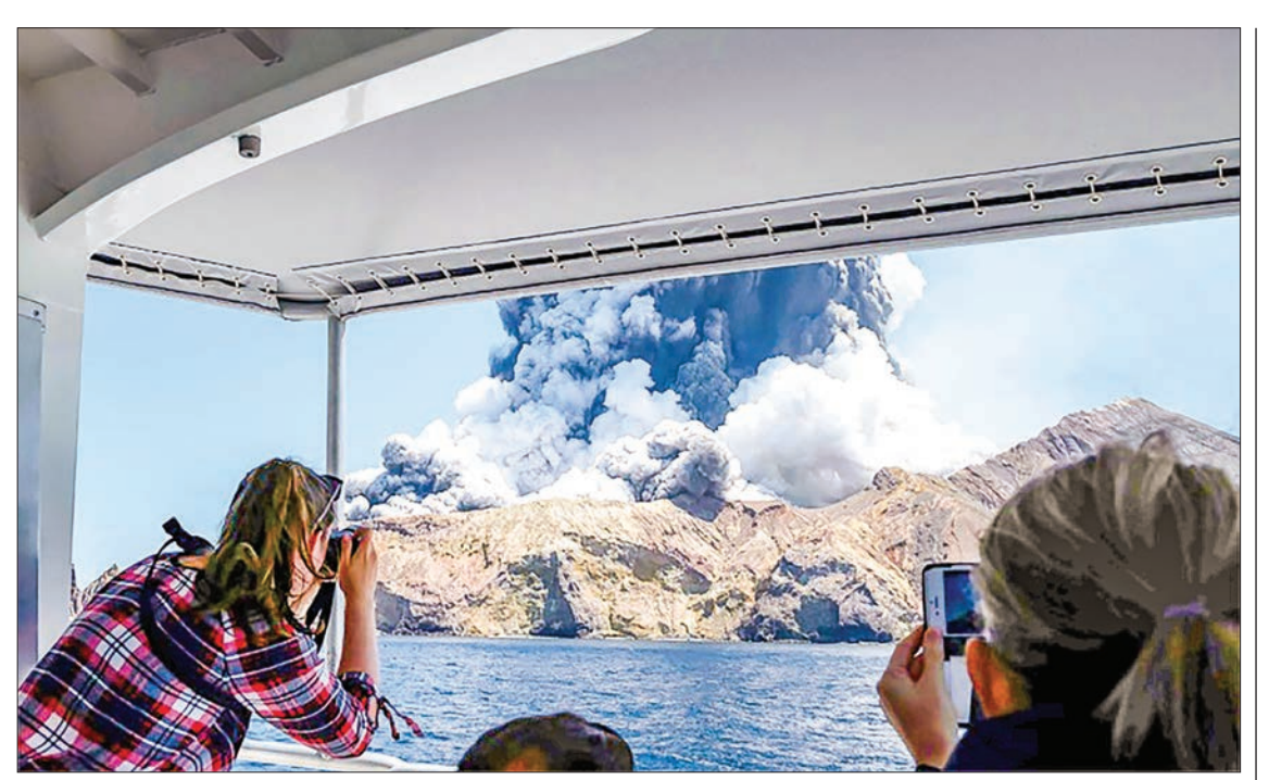
A photo courtesy of Michael Schade shows the volcano on New Zealand's White Island spewing steam and ash moments after it erupted. PHOTO: AFP

WORLD 10 DECEMBER 2019 THE GLOBAL NEW LIGHT OF MYANMAR