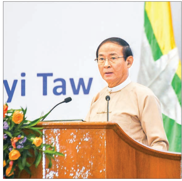
President U Win Myint addresses the event to mark the International Anti-Corruption Day at Myanmar International Convention Centre-II in Nay Pyi Taw yesterday.