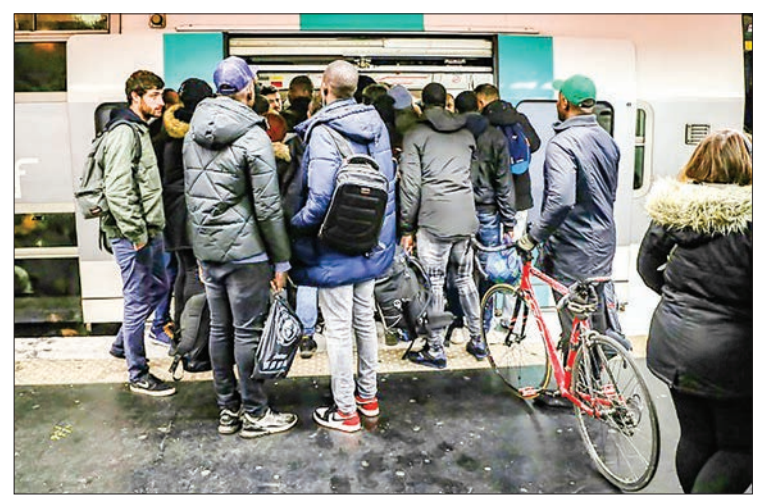
With many having opted to work from home last week and only now returning to the workplace, this week will test public support for the strike.

level, the Sytadin monitoring website said.