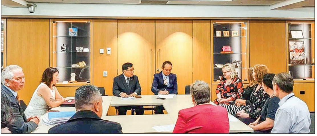
Union Minister Dr Win Myat Aye meets with officials from the Office for Disability Issues under the Ministry of Social Development in Wellington, New Zealand yesterday.

UNION MINISTER for Social Welfare, Relief and Resettlement Dr Win Myat Aye is paying a visit to New Zealand at the invitation of the Ministry of Foreign Affairs and Trade in Wellington.