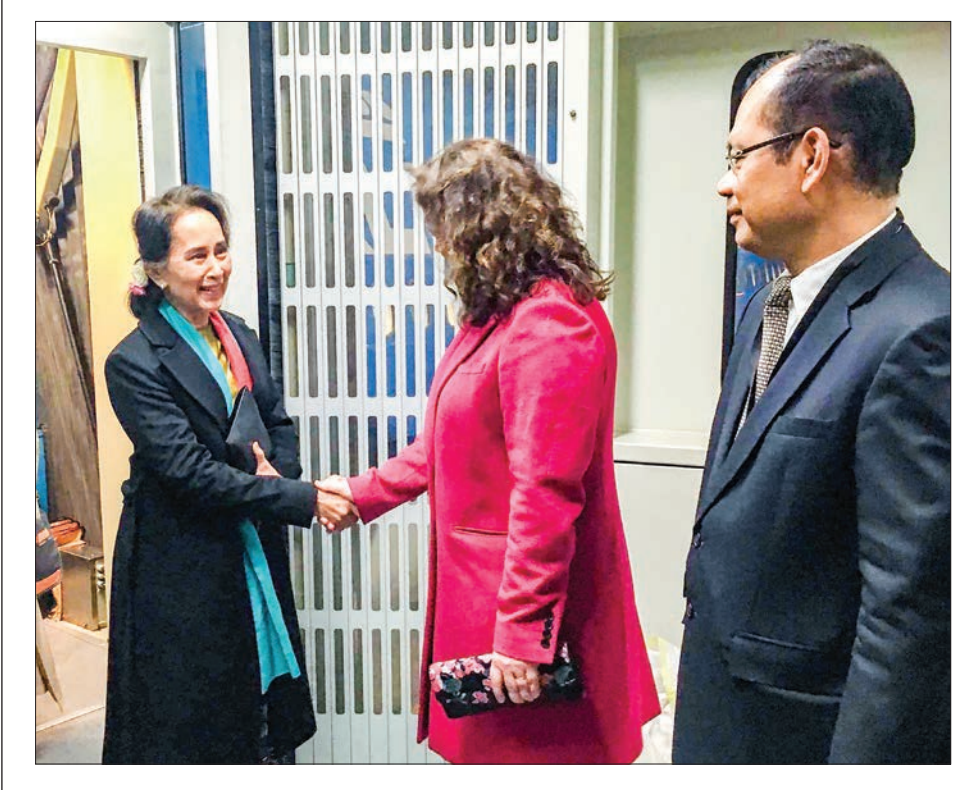
State Counsellor Daw Aung San Suu Kyi is welcomed by Ms Pascalle Grotenhuis, the Director of Protocol Department of the Ministry of Foreign Affairs, at the Schiphol Airport.

THE Myanmar delegation led by the State Counsellor and Union Minister for Foreign Affairs Daw Aung San Suu Kyi left Nay Pyi Taw on 8 December morning for oral proceedings before contesting the case filed by Gambia to the International Court of Justice (ICJ) at The Hague, Netherlands.