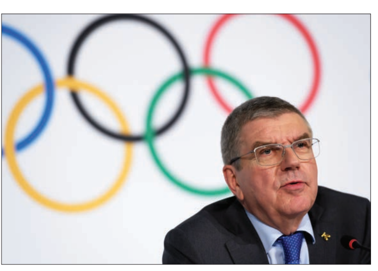
International Olympic Committee (IOC) president Thomas Bach.

LAUSANNE (Switzerland) — The World Anti-Doping Agency on Monday banned Russia for four years from major global sporting events including the 2020 Tokyo Olympics and the 2022 World Cup in Qatar, over manipulated doping data.