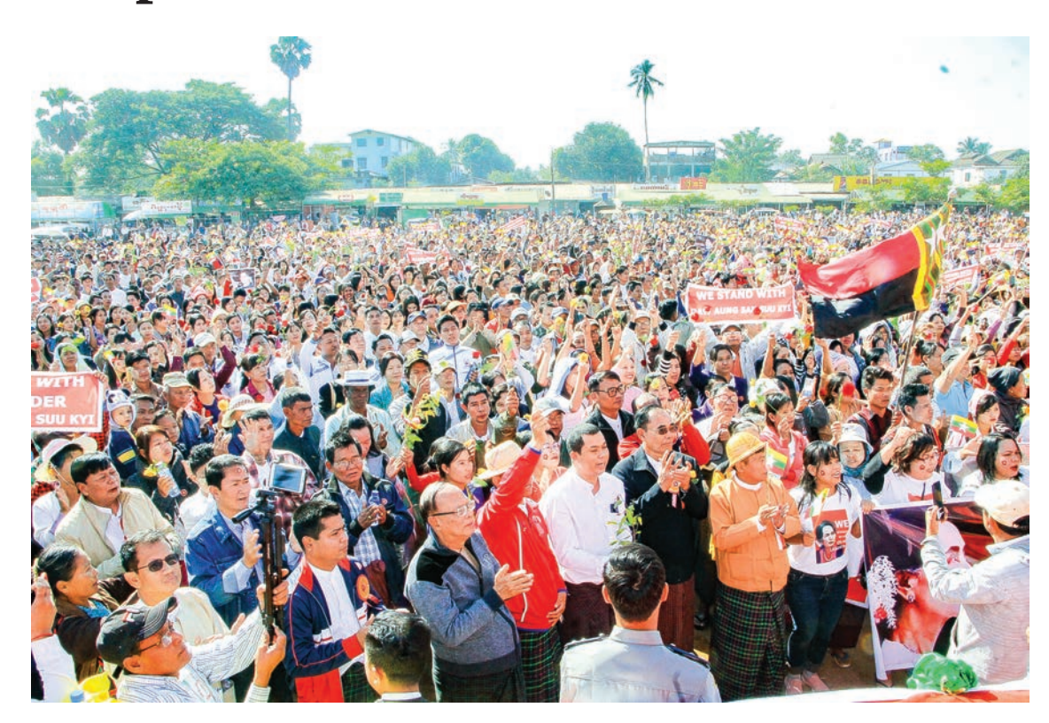
People hold the mass rally in Bago to support State Counsellor Daw Aung San Suu Kyi who will contest the case filed by the Gambia at the International Court of Justice (ICJ).

NaTIONWIDE mass rallies were held yesterday in support of State Counsellor Daw Aung San Suu Kyi who will contest the case filed by the Gambia at the International Court of Justice (ICJ).