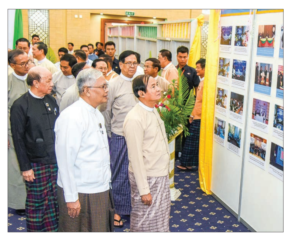
President U Win Myint looks at documentary photos displayed at the event to mark International Anti-Corruption Day in Nay Pyi Taw yesterday.

NAY Pyi Taw celebrated International Anti-Corruption Day at the Myanmar International Convention Centre-II yesterday morning and President U Win Myint delivered a keynote speech.