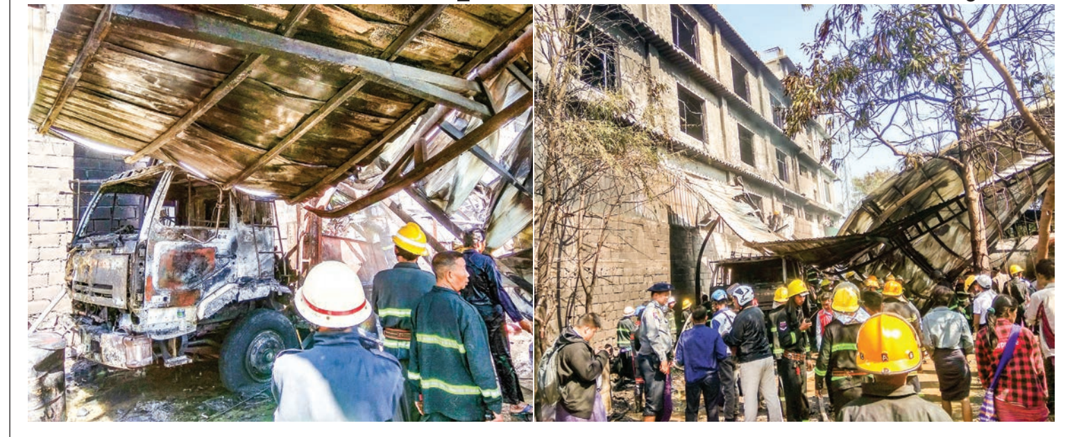
A 12-wheel truck carrying drums with octane fuel exploded while unloading octane fuel at a petrol station on Mandalay-Pyin Oo Lwin Road near Patheingyi Township.

A 12-wheeled truck caught fire while unloading octane fuel yesterday at a petrol station on the Mandalay-Pyin Oo Lwin Road in Thanmataw village-tract of Patheingyi Township. Two persons were injured in the mishap.