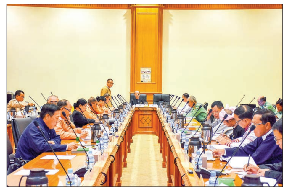
Meeting 66/2019 of Joint Committee on Amending the 2008 Constitution held in Nay Pyi Taw yesterday.

THE Joint Committee on Amending the 2008 Constitution held meeting 66/2019 at the meeting hall of Pyidaungsu Hluttaw Building D in Nay Pyi Taw yesterday.