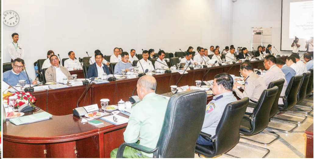
Union Minister for Natural Resources and Environmental Conservation U Ohn Win delivers the speech at the meeting to organize a gems emporium next month in Nay Pyi Taw.