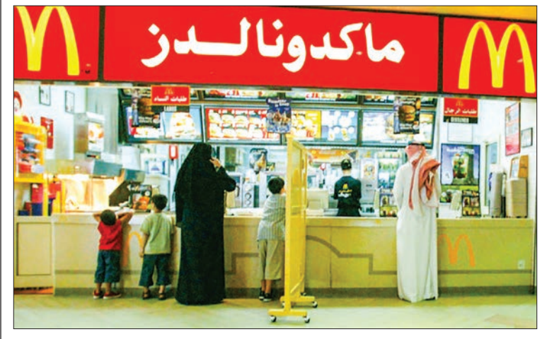
Saudi restaurants have long been segregated into a family section for customers accompanied by women and a singles area for men

Until three years ago, the religious police elicited widespread fear in the kingdom, chasing men and women out of malls to pray and berating anyone seen mingling with the opposite sex.