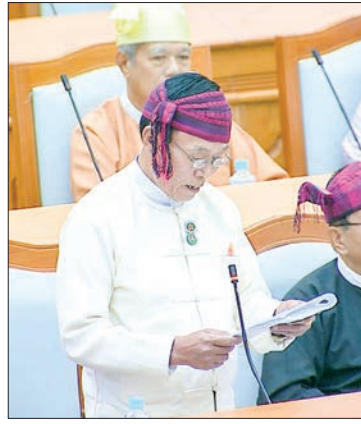
MP U Nan Mon Htin.

THE 13<sup>th</sup> day meeting of the Second Pyidaungsu Hluttaw's 14<sup>th</sup> regular session was held at the Pyidaungsu Hluttaw meeting hall yesterday morning.