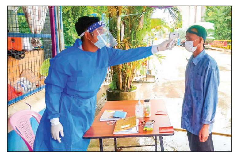
A returnee from China undergoes medical test at Chinshwehaw border crossing on 10 August.