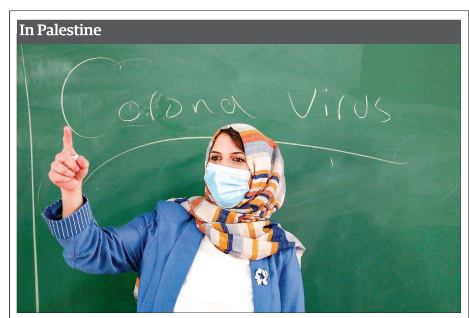
A Palestinian teacher addresses high school students as they return to class for the new academic year while implementing protective measures amid the COVID-19 pandemic in the West Bank city of Hebron, on 10 August 2020, after the disruption of studies since March due to the virus.