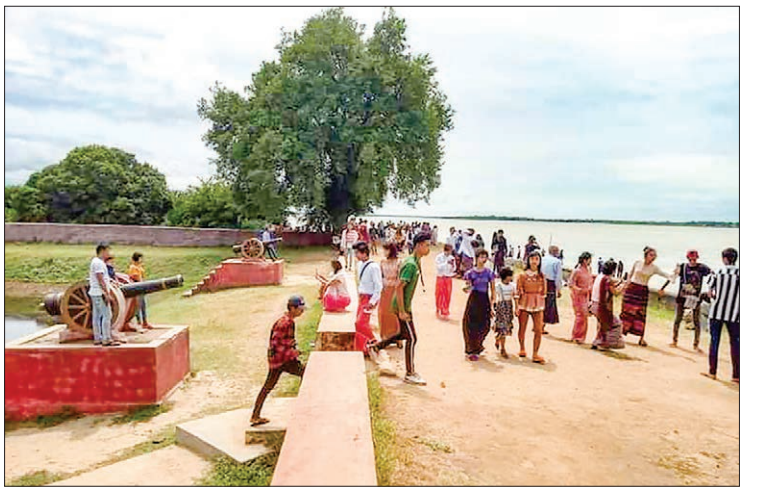
Hsin Kyone Fort at ancient city of Innwa is a viewpoint for natural beauty of Ayeyawady River.

one Fort which is a viewpoint to enjoy the natural beauty of the Ayeyawady River.