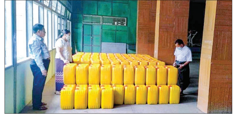
Emergency palm oil is stockpiled in Natogyi to prevent shortage of the food for the public.

A TOTAL of 1,436 tonnes for the state oil reserve are to be stored in the warehouses of Mandalay, according to the regional Department of Consumer Affairs.