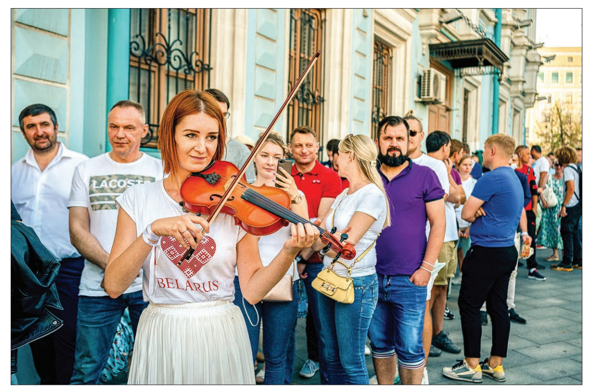
A woman plays the violin while queuing outside the Belarusian embassy to cast her vote in the presidential election in Moscow on 9 August 2020.

A separate EU statement declared that "election night was marred with disproportionate and unacceptable state violence