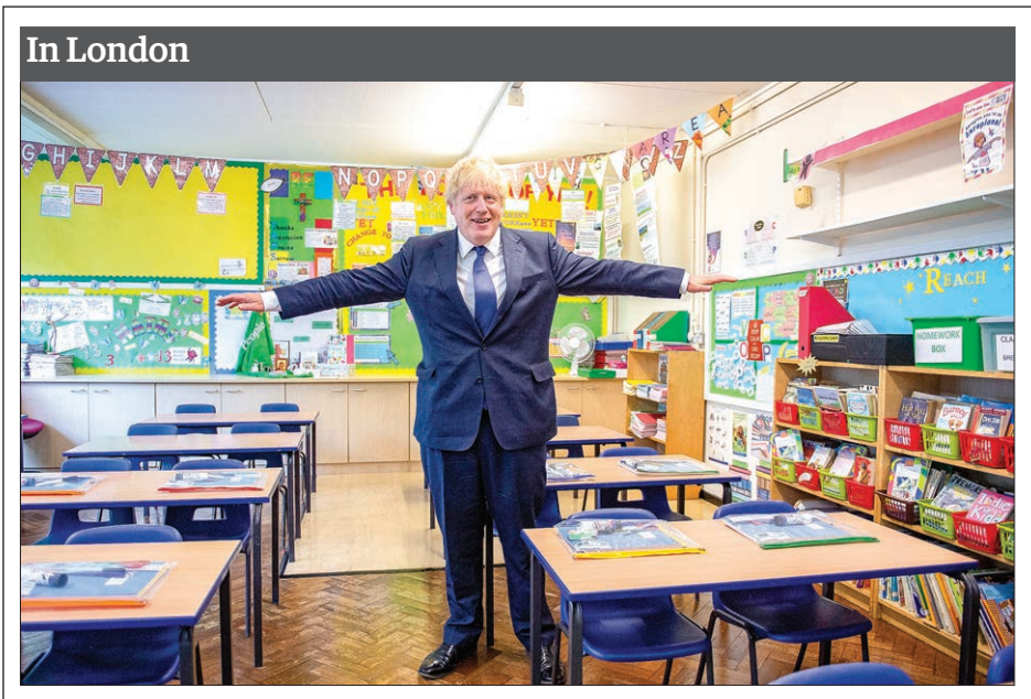
Britain's Prime Minister Boris Johnson poses with his arms out-stretched in a classroom as he visits St Joseph's Catholic Primary School in Upminster, east London, on 10 August 2020 to see preparedness plans implemented ahead of the start of the new school year as a response to the novel coronavirus pandemic.