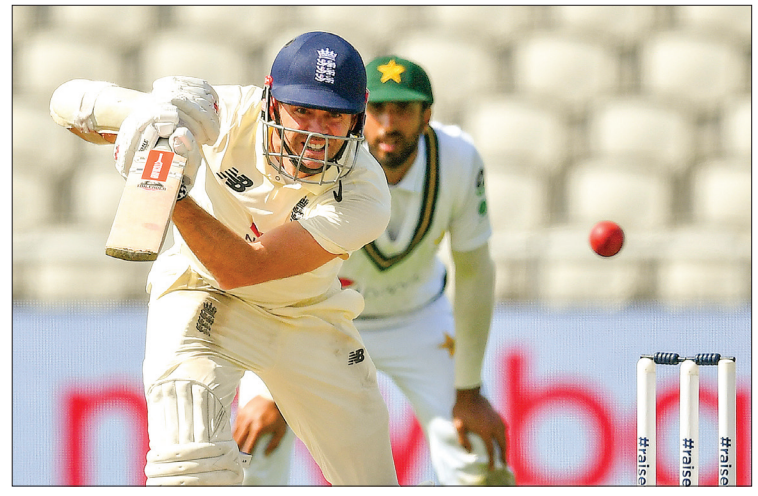
England's James Anderson plays a shot on the third day of the first Test cricket match between England and Pakistan at Old Trafford in Manchester, north-west England on 7 August 2020.

Asked in another multiple-answer question about what they are working on in the leadup to volunteering at the games, 57.6 per cent said physical fitness, while 57.2 percent cited learning English and other foreign languages.— Kyodo News ■