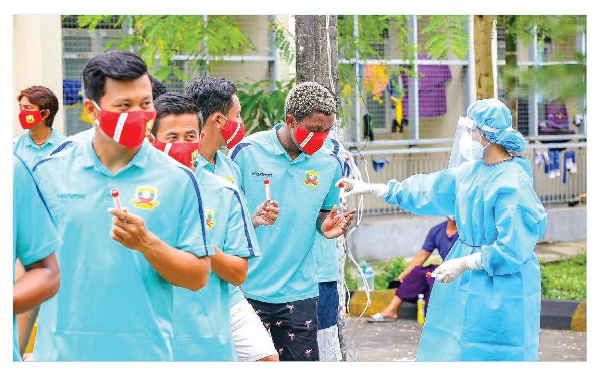
Officials from Ministry of Health and Sports inspect MNL camp quarantine centres in Yangon on 10 August 2020.