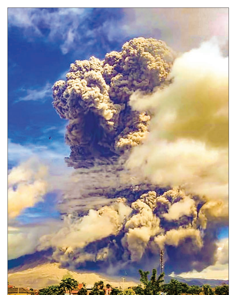
This handout photo taken and released on 10 August 2020 from Indonesia's Centre for Investigation and Technology Development of Geological Disaster (BPPTKG) shows Mount Sinabung as it spews thick ash and smoke into the sky in Karo, North Sumatra.

The palace tweeted that Ghani signed the decree late Monday evening for pardon of punishment of convicted Taliban prisoners, who are included in the 5,000 prisoners listed by the Taliban group. – Xinhua