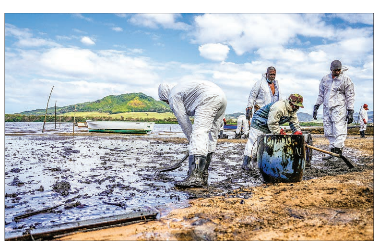
People scoop leaked oil from the vessel MV Wakashio, belonging to a Japanese company but Panamanian-flagged, that ran aground and caused oil leakage near Blue bay Marine Park in southeast Mauritius on 9 August 2020.

Fuel was being airlifted Monday by helicopter to the shore, but efforts to pump more from the hold were being thwarted by rough seas and strong winds.