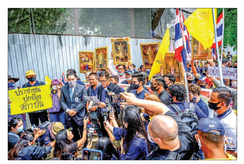
Demonstrators hold portraits of the Thai royal family during a progovernment and pro-monarchy rally demanding the protection of the monarchy outside the Parliament building in Bangkok on 10 August 2020.

Earlier Monday, a group of royalist supporters marched to parliament to counter a pro-democracy rally where protesters were burning models of army tanks and the constitution. —AFP