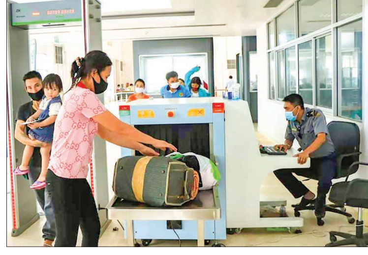
Returnees from Thailand pass border checkpoints at No.2 Myawady border bridge on 10 August.