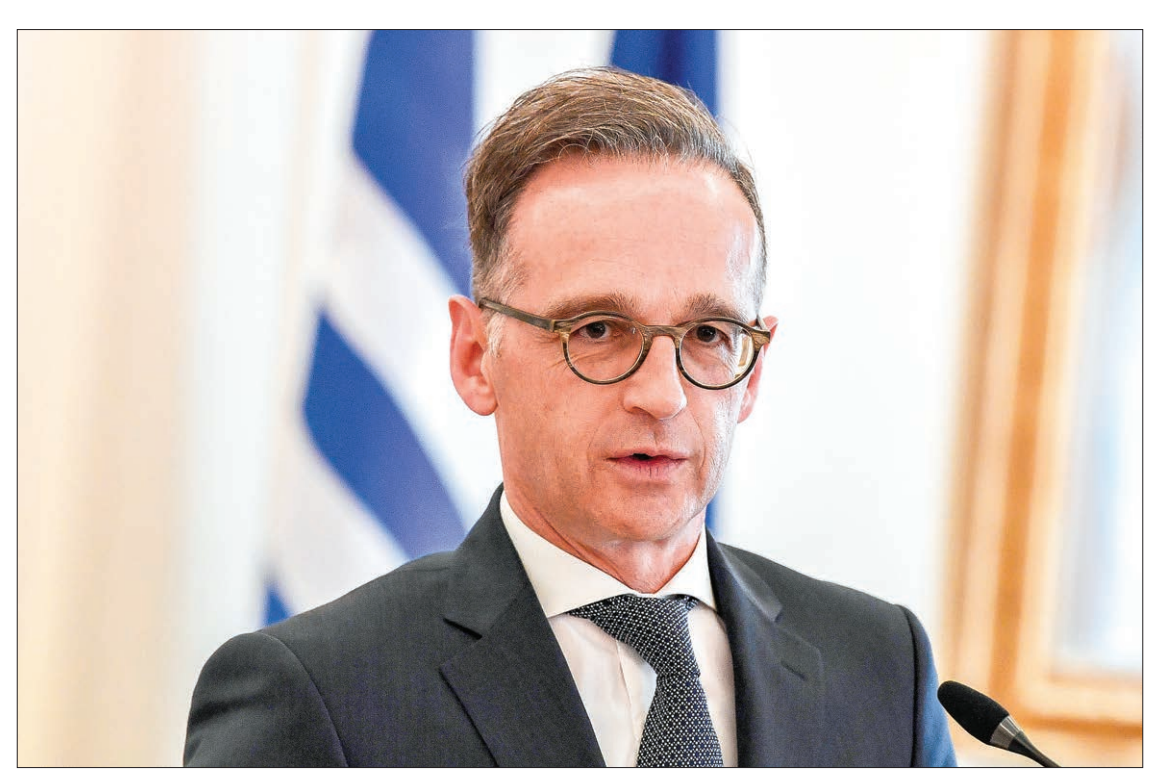
German Foreign Minister Heiko Maas is seen at a press conference on 21 July 2020.

BERLIN (Germany) — German Foreign Minister Heiko Maas said Monday he had expressed "displeasure" to his US counterpart Mike Pompeo about Washington's threat of sanctions against a German port over a gas pipeline from Russia.