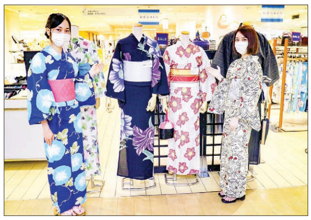
department store in Tokyo, as pictured on 21 July 2020.

stores to push the traditional Japanese outfits as a way to make a virtual fashion statement. The Matsuya department store in the upscale Ginza shopping district is now selling