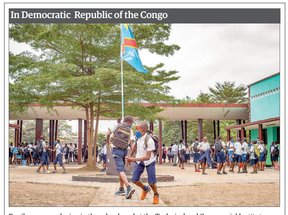
Pupils are seen playing in the school yard at the Technical and Commercial Institute (ITC), in Kinshasa on 10 August 2020, upon the resumption of classes after the COVID-19 coronavirus lockdown.