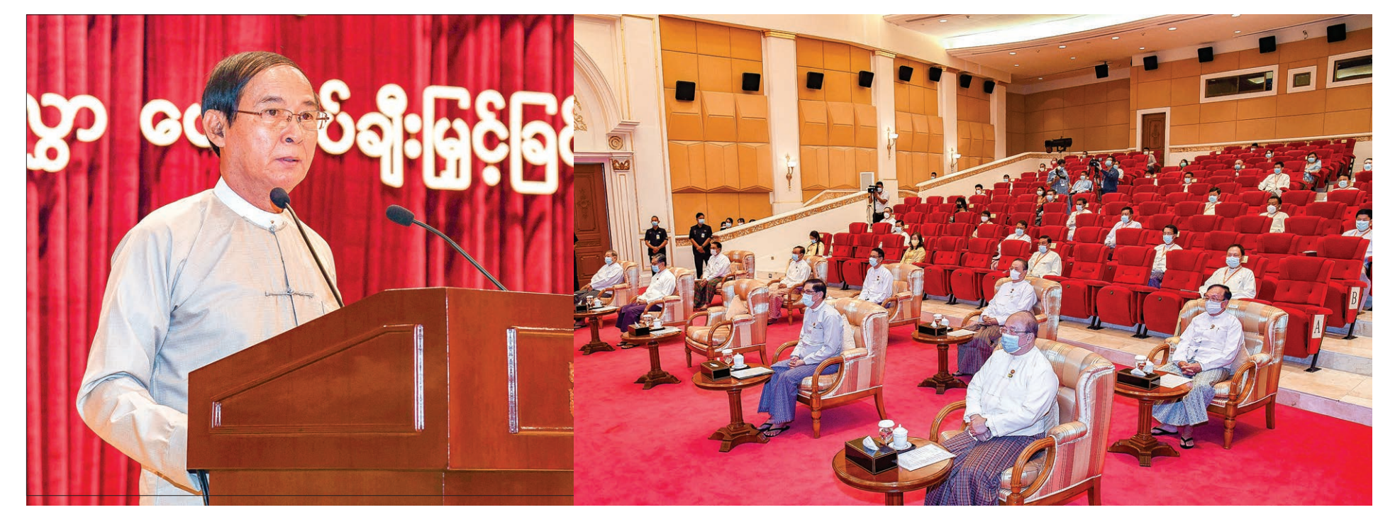
President U Win Myint speaks during the ceremony to honour taxpayers at the Presidential Palace in Nay Pyi Taw on 10 August 2020.

OVERNMENT honoured the top taxpayers of the country for 2018-2019 tax year yesterday.