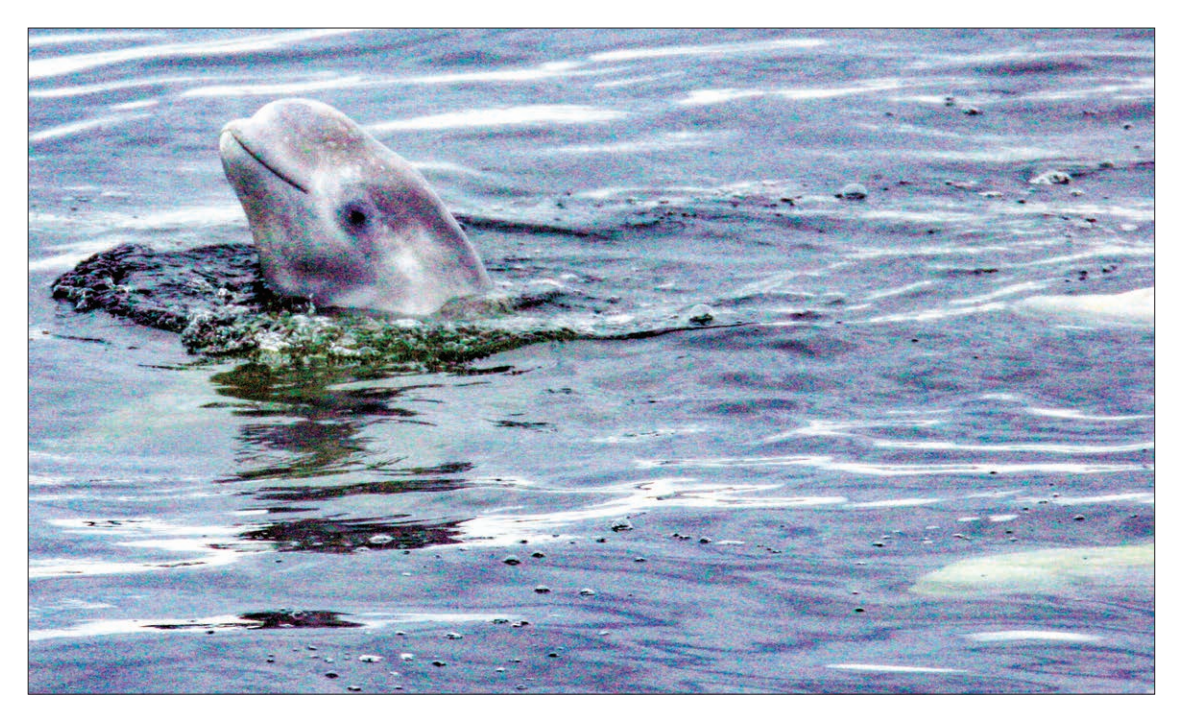
A young beluga whale pokes its melon-shaped head out of the waters of the White Sea near the Actic Circle off of the Solovetsky Islands on 10 July 2008.

They will stay in the care pools "for a few weeks" before they are released into the bigger sanctuary, a 32,000-square-metre (344,445-square-foot) seapen that will become their home, organizers said.