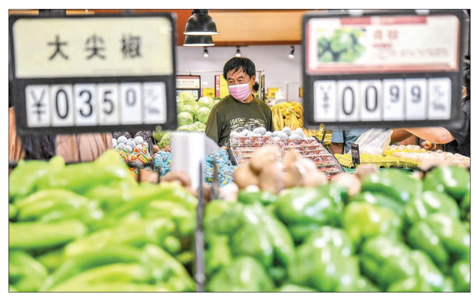
A customer buys vegetables at a supermarket in Handan in China's northern Hebei province on 10 August 2020. China's consumer inflation edged up in July, official data showed on August 10, partly because of rising food prices from flood-related disruptions and as the country recovers from the coronavirus outbreak.

na economist Lu Ting told AFP he expects the CPI "to resume its downtrend soon in coming months", with the temporary disruptions fading.