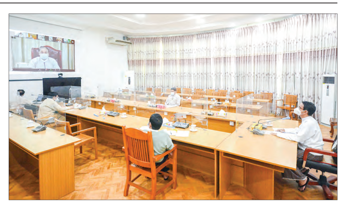
Union Minister for Agriculture, Livestock and Irrigation Dr Aung Thu (R) participates in the virtual meeting on production of monsoon paddy on 12 October 2020.

This year's monsoon, it was planned to grow a total of 15.1