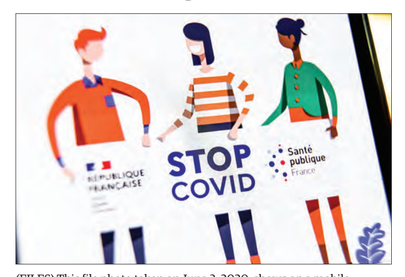
(FILES) This file photo taken on June 3, 2020, shows on a mobile phone the tracking application StopCovid developed by the French government in an attempt to contain the spread of COVID-19 as France eases lockdown measures taken to fight against the novel coronavirus.

PARIS (France) — French authorities could be forced to impose new lockdowns in a bid to contain another surge in coronavirus cases that is putting a strain on hospitals, Prime Minister Jean Castex warned Monday.