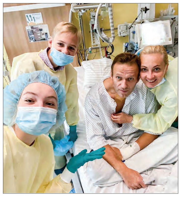
This handout picture posted on 15 September 2020 on the Instagram account of @navalny shows Russian opposition leader Alexei Navalny posing for a selfie picture with his family at Berlin's Charite hospital.

In their formal conclusions on Belarus, the ministers said