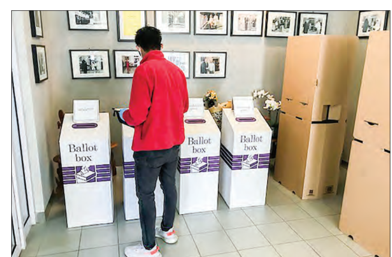
A Myanmar national casts advance ballot at the Myanmar Embassy in Canberra on 12 October 2020.