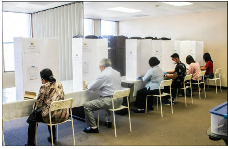
Myanmar citizens cast advance votes in Los Angeles on 12 October

Therefore, there were a total of 4,093 advance voters on 12 October, and 773 on 11 October.-MNA