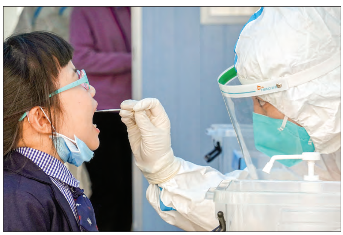
A health worker takes a swab from a resident to be tested for the COVID-19 coronavirus in Yantai, in China's eastern Shandong province on October 12, 2020, following a new outbreak of the coronavirus in the nearby city of Qingdao.

Six cases of Covid-19 were confirmed on Sunday in Qingdao — a northeastern port city of 9.4 million — prompting health officials to announce China's first mass testing in months.