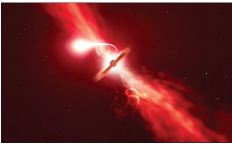
This handout picture released by The European southern Observatory on October 12, 2020, shows an illustration depicting a star (in the foreground) experiencing spaghettification as it's sucked in by a supermassive black hole (in the background) during a "tidal disruption event".

"When these forces exceed the star's cohesive force, the star loses pieces that rush into the black hole," Stephane Basa, a researcher from the Marseille