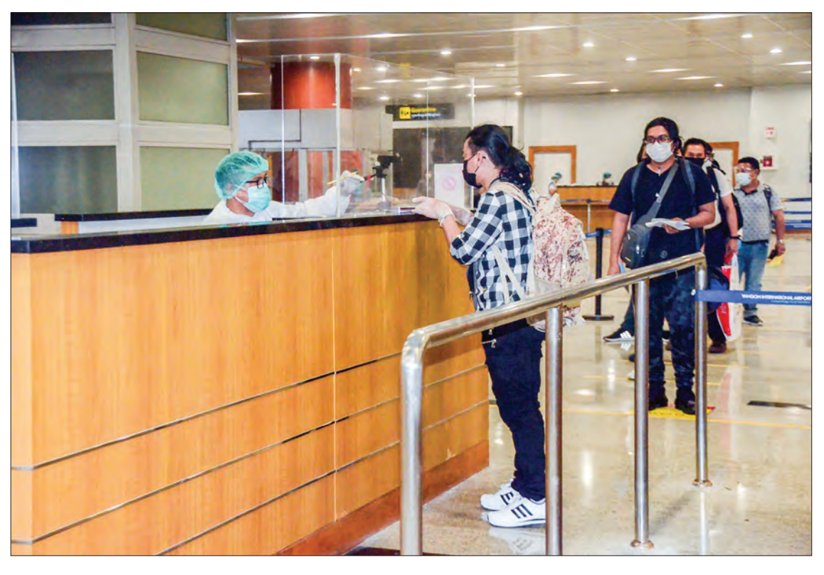
Myanmar returnees from foreign countries queue for immigration services at the Yangon International Airport on 12 October 2020.

chines, transportation of them and skilled workers will be needed in the period. The meeting is also intended to make necessary discussions to respond to those challenges and to overcome the possible impacts on paddy prices, which can pose difficulties for farmers.—MNA (Translated by Maung Maung Swe)