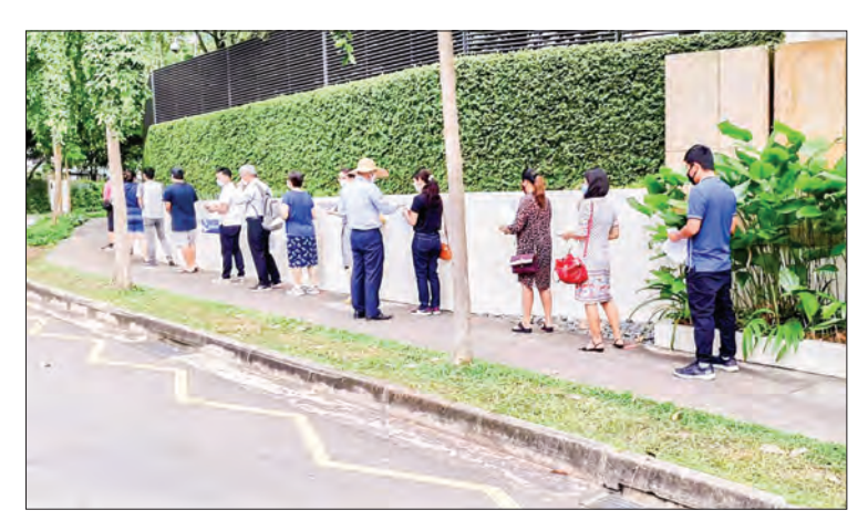
Myanmar nationals line up outside the Myanmar Embassy in Singapore on 12 October 2020 to cast advance votes.