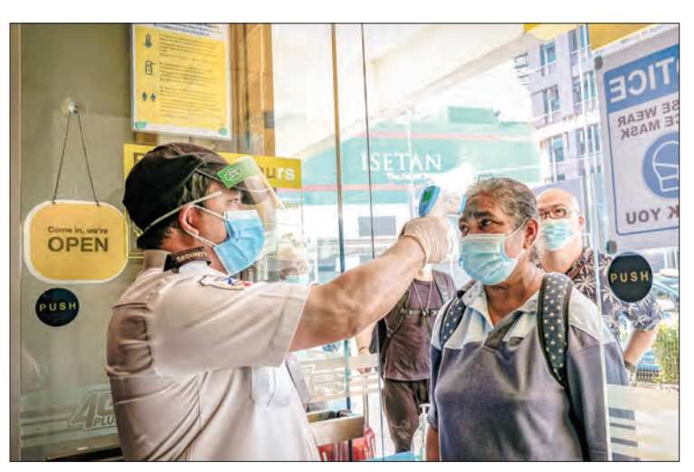
Visitors have their temperatures checked at the entrance of a store in Kuala Lumpur on 4 May 2020.

Defence Minister Ismail Sabri Yaacob said in a statement that following advice from the health ministry, a "conditional movement control order" will be imposed for two weeks from