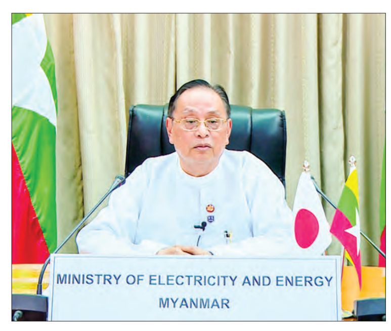
Union Minister U Win Khaing joins 9<sup>th</sup> LNG Producer, Consumer Conference online on 12 October 2020.

UNION Minister for Electricity and Energy U Win Khaing participated in the 9th LNG Pro-