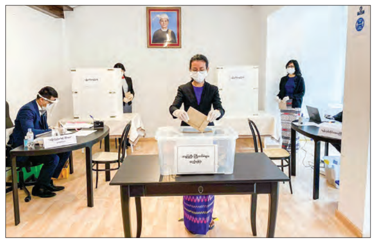
Myanmar nationals cast advance ballots at the Myanmar Embassy in Berlin on 12 October 2020.