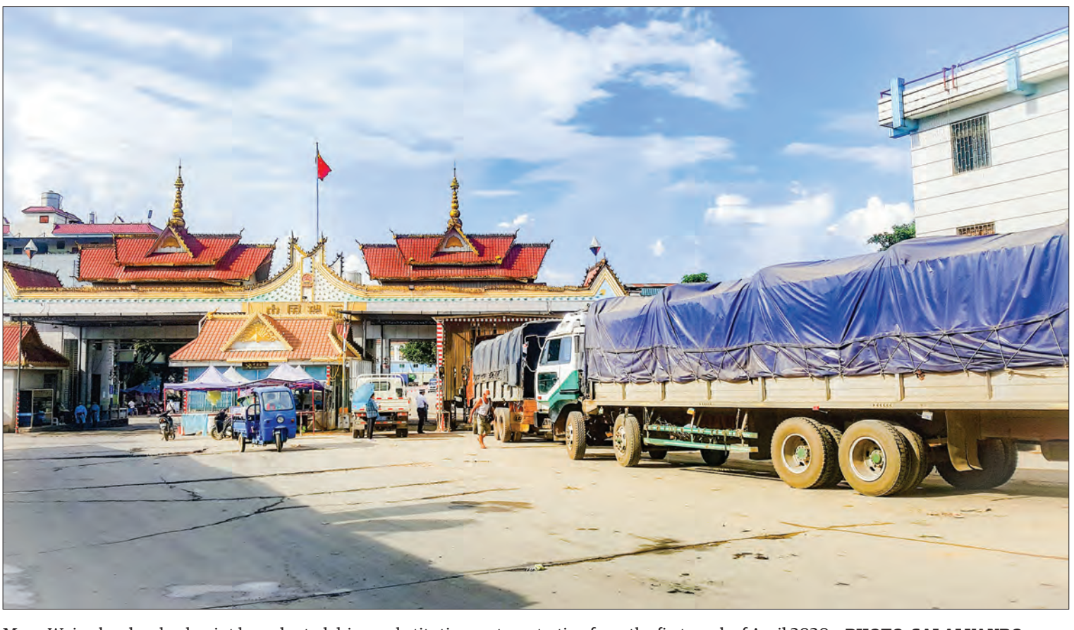
Mang Weing border checkpoint has adopted driver substitution system starting from the first week of April 2020.

As China has been stepping up border control measures to contain the spread of the COVID-19, the driver substitution policy has been exercised on Muse, Mang Weing and Kyalgaung border route.