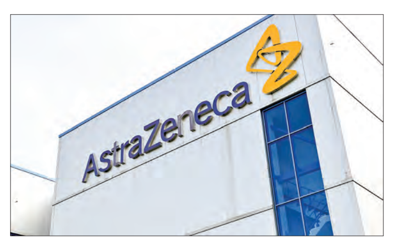
A general view is pictured of the offices of British-Swedish multinational pharmaceutical and biopharmaceutical company AstraZeneca PLC in Macclesfield, Cheshire on 21 July 2020.

LONDON (United Kingdom) — UK pharmaceuticals group AstraZeneca said on Monday it will advance trials of a Covid-19 treatment to a crucial third stage, after the United States invested $486 million (411 million euros) in its development.