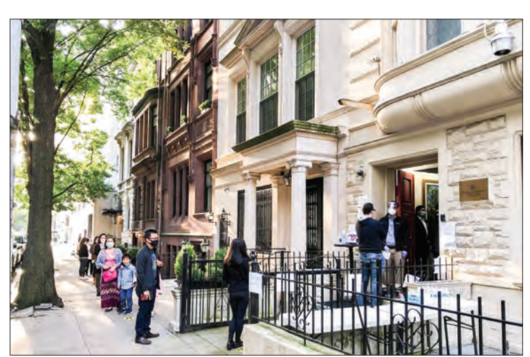
A total of 155 Myanmar citizens cast advance votes in New York on 12 October 2020.