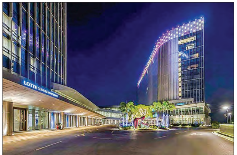
Myanmar has attracted over US$25 billion of foreign direct investments during the incumbent government.

jects in the 2018 mini-budget year, $4.5 billion from 298 enterprises in the FY2018-2019 and $5.689 billion from 253 businesses in the FY2019-2020 respectively, the DICA's data indicated. The FDIs flow into the 12