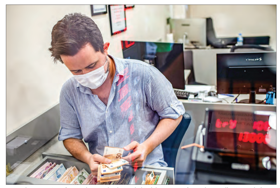
An employee wearing a face mask counts banknotes behind the counter of an exchange office in Istanbul on July 29, 2020.

Drew said there were several caveats including that the study was conducted with fixed levels of virus that likely represented the peak of a typical