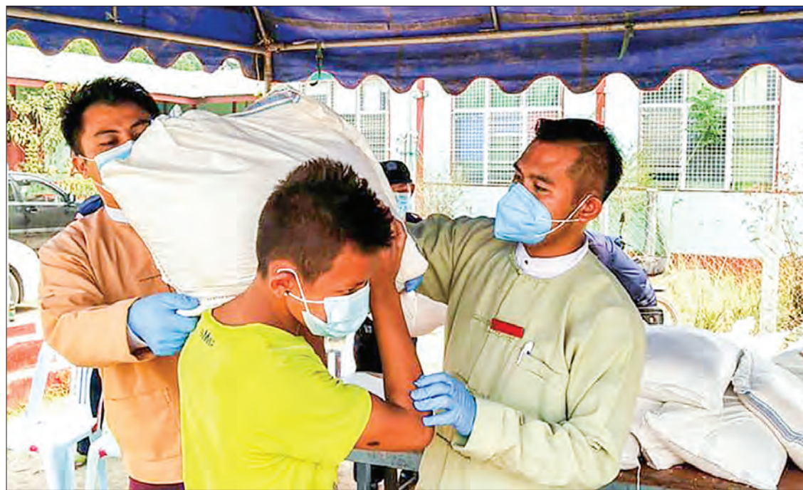
Officials offering the essential foodstuff to a local people in Myawady Township.