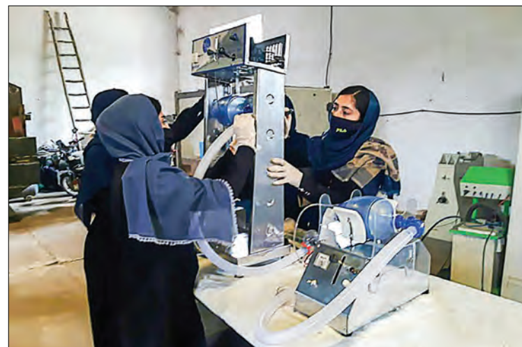
If the teenagers succeed and can get government approval for their prototype, they say it could be replicated for as little as $300, where normally ventilators sell for around $30,000.

The girls' prototype uses a mechanical system to operate the bag automatically and accurately. — AFP ■