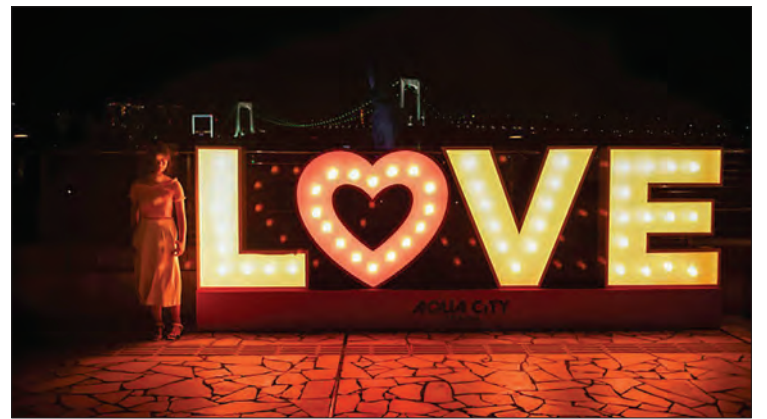
The man reportedly told magistrates that he first flouted the law to get food but hours later broke quarantine again because he missed his girlfriend.