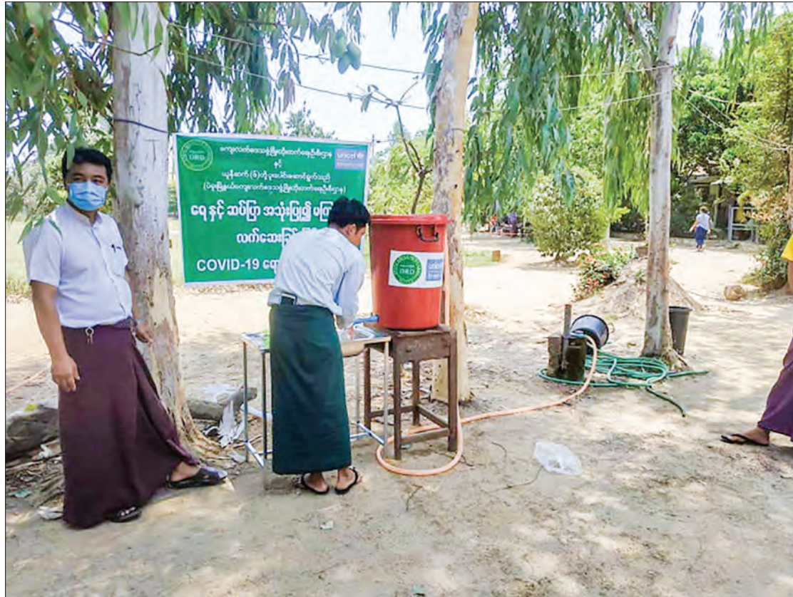
People washing hands to prevent spread of COVID-19 virus.

We appreciate your feedback and contributions. If you have any comments or would like to submit editorials, analyses or reports please email ce@globalnewlightofmyanmar.com with your name and title. Due to limitation of space we are only able to publish "Letter to the Editor" that do not exceed 500 words. Should you submit a text longer than 500 words please be aware that your letter will be edited.