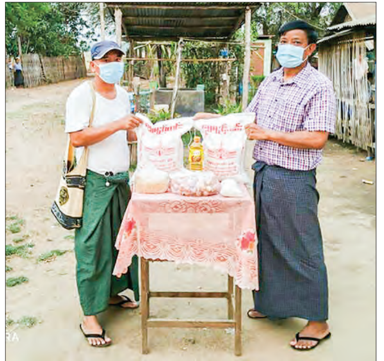
A local man accepts food aid from an official of Tatkon Township.