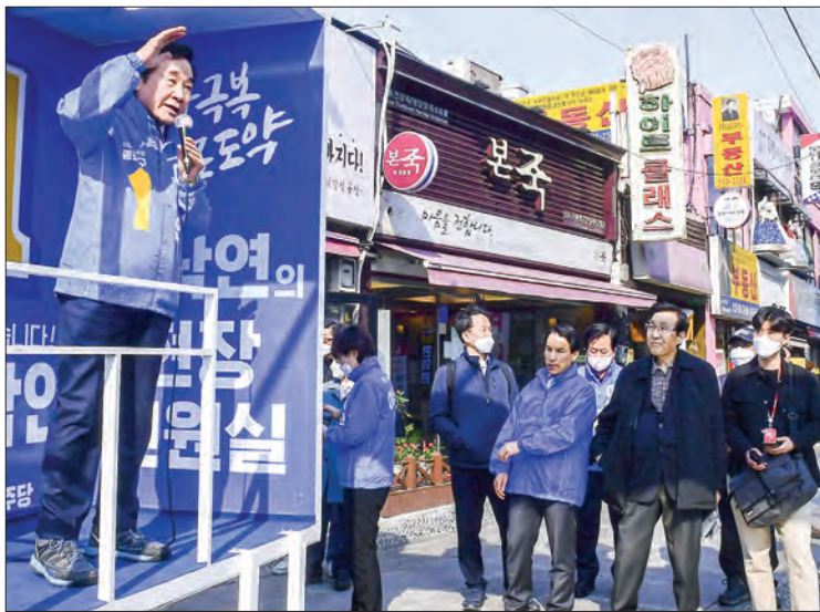
Former South Korean Prime Minister Lee Nak Yeon of the ruling Democratic Party makes a speech in Seoul on 2 April, 2020, as official campaigning for the 15 April general election starts the same day amid the spread of the new coronavirus.

SEOUL — South Korean voters headed to polls on Wednesday morning to elect a new parliament, in what is seen as a mid-term evaluation of President Moon Jae In's administration amid the ongoing fight against the novel coronavirus.