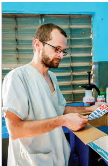
Supplied file photo shows a nurse holding Avigan, an anti-influenza medication.

Fujifilm had been asked by the Japanese government to increase the output of Avigan in the wake of the spread of the virus. The government said earlier this month it aims to triple the national stockpile of Avigan to secure enough to treat 2 million