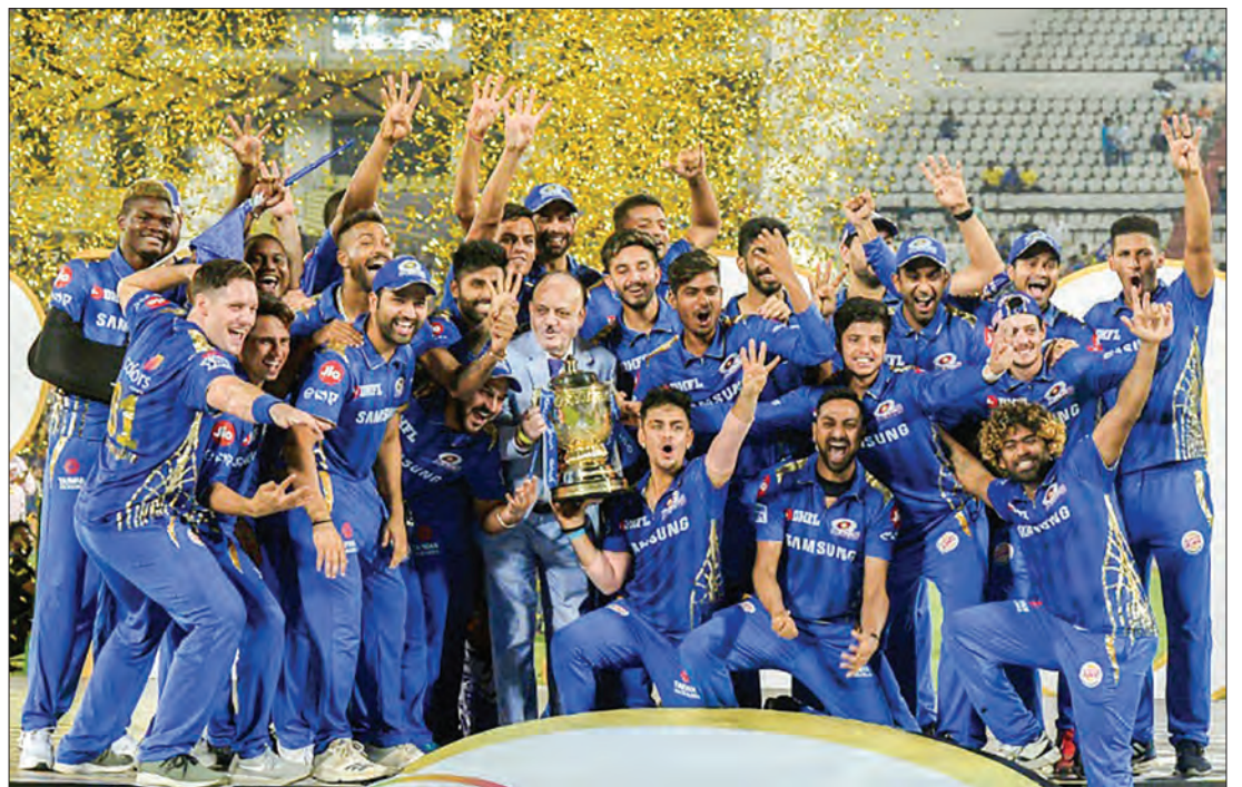
The Mumbai Indians won last year's IPL.

NEW DELHI (India) — India's cricket board remains optimistic about playing the lucrative IPL later this year, a team official told AFP Wednesday, as an extended national lockdown left the competition in limbo.