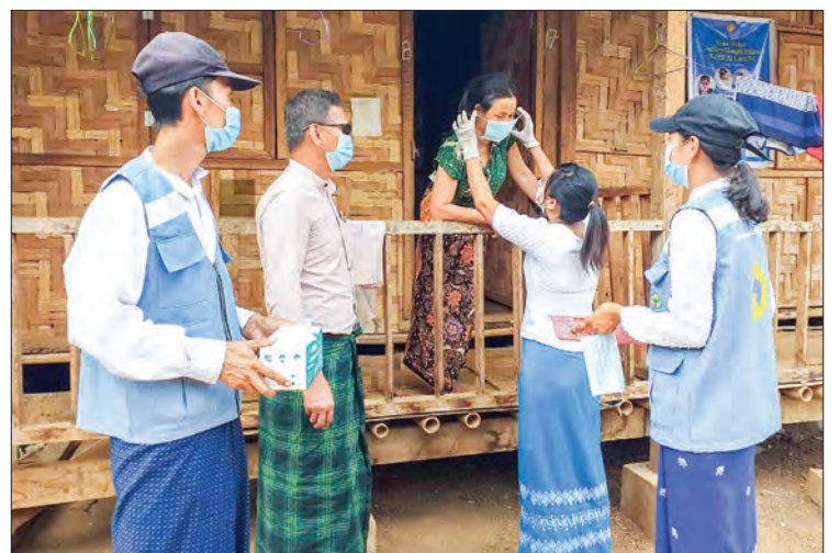
Officials giving face masks to people at the IDP camp in Namtu.