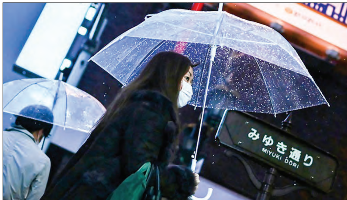
Officials in Japan's second biggest city have appealed for donations of raincoats for health workers to use as emergency personal protective gear when dealing with coronavirus patients.

"We fear that patients suffering from heart attacks, strokes, or multiple injuries might lose precious time in being treated," the statement said. — AFP ■