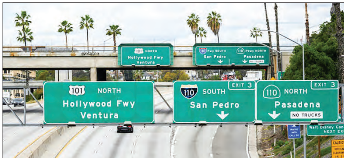
Across California there have been over 25,500 cases, including at least 783 deaths, according to a count from Johns Hopkins University.

In California cases continue to peak — Los Angeles suffered a record 40 deaths in 24 hours on Tuesday. But the situation overall remains far less dire than New York, a city roughly twice the size, where around 800 died in the same period.—AFP ■