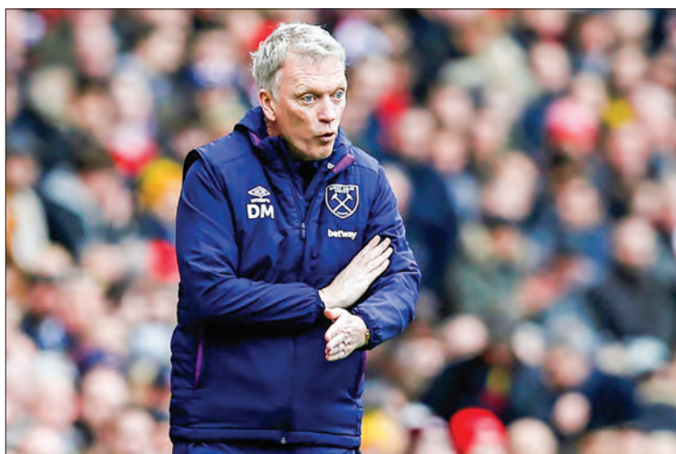
Injury concern - West Ham manager David Moyes. PHOTO: AFP

West Ham are only above the relegation zone on goal difference but Moyes, in his second spell in charge of the east London club, was optimistic about their long-term prospects.—AFP