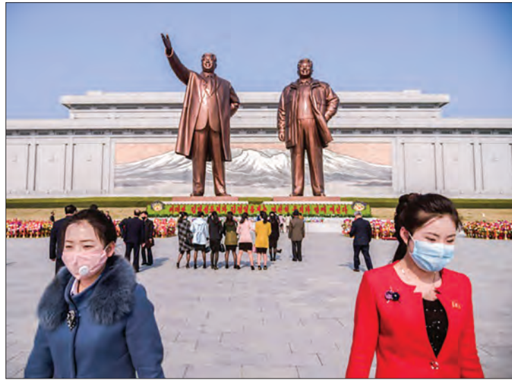
Pyongyang residents pay their respects at the giant bronze statues of Kim Il Sung and his son and successor Kim Jong Il.

Pyongyang residents arrived at Mansu hill, where giant bronze statues of Kim and his son and successor Kim Jong Il