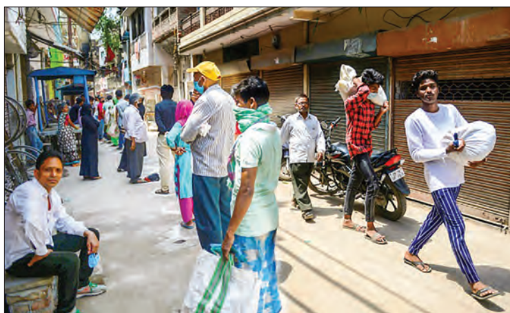
People wait in line to collect free rations from a government store during India's nationwide lockdown.

Refineries, coal production and some construction will also be permitted. —AFP ■