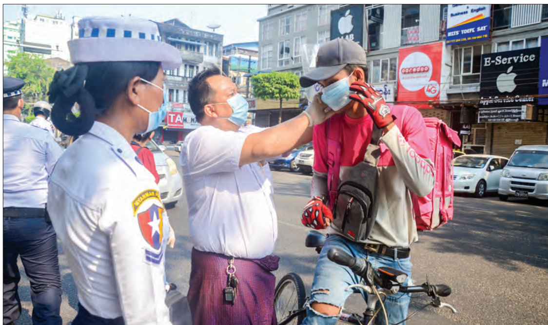
An official help a biker to wear a face mask to combat COVID-19 in Yangon.