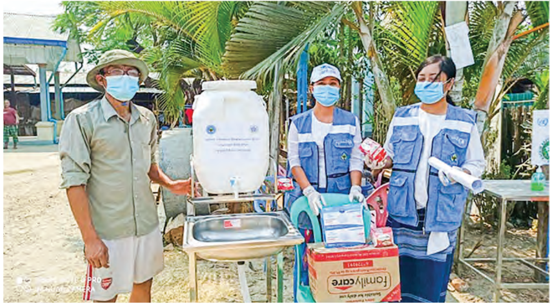
Officials from Kachin State Disaster Management Department raise COVID-19 awareness and distribute soap and masks in an IDP camp in Myitkyina on 15 April 2020.