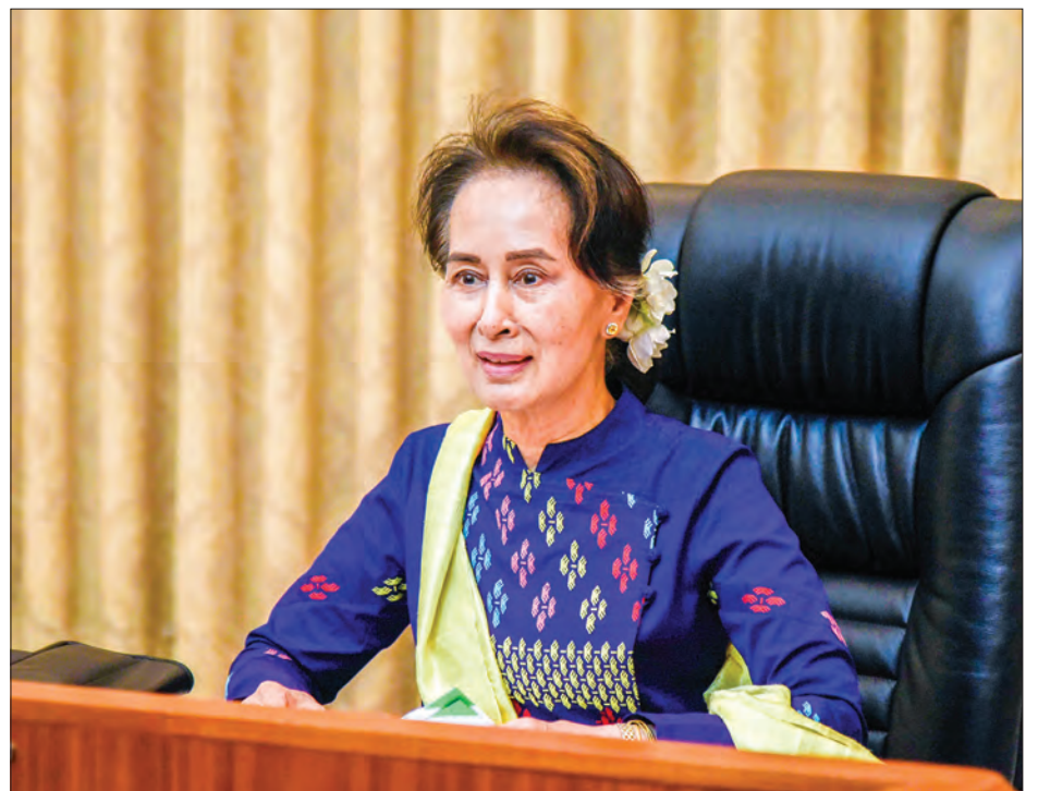
State Counsellor Daw Aung San Suu Kyi holds the video conference with healthcare personnel working to prevent, control and treat Coronavirus Disease 2019 (COVID-19) in Mon State.

“ PEOPLE are the key in the struggle against COVID-19”, said State Counsellor Daw Aung San Suu Kyi, in her capacity as Chairperson of the National Central Committee for COVID-19 Prevention, Control and Treatment, in her video conference call from the Presidential Palace in Nay Pyi Taw with the persons battling on the frontlines against the pandemic in Mon State yesterday.