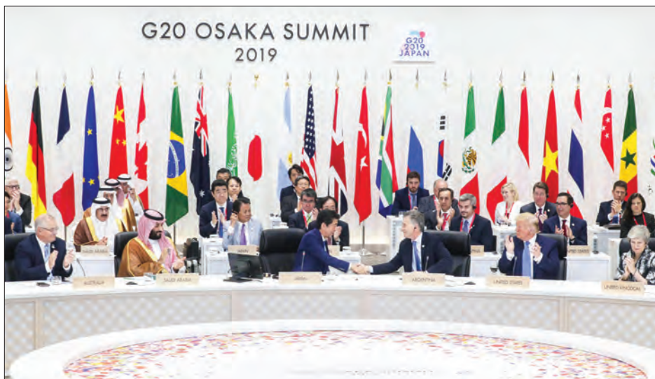
FILE: Group of 20 leaders meet in Osaka in June 2019.

The composition of total public debt in developing countries has been shifting from "Paris Club" countries — traditional sources such as the G-7 nations — toward nontraditional lenders including China. The total of the 59 lowest-income countries' outstanding obligations to China, against the sum of their gross domestic product, was 11.6 per cent in 2016, about four times as much as that owed to Paris Club nations, according to an IMF report in 2018.—Kyodo News ■