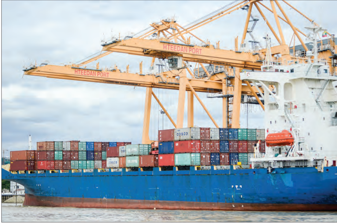
A cargo ship docks at the jetty in Yangon River..

MYANMAR'S external trade between 1 October and 4 April in the 2019-2020 financial year was registered at US$20.33 billion, an increase of $2.6 billion compared with the corresponding period of the 2018-2019FY, according to the Ministry of Commerce.