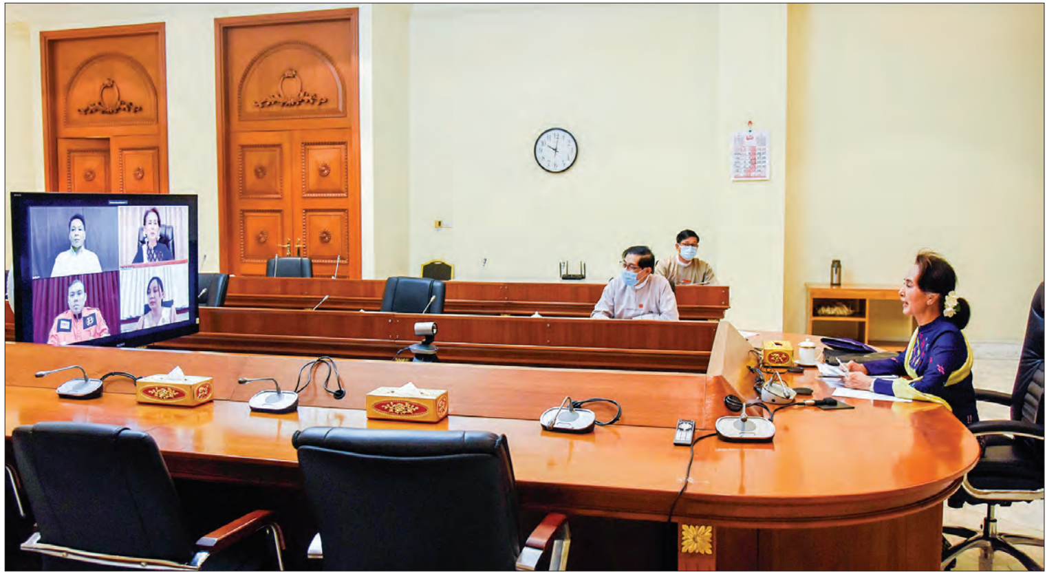
State Counsellor Daw Aung San Suu Kyi holds the video conference with healthcare personnel working to prevent, control and treat Coronavirus Disease 2019 (COVID-19) in Mon State.

The State Counsellor reiterated the importance of hand washing frequently, wearing face masks, getting official news on the disease and pivotal role of the people to prevent the disease