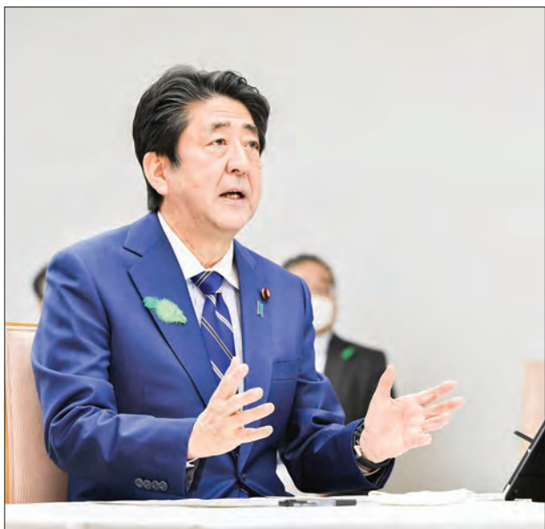
Japanese Prime Minister Shinzo Abe speaks during a teleconference.

As a key pillar of the economic package approved by the Cabinet last