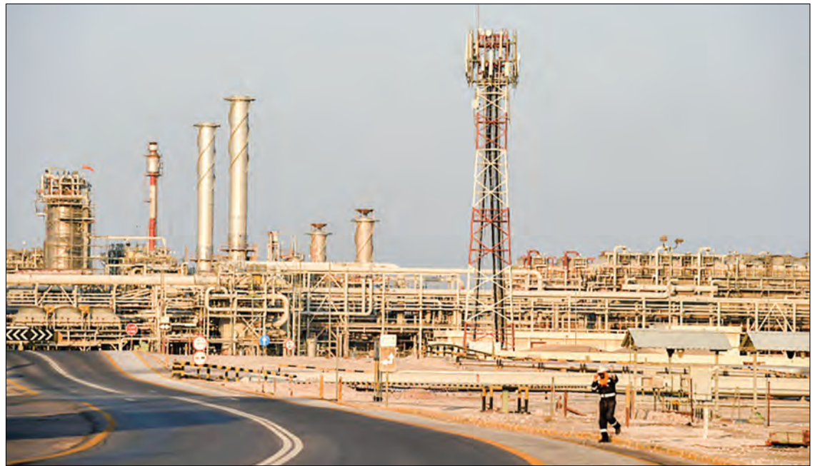
The IEA said measures taken to bolster the global economy and to reduce oil supply should allow a “gradual” recovery in the second half of the year.

The IEA said measures taken by the OPEC+ group and