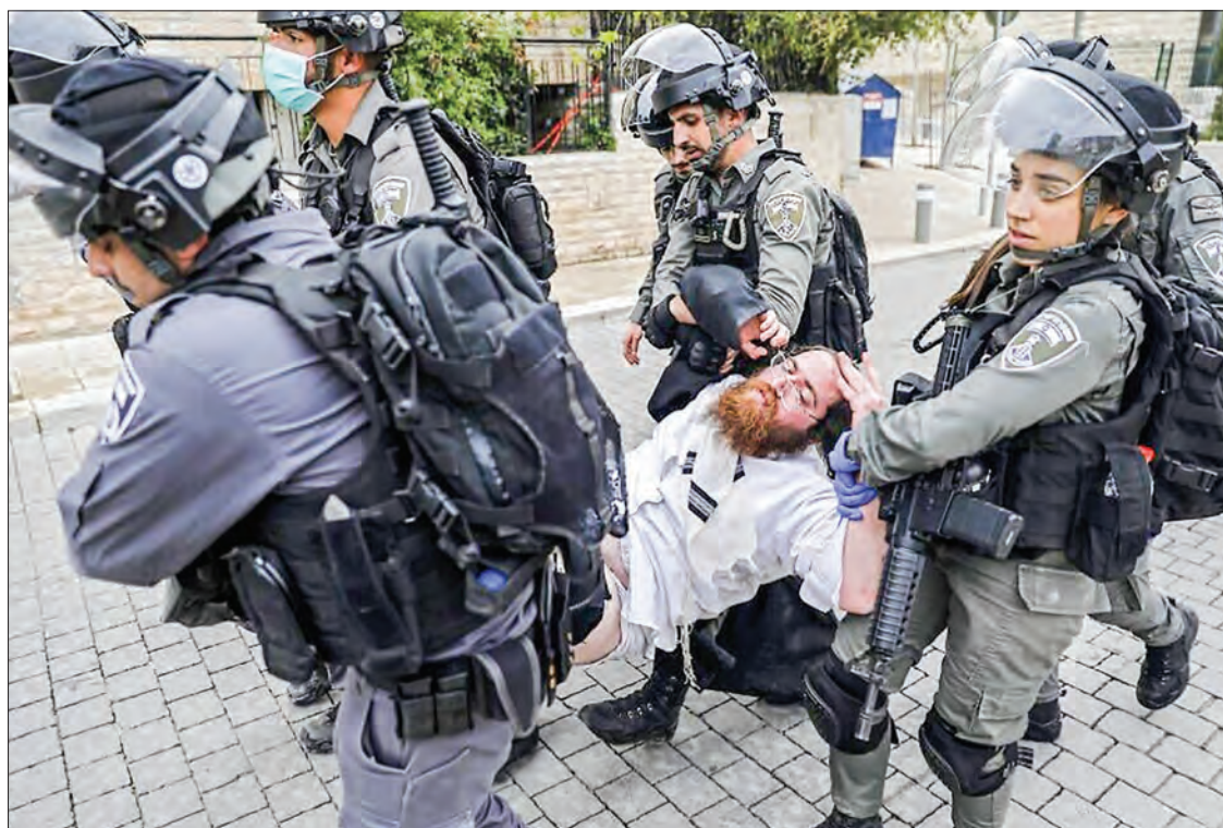
Police arrest a man in the Mea Shearim neighborhood in Jerusalem for violating emergency directives to contain the coronavirus, on 30 March, 2020.