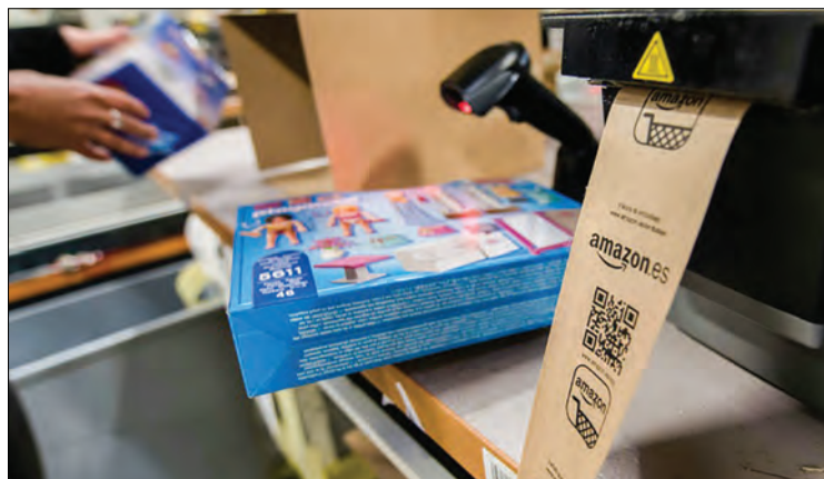
US online retailer Amazon says its operations in France are under threat following a local court ruling on worker health measures during the coronavirus outbreak.

“But obviously there’s still a long way to go before we reach that point.” — AFP ■