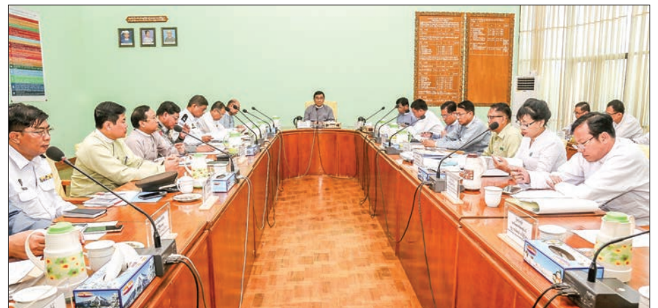
Union Minister Dr. Win Myat Aye attends the committee meeting for repatriation and resettlement of displaced persons yesterday.

COMMITTEE on Repatriation and Resettlement of Displaced People held its 5 th meeting at the Ministry of Social Welfare, Relief and Resettlement in Nay Pyi Taw yesterday.