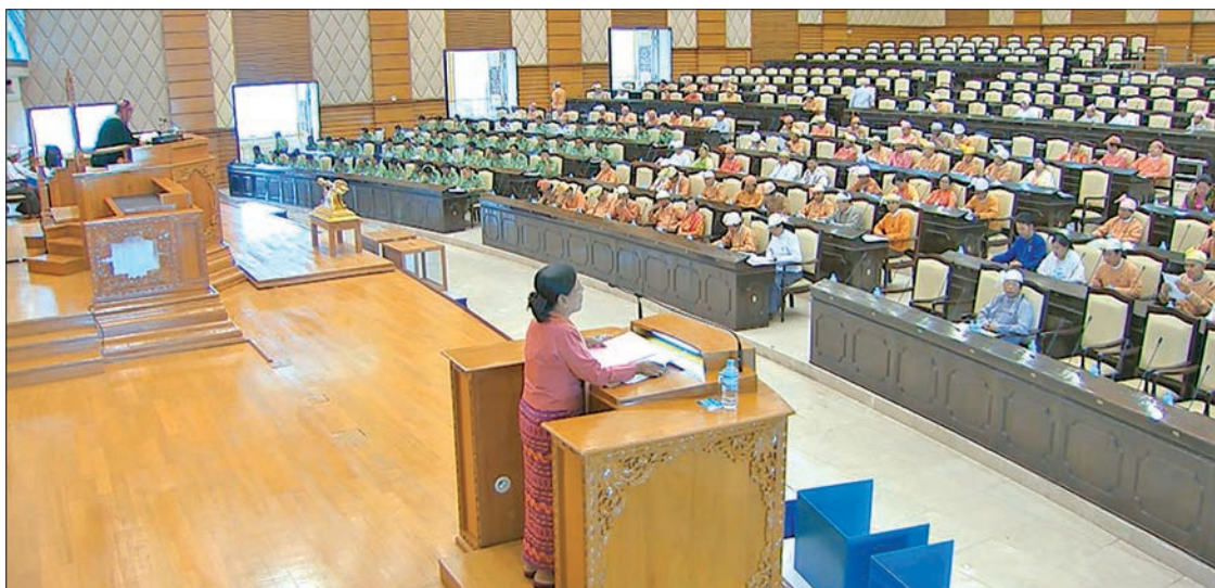
Amyotha Hluttaw being convened in Nay Pyi Taw.

Dr. U Kywe Kywe of Mandalay Region constituency 6 posed the first asterisk-marked question on plans to terminate the allocation of 50 per cent each of male and female students' entrance to University of Medicine and to permit according to marks. Union Minister for Health and Sports Dr. Myint Htwe replied that there is no plan yet