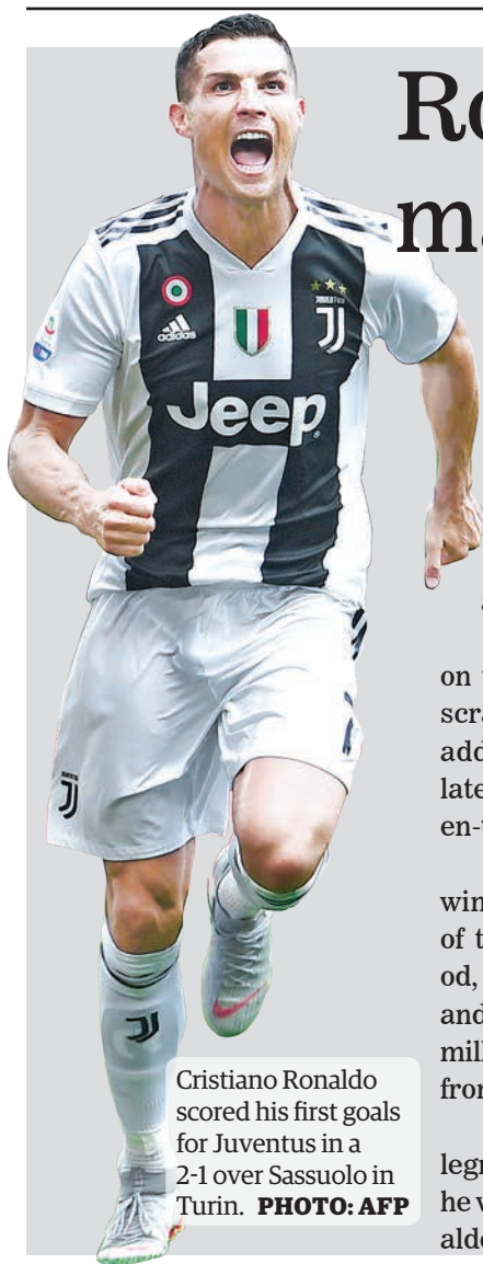
Cristiano Ronaldo scored his first goals for Juventus in a 2-1 over Sassuolo in Turin.

Everton squandered several chances to equalise and were made to pay when Pedro Obiang drove into their box and slipped the ball sideways to Arnautovic, who toe-poked a shot past the diving Pickford.