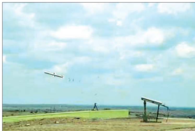
Indian Ministry of Defence.

A Defence Ministry spokesman said Indian Defence Minister Nirmala Sitharaman congratulated the DRDO team, Indian army and associated industries for the two successes of the MPATGM weapon system. —Xinhua ■