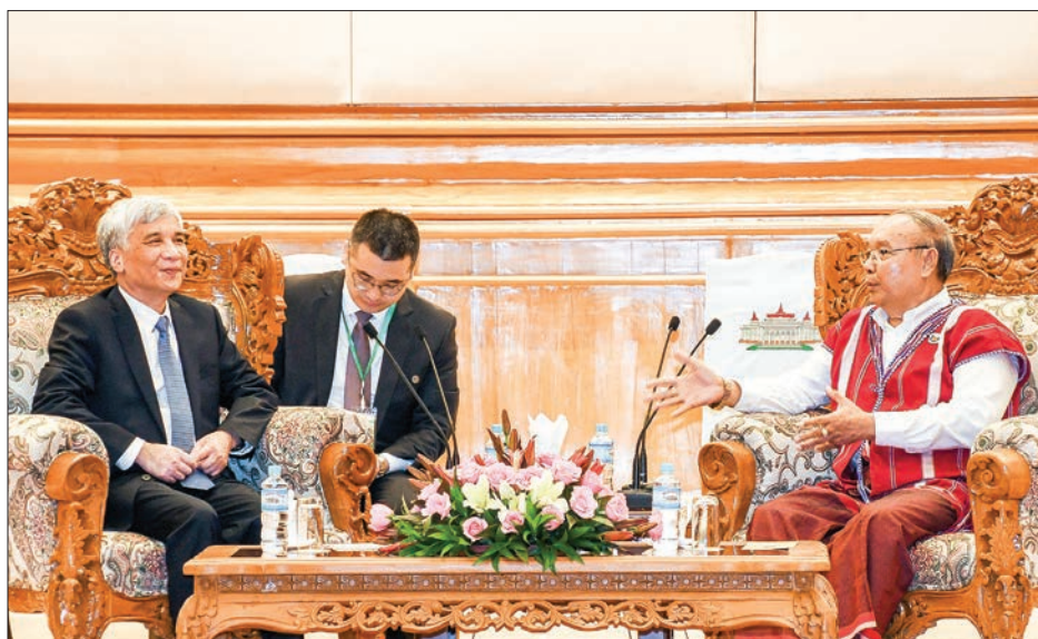
Amyotha Hluttaw Speaker Mahn Win Khaing Than holds talks with Vice Chairman of Standing Committee of NPC of China Mr. Ding Zhongli in Nay Pyi Taw.