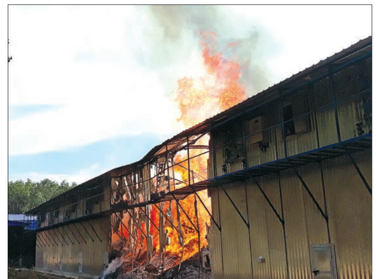
Fire at a timber factory in Thanbyuzayat.