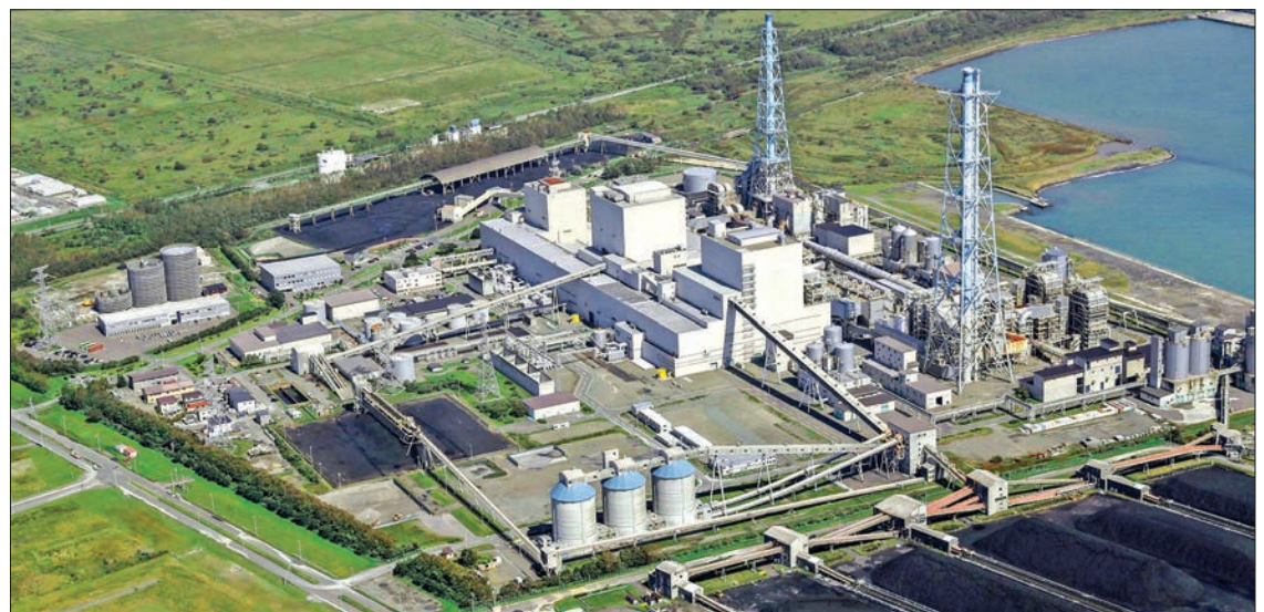
Photo taken on 6 September, 2018, shows the Tomatoatsuma thermal power plant operated by Hokkaido Electric Power Co in Atsuma on the northernmost Japanese main island of Hokkaido.

Hokkaido electricity use from its pre-quake weekday peak demand, with power supplies gradually being restored in the prefecture. Hokkaido Electric said it is prepared to provide up to 3.6 million kw against a projected peak of 3.19 million kw on Monday. However, as electricity demand is expected to increase with the restart of corporate activities following the end of a three-day holiday through Monday, Hokkaido Electricity urged users to save power between 8:30 am and 8:30 pm on weekdays.—Kyodo News ■