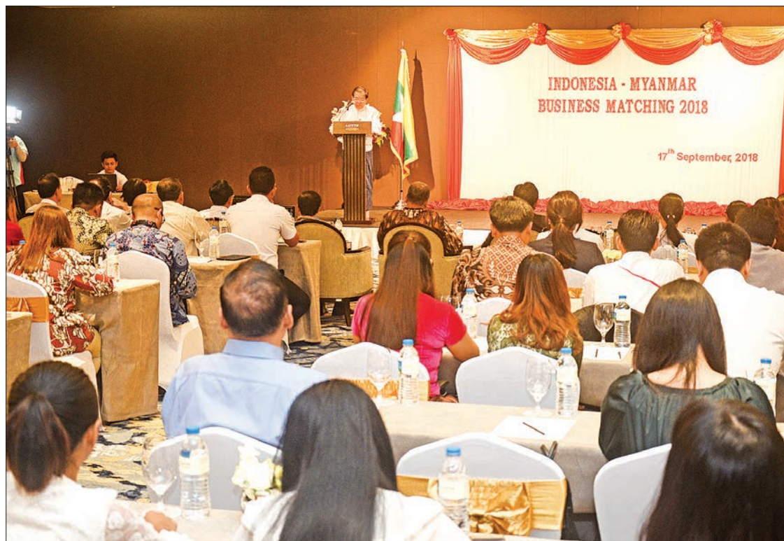
Director General of Myanmar Trade Promotion Organization U Aung Soe delivers a speech at the Indonesia-Myanmar Business Matching 2018 in Yangon yesterday.

“Bilateral trade between Myanmar and Indonesia has increased, though. Among ASEAN countries, Indonesia