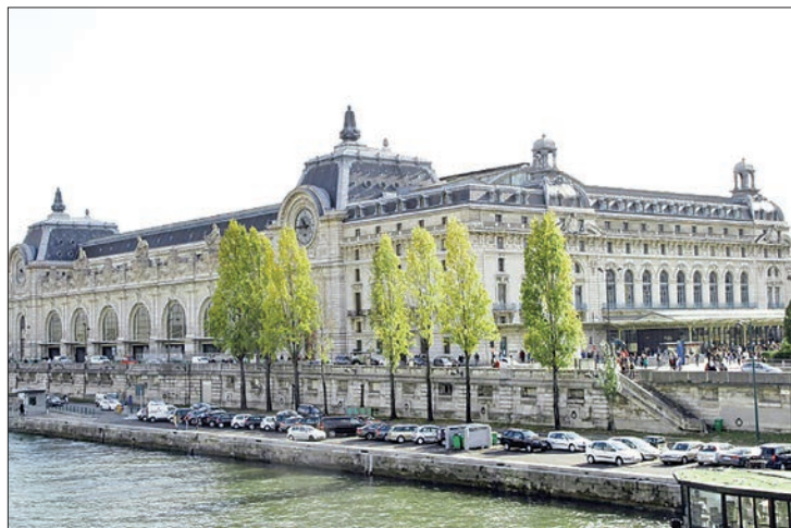
The Musee d'Orsay in Paris will be showing 'Picasso Blue and Rose' through 6 January.

PARIS (France) — More than 300 works from two key periods in Pablo Picasso's early years go on display in Paris on Tuesday, the first time they have been brought together in the city where the Spanish master took his first steps toward revolutionary new territories of modern art. "Picasso: Blue and Rose" delves into the formative days from 1900 to 1906 when the young artist was living the Bohemian life in a Montmartre studio, at times burning his works to ward off the cold.