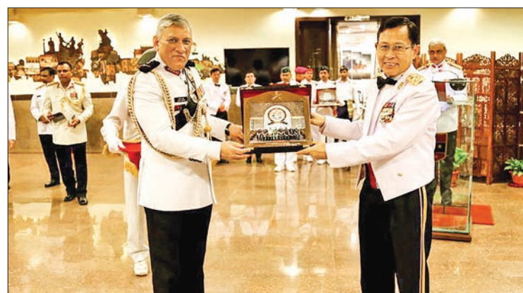
Deputy C-in-C of Defence Services Commander-in-Chief (Army) Vice Senior General Soe Win receives a souvenir from India's Army Chief General Bipin Rawat in Pune, India.

Vice-Senior General Soe Win attended the BIMSTEC Army Chiefs' Conclave on 15 September morning.— MNA ■