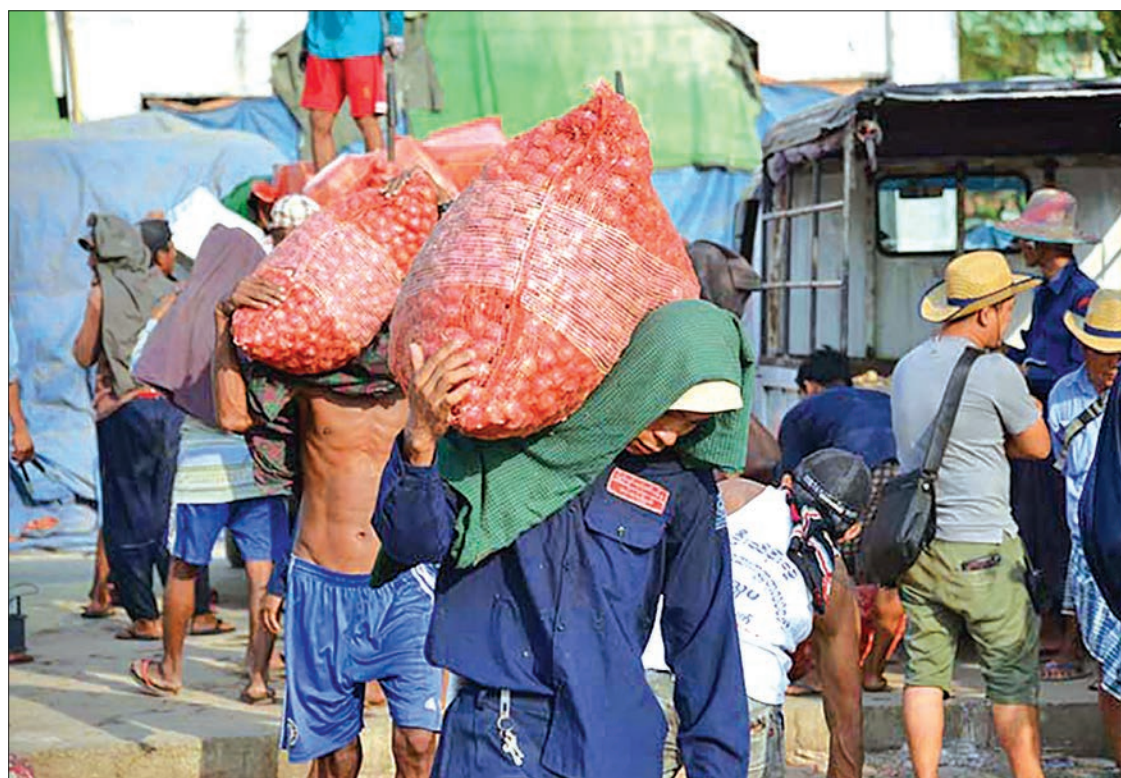
Labourers carrying sacks of onions on their shoulders.

Onions in the wholesale market was sold between Ks 400 and Ks 600 per viss on 28 August, between Ks 500 and Ks 775 per viss on 8 September,