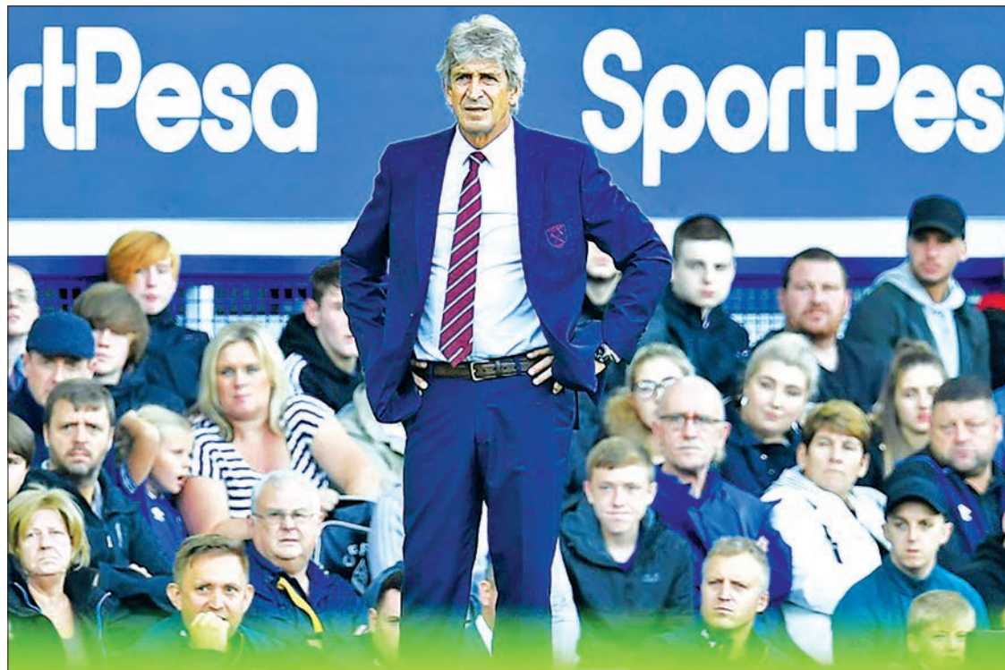
Manuel Pellegrini looks on from the touchline during his first Premier League win as West Ham manager got, a 3-1 win over away to Everton.

"It's easy to say we were going to change, but I was absolutely convinced this is the way," Pellegrini, who said his birthday