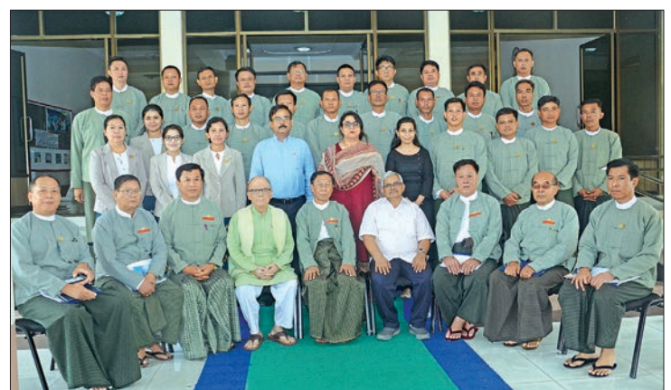
Chairman of the UEC U Hla Thein poses for a documentary photo with representatives from Training of Trainers and Facilitators.

Speaking at the opening ceremony of the training, U Hla Thein, Chairman of the UEC, expressed UEC's willingness to make further cooperation with the Election Commission of India. A total of 25 trainees are attending the five-day course and trainers from India International Institute of Democracy and Election Management (IIDEM) are giving lectures