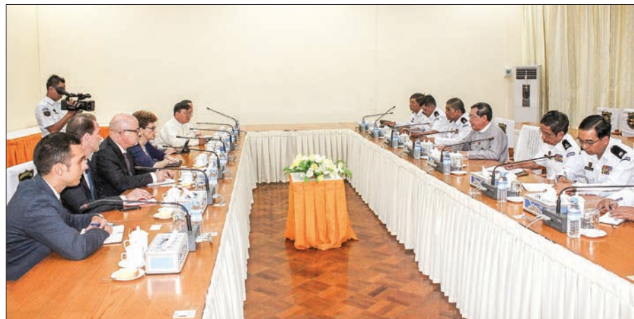
Union Minister U Thein Swe holds talks with Country Director of World Bank Ms. Ellen Goldstein in Nay Pyi Taw yesterday.

The workshop will be held from 17 to 19 September. Today, the workshop will focus on effective communications in applying diplomatic protection, discovering solutions to conflicts and negotiation skills, reporting the results of trainings, solutions to conflicts and conciliation skills, understanding and negotiating, policies and principles, among other topics. On 19 September, tomorrow, attendants will watch a documentary on establishing agreements, discuss on relevant topics, and make final evaluations on the workshop. —MNA ■