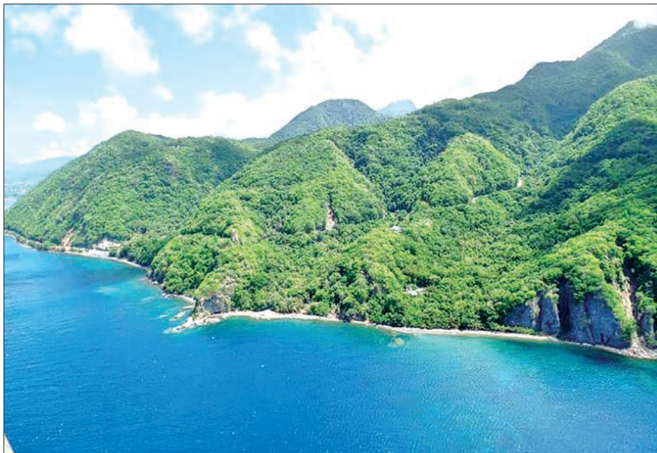
The Dominica forest is seen in August 2015, two years before Hurricane Maria tore through the tiny Caribbean island.

"The impact on their habitat affects everything,