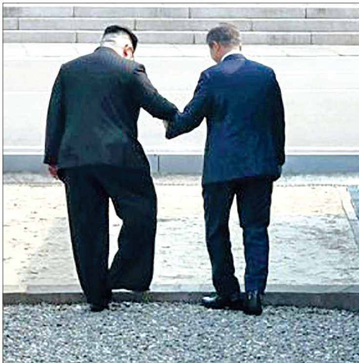
North Korea's leader Kim Jong-un (top) and South Korea's President Moon Jae-in (r) as they meet at the Military Demarcation Line that divides their countries at Panmunjom on 27 April, 2018.

Moon, who met Kim twice this year, was instrumental in brokering the historic Singapore summit between US President Donald Trump and Kim in June, when Kim backed denuclearisation