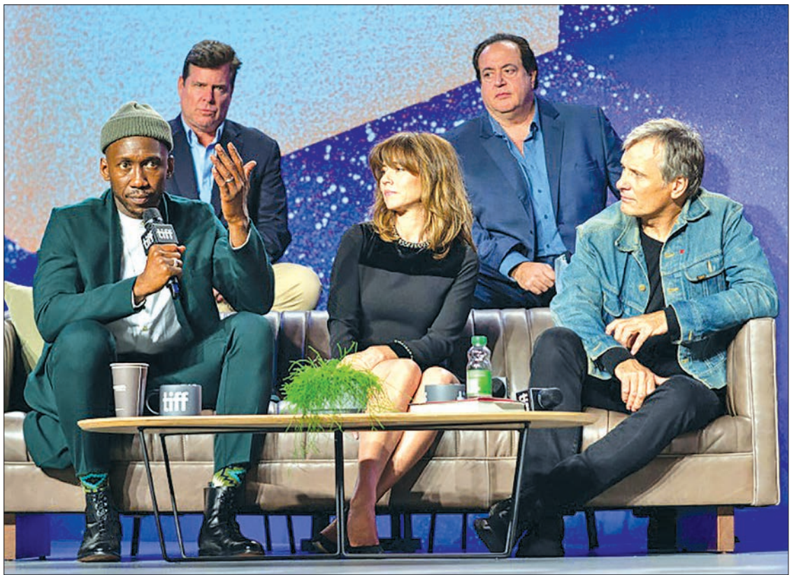
The film follows a working-class Italian-American bouncer who takes a job chauffeuring an African-American classical pianist through the US South in the 1960s, because it is too dangerous to travel alone.