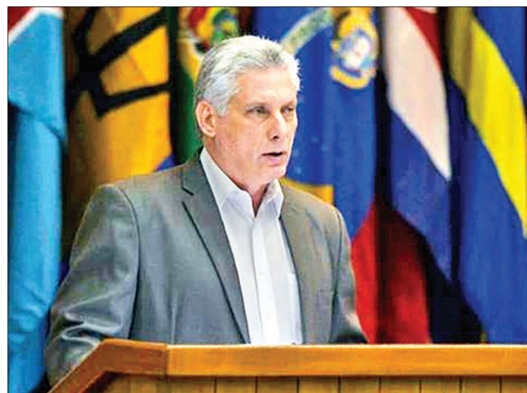
Cuban President Miguel Diaz-Canel took aim at the US economic blockade of Cuba.

Spearheaded by Mariela Castro, the daughter of former president Raul Castro, changes to the new constitution would include a provision that defines marriage as between "two people" rather than "a man and a woman." The silver-haired Diaz-Canel assumed power in April from Castro, who himself took over from his elder brother Fidel, father of the 1959 revolution.—AFP ■