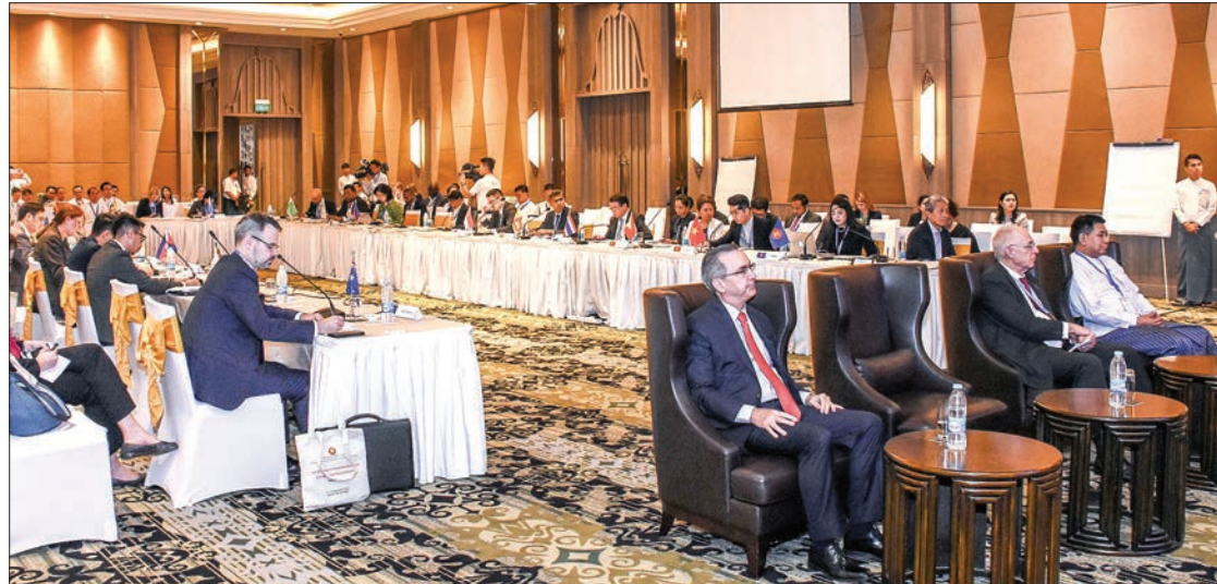
Union Minister for International Cooperation U Kyaw Tin addresses the ASEAN Regional Forum Workshop on Preventive Diplomacy: Skills and Tools Towards Effective Peacebuilding in Nay Pyi Taw.

Next, U Myint Thu, Permanent Secretary of the Ministry of Foreign Affairs, and Dr. Jerr