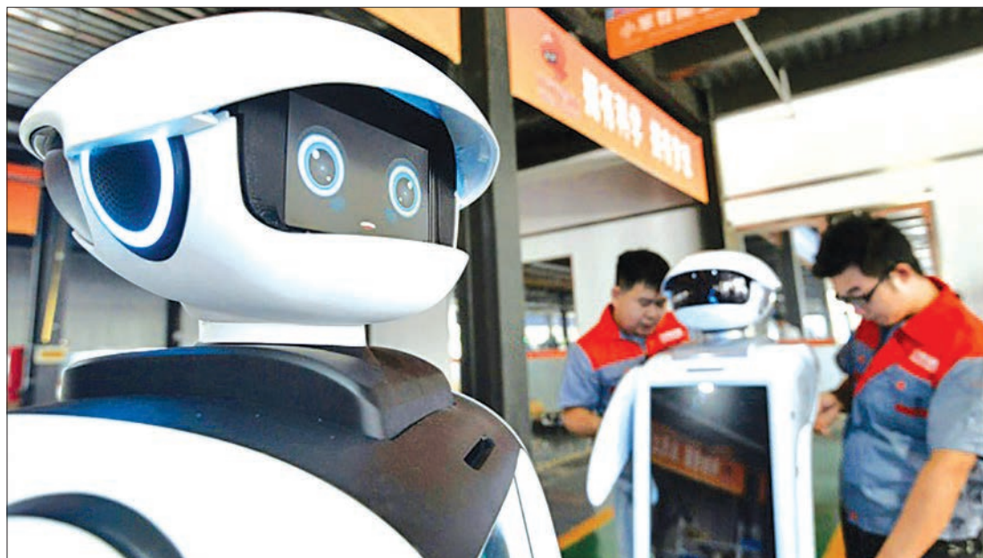
Robots will handle 52 percent of current work tasks by 2025, a World Economic Forum study says.

Based near Geneva, the WEF is known for the annual pow-wow of wealthy individuals, politicians and business leaders that it organises in Davos, Switzerland.