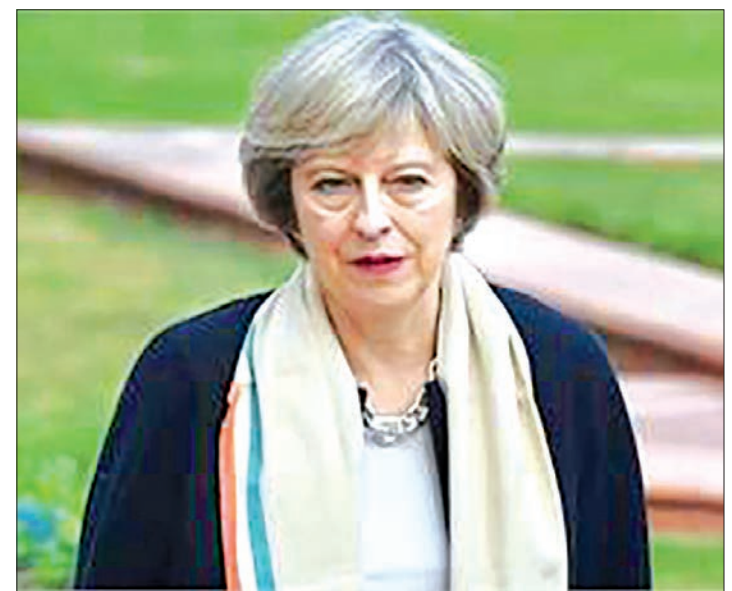
British Prime Minister Theresa May.

He has held various command and staff positions across the Army and Joint Community in Germany, the US and South-west Asia during his 34 years of active service.—AFP ■