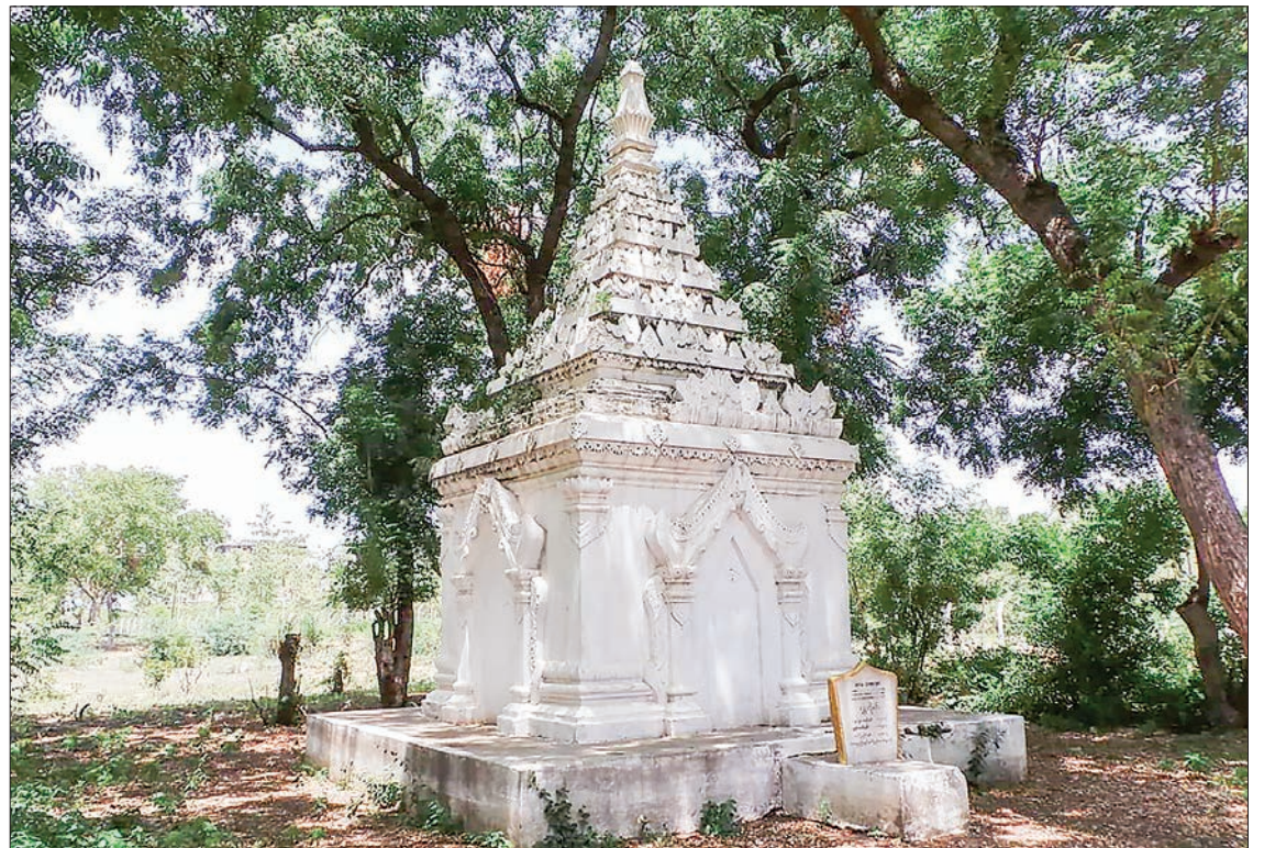
Tomb of King Thayawady.

The brick tier-roofed pagoda of King Sagaing is located on the circular road of the lake in front of Shwelinpin Pagoda in Pyatthatkyi Village, southwest corner of Amarapura Royal Palace. The tier-roofed building of the king faces Taungthaman Lake, at the same direction of the place where his first queen Nanmadaw Mei Nu was killed into the water. However, some experts assumed Nanmadaw Mei Nu was killed at Thayettabin graveyard in Amarapura.