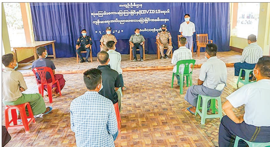
Prisoners receive COVID-19 education before leaving Insein Prison yesterday.