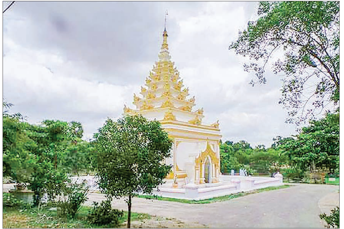
King Sagaing's tomb.

After King Badon had passed away, his grandson King Sagaing (1819-1837 AD) ascended to the throne. The dethroned king passed away on 15 October 1846 under care of his younger brother King Thayawady. The remains of King Sagaing were cremated inside the compound of Amarapura Royal Palace.