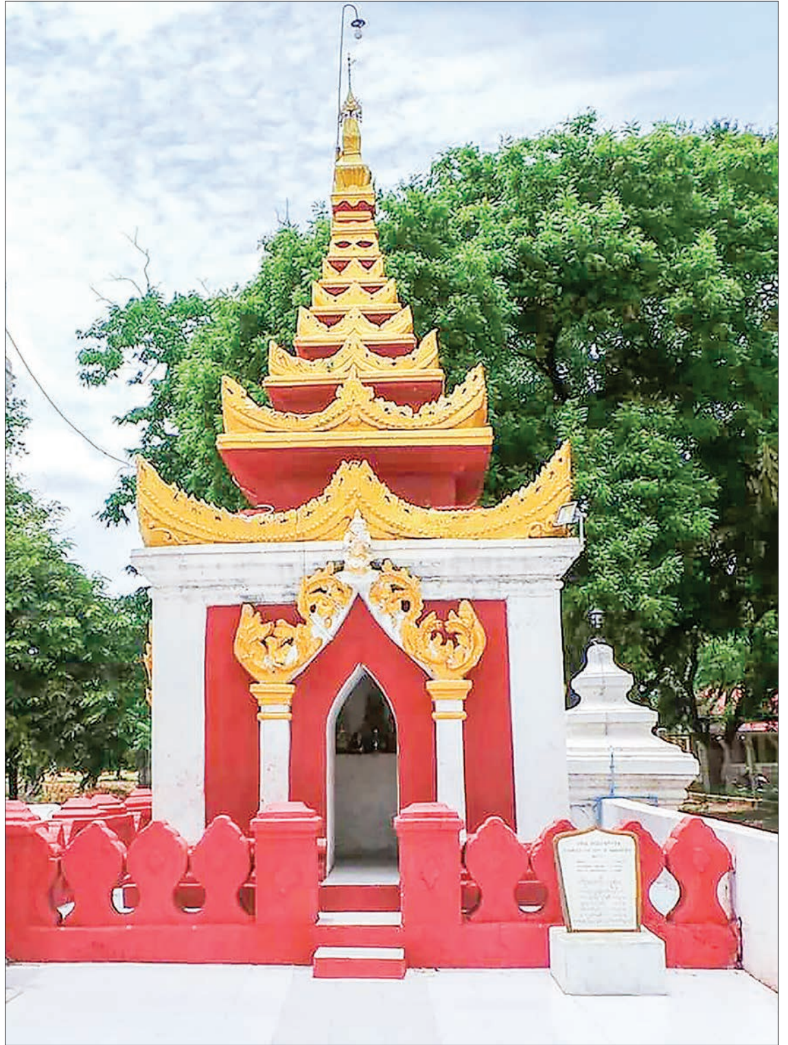
Mausoleum of King Badon.

Amarapura, the native of Pariyatti treatise compiler venerable Ashin Janakabhivamsa and venerable Mogok abbot U Vimala who established a large number of Mogok meditation centres across the nation, is famous with masterpieces of silk industries and weaving production.