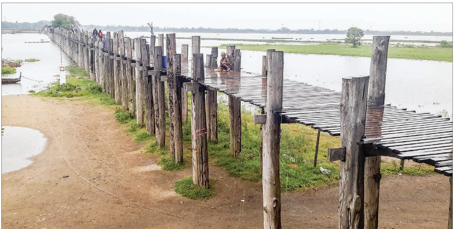
U Bein Bridge.