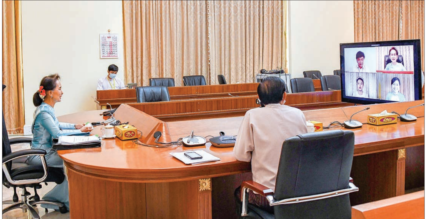
State Counsellor Daw Aung San Suu Kyi talks to the health workers from the Waibargi Specialist Hospital during the video conference.

As a new year wish on this New Year Day of 1382 ME, she told the health work-