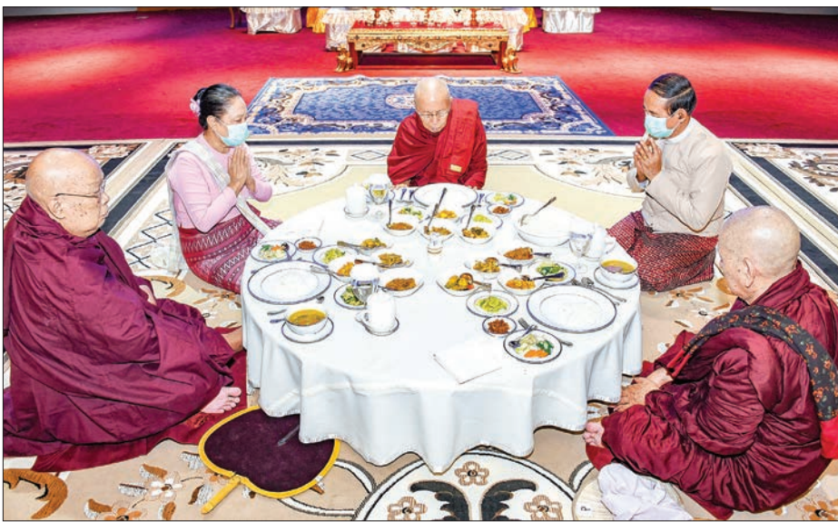
President U Win Myint and First Lady Daw Cho Cho offer soon to the Members of the Sangha.

FOR the safety of all Myanmar citizens in the Myanmar New Year of 1382-ME and for winning the fight against the COVID-19 pandemic, an annual Parittas Recitation ceremony was held at the Presidential Palace yesterday.