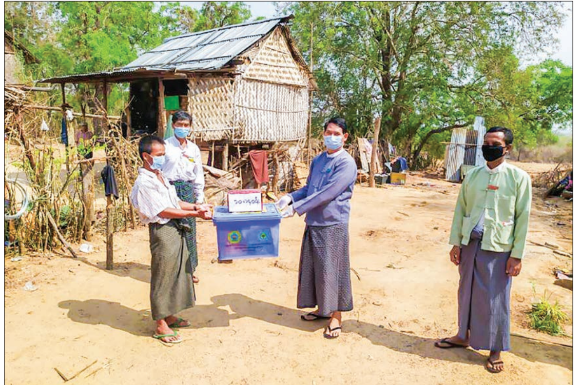
Officials offering the necessary utensils to local people as winds landed in Sagaing and Magway regions this week.

Officials from the Disaster Management Department under the Ministry of Social Welfare, Relief and Resettlement, together with local authorities,