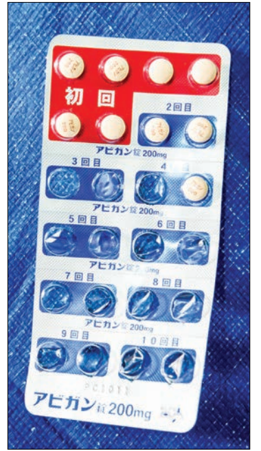
Supplied file photo shows Avigan anti-influenza drug.

Japan will offer a cash payment of 100,000 yen ($930) to