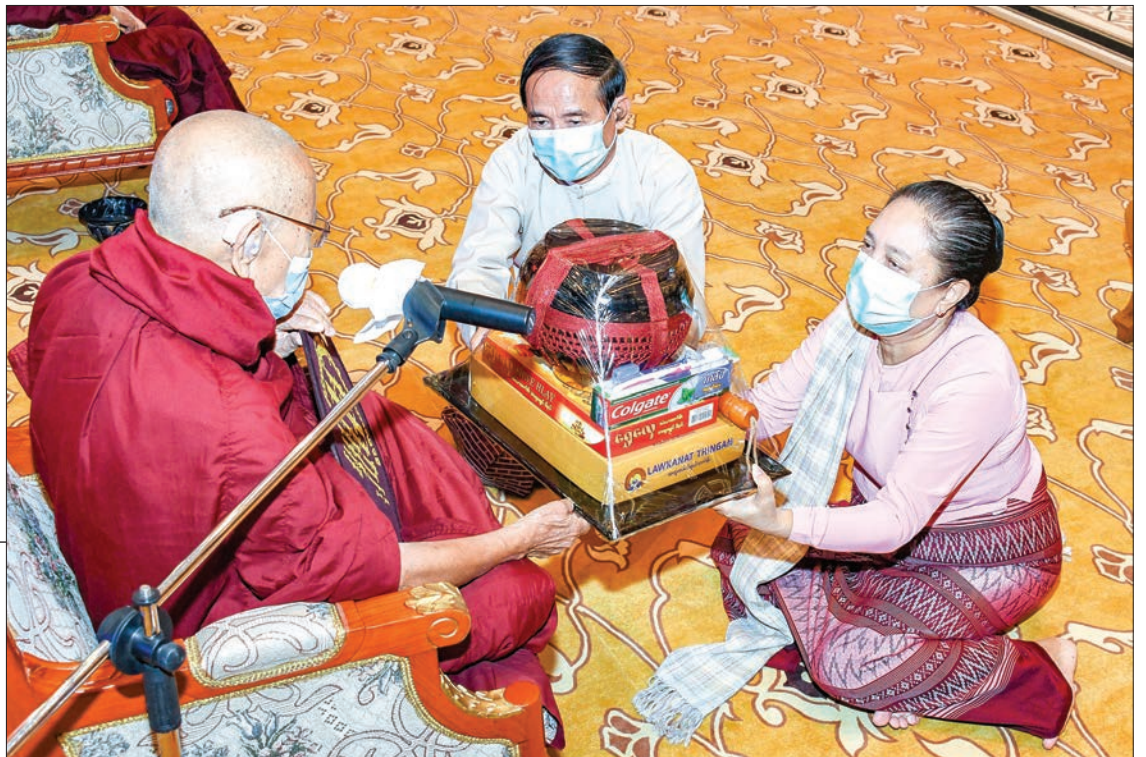
President U Win Myint and First Lady Daw Cho Cho present offertories to a Sayadaw at the ceremony to recite Parittas on New Year Day at the Presidential Palace in Nay Pyi Taw yesterday.