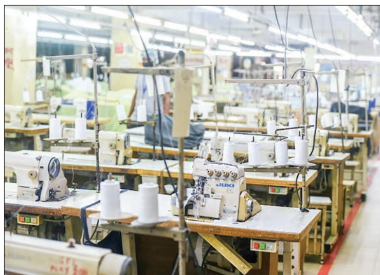
A once-bustling garment factory is silent after closing due to the coronavirus.