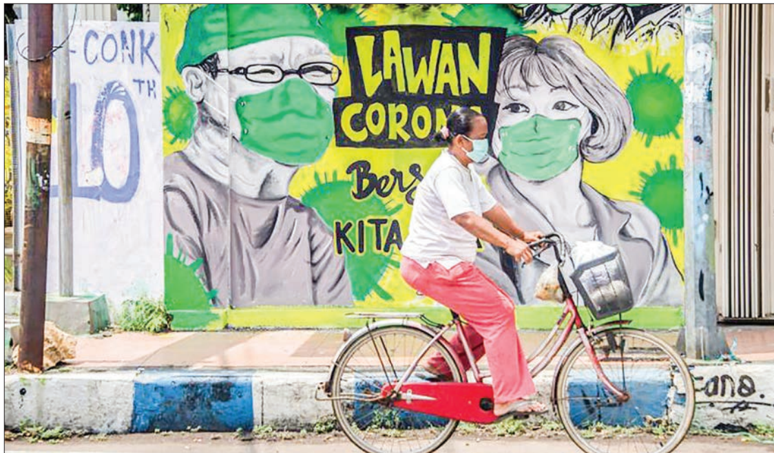
A woman cycles past a mural depicting the COVID-19 coronavirus in Bangkalan, east Java on Monday.