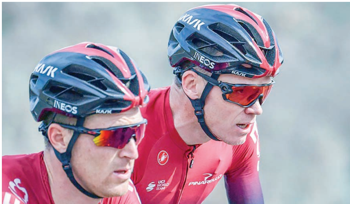
Team Ineos's Chris Froome (right) rides during the second stage of the UAE Cycling Tour in February 2020.

LONDON (United Kingdom) — Team Ineos boss Dave Brailsford says he will pull his riders out of the rescheduled Tour de France if he feels precautions against the coronavirus are not sufficient.