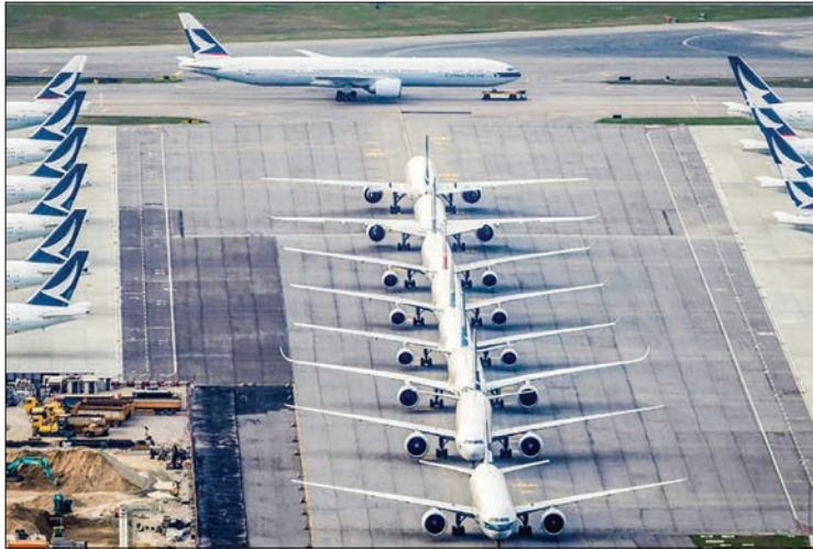
Like most airlines, Cathay Pacific has been hammered by the virus outbreak with its huge fleet of planes almost entirely grounded.

tected about 5,660 coronavirus cases and recorded 362 deaths, but those figures are expected to climb as the nation ramps up testing.