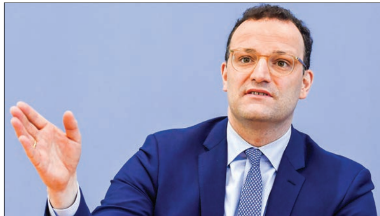
German Health Minister Jens Spahn speaks during a press conference with the head of the Robert Koch Institute for disease control on the situation in Germany amid the new coronavirus pandemic on 17 April, 2020 in Berlin. — The coronavirus pandemic in Germany is "again under control" thanks to a month of lockdown imposed after an early surge in cases, Health Minister said.

Germany was infecting less than one other person — the person-to-person rate dropping to 0.7 — according to data from the Robert Koch Institute (RKI) for disease control on Thursday.