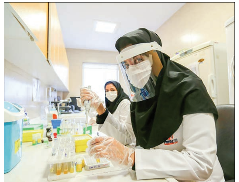
The Iranian health ministry acknowledges that limited testing for the coronavirus may mean its figures understate the true numbers of infections and deaths.

The government of President Hassan Rouhani has struggled to contain the outbreak and keep Iran's fragile and sanctions-hit economy running.—AFP