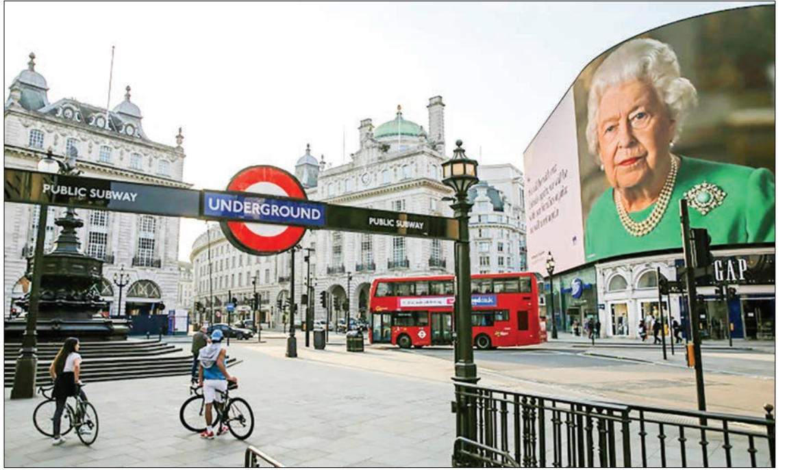
Britain's Prince William and his wife Kate aired their concerns for the royal family with the novel coronavirus rampant.

They urged people to look after their mental as well as their physical well-being during the lockdown.— AFP ■