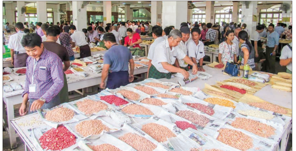
Merchants evaluating various kinds of bean at a brokerage house in Mandalay last year: PHOTO: MIN HTET AUNG (MANDALAY SUB-PRINTING HOUSE)

Usually, India would demand mung beans, pigeon peas, green grams and yellow peas for the quota. But this time, India announced its permission to import 400,000 tonnes of mung beans only. With the permission to