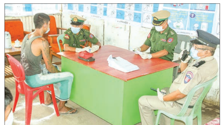
Officials providing necessary health care knowledge to the prisoner.

group arranged for the released inmates to be prevented from COVID-19. A total of 87 expatriate inmates were also pardoned on the same day.—Aung Min (Myaungmya) (Translated by Zaw Htet Oo)