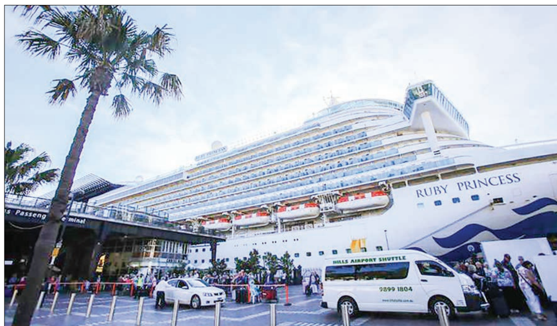
FILE: Australian police began contacting thousands of Ruby Princess cruise ship passengers from around the world.