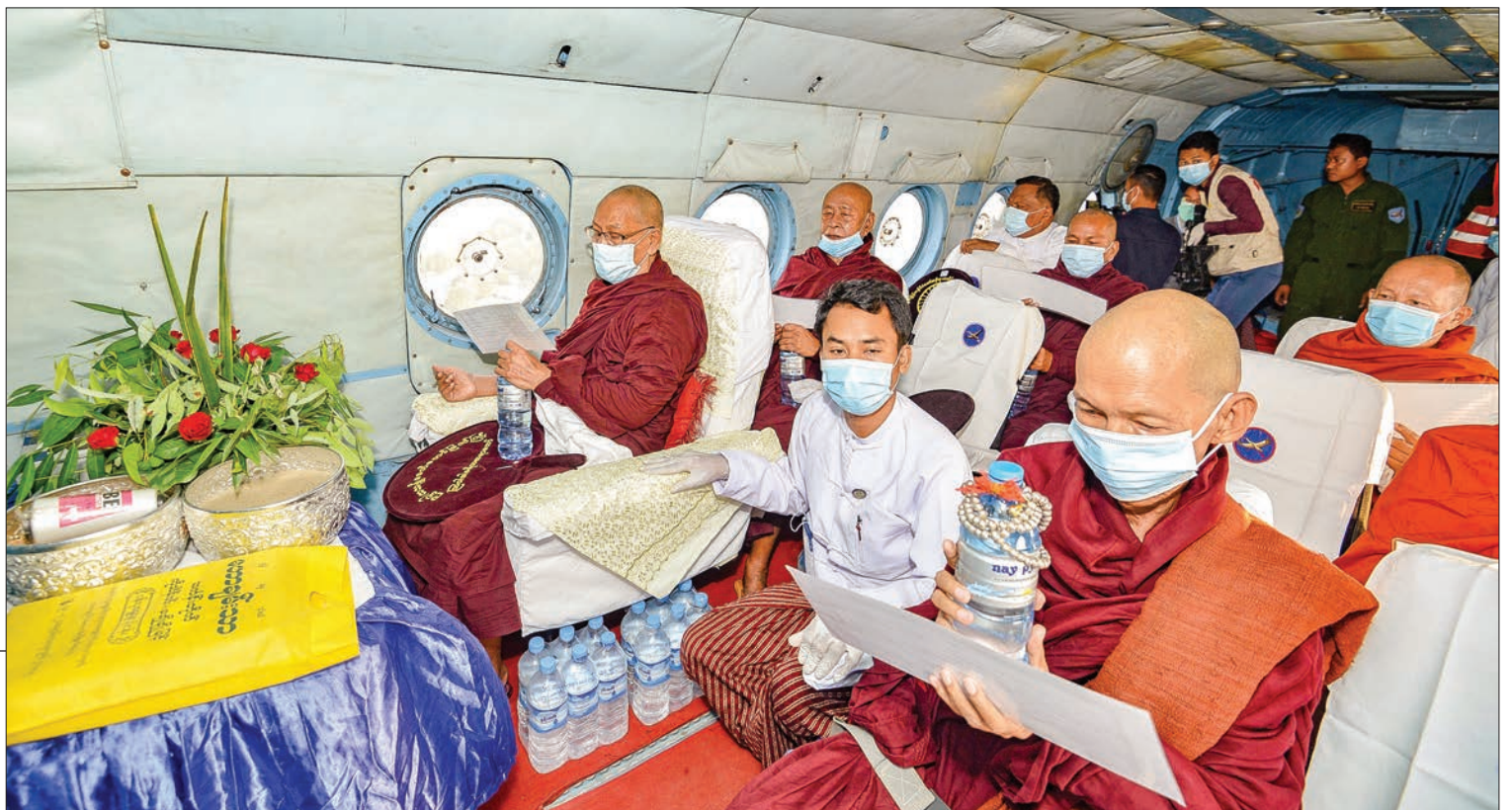
Senior Buddhist monks recite Parittas onboard a military helicopter over Nay Pyi Taw Council Area.