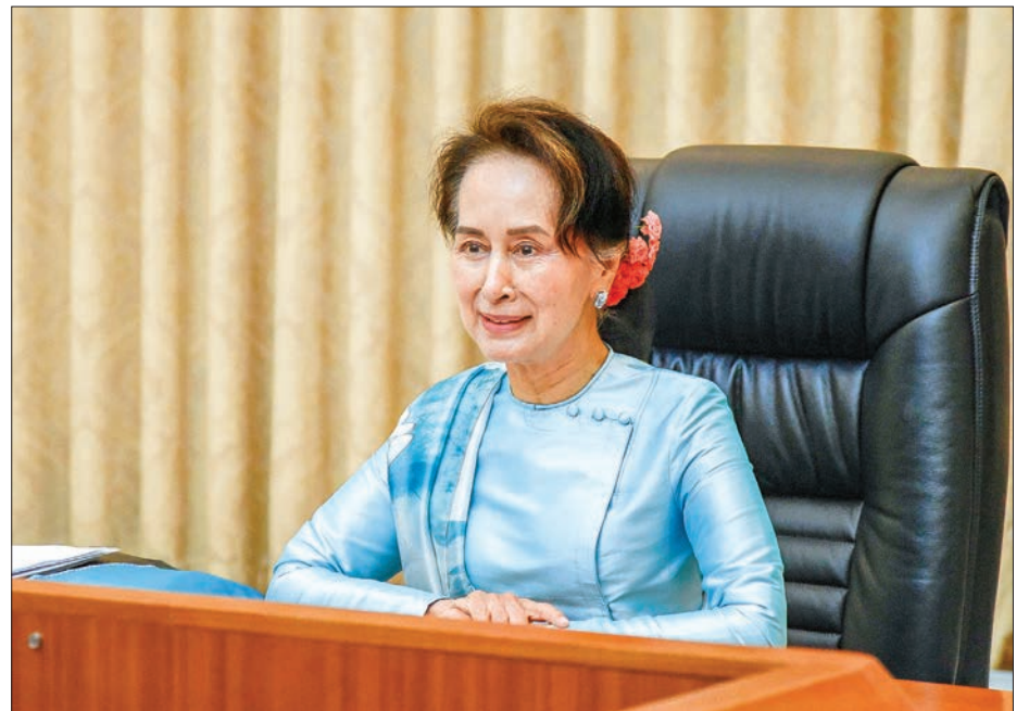
State Counsellor Daw Aung San Suu Kyi talks to the health workers from the Waibargi Specialist Hospital during the video conference.

Today is the time to encourage each other. Individual citizens and governmental employees are to encourage each other to cooperate and remain unified in the face of the COVID-19.