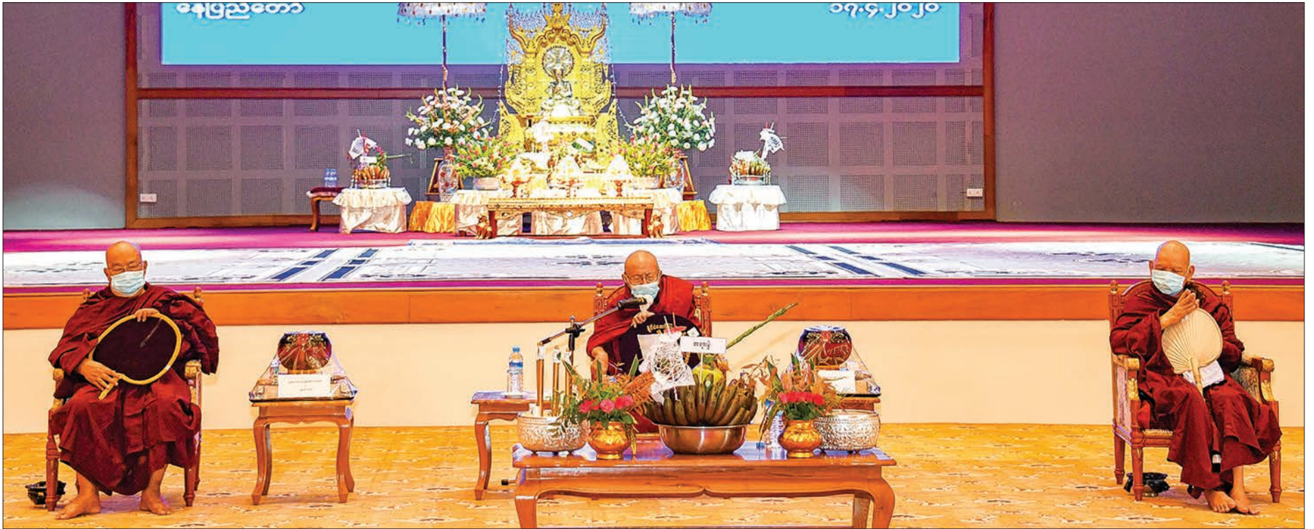
Sayadaws recite Parittas at the Presidential Palace on the New Year Day yesterday for safety of people and for protection amidst COVID-19 outbreak.