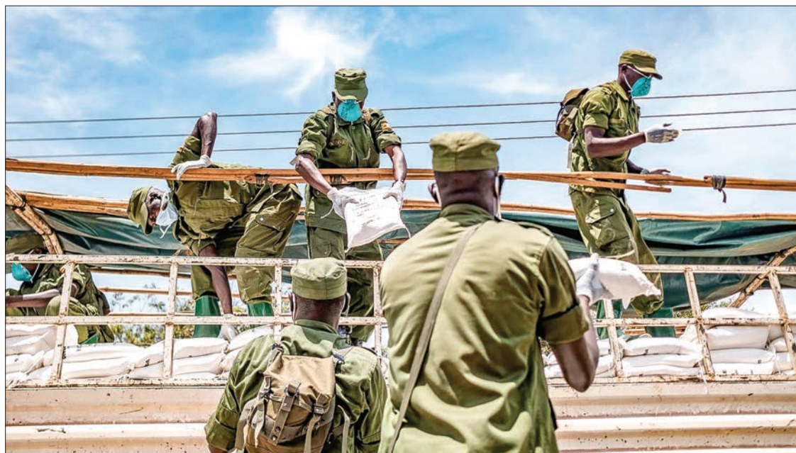
Paramilitary members unload provisions in Kampala, Uganda, on Saturday, April 4. It was the first day of government food distribution for people affected by the nation's lockdown.