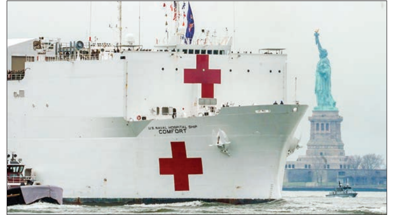
Navy hospital ship USNS Comfort docked in New York as it prepares to begin assisting the medical needs of the city's citizens due to the strain on the health care system from the coronavirus pandemic.

In the Eurozone, industrial production measures the output of businesses integrated in industrial sectors of the economy, such as manufacturing, mining, and utilities. In the United States, an-