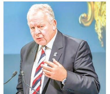
World Rugby chairman Bill Beaumont.

Woodward's assertion that "rugby would benefit from being viewed through the eyes of leader who is 45, not 68" rankled with Beaumont, who said: "What difference does the age make?"