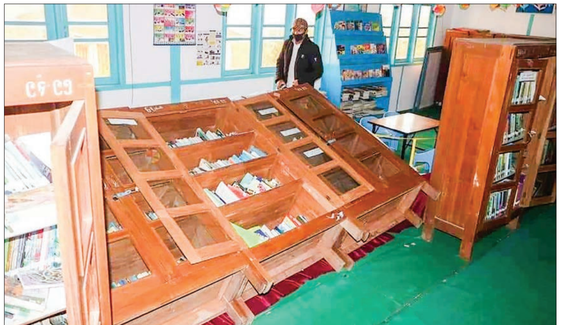
Earthquake in Chin State topples the cupboards on 16 April.

The Ministry of Social Welfare, Relief and Resettle-