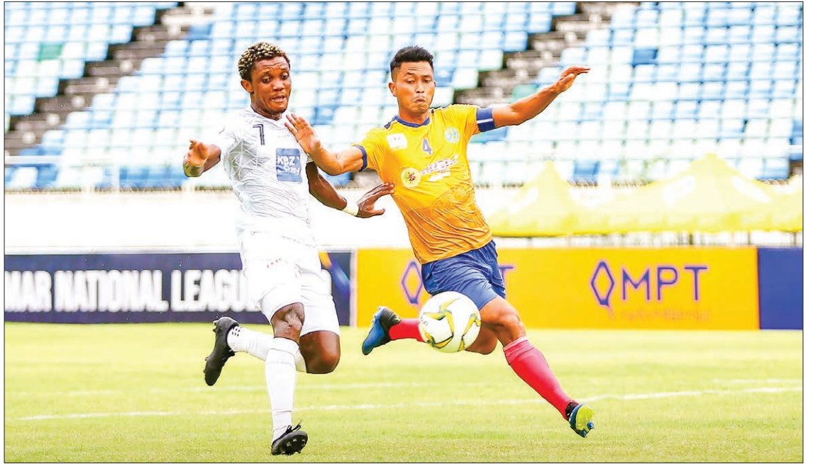
Players from Shan United and Sagaing United vie for the ball during a Week-12 match of MPT MNL 2020 at the Thuwunna Stadium in Yangon on 31 August 2020.

Week-13 matches will be played on 3 and 4 September, and the matches are Southern Myanmar vs Hantharwady United, ISPE FC and Yadanarbon FC, Magwe FC vs Ayayawady United, Sagaing United vs Yangon United, and Rakhine United vs Shan United.—Kyaw Khin