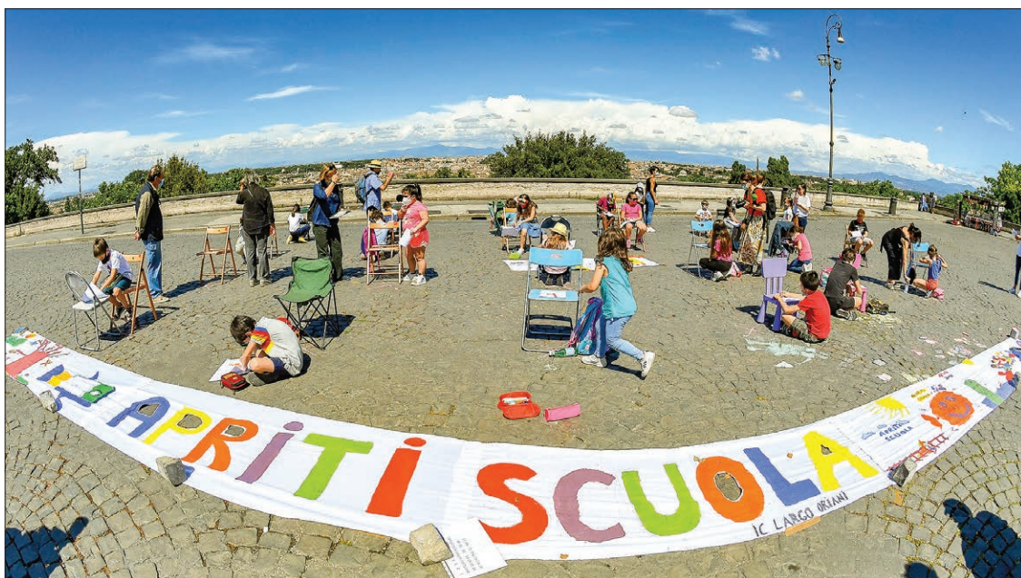
Parents and children from Rome's public primary and secondary school "IC Largo Oriani" take part in a flashmob entitled "Open School" (ApritiScuola) at the Gianicolo Belvedere overlooking Rome on June 8, 2020, to mark the end of their "unusual school year" as the country eases its lockdown aimed at curbing the spread of the COVID-19 infection, caused by the novel coronavirus.

President Sergio Mattarella on Monday urged Italy to "effectively face its responsibilities in this difficult time, saying schools were a "decisive resource". —AFP ■