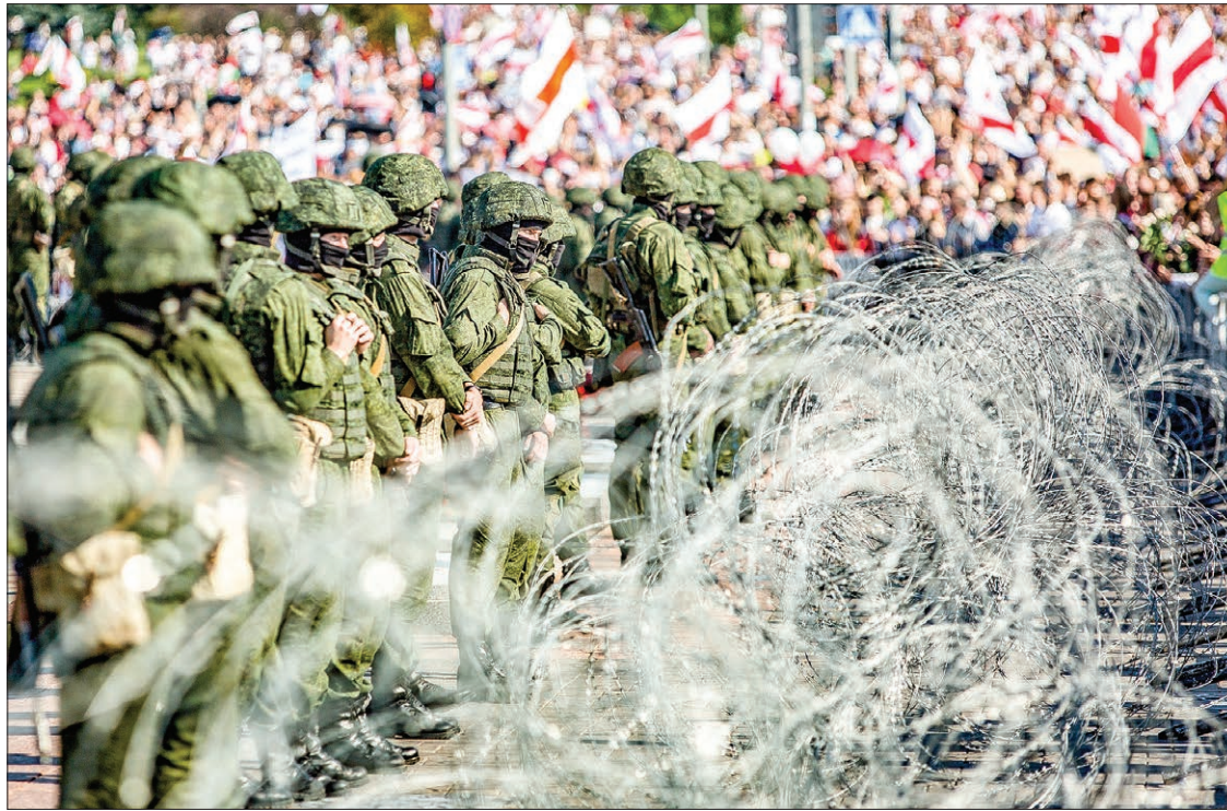
Belarusian servicemen stand behind a barbed wire fence during an opposition supporters rally protesting against disputed presidential elections results in Minsk on 30 August 2020.

Sunday's rally came on Lukashenko's 66th birthday and protesters carried quirky handmade "gifts" including a cardboard toilet with a sign urging the strongman to flush himself away, a coffin marked "Political corpse" and a picture of a cockroach, the opposition's nickname for the president.