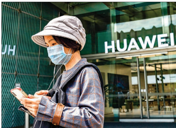
A woman walks past a shop for Chinese telecoms giant Huawei in Beijing on 25 May 2020.

But Huawei said in a statement that the “continued negative business environment is having a larger than originally forecasted impact on our planned revenue stream”, in explaining its decision to terminate the deal a year early. “It is so disappointing that it has ended this way but are very proud of the small role we have