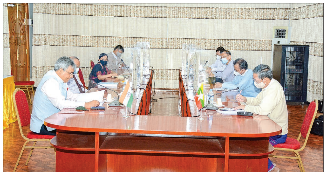
Myanmar Ministry of Education and the Embassy of India sign an agreement for provision of library materials and software in Nay Pyi Taw on 31 August 2020.

To shape the future with your vote, let's check the voters list.