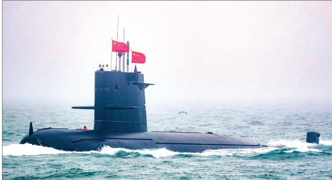
A Great Wall 236 submarine of the Chinese People's Liberation Army (PLA) Navy, billed by Chinese state media as a new type of conventional submarine, participates in a naval parade to commemorate the 70th anniversary of the founding of China's PLA Navy in the sea near Qingdao, in eastern China's Shandong province on 23 April 2019.

Government spokesman Anucha Burapachaisri announced Monday Prime Minister Prayut Chan-O-Cha — also de-