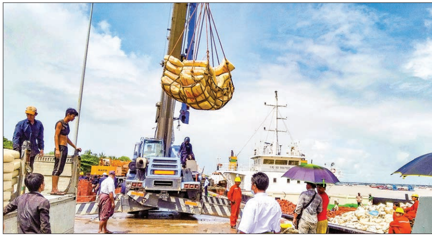
Yangon Region Government has spent K3 billion to construct a solar diesel hybrid power station in Cocogyun Township.

THE Yangon Region government is spending K3 billion to construct a solar-diesel hybrid power station for Cocogyun Township, as part of its plan for 100 per cent electrification in Yangon Region.