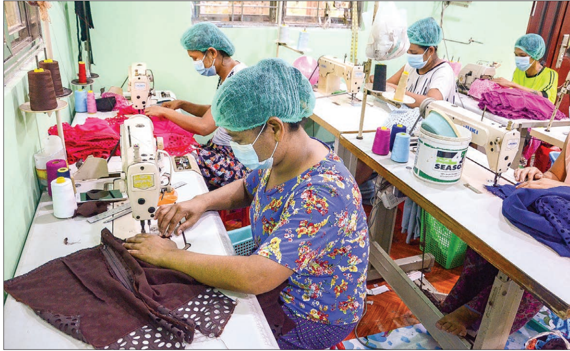
Women make clothes at a sewing workplace in Yangon in July 2020.

The garment sector is among the prioritized sectors driving up exports. The CMP garment industry has emerged as a promising one, with preferential trade from