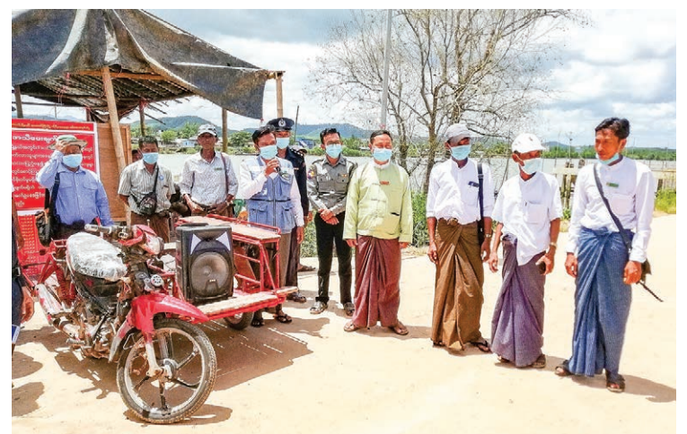
Local authorities raise public awareness to tighten border security along the Pachan River between Myanmar and Thailand on 31 August 2020.