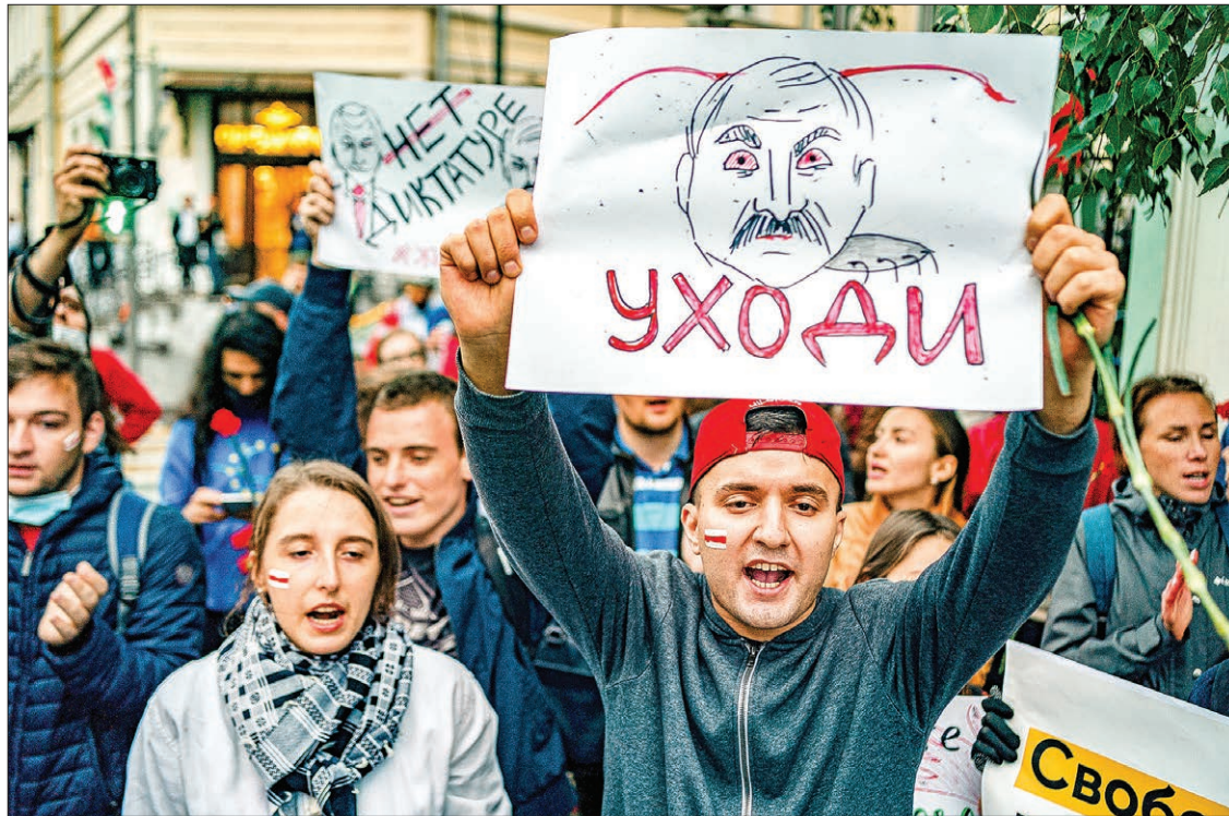
Demonstrators protest against the results of Belarusian presidential election outside the Belarusian embassy in Moscow on 12 August 2020.

His Estonian counterpart UrmasReinsalu said the Baltic-states were "demonstrating that we are addressing the human