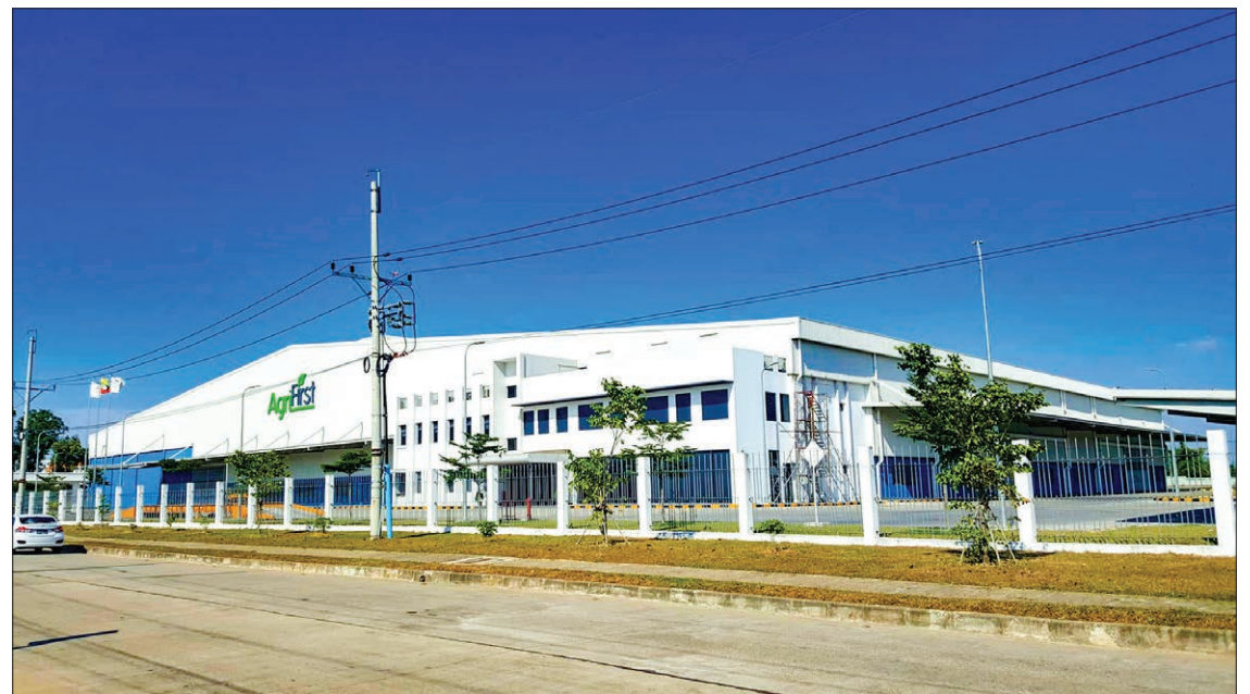
Agri First Fertilizer Plant in Thilawa Special Economic Zone.

"Myanmar is trying to attract foreign investment by providing tax relief, tax incentives, investment opportunities, and fast pro-