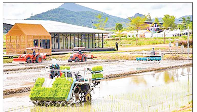
Undated photo shows a paddy field in Kubota Farm, an agricultural machinery-testing farm opened by Kubota Corp. in August 2020 in Thailand.

The Japanese group, which has 13 such demonstration farms in Japan, plans to expand the Thai farm in the future, with total investments likely reaching the equivalent of several million dollars, the spokesman said. —Kyodo News ■