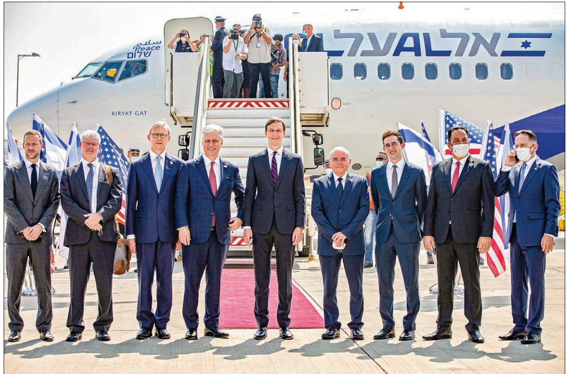
US Presidential Adviser Jared Kushner (C-R) and US National Security Adviser Robert O'Brien (C-L) pose with members of the Israeli-American delegation in front of the El Al's flight LY971, which will carry the delegation from Tel Aviv to Abu Dhabi, at the Ben Gurion Airport near Tel Aviv on 31 August 2020.