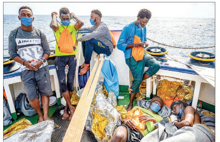
Migrants wait onboard the Sea-Watch 4 civil sea rescue ship, that is waiting for permission to run into a port, on sea between Malta and Italy, on 30 August 2020.

"Lampedusa can no longer cope with this situation. Either the government takes immediate decisions or the whole island will go on strike. We can't manage the emergency and the situation is now really unsustainable," Martello had earlier told ANSA. —AFP ■