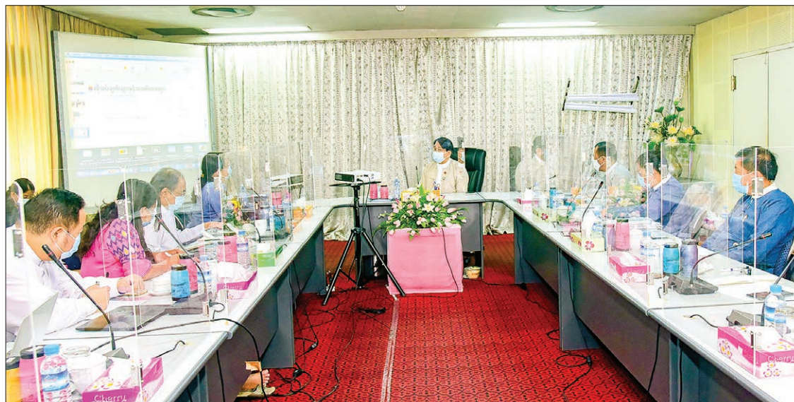
Union Minister Dr Pe Myint speaks during the meeting on development of Myanmar International Television (MITV) Channel on 31 August 2020.