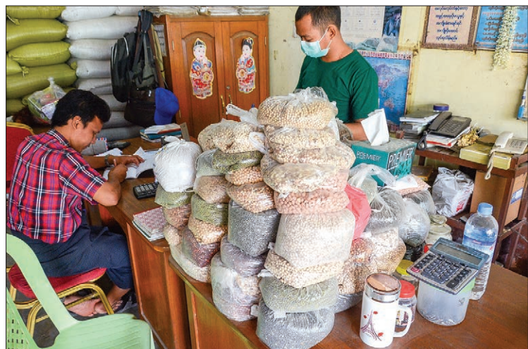
(FILES) A customer wearing face mask is paying purchased bean at a shop in Yangon on 9 May 2019. PHOTO: PHOE KHWAR