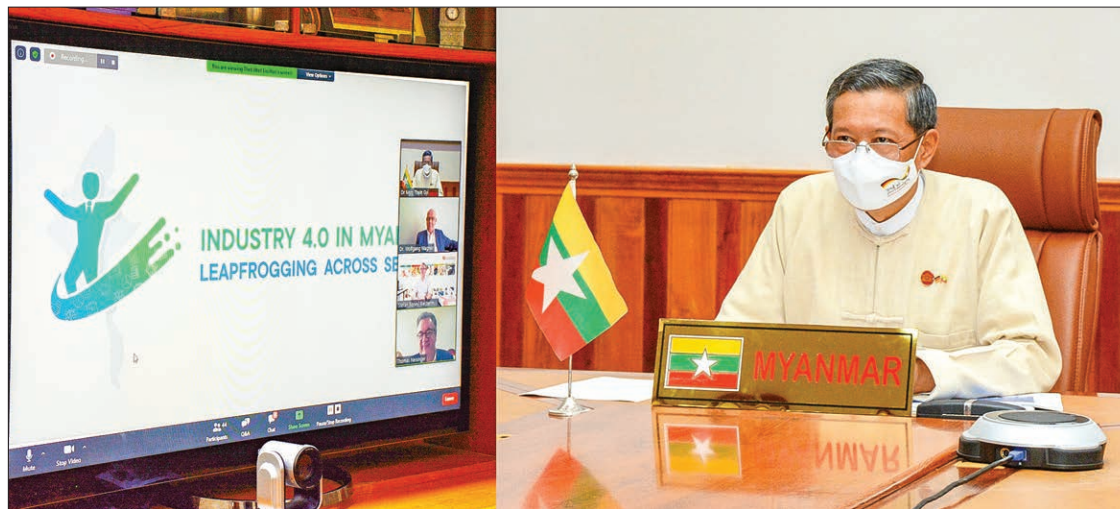
Union Minister Dr Myo Thein Gyi participates in 'Industry 4.0 in Myanmar' online discussion on 31 August 2020.

He continued to say that although Myanmar has seen more