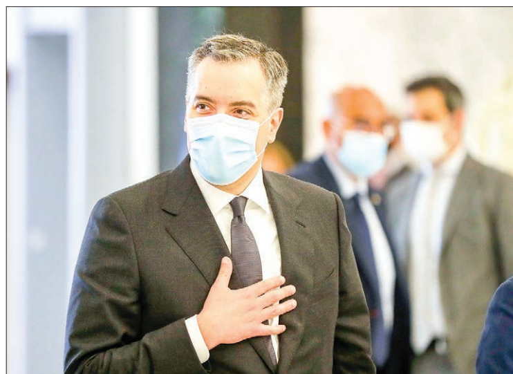
Lebanon's ambassador to Berlin Mustapha Adib (C) arrives at the presidential palace in Baabda, east of Beirut, on 31 August 2020, upon being named as the country's new premier.

"I want your trust," an AFP correspondent heard him tell