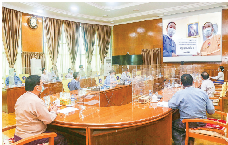
Union Minister Dr Win Myat Aye (L) joins the virtual ceremony to provide cash assistance for IDPs and elderly in Chin State on 31 August 2020.