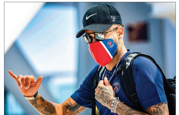
(FILES) In this file photo taken on 24 August 2020 Paris Saint-Germain's Brazilian forward Neymar leaves the team's hotel in Lisbon, a day after being defeated by Bayern Munich during the UEFA Champions League final football match.

PSG paid 222 million euros to bring him from Barcelona in 2017.—AFP