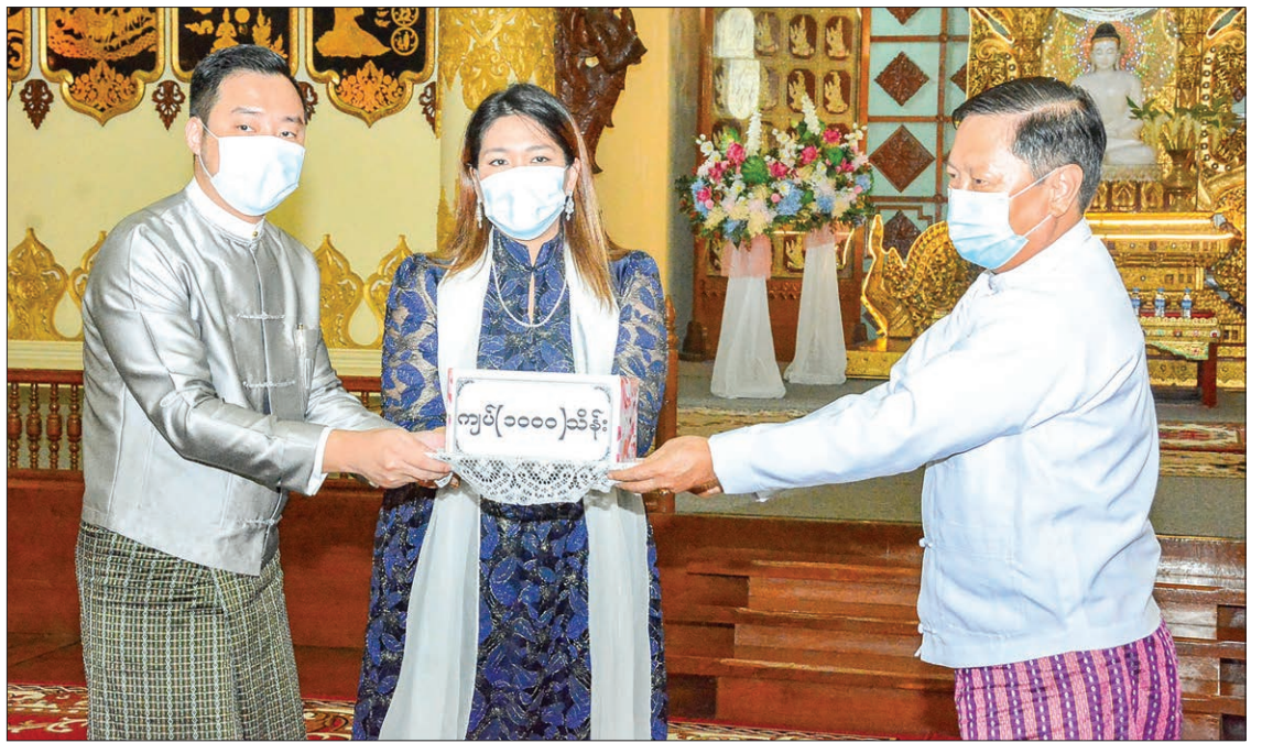
Union Minister Thura U Aung Ko accepts K100 million presented by a donor at the Wizaya Mingalar Dhamma Building at Kabar Aye Hill in Yangon 31 August 2020.

The well-wishers donated K405.5 million for the Eternal Peace Pagoda, K10,008,000 for renovation of monastery and K1 million fund for the religious exam winners. — MNA ■ (Translated by Zaw Htet Oo)