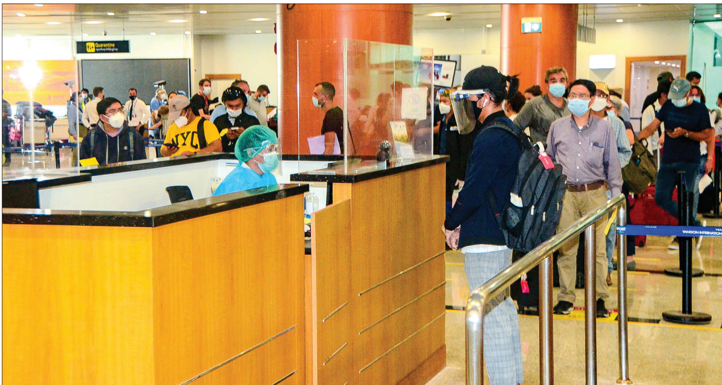
Myanmar citizens returned from abroad line up for immigration process at the Yangon International Airport on 31 August 2020.

MYANMAR people stranded in France, Spain, Belgium and Germany and some European countries arrived back home by a relief flight of Amelia Airlines yesterday.