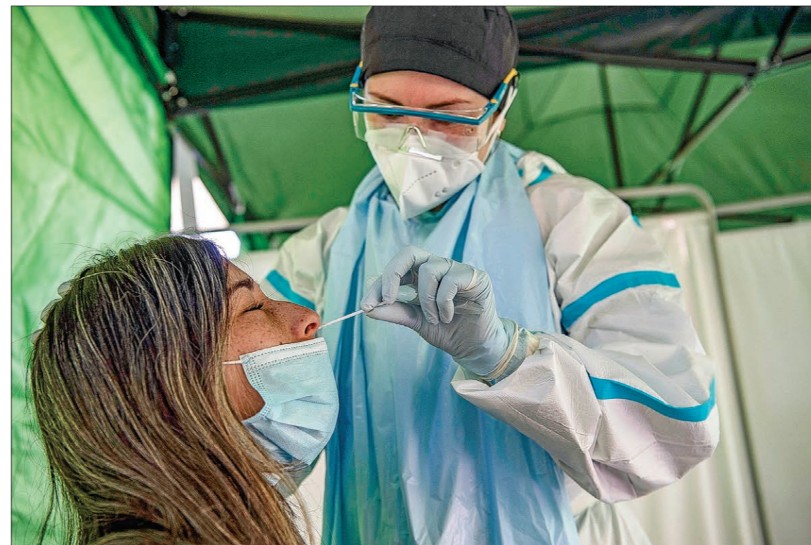
A woman undergoes a PCR test for the novel coronavirus at a control post in the municipality of Renca, Santiago on 26 August 2020.

German Chancellor Angela Merkel condemns as "shameful" an attempt by protesters angry at coronavirus restrictions to