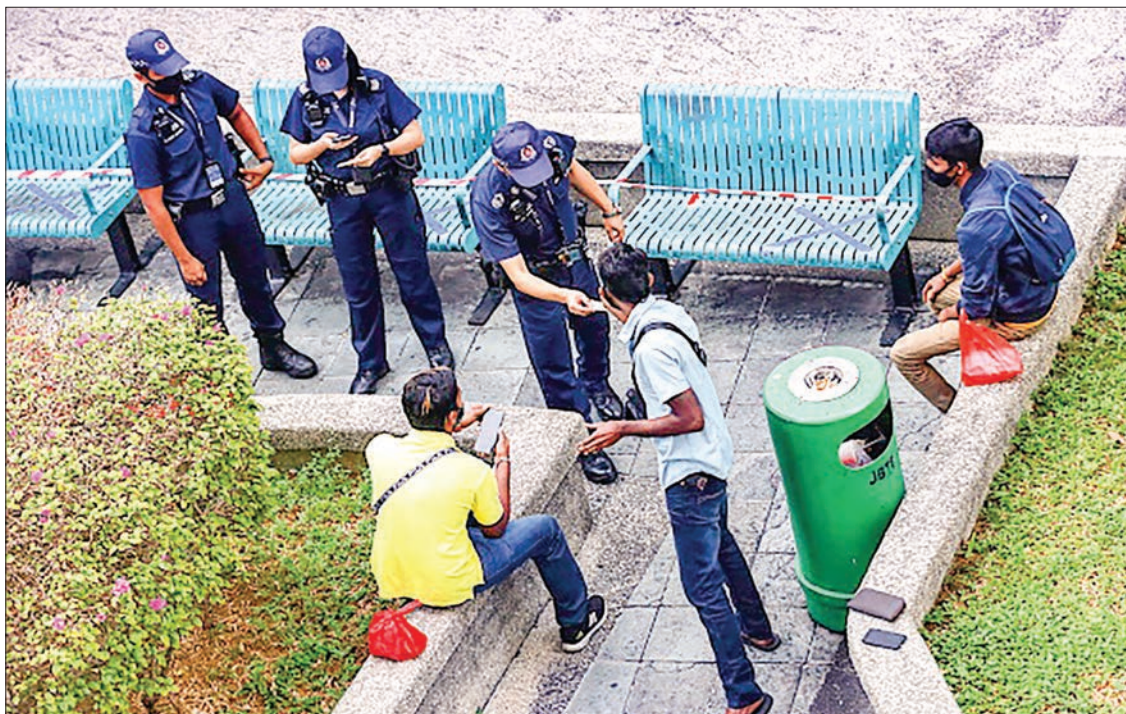
Police officers wearing protective mask conduct spot checks on April 21, 2020 in Singapore. Singapore Prime Minister Lee Hsien Loong announced today that the government will extend the partial lockdown until June 1 to bring down the coronavirus (COVID-19) cases within the community.