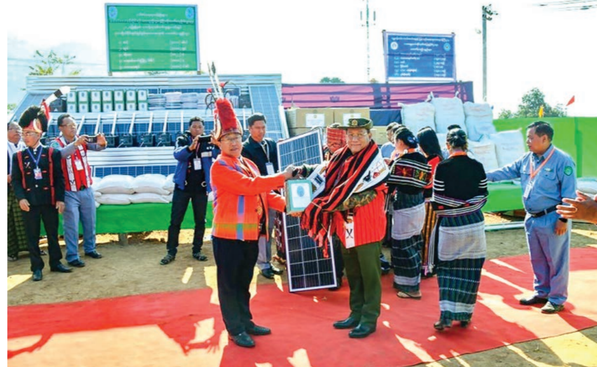
Union Minister Lt-Gen Ye Aung offering solar panels and other necessary utensils for Naga people at the Naga New Year Festival.

(1) Peace and Stability Objective with strategy 1.2 namely "Uplifting the socio-economic development in a conflict free