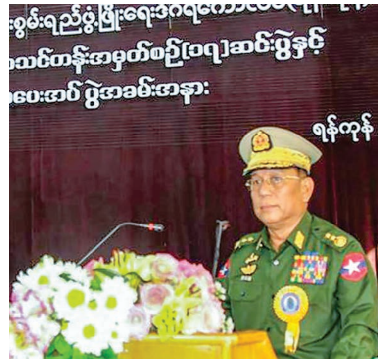
Union Minister Lt-Gen Ye Aung.

During the fourth year implementation, the achievements are recorded such as that of earth road 230 miles and 4 furlongs; that of the road expansion 39 miles and 4 furlongs; that of stumpy quality stone road 11 miles; that of common stone road 266 miles 2 furlongs; that of asphalt road 25 miles 5 furlongs; that of concrete road 5 miles 3 furlongs; that of road repair and maintenance 155 miles and one furlong; that of common bridges and small bridges 127 units; that of box culvert 830 in number; that of one state primary school; that of water supply facility one unit; that of water connection up to villages stretching 48 miles and one furlong; that of machine drill deep tube well 6 units; that of machine drill normal well 11 units; that of water container and storage one unit; that of brick water tanks 310 units; that