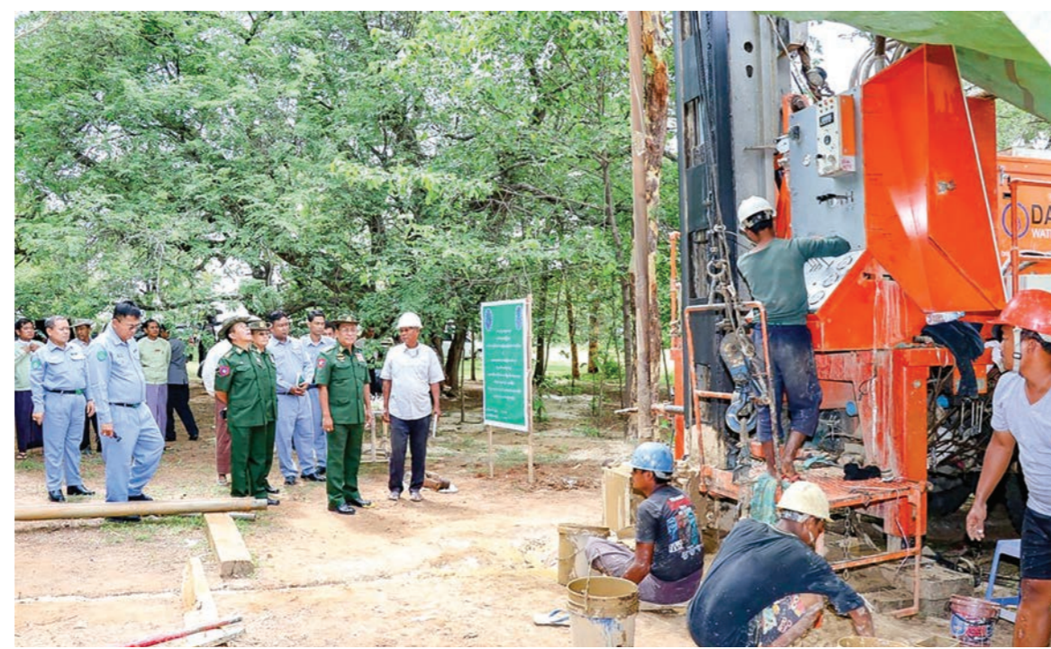
Union Minister Lt-Gen Ye Aung and officials observing the construction of deep wells by drilling machine for villages in Mandalay and Magway regions.