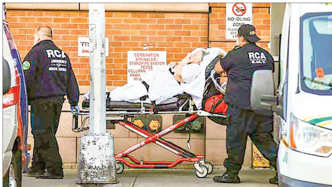
Medical workers transport a patient outside of a special coronavirus intake area at Maimonides Medical Center on April 21, 2020 in the Brooklyn borough of New York City.

Billions of people around the world have been ordered to stay at home in recent months