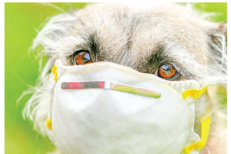
Canines can detect subtle changes in skin temperature, potentially making them useful in determining if a person has a fever.