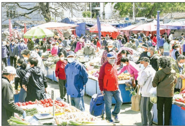
People visit a market in Beijing on April 20, 2020.

Heilongjiang, a northeastern province on the border with Russia, has become the epicenter of the second wave of infections in China, confirming 57 additional symptomatic COVID-19 patients in the past 10 days.