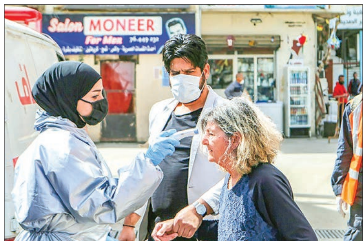
Aid groups have warned that hundreds of thousands of Palestinian and Syrian refugees living in Lebanon's overcrowded camps are the most vulnerable amid the COVID-19 pandemic.

There is controversy over the magnitude of the coronavirus outbreak in Iran, which according to official figures has left almost 5,300 people dead although other sources inside and outside Iran insist the real figure is twice as high.—AFP ■