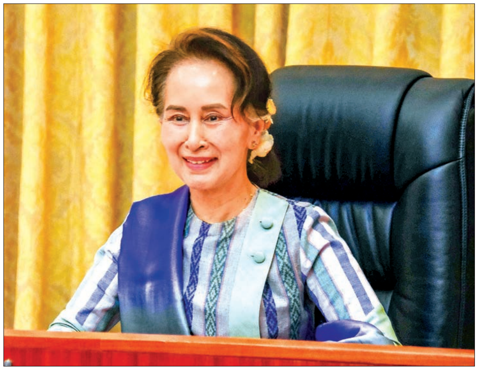
State Counsellor Daw Aung San Suu Kyi holds the video conference with stakeholders from labour and industry sector.

STATE Counsellor Daw Aung San Suu Kyi, in her capacity as the Chairperson of the National Central Committee for COVID-19 Prevention, Control and Treatment, held a video conference with representatives of the industrial sector and labour affairs from the Presidential Palace in Nay Pyi Taw yesterday.