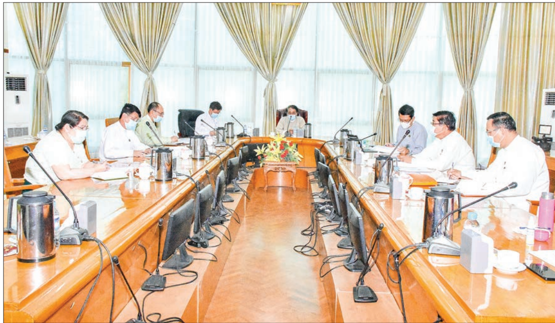
Union Minister Dr Than Myint holds the meeting with businesspersons from Mandalay Region yesterday.

Before this online meeting, the associations concerned have made a series of discussions on the rice reserve scheme. The minister called for details that underline the fair price and fair quality of reserve rice and plans