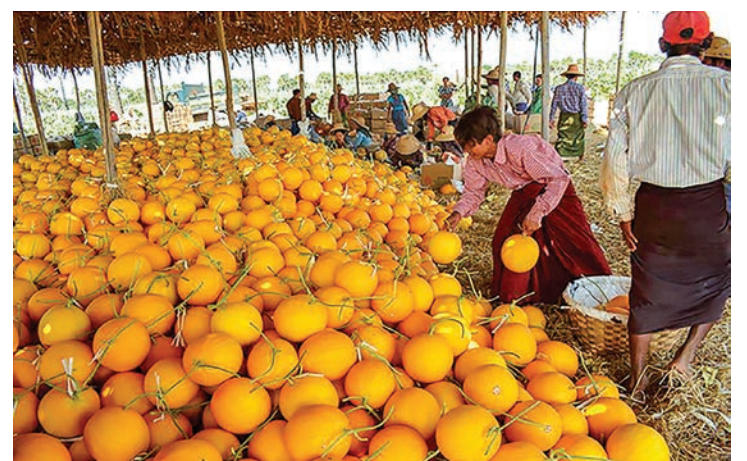
Farmers collecting melon; fruits with export criteria are distributed in the domestic market.