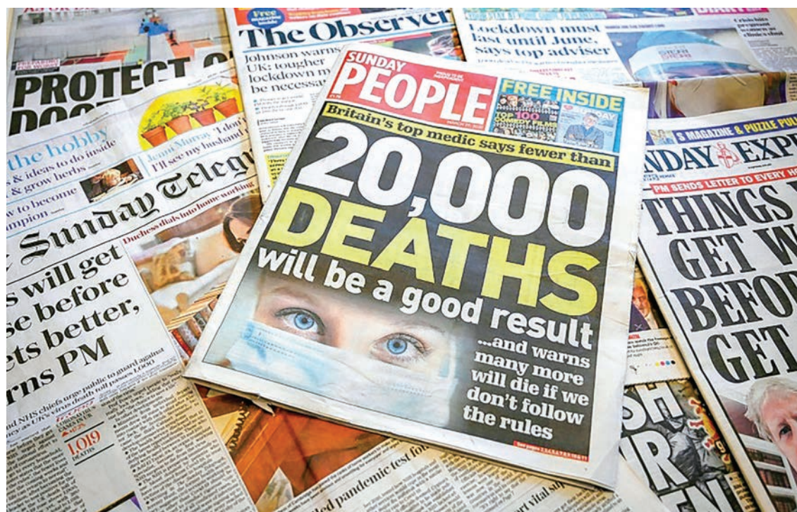
Britain’s culture secretary Oliver Dowden has warned the news industry could lose £50 million during the crisis, particularly as big firms had blocked online ads alongside stories on COVID-19.