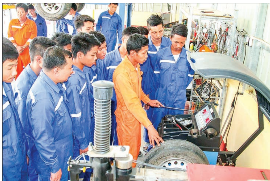
Trainees learning on the automotive and mechanical training course of the Border Areas National Races Youth Development Training School in Labutta.