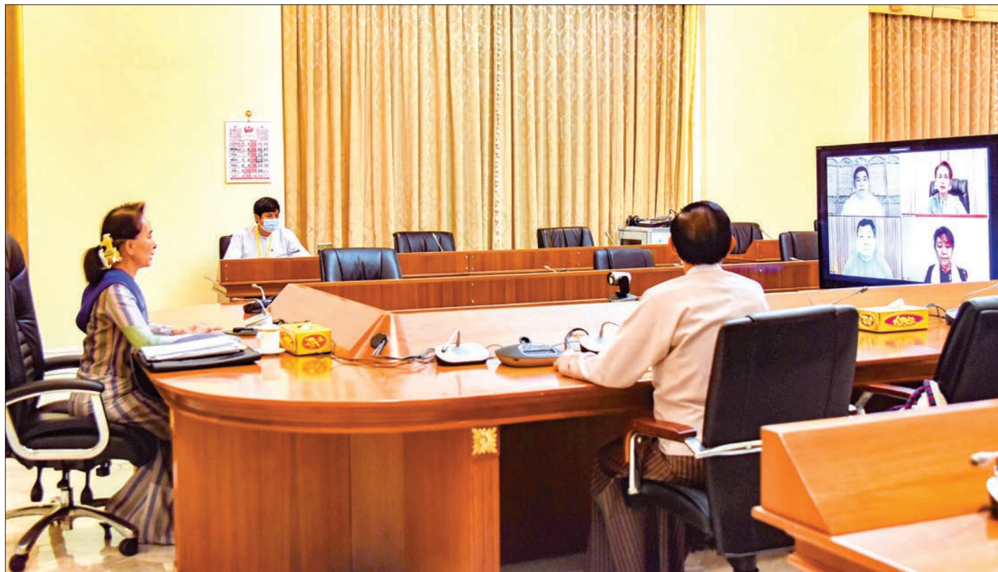
State Counsellor Daw Aung San Suu Kyi holds the video conference with stakeholders for factories and labour affairs.

She added that after immediate investigations had been taken, actions would