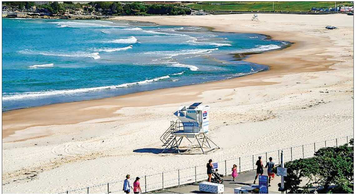
Swimmers and surfers will return to Sydney's famed Bondi Beach.

The Health Ministry said that the number of new cases in Singapore surged by 1,016, with nearly all occurring among low-paid migrant workers living in densely populated dormitories.