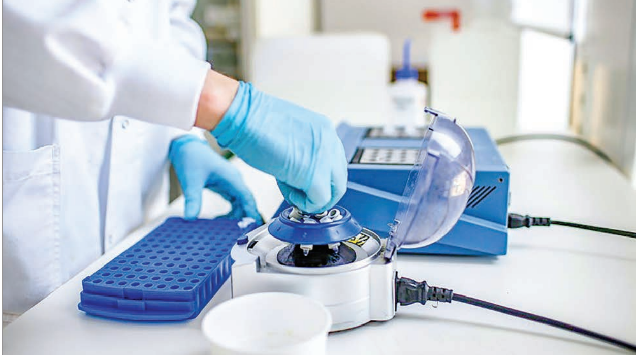
Clinical trials on vaccines against the new coronavirus COVID-19 were approved in Germany and launched in Britain.

In the first phase, it will see "200 healthy volunteers aged between 18 and 55 years" vaccinated with variants of the vaccine, while the second phase could see the inclusion of volunteers who belonged to high-risk groups.—AFP ■