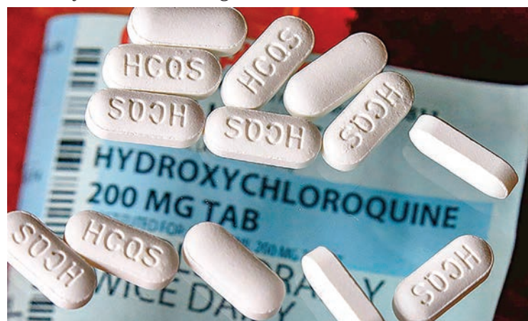
An arrangement of hydroxychloroquine pills in Las Vegas.