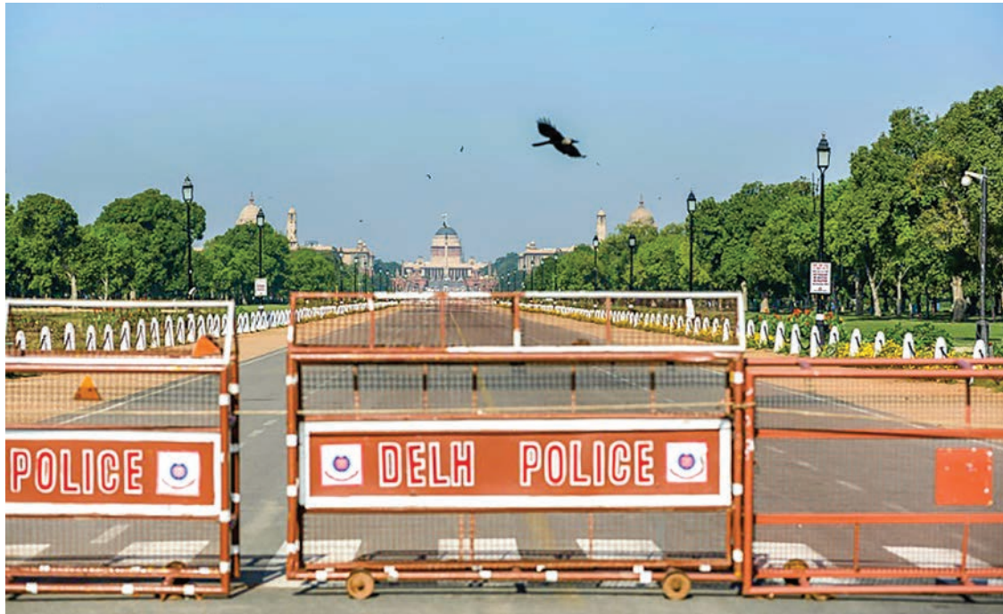
Clear skies can be seen over a deserted street near the Presidential Palace in Delhi as a result of the coronavirus lockdown.

RESIDENTS of Delhi, regularly listed as one of the world's most polluted cities, are revelling in azure skies and clean air as a result of the coronavirus lockdown.