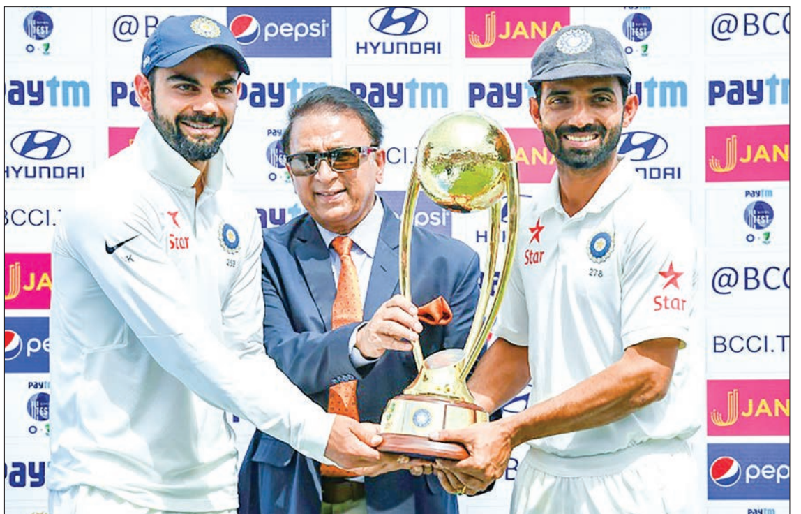
Sunil Gavaskar (C) said India and Australia should swap hosting rights for the 2020 and 2021 Twenty20 World Cups.

"If it (the swap) is going to happen that way then what can be done is that IPL is held just prior to T20 World Cup so there is enough practice for the players," said the 70-year-old Indian.—AFP