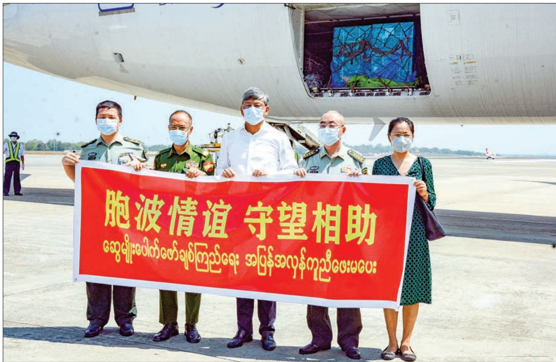
Donors from China hold the vinyl displaying the good friendship of Myanmar and China.

CHINA donated ventilators to aid the containment and treatment of COVID-19 in a ceremony at Yangon International Airport yesterday.