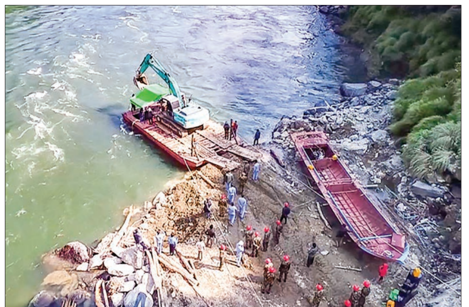
The hardware to be used for building a mountain road being carried by a Z-craft on the Maykha River.