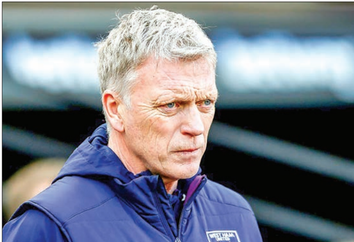
West Ham manager David Moyes.

LONDON (United Kingdom) —West Ham and Crystal Palace have announced they will not be travelling to Australia after the pre-season Queensland Champions Cup in July was postponed due to the coronavirus pandemic.