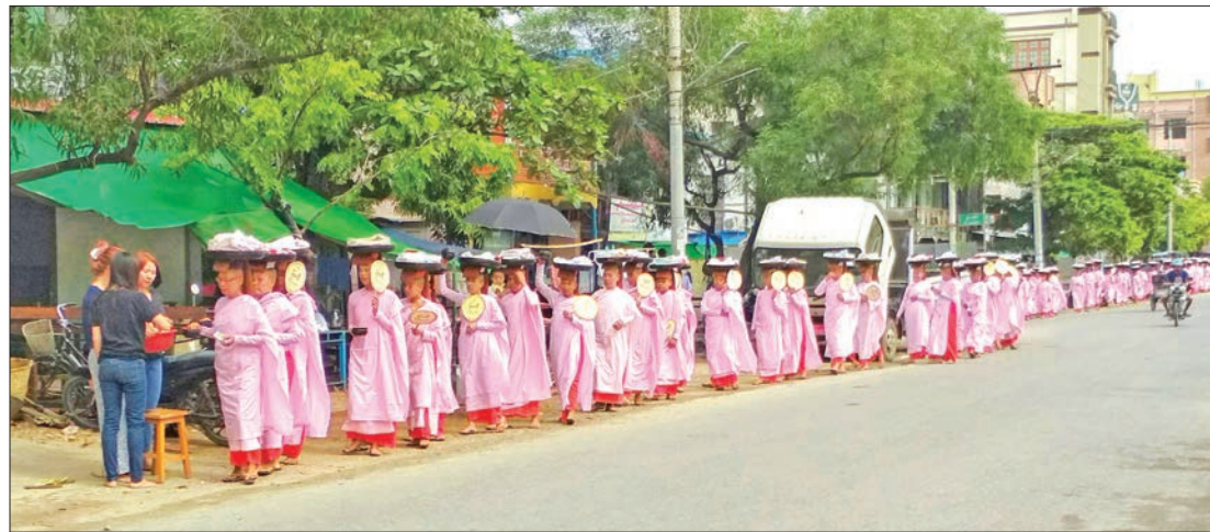
Devotees offer donations to nuns on Full Moon Day of Thadingyut.

TEN thousand lights festivals were held at Maha Muni Buddha Image, Kyauktawgyi Buddha Temple and Mandalay Hill's Pagoda yesterday at the night of Thadingyut full moon in Mandalay.