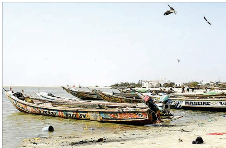
Many fishermen are forced to go far from the Senegalese coast, often in waters belonging to neighbouring Mauritania.

Cisse said fishermen should be provided with life vests, be registered, and be covered by a national surveillance and rescue network.—AFP ■