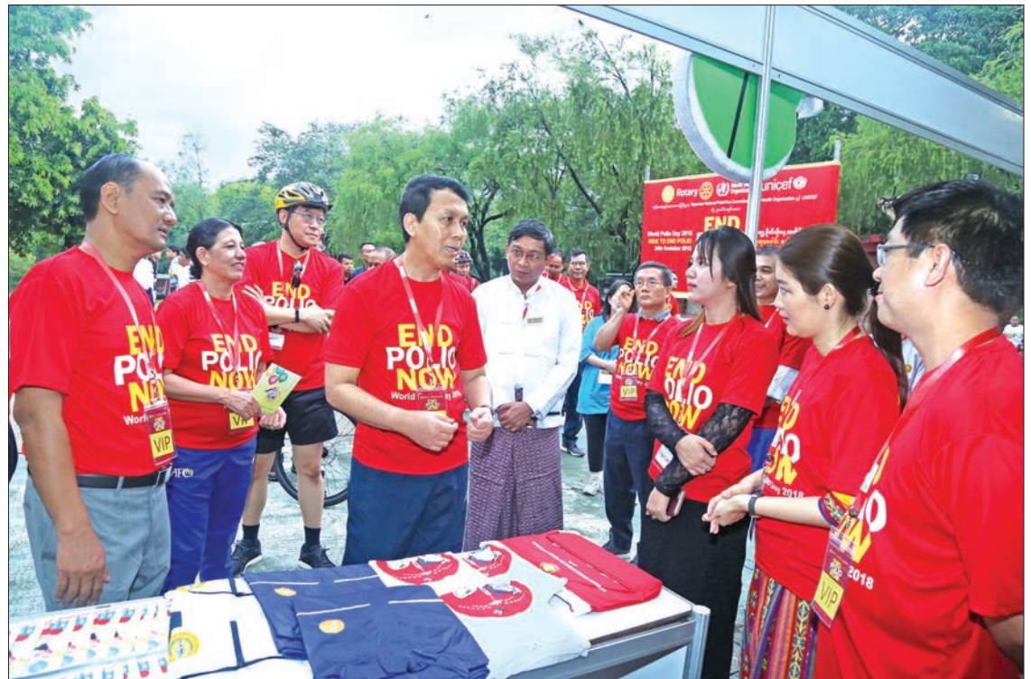
Yangon Region Chief Minister U Phyo Min Thein attends the cycling event to mark World Polio Day 2018 in Yangon yesterday.

The Ministry of Health and Sports responded very strongly to the prevention