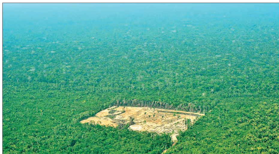
An aerial view of deforestation in the Western Amazon region of Brazil.

Bolsonaro has also several times evoked studies to build hydroelectric power stations in the Amazon, which implies the construction of massive dams that would greatly impact