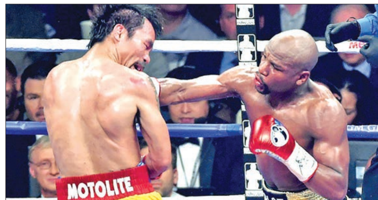
Floyd Mayweather (right) throws a right at Manny Pacquiao during their 2015 megafight in Las Vegas.