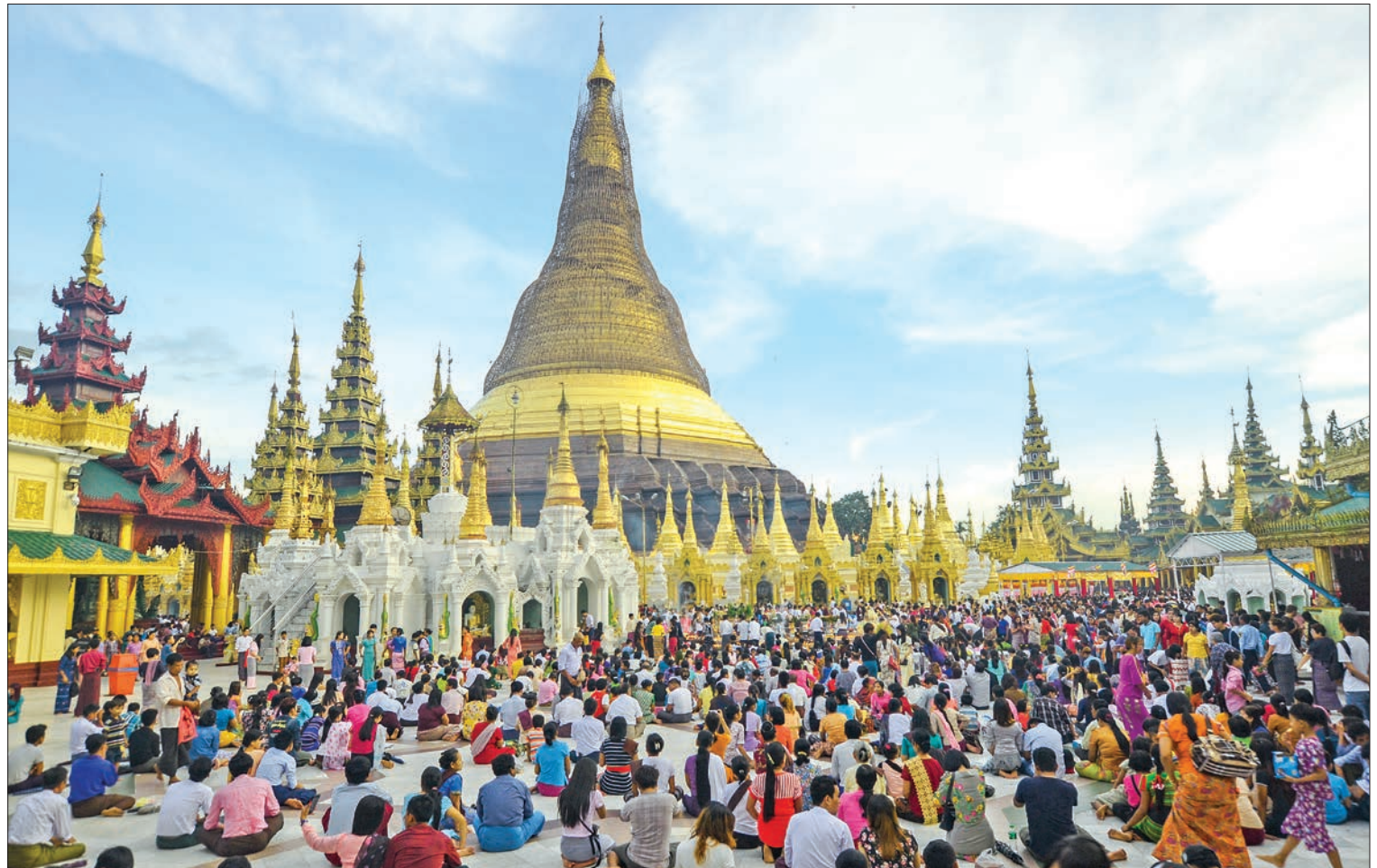
Buddhist devotees are seen at the Shwedagon Pagoda on the Abhidhamma Day yesterday.

Religious associations and people offered lights, food and flowers and recited religious verses celebrating the Abhidhamma Day since early morning yesterday at Maha