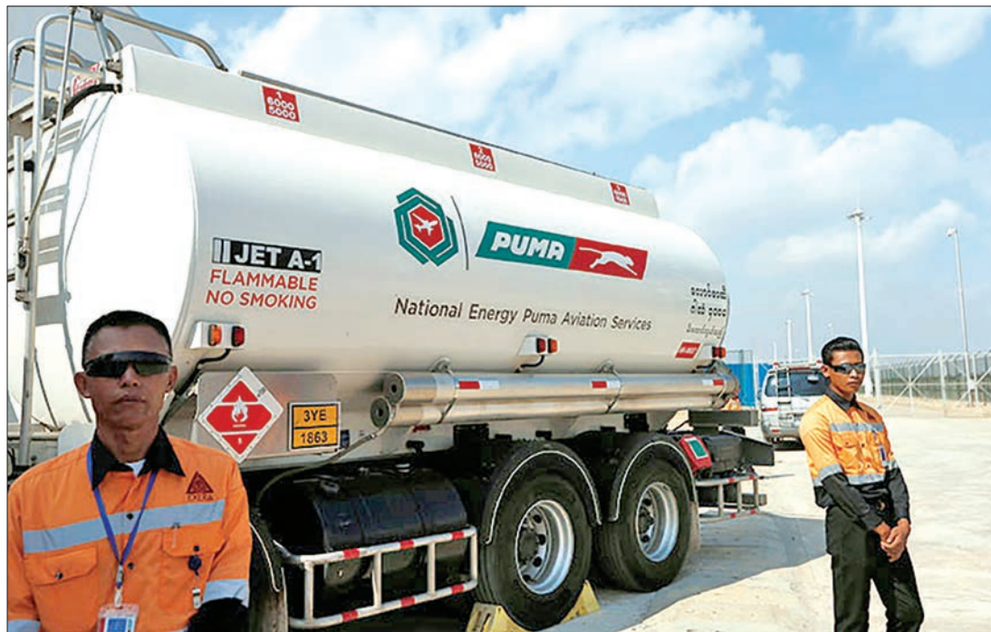
Security guards stand near a tanker carrying aviation fuel during the opening ceremony of Puma Energy fuel storage facility at Myanmar International Terminal Thilawa outside Yangon on 6 May 2017.

Interested job seekers from Upper Myanmar may join the fair free of charge. They are urged to bring a curriculum vitae. Registration for the event is available starting on 19 October through www.jobnet.com.mm . —GNLM ■