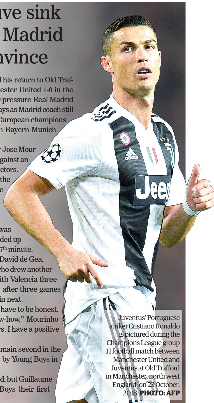
Juventus' Portuguese striker Cristiano Ronaldo is pictured during the Champions League group H football match between Manchester United and Juventus at Old Trafford in Manchester, north west England, on 23 October, 2018.

Michy Batshuayi put the Spaniards ahead, but Guillaume Hoarau's second-half penalty gave Young Boys their first point. — AFP ■