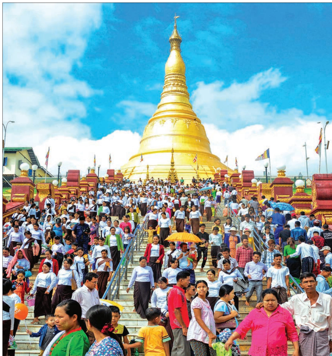
Devotees fill the Uppatasanti Pagoda in Nay Pyi Taw on full moon day of Thadingyut.

(Excerpt from the report on the current work of the government, delivered at the Pyidaungsu Hluttaw on 19 September 2018)