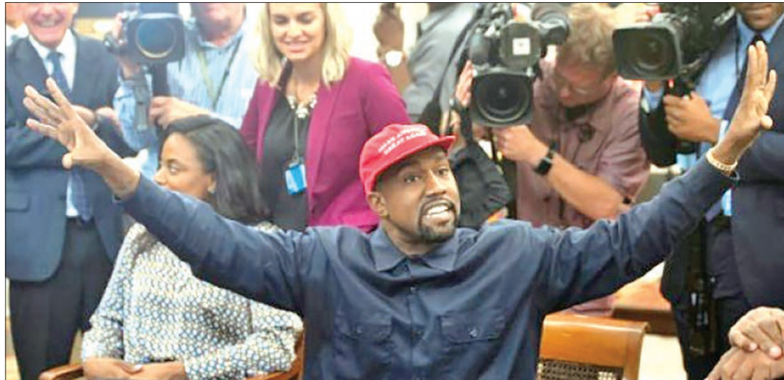
US rapper Kanye West, pictured meeting President Donald Trump in the White House on 11 October, 2018, is backing a candidate vying to be the first black woman to run Chicago.

go native and an outspoken activist in the city, last week endorsed Enyia — immediately raising her profile among a crowded field of contenders that includes a former Obama White House chief