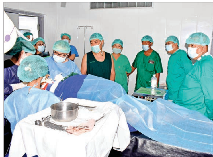
Rakhine State Chief Minister U Nyi Pu, second from right, observes a surgery in progress at Thandwe Hospital.

UNDER the supervision of the Ministry of Health and Sports and the Rakhine State Government, Thandwe District People's Hospital in Rakhine State is giving free medical treatments to patients till 25 October (today) with the efforts of 60 specialists and surgeons.