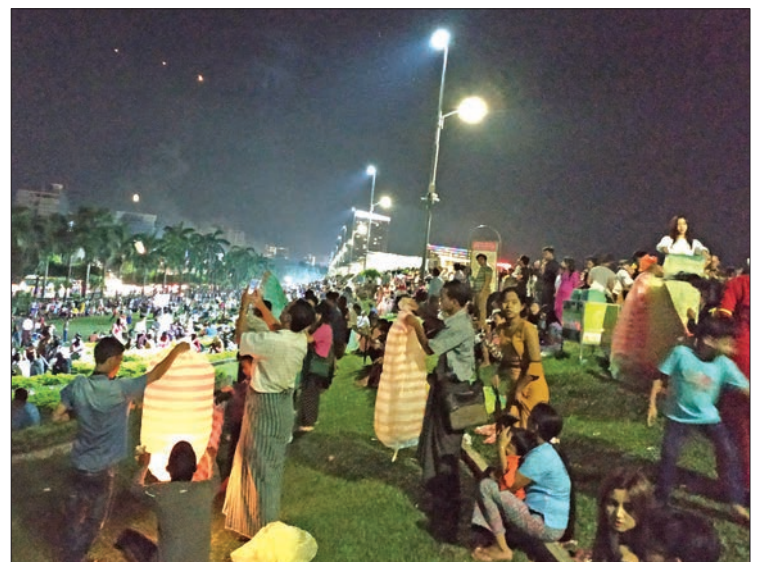
People take part in a Thadingyut Festival celebration in Yangon.