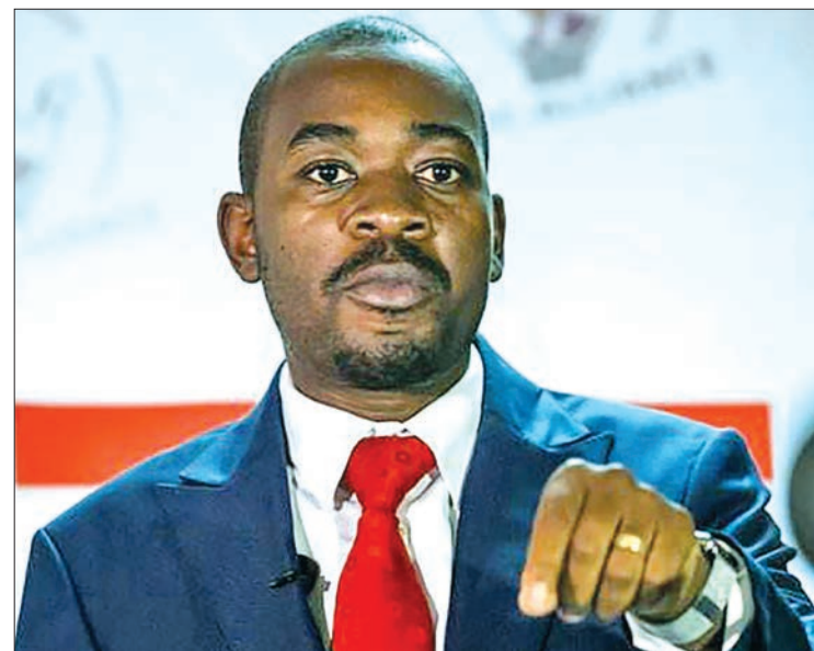
"We need a national transitional authority so that we resolve this crisis," said Zimbabwe's main opposition leader Nelson Chamisa.

AFP could not immediately confirm police had fired live rounds. The police meanwhile rejected the allegation.—AFP ■