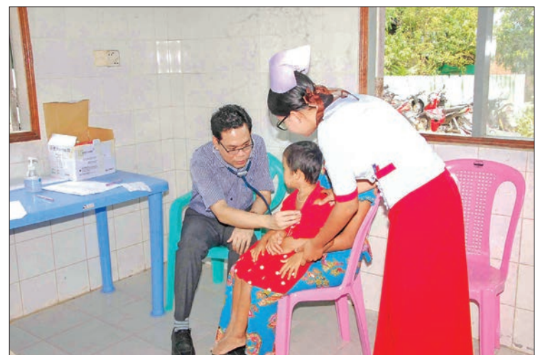
A patient receives medical check-up at Thandwe People's Hospital in Thandwe Township.