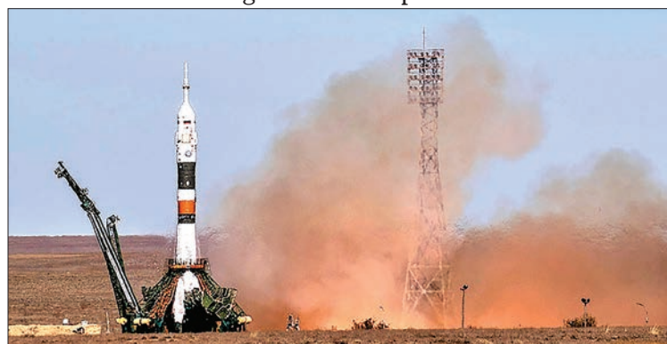
The panel is waiting for the results of a spacewalk and the examination of the hole in the hull, be determined after 30 October.

Originally, a spacewalk for examining the outer surface of Soyuz MS-09 was scheduled for 15 November. Roscosmos chief Dmitry Rogozin said that Russian cosmonauts would remove part of the anti-meteorite protective cover and examine the hole from the outside. The failed launch of the Soyuz-FG rocket on 11 October delayed the spacewalk.—Tass ■