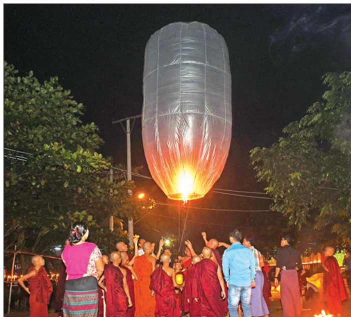
Monks and people set off a hot air balloon on the night of the Thadingyut full moon day. PHOTO: MNA

The Centenary of the conveyance of the 28 Buddha Images for public obeisance in Pyinmana and the Centenary of the Pyinmana Thadingyut Lights Festival were grandly held around the Shan Kan in Pyinmana Town. Shwe Lat Hla (Yan Aung Myin) Pagoda, Datusaya Pagoda, Sansara Nyein Aye Pagoda, Koe Khan Gyi Pagoda, Maha That Kya YanThi Pagoda and Thatta Thattaha Maha Bodhi Pagoda in Nay Pyi Taw Council Area are crowded with people at night.— MNA