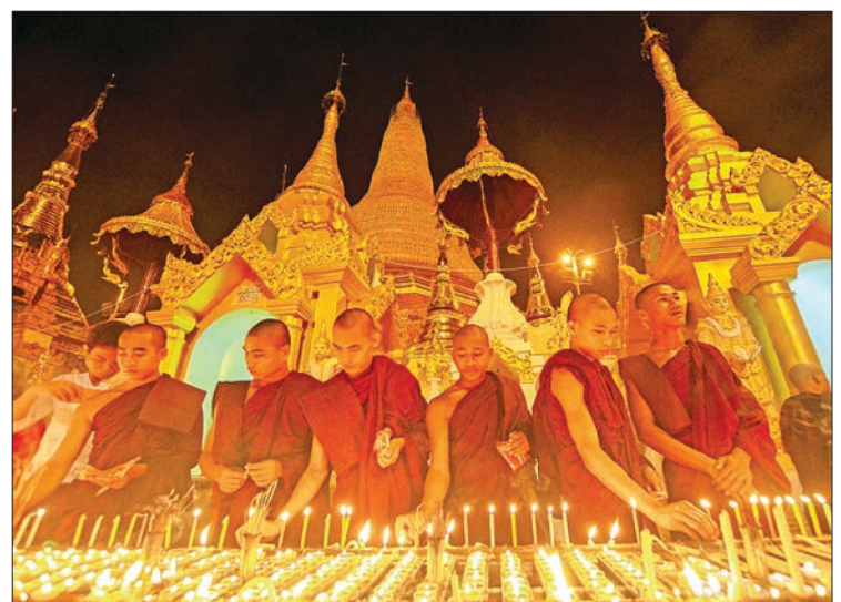
Monks and novices light candles on the night of the Thadingyut Full Moon at the Shwedagon Pagoda yesterday. PHOTO: PHOE KHWAR

Buildings are illuminated at night.—Yi Yi Myint ■