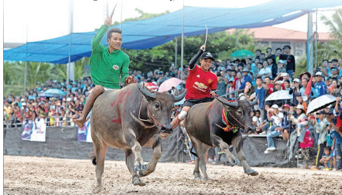
Jockeys ride buffaloes during the annual buffalo races in Chon Buri on 23 October, 2018.

But as farming became mechanised, buffaloes have taken on a symbolic role, acting as a reminder of Thailand's farming tradition.—AFP ■