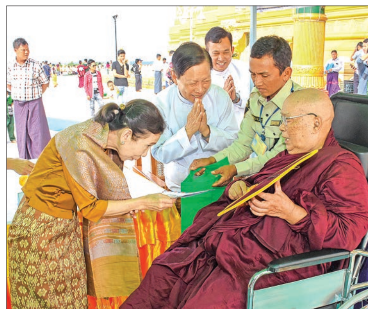
Union Minister Thura U Aung Ko and wife donate an offering to a Sayadaw at the Uppatasanti Pagoda in Nay Pyi Taw.