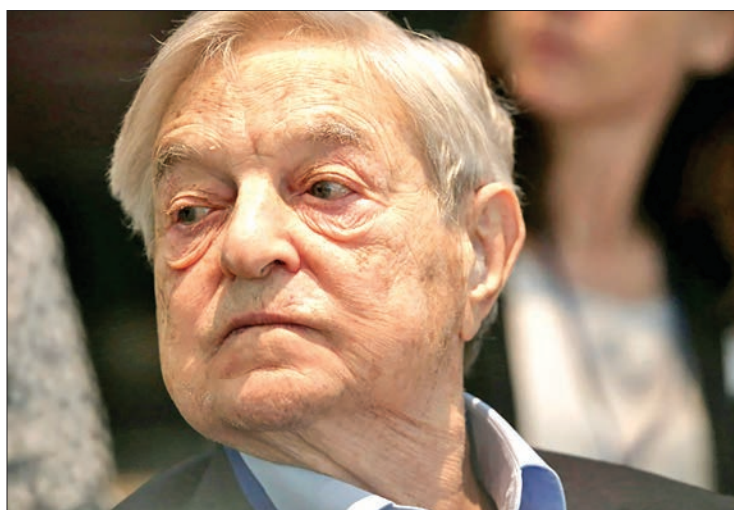
George Soros. An explosive device was left in the mailbox at billionaire investor George Soros' New York home.

He has given away billions to his Open Society Foundations, which promote freedom of expression, justice and equality, and