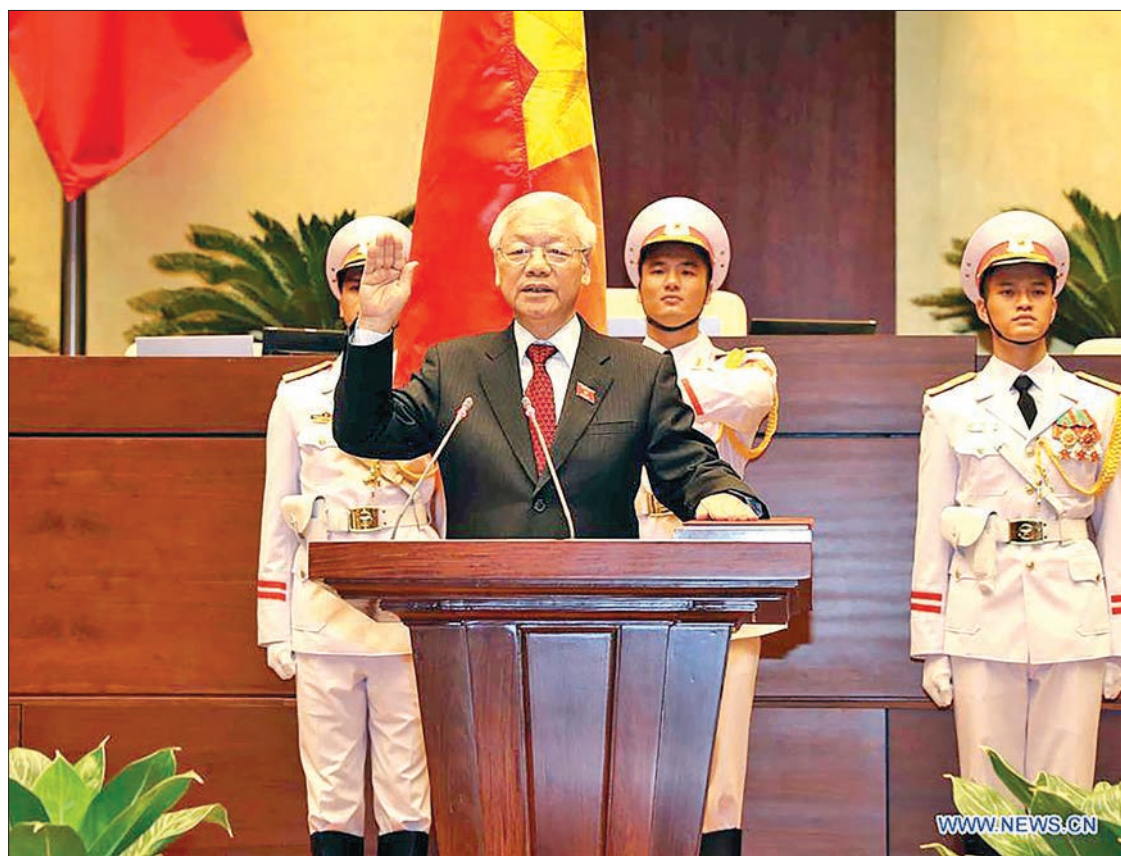
Viet Nam's newly elected President Nguyen Phu Trong (c, front) takes the oath of allegiance to the Constitution at the Parliament House in Hanoi, capital of Viet Nam on 23 October, 2018.

He has been a member of the CPVCC's Political Bureau since 1997. He served as chairman of the National Assembly from 2006 to 2011.