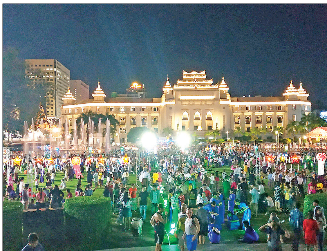
People take part in a Thadingyut Festival celebration in front of Yangon City Hall.