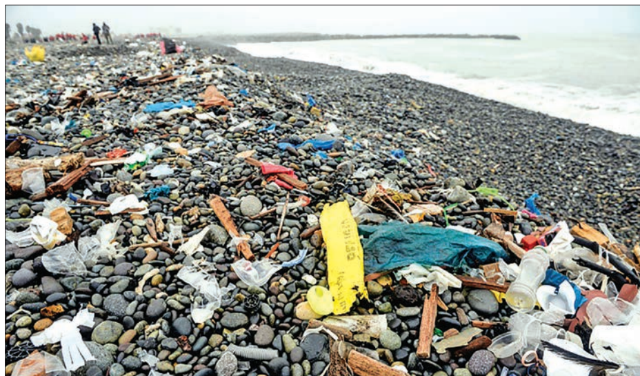
Global plastic production has grown to more than 400 million tonnes a year, and an estimated two to five percent of it winds up in the ocean.

“In our laboratory, we were able to detect nine different types of plastics,” said Bettina Liebmann, a researcher at the Federal Environment Agency, which analysed the samples. The two most common were polypropylene (PP)—found in bottle caps, rope and strapping—and polyethylene terephthalate (PET), present in drinking bottles and textile fibres.—AFP ■