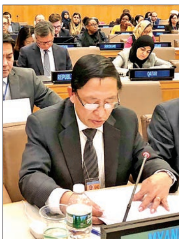
Permanent Representative of Myanmar to the United Nations Ambassador U Hau Do Suan.

Permanent Representative Ambassador U Hau Do Suan highlighted that the democratic government of Myanmar is convinced that lasting peace will be possible only when a democratic federal union is established by political means and ending of ethnic strife and armed conflicts is essential to realize this objective. The government