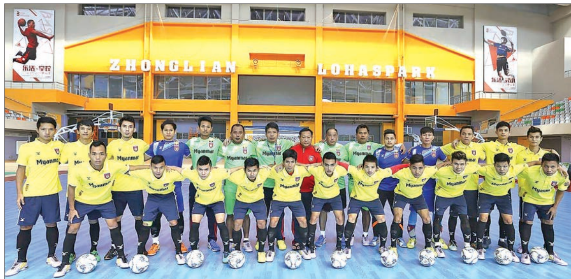
Myanmar Futsal players had a group photo together with coaches and managers in China.