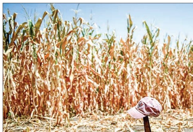
The corn crop affected by drought in Usulután, southeast of San Salvador in July, 2018.