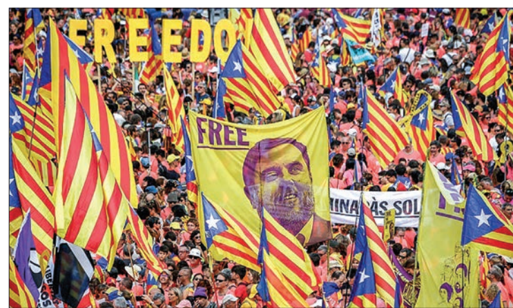
Protesters marched in Barcelona last month demanding the release of Oriol Junqueras who faces charges of rebellion along with eight other Catalan separatist leaders.

But the region’s former president Carles Puigdemont — who is also accused of rebellion over his role in the separatist drive and is in self-imposed exile in Belgium — is not among the group because Spain does not allow trials in absentia. Catalonia’s parliament declared independence on October 27 last year following a banned secession referendum that was marred by violence as national police sent in from Ma-