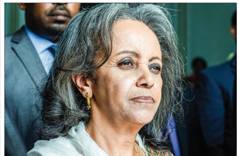
Career diplomat Sahle-Work Zewde has been Ethiopia's ambassador to France, Djibouti, Senegal and the regional bloc, the Intergovernmental Authority on Development (IGAD).

As president she is expected to serve two six-year terms. —AFP ■