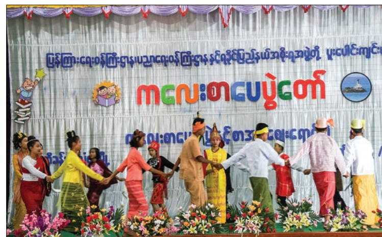
Participants entertaining with dances at the Dwayar Wadi Hall in Thandwe Township yesterday.