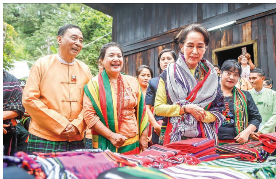
State Counsellor Daw Aung San Suu Kyi observes an exhibition showcasing Chin traditional textiles in Kanpetlet Town, Chin State.

Cong) National Park, the State Counsellor met with Chin State government members, Hluttaw rep-