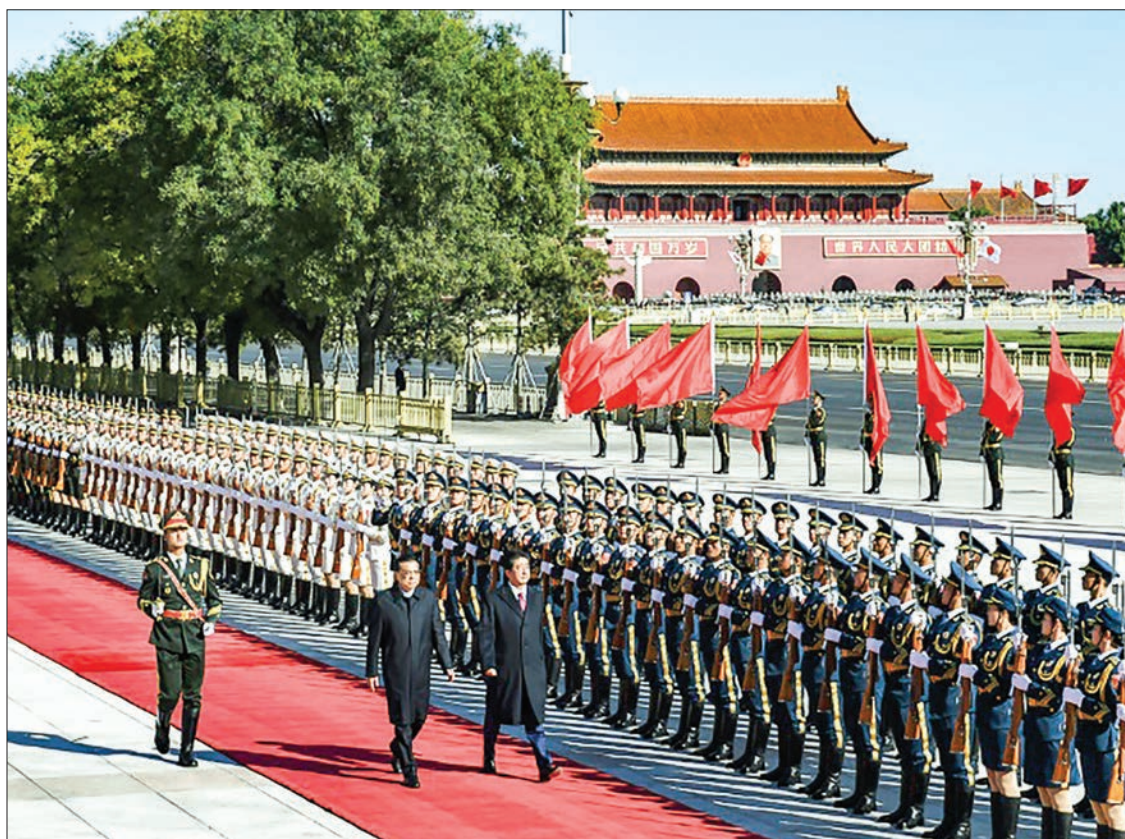
Ties between Beijing and Tokyo have rapidly warmed as Trump has slapped massive tariffs on China while also targeting Japanese exports in his effort to cut US trade deficits.