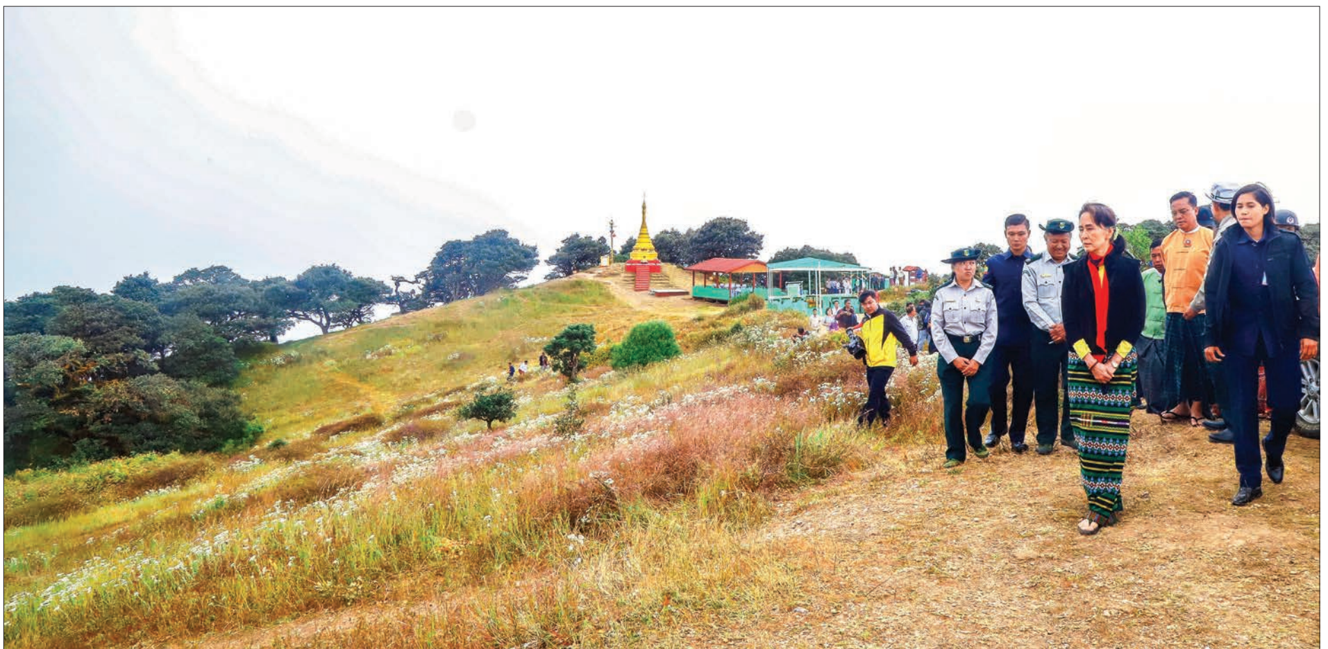
State Counsellor Daw Aung San Suu Kyi visits Natma Taung (Khaw Nu M' Cong) National Park in Kanpetlet Township in Chin State yesterday.

S TATE Counsellor Daw Aung San Suu Kyi visited Natma Taung (Khaw Nu M' Cong) National Park and traditional cultural exhibits in Kanpetlet Township, Chin State, and met with Chin State government members, Hluttaw representatives, town elders and officials yesterday.