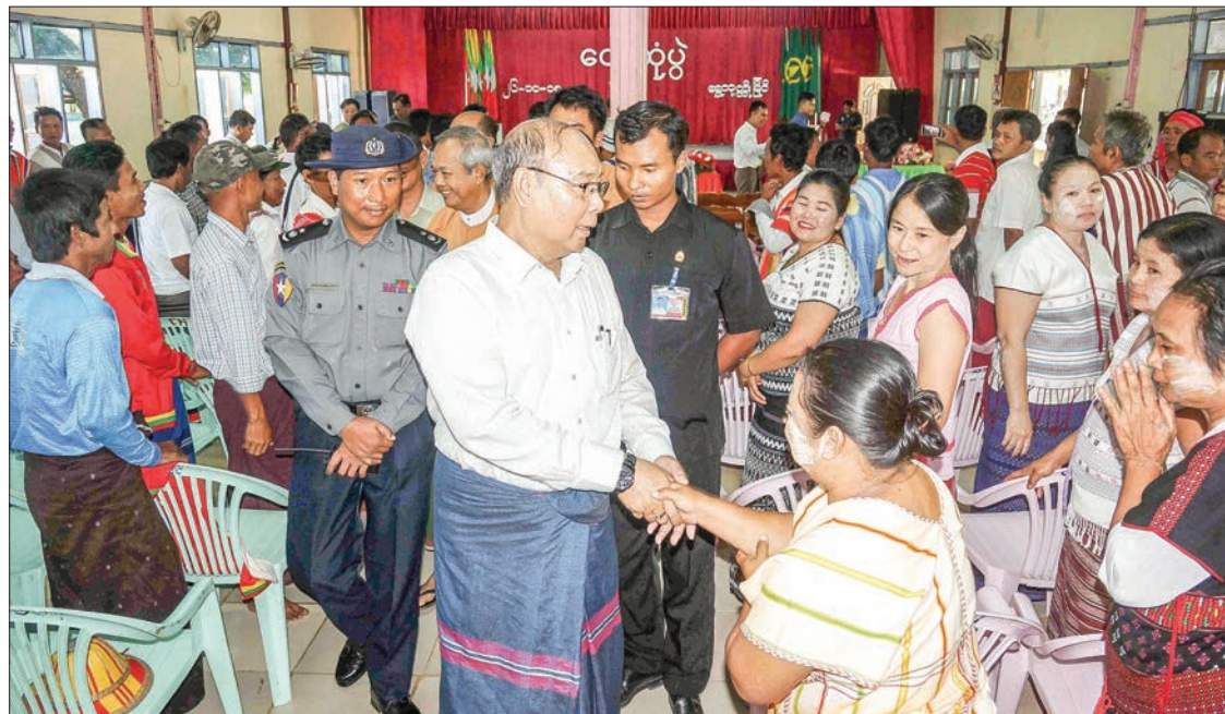
Amyotha Hluttaw Speaker Mahn Win Khaing Than meets with villagers from Shwe Koke Ko Myaing in Myawady District, Kayin State yesterday.

At the meeting Amyotha Hluttaw Speaker Mahn Win Khaing Than said he would explain about his experience in the Hluttaw during the Second Amyotha Hluttaw's first to ninth regular sessions so that the people would be fully aware about it. He would explain the stages of how a law came into being. The main responsibility of the Hluttaw was its legislative duty. The three pillars of administrative, legislative and judicial could also be seen in the Constitution. The three pillars do not interfere in the works of the other pillars but only check and balance the works of the other pillars, said the Amyotha Hluttaw Speaker.