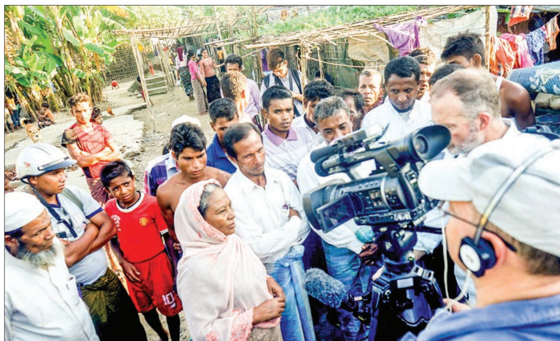
Journalists interview local people at Thet Kel Pyin Camp in Sittway yesterday.