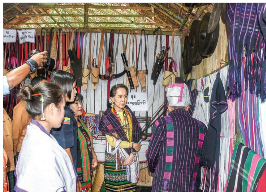
State Counsellor Daw Aung San Suu Kyi observes an exhibition showcasing Chin traditional artifacts and costumes in Kanpetlet, Chin State.