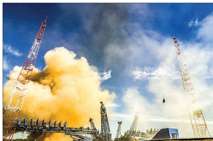
This is the third launch of the Soyuz-2 carrier rocket from the Plesetsk spaceport in 2018.

According to the defense ministry, all pre-launch operations were completed in the routine regime. The ground automated control complex oversaw the launch and flight of the carrier