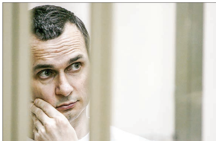
Sentsov is serving a 20-year term over an alleged arson plot in Crimea, which Russia annexed from Ukraine in 2014.

were addressed to Obama’s former vice president, Joe Biden, often rumored as a potential Democratic presidential candidate for 2020, in Delaware, the FBI confirmed. — AFP ■