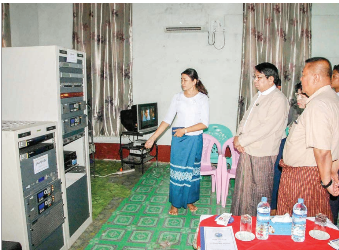
Union Minister Dr. Pe Myint inspects MRTV Re-transmitting Station in Thandwe yesterday.