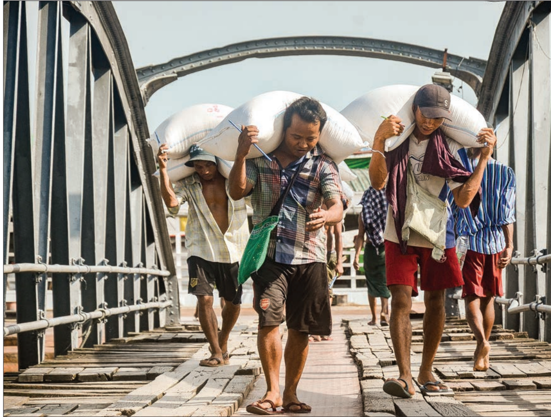
Workers carry bags of rice at the Botahtaung Jetty in Yangon.

U Than Oo added, "The rice market is not in good condition as the selling prices of rice and