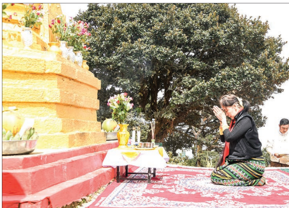
State Counsellor Daw Aung San Suu Kyi pays homage to the Zina Mann Aung Pagoda on the Natma Taung.