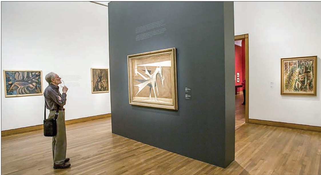
The first phase of the project will see participating physicians prescribe up to 50 visits to the MMFA during treatment, each pass valid for up to two adults and two minors.