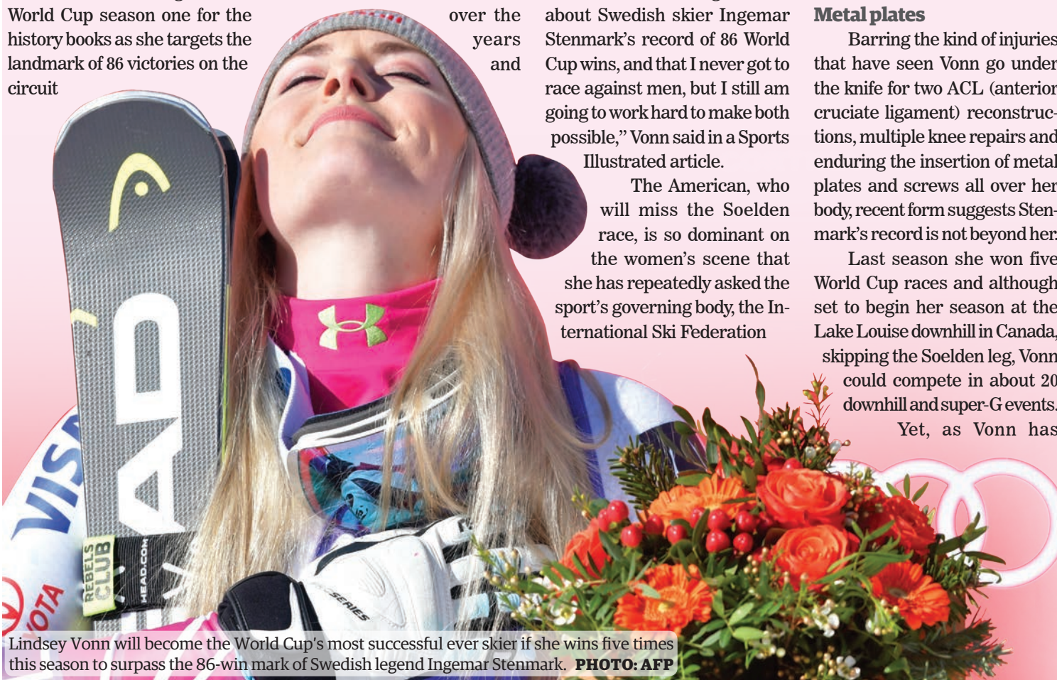
Lindsey Vonn will become the World Cup's most successful ever skier if she wins five times this season to surpass the 86-win mark of Swedish legend Ingemar Stenmark.

Hirscher has won a record seven World Cup overall crowns and, at the relatively tender age of 29, is expected to win an eighth on the men's circuit. A two-time Olympic champion who boasts four world titles and 58 World Cup wins, Hirscher evoked the possibility of retirement earlier this year before committing himself to another season of competition. — AFP ■