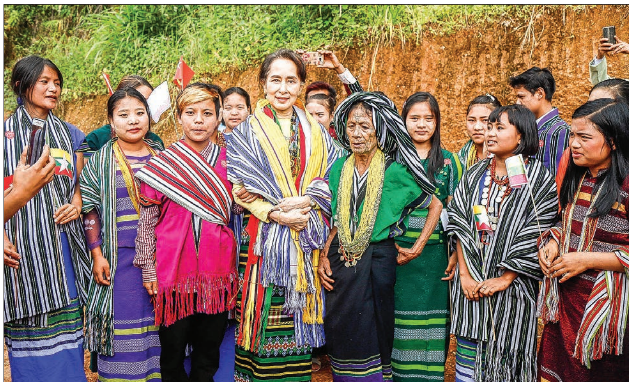
State Counsellor Daw Aung San Suu Kyi poses for a photo together with Chin ethnic people in Kanpetlet Town, Chin State yesterday.

After the meeting, State Counsellor Daw Aung San Suu Kyi and party left Chin State Kanpetlet Town by Tatmadaw helicopters for NyaungU, Mandalay Region, where they took a special flight and arrived back in Nay Pyi Taw in the evening. — MNA ■