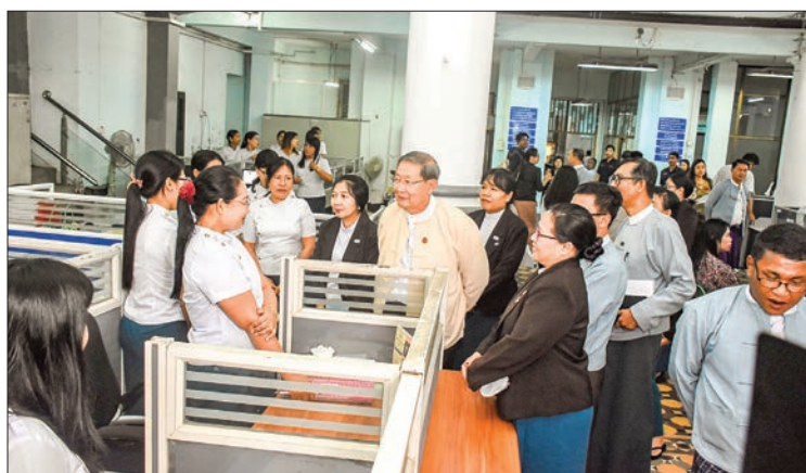
Union Minister U Soe Win greeting MFTB staffs in Kyauktada Township, Yangon yesterday.