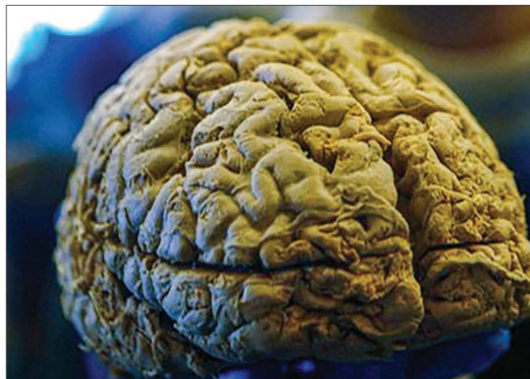
Exercises may improve memory through a bone hormone.

WASHINGTON — American researchers revealed how a bone hormone reversed memory loss in the aging brain in mice, lending new insights into how exercise could positively affect the brain.