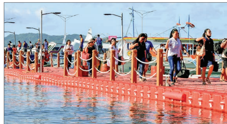
Tourists walk on a pier after arriving in Boracay Island on 26 October 2018.

The bold decision was implemented despite the expected economic loss and the direct impact on tens of thousands of workers and local residents. — Kyodo News ■