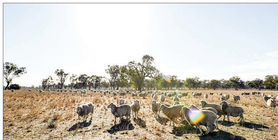
Eastern Australia has been hit by a crippling drought that has forced graziers to hand-feed their stock, sell them or even shoot them dead to stay afloat.

that in the east, home to important areas for livestock and crops, rainfall was 40 percent lower than the 20-year average. Even so, farm incomes were less likely to plunge as significantly as in previous drought periods amid "more favourable economic circumstances and other factors" such as improved productivity, ABARES said. —AFP ■