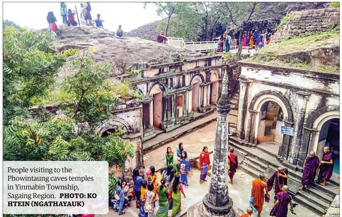
People visiting to the Phowintaung caves temples in Yinmabin Township, Sagaing Region.

Phowintaung is situated 15 miles away from Monywa Town, 7 miles away from Salingyi Town, 12 miles from Pathein-Monywa Road for Bagan-NyaungU-Pakokku