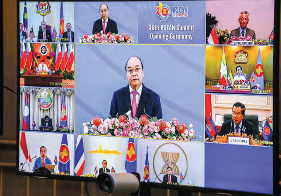
State Counsellor Daw Aung San Suu Kyi joins the virtual 36th ASEAN Summit yesterday morning from Ministry of Foreign Affairs, Nay Pyi Taw.

AW Aung San Suu Kyi, State Counsellor of the Republic of the Union of Myanmar participated in the Opening Ceremony of the 36th ASEAN Summit, the 36th ASEAN Summit and ASEAN Leaders' Special Session on Women's Empowerment in the Digital Age which were held via videoconferences yesterday at 8 am from the Ministry of Foreign Affairs, Nay Pyi Taw.