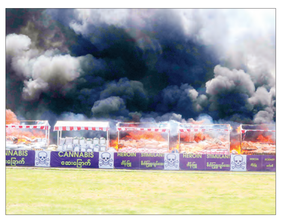
Seized narcotics are torched in Mandalay on 26 June.