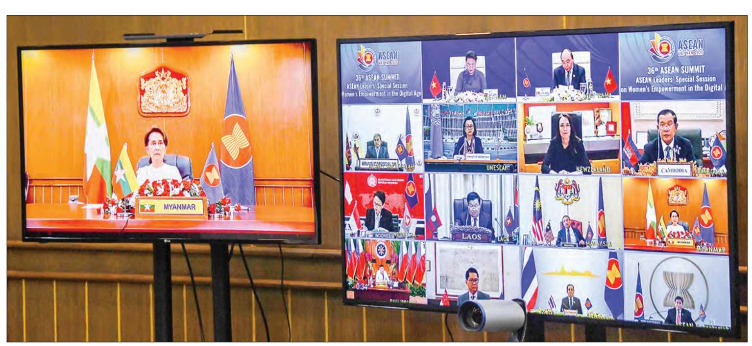
State Counsellor joins the virtual ASEAN Leaders' Special Session on Women's Empowerment in the Digital Age yesterday afternoon.