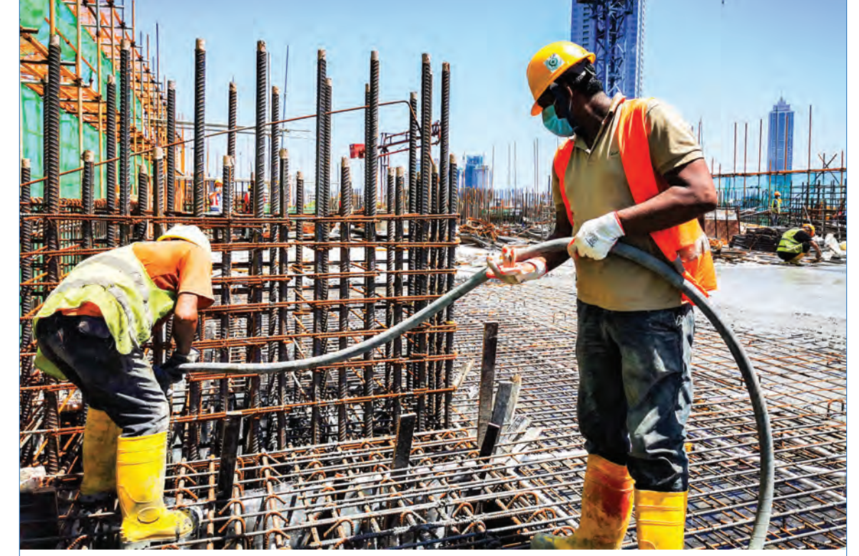
Photo taken with a mobile phone shows workers brought back to work by a tailored bus service at a construction site in Colombo, Sri Lanka, June 13, 2020.

"During the post COVID-19 recovery, when consumers pay more attention to how to keep fit and enhance immunity, our products will see a surge in the market Trincomalee, Kandy, Batticaloa