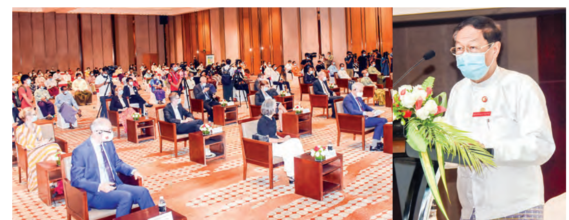
Union Election Commission Chairman U Hla Thein makes a speech at the Code of Conduct signing ceremony for political parties in Yangon on 26 June.