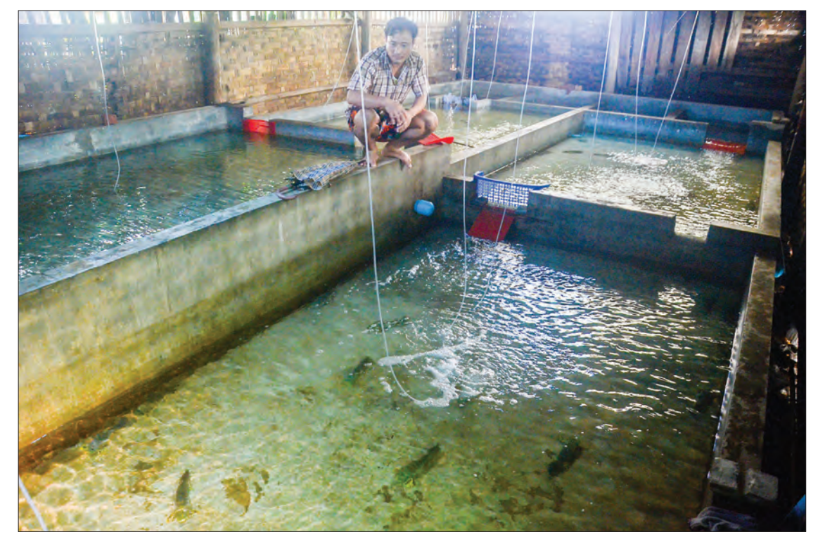
Restricitons on fish and prawn farmers wil be relaxed to grant permits after collecting fines.

THE fish and prawn farms will be issued with the legal permits after collecting a fine of