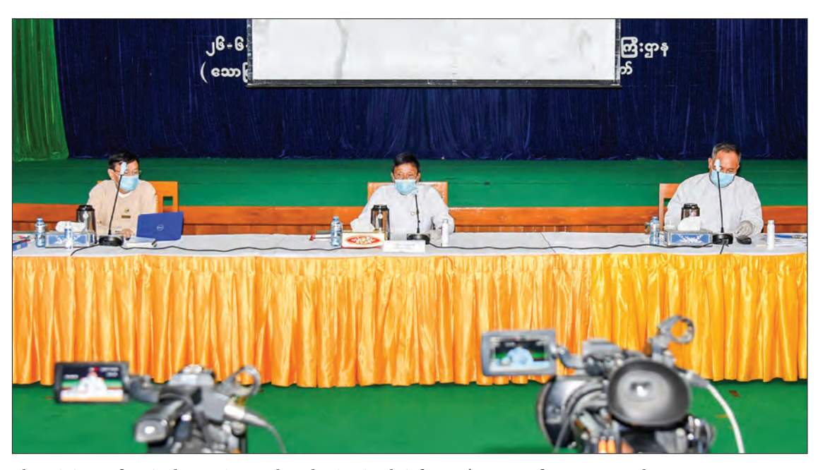
The Ministry of Agriculture, Livestock and Irrigation briefs on 4^{th} -year performances under present administration in Nay Pyi Taw on 26 June.

The government allocated K92.61 billion under the COV-ID-19 Economic Relief Plan for socioeconomic development of rural people. The Department of Agriculture will use the fund for paddy seed production, capital fund for villages; the Depart-