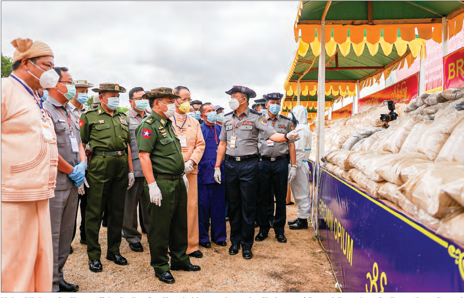
Union Minister for Home Affairs Lt-Gen Soe Htut, in his capacity as the Chairman of Central Committee for Drug Abuse Control (CCDAC) attends narcotics burning ceremony in Lashio, nothern Shan State, on 26 June.

Yangon Region government observed the drug burning ceremony at the truck terminal in Hlinethaya Township (west). Yangon Region Chief Minister U Phyo Min Thein attended the ceremony where 26 kinds of narcotic drugs and 2 kinds of related chemicals, including over 46 kilo opium, 23 kilo heroin, 47 million stimulant tablets, 2,982 kilo ice, 3,042 kilo opium agent and 515 kilo Ketamine, totally worth about K208.87 billion ($144 million), which were seized Yangon Region, Ayeyawady Region, Rakh-