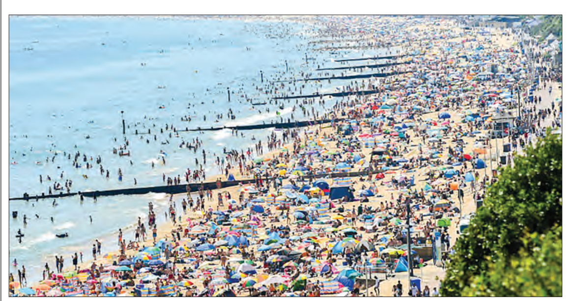
The arrival of thousands of people resulted in gridlock on the roads, widespread illegal parking and overnight camping as well as anti-social behaviour.

"It's lovely, obviously to have a little sunbathe, and the kids are happy, in and out of the sea," she told AFP. — AFP ■