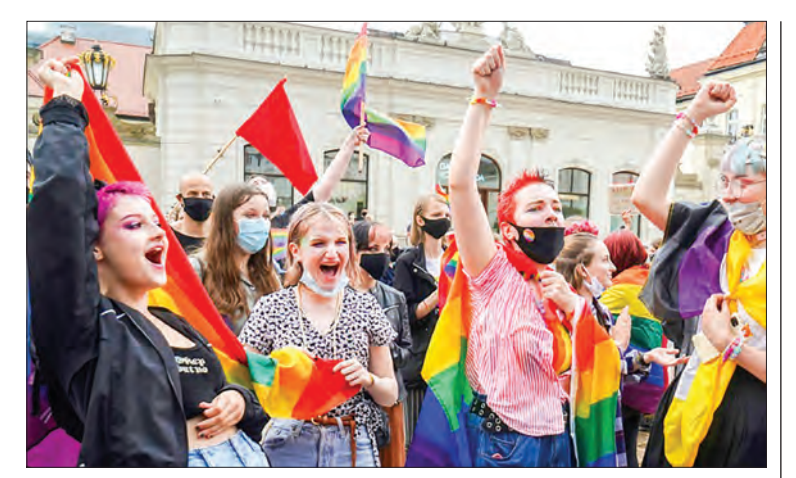
Duda's anti-gay rhetoric has sparked protests.