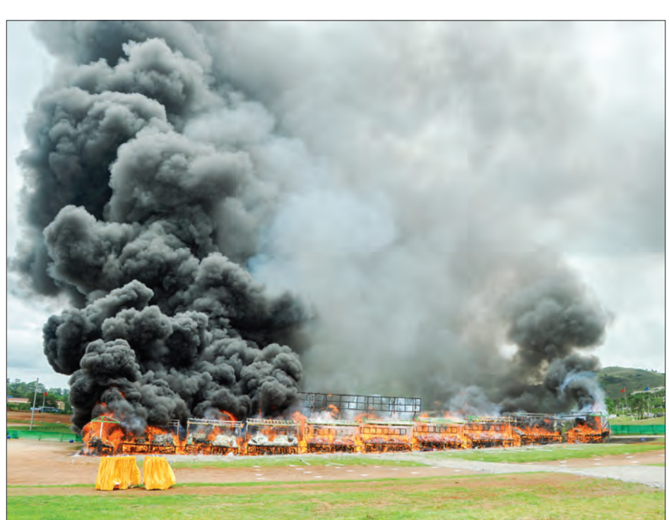
Illegal drugs were burnt in Taunggyi on 26 June.