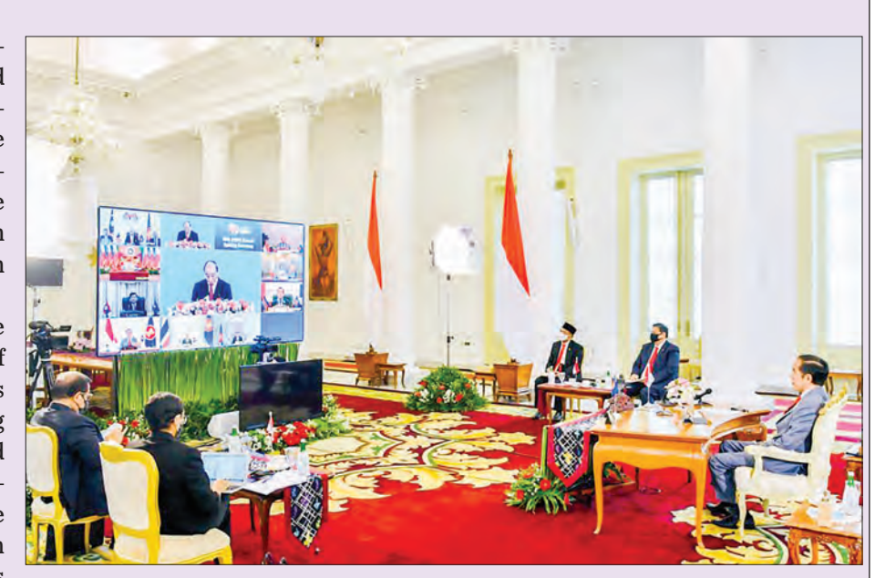
aders of the 10-member Association of Southeast Asian Nations "attend" their annual summit held virtually at Indonesia's Merdeka (Freedom) Presidential Palace due to the novel coronavirus pandemic.

They also agreed that besides consensus and consultation, integrated, strengthened coordina-