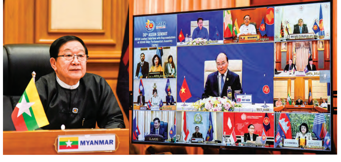
Speaker of the Pyidaungsu and Pyithu Hluttaws U T Khun Myat joins videoconference of ASEAN-AIPA Leaders' Interface on 26 June.

ASEAN leaders and AIPA members then discussed for the success of ASEAN's 2025 objectives after which Pyidaungsu