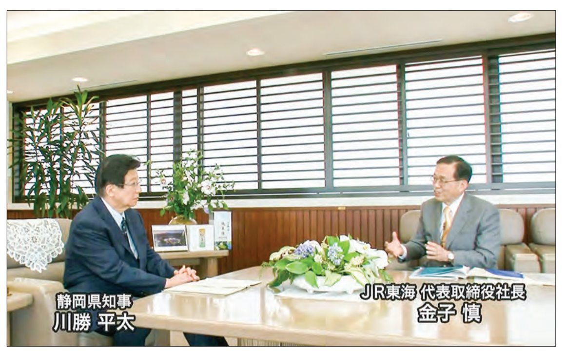
Supplied photo shows a video grab of Shin Kaneko (R), president of Central Japan Railway Co., in a meeting with Shizuoka Gov. Heita Kawakatsu at Shizuoka prefectural government office.

SHIZUOKA—Central Japan Railway Co.'s plan to open a high-speed maglev train line between Tokyo and Nagoya in 2027 was thrown into doubt Friday, as Shizuoka Gov. Heita Kawakatsu did not approve the start of preparatory construction work. During the first meeting with the governor of the central Japan prefecture, Shin Kaneko, president of the train operator also known as JR Central, sought Kawakatsu's consent to launch the work.