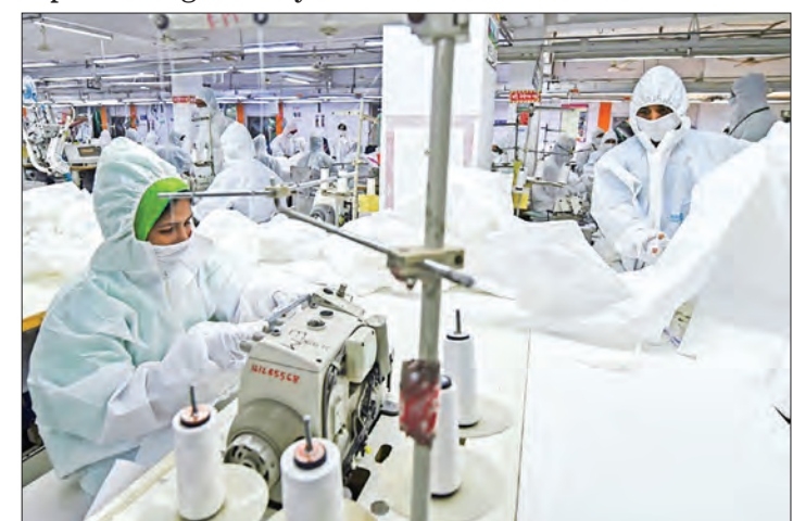
Bangladesh over the past two decades became the world's secondlargest ready-made garment exporter after China.

Beximco last month exported 6.5 million medical gowns to US brand Hanes and it expects to export some $250 million worth of protective gear this year.—AFP ■