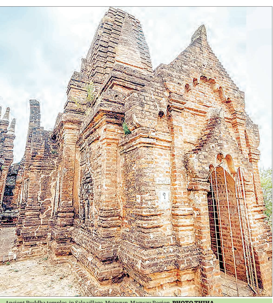
Ancient Buddha temples, in Sale village, Myingun, Magway Region.

may encounter an ox or cattle drawn farm cart. After the pagoda the road became a narrower earth and rock road so the going is a bit time consuming from thereon even though the distance wasn't very far. Some rains cause the road to become a bit muddy making the short trip harder and longer. During summer, the road could be dusty so be prepared for this too if you