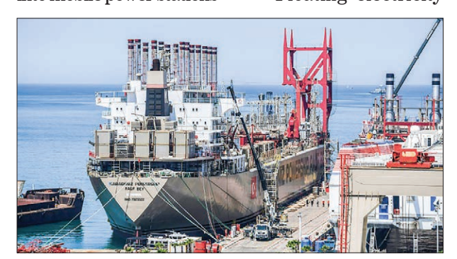
Floating electricity plants known as powerships come into their own when conflicts or other crises make the construction of land-based power stations difficult.

plants known as powerships come into their own when conflicts or other crises make the construction of land-based power stations difficult.