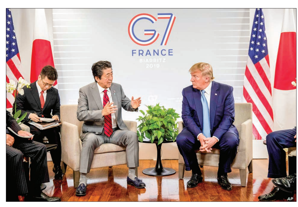
U.S President Donald Trump, right, and Japanese Prime Minister Shinzo Abe attend a bilateral meeting at the G-7 summit in Biarritz, France, Aug. 25, 2019.

The summit was initially scheduled for June but postponed to September due to the coronavirus pandemic.—ANI