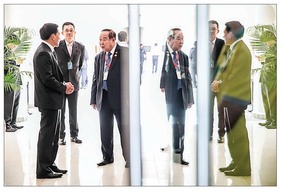
Thailand's Defense Minister Gen. Prawit Wongsuwon is seen at ASEAN defence ministers meeting plus 2015 on November 4, 2015 in Kuala Lumpur.

Prawit served in the military for four decades, rising to the position of commander in chief before retiring in 2005. — Kyodo ■