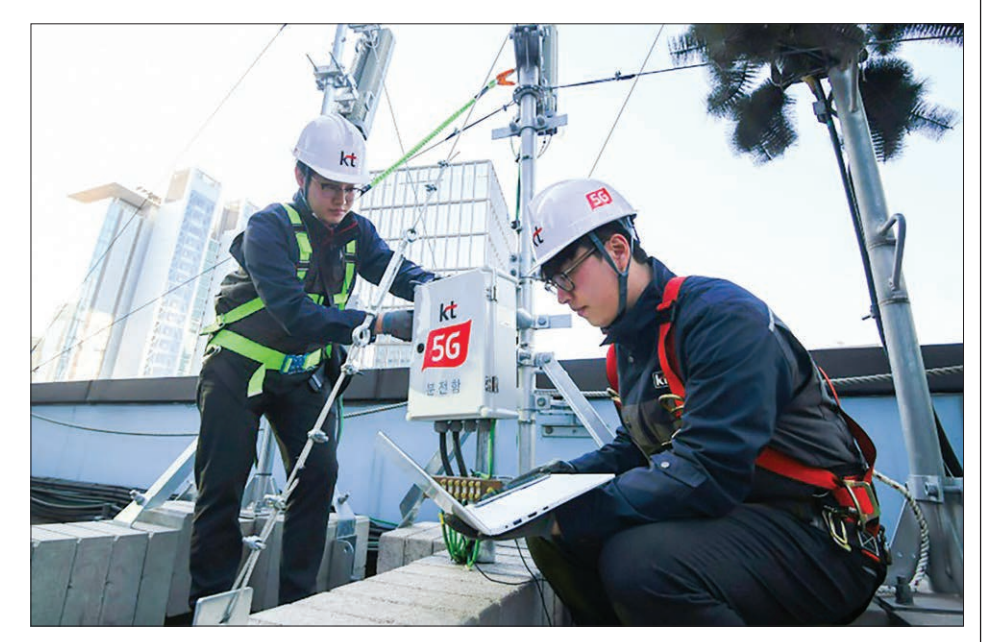
Technicians of South Korean telecom operator KT check an antenna for the 5G mobile network service in Seoul.

The government had already pledged to cut the firm out of the most sensitive "core" elements of 5G that access personal data, and is now reportedly pushing for plans to end Hua-