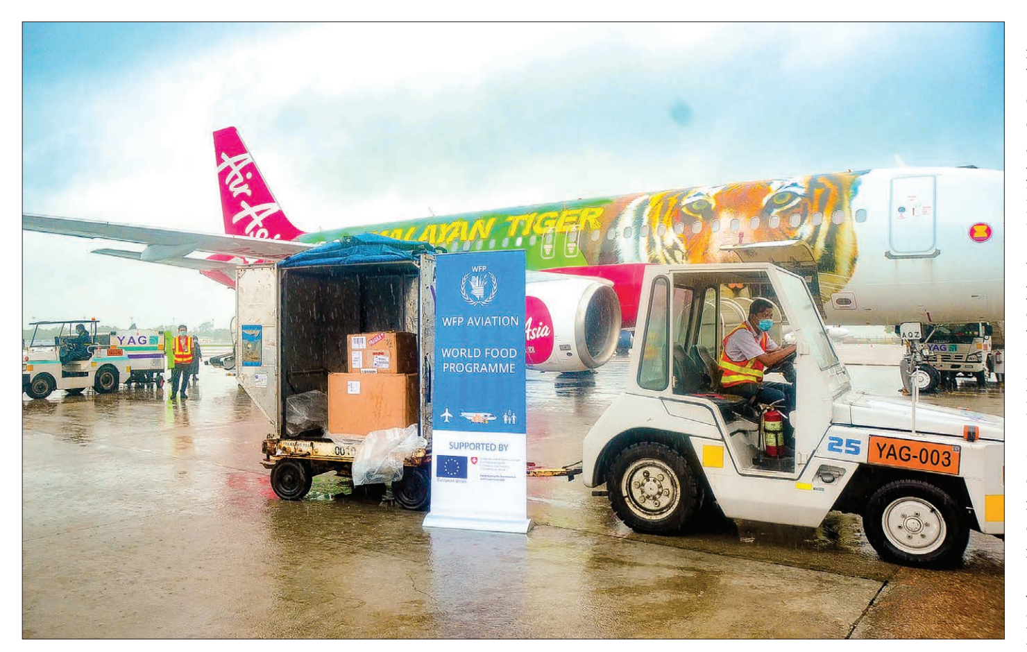
Workers unloading medical supplies from the special flight at the Yangon International Airport on 28 June, 2020.

PLANE carrying the World Health Organization's laboratory equipment and experts who can support humanitarian response amidst COVID-19