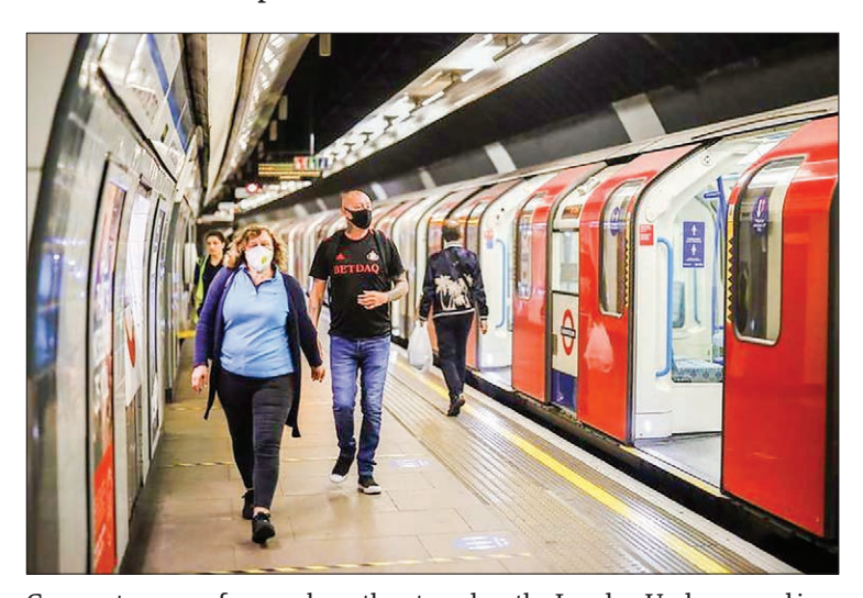
Commuters wear facemasks as they travel on the London Underground in London on June 12, 2020 as lockdown measures are eased during the novel coronavirus COVID-19 pandemic.