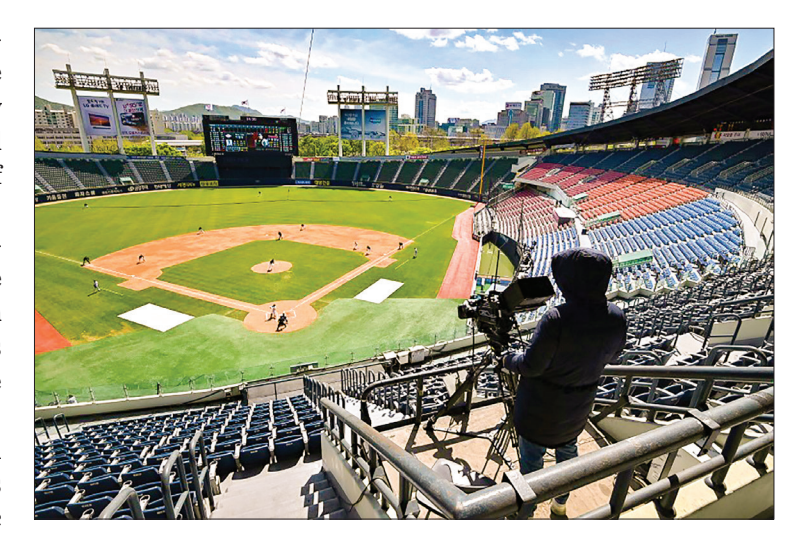
Some professional sports in South Korea – including baseball – started new seasons behind closed doors.

Of 62 new cases reported on Sunday -- taking the country's total to 12,715 -- 40 were domestic infections while 22 were people arriving from overseas. —AFP ■