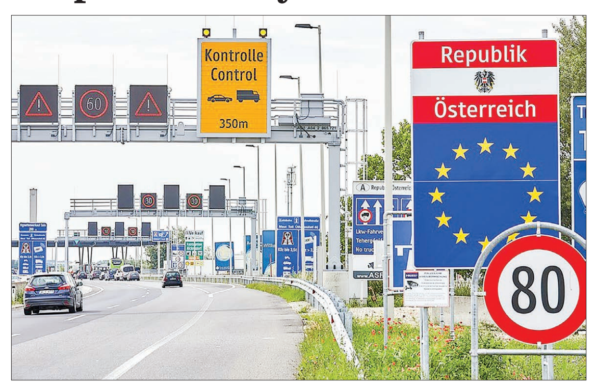
Vehicles are about to cross the border between Austria and Hungary to enter Nickelsdorf, Austria, on June 16, 2020.

THE European Union (EU) plans to bar travelers from the United States and some other countries where the COVID-19 outbreak has not been effectively controlled as the bloc will reo-