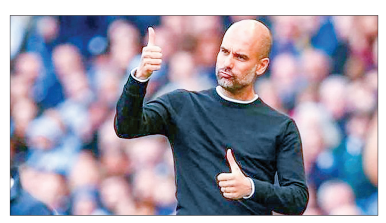
Guardiola says "exceptional" Liverpool deserve to be given the traditional guard of honour.

"This team's passion and desire, it is going and going and going again." City visit Newcastle on Sunday for their FA Cup quarter-final and are still chasing a treble of major trophies, leading Real Madrid 2-1 after the first leg of their Champions League last-16 tie at the Santiago Bernabeu.— AFP ■