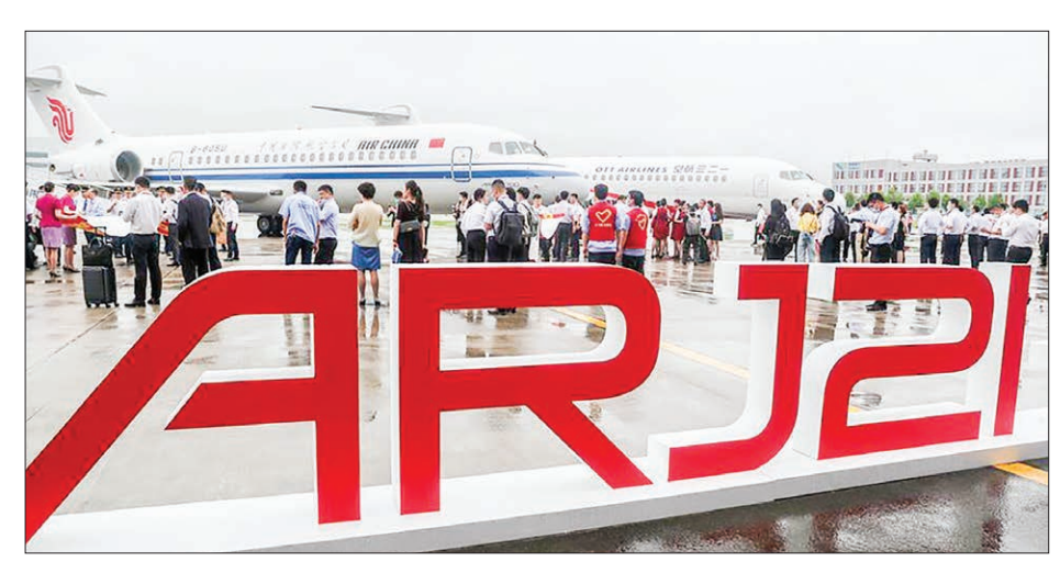
ARJ21 jetliners with newly painted liveries are parked at a COMAC assembly base in Pudong New Area, east China's Shanghai, June 28, 2020. Three China-developed ARJ21 jetliners have been delivered to three Chinese airlines here on Sunday. The ARJ21 is China's first turbo-fan regional passenger jetliner manufactured by the Commercial Aircraft Corporation of China (COMAC).

China Eastern opened a new base at Shanghai Hongqiao Airport on February 26, which operates mainly domestic commercial jets such as ARJ21 and C919. China Southern Airlines plans to operate the jet in Guangzhou in South China's Guangdong Province where it will accumulate comprehensive operating experience in providing an accessible and comfortable flying experience to customers.—Xinhua