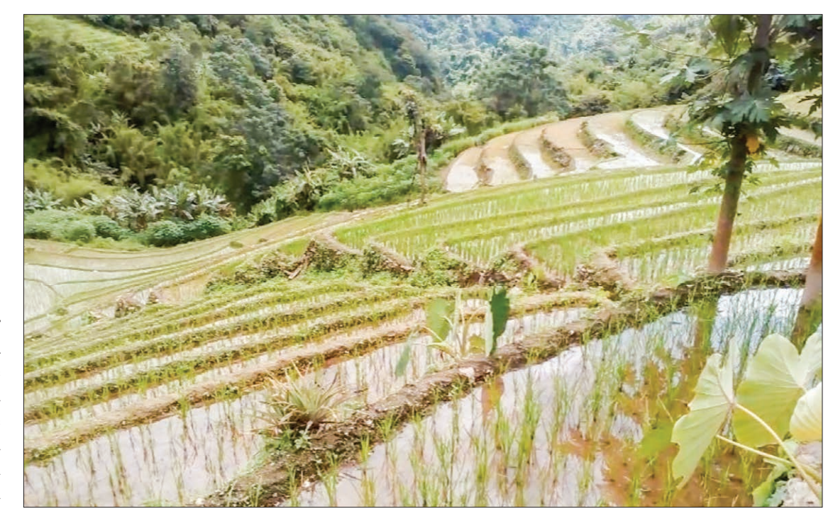
A terrace farming in Naga Self-Administered Zone.

The Minister said the people of Naga region use nomadic farming techniques that damages forests and can cause a loss of topsoil in the long run