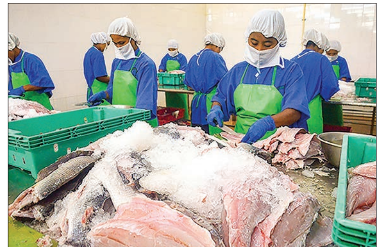
Workers prepare for fish export at a cold storage factory in Yangon.