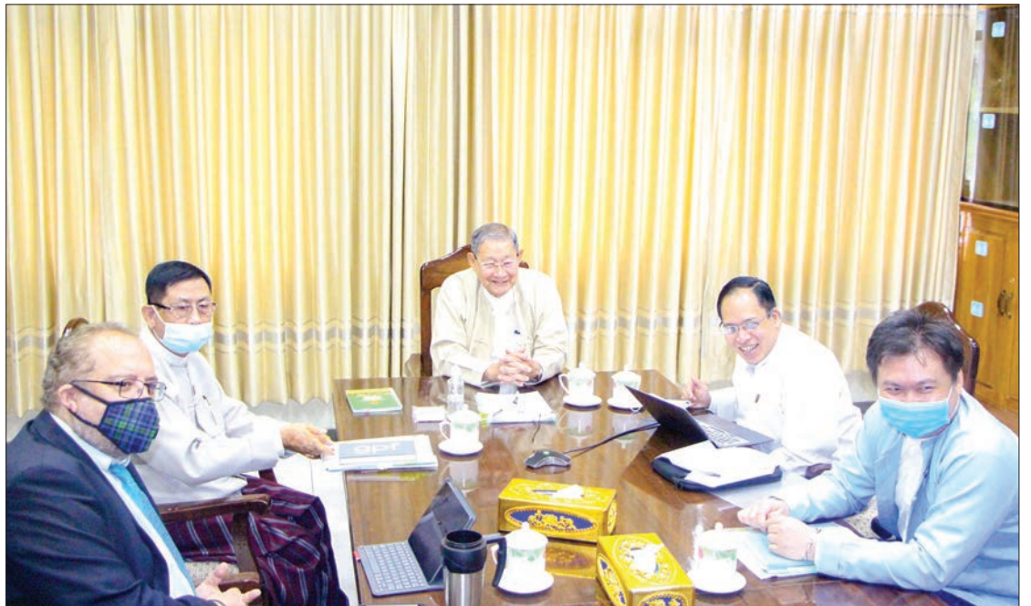
Ministry of Planning, Finance and Industry and the Central Bank of Myanmar holds meeting with IMF on Letter of Intent and loan plan.