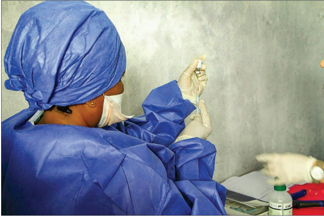
The newest Ebola outbreak is the 11th in the Democratic Republic of Congo since 1976.

KINSHASA (DR Congo)— DR Congo reported a fresh Ebola outbreak in its northwest on Monday, the latest health emergency for a country already fighting an epidemic of the deadly fever in the east as well as a surging number of coronavirus infections.