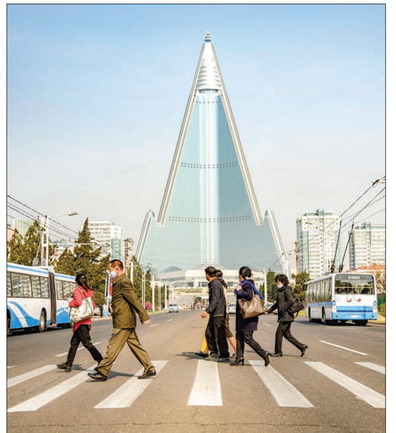
People wearing face masks walk across a street before the Ryugyong hotel (back C) on the occasion of the 108th birthday of late North Korean leader Kim Il Sung, known as the 'Day of the Sun', in Pyongyang on 15 April 2020. PHOTO: AFP

The number of coronavirus infections worldwide has risen to more than 6.1 million, with around 370,000 dead across 196 countries and territories. — AFP