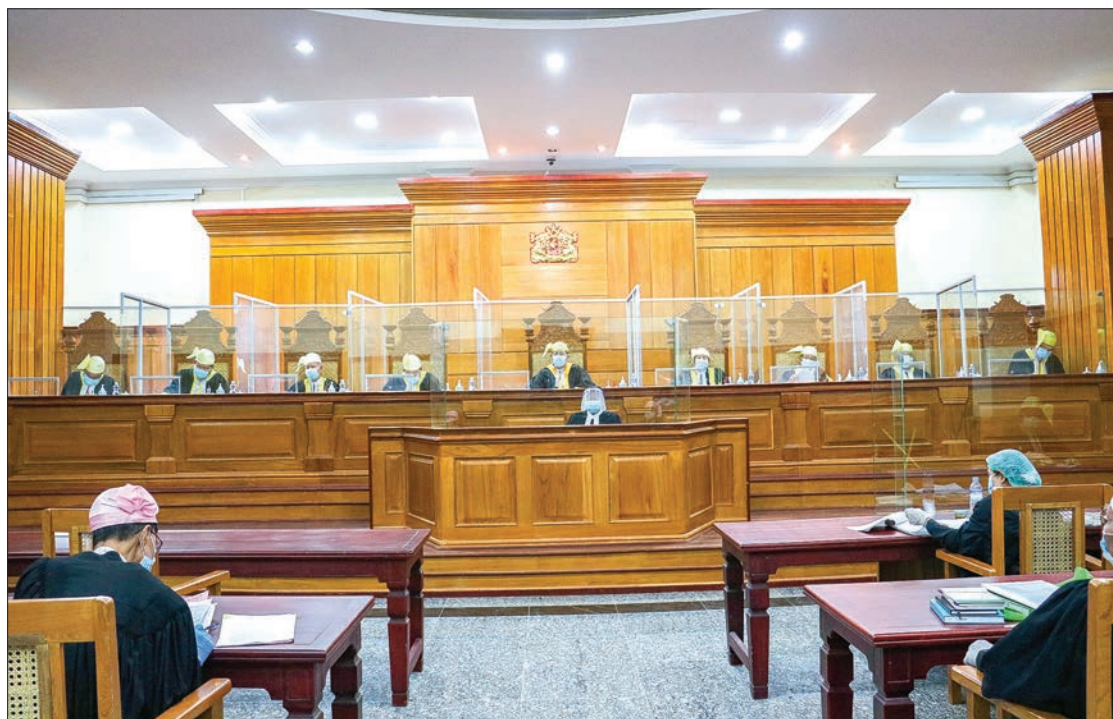
The Union Supreme Court hears cases in Nay Pyi Taw yesterday.

The Union Supreme Court passed judgements on five special criminal appeal cases and eight special civil appeal cases, along with hearing six special civil appeal cases yesterday. Chief Justice of the Union Su-