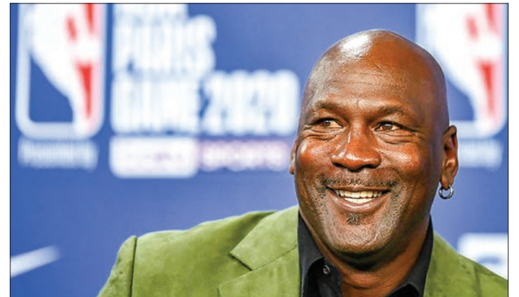
Michael Jordan, who was famously reluctant to comment on social issues during his playing career, says there is "ingrained racism" in the US.

LOS ANGELES (United States) — NBA legend Michael Jordan decried "ingrained racism" in the United States as the sports world's reaction to the death of unarmed black man George Floyd leapt leagues and continents.