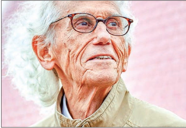
Christo made transforming internationally known landmarks his speciality.

SOFIA (Bulgaria) — The artist known as Christo, who made his name transforming landmarks such as Germany's Reichstag by covering them with reams of cloth, died on Sunday aged 84, his official Facebook page announced.