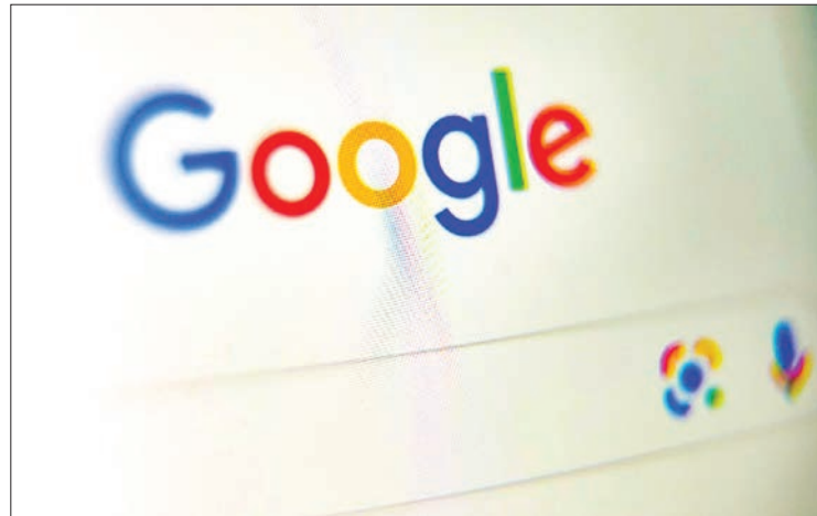
Google has denied it makes anything like the money the Australian government says it does from domestic advertisers.

News "represents only a tiny number of queries" on Google, accounting last year for barely