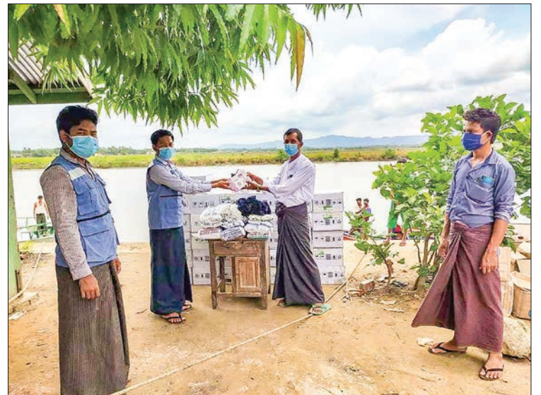
An official (centre right) presents relief items to a local man.