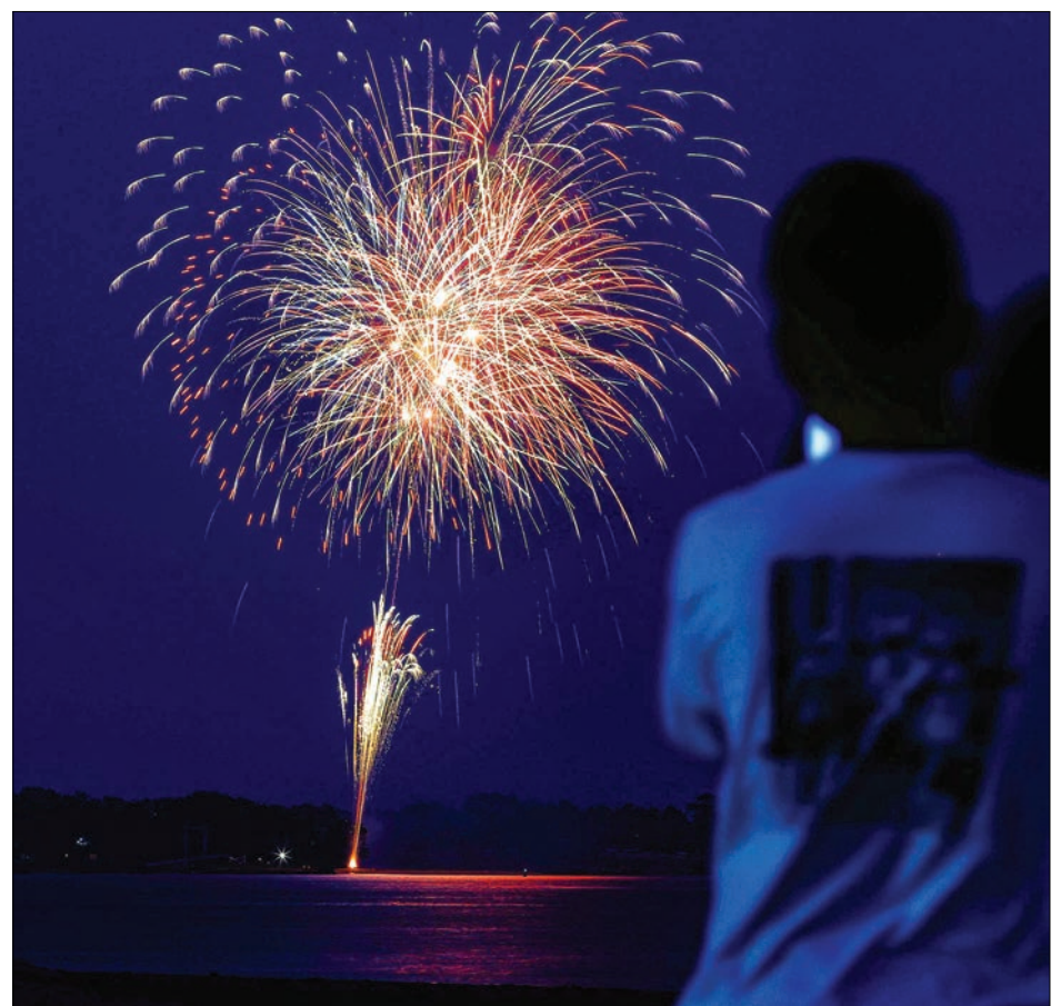
Fireworks are set off in Fukuoka, southwestern Japan, on 1 June 2020.

"As we face gloomy news due to the virus, people often tend to look down but when fireworks are set off, we look up. I hope we can help people do just that," said Ogatsu. — Kyodo News ■