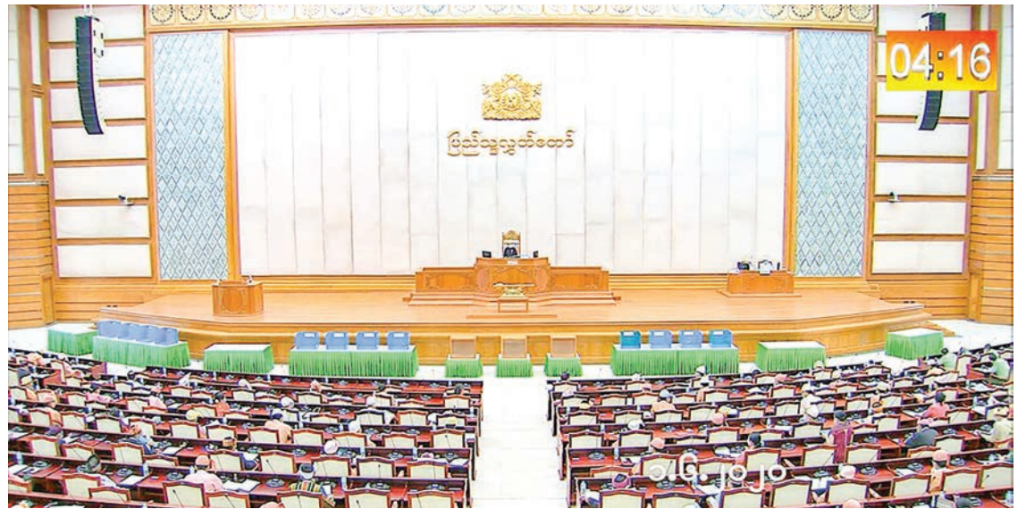
Pyithu Hluttaw holds its final-day meeting of 16 th regular session yesterday.