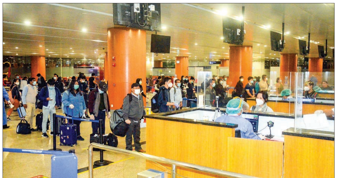
83 Myanmar citizens arrive back from Australia, New Zealand and Papua New Guinea yesterday.