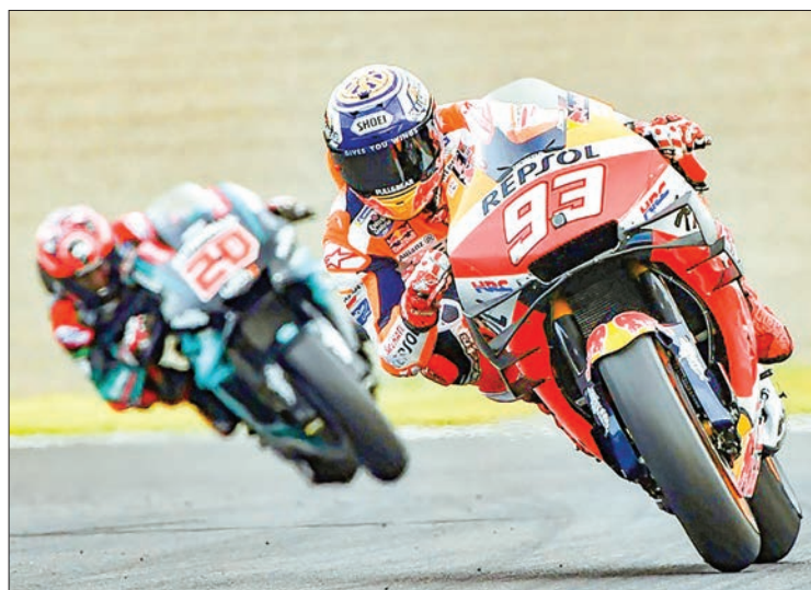
The Japanese race is a long-standing fixture on the MotoGP circuit.

"Therefore, overseas events, if at all possible, should be scheduled after mid-November — which would be too late in the year for the Motul Grand Prix of Japan to be held." —AFP ■