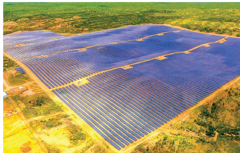
Minbu Solar Power plant in central Myanmar was launched in June, 2019.

THE ASEAN Post recently published an article on extreme climate in Myanmar and its threat to the locals, agriculture, ecosystems and more. It is said that Myanmar is one of the most vulnerable countries at risk of climate crisis. Extreme droughts and flooding in recent years and cyclones such as Nargis have affected millions of locals and cost thousands their lives. Natural disasters are one of the major impacts of climate change.