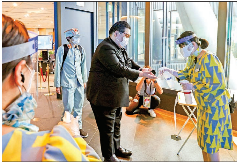
A visitor disinfects his hands at Tokyo Skytree on 1 June 2020, as it reopens after being closed due to the coronavirus pandemic.

Some constraints remained in Tokyo, which has seen the highest number of infections in the country at about 5,250. But the capital, with a population of roughly 14 million, went ahead Monday with its second stage of loosening