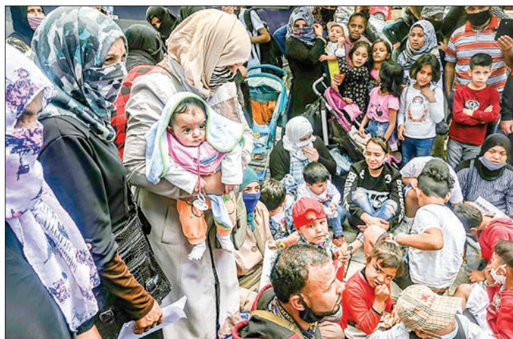
Greek authorities will start moving more than 11,200 refugees out of flats, hotels and camps on the mainland.

The military said the warehouse went up in flames, as a result of its volatile contents, leading to its complete destruction.—Xinhua ■