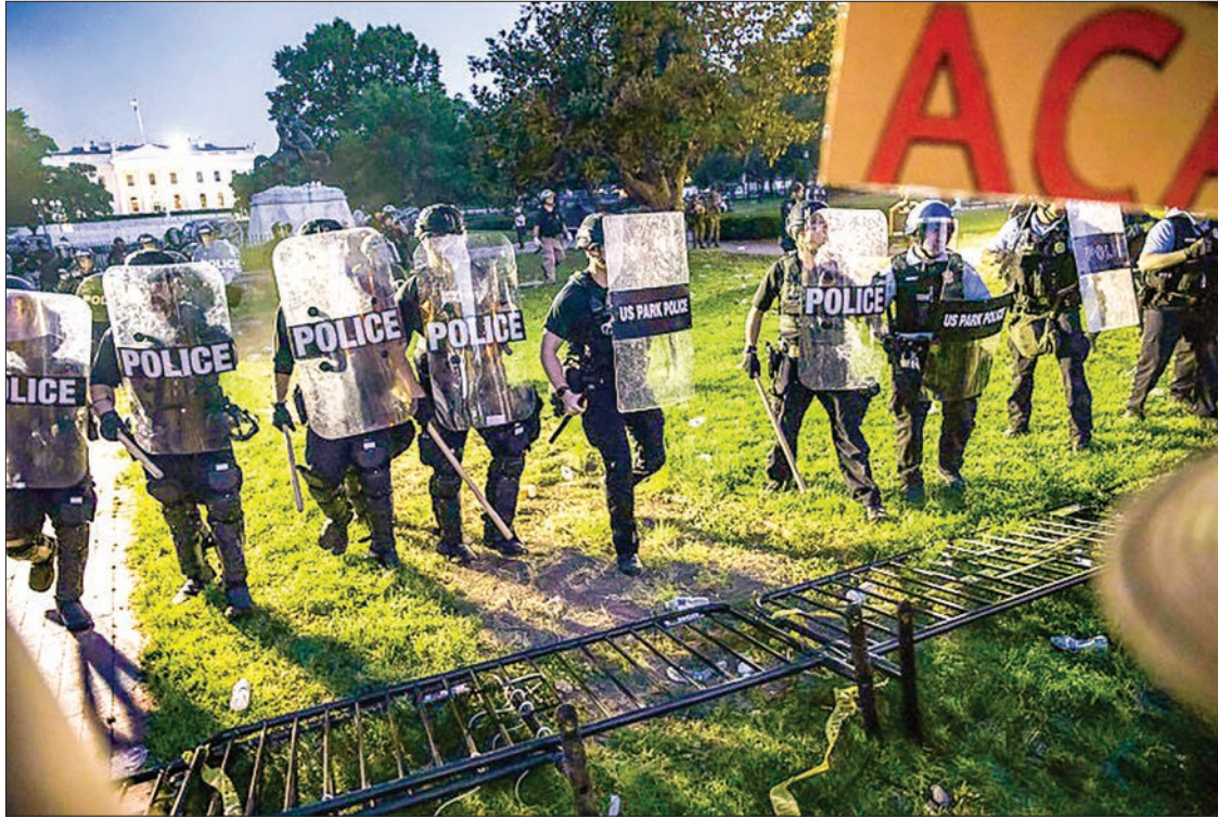
Police move toward demonstrators gathered outside the White House.

One closely watched protest was outside the state capitol in Minneapolis' twin city of St. Paul, where several thousand people gathered before marching down