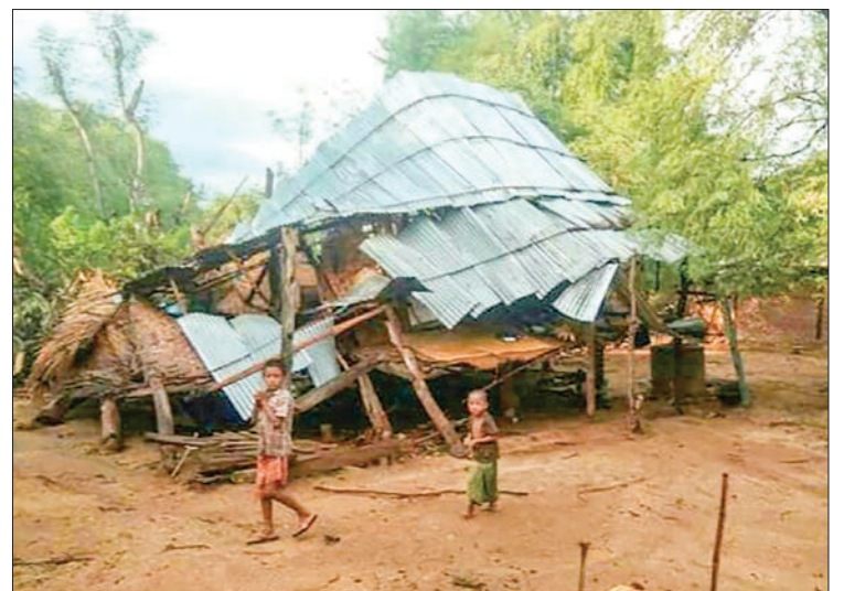
Two children walk near a house destroyed by strong wind in Magway Region.