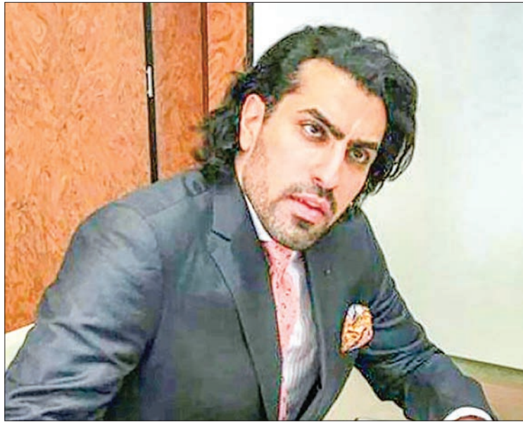
Jailed Saudi Prince Salman bin Abdulaziz apparently espoused no political ambitions.

LONDON (United Kingdom) — A $2 million US lobbying effort and petitions from European lawmakers are piling pressure on Saudi Arabia to release a philanthropist prince jailed for two years without charge amid an intensifying royal crackdown.