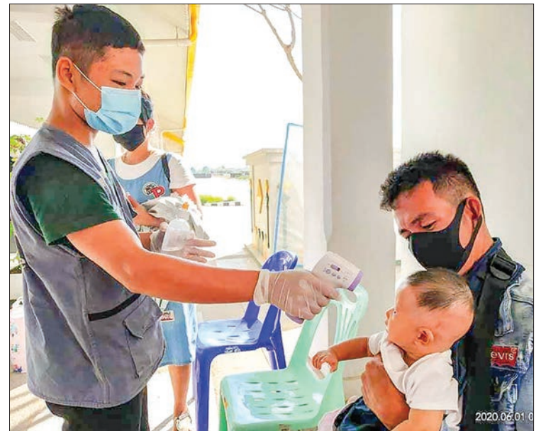
An official (left) checks the body temperature of a baby in its father hands in Myawady on 1 June.