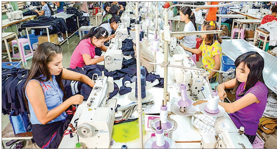
Textile workers sewing on production line at a garment factory in Hlinethaya Industrial Zone in Yangon.