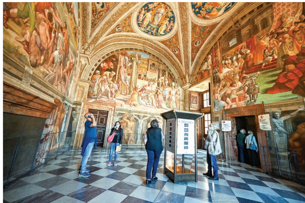
Visitors view one of Raphael's Rooms in the Vatican Museums (Musei Vaticani) which reopen to the public on June 1, 2020 in The Vatican, while the city-state eases its lockdown aimed at curbing the spread of the COVID-19 infection, caused by the novel coronavirus.

'Everything will be different' Pope Francis, speaking in a video message to mark the feast of Pen-