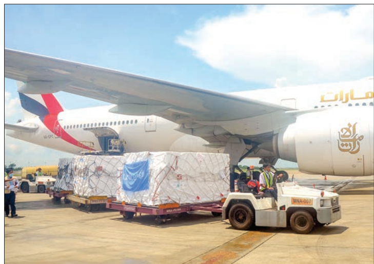
The special flight carrying regular vaccines and COVID-19 test kits is seen at the Yangon International Airport on 1 June.