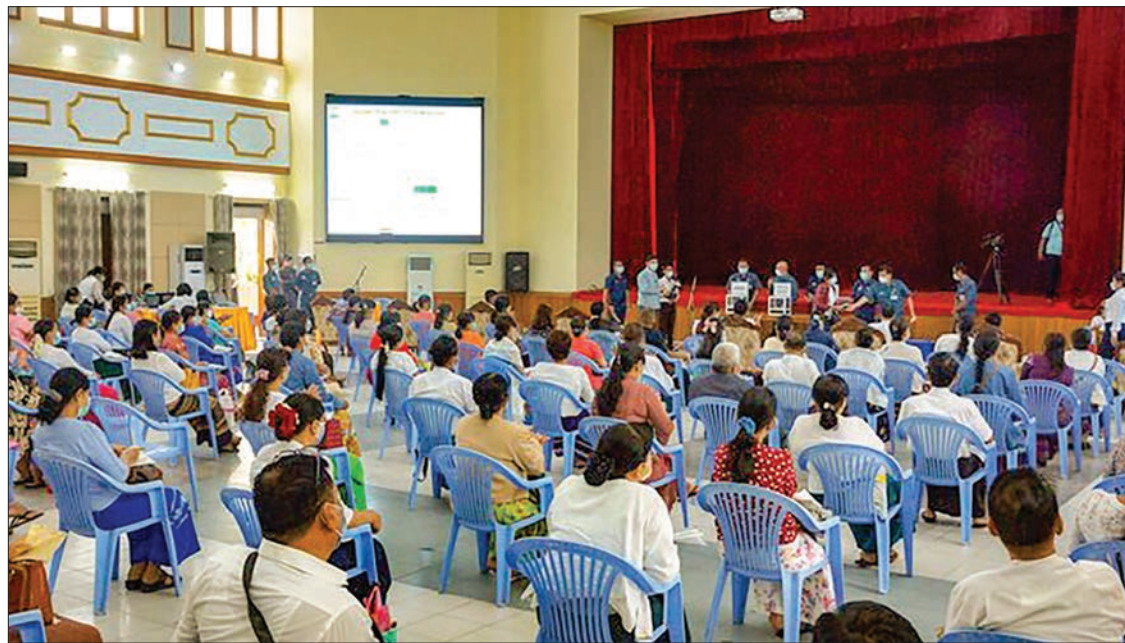
A drawing of lots ceremony to sell apartments to government personnel is in progress at City Hall in Mandalay on 1 June 2020.

MORE THAN 500 apartment units of Mya Yee Nanda affordable housing complex, developed by Mandalay City Development Committee (MCDC), will be sold through drawing-lots system.