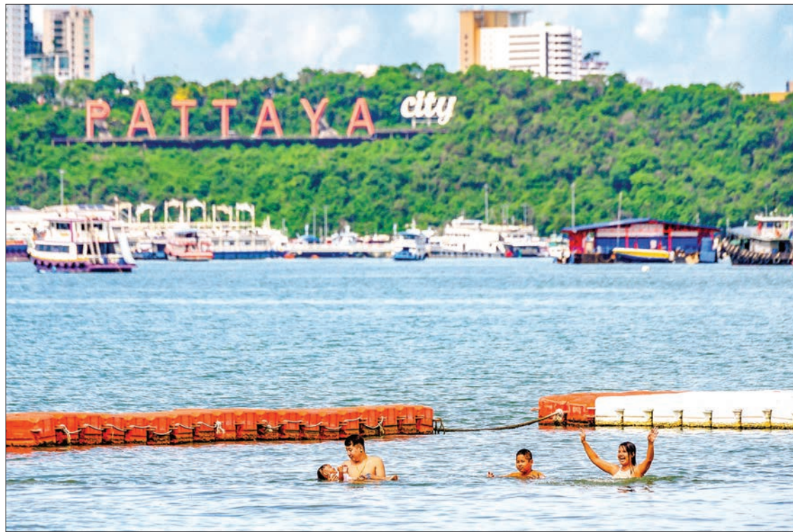
People take a dip in the water at the main beach in Pattaya on June 1, 2020. People flocked back to some of Thailand's famed sandy beaches on 1 June, keeping well apart but enjoying the outdoors, as authorities lifted coronavirus restrictions for the first time in more than two months.

PATTAYA (Thailand) — People returned to some of Thailand's famed sandy beaches Monday, keeping well apart but enjoying the outdoors, as authorities eased some coronavirus restrictions for the first time in more than two months.