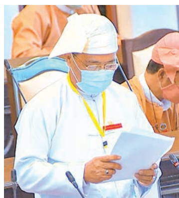
U Myint Aung, the member of Union Election Commission.