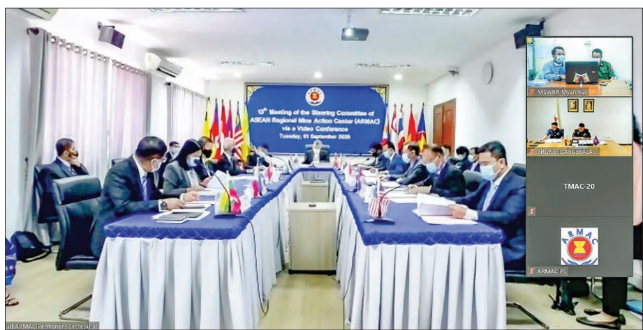
ASEAN Regional Mine Action Centre (ARMAC) holds its 13 th steering committee meeting online on 1 September 2020.