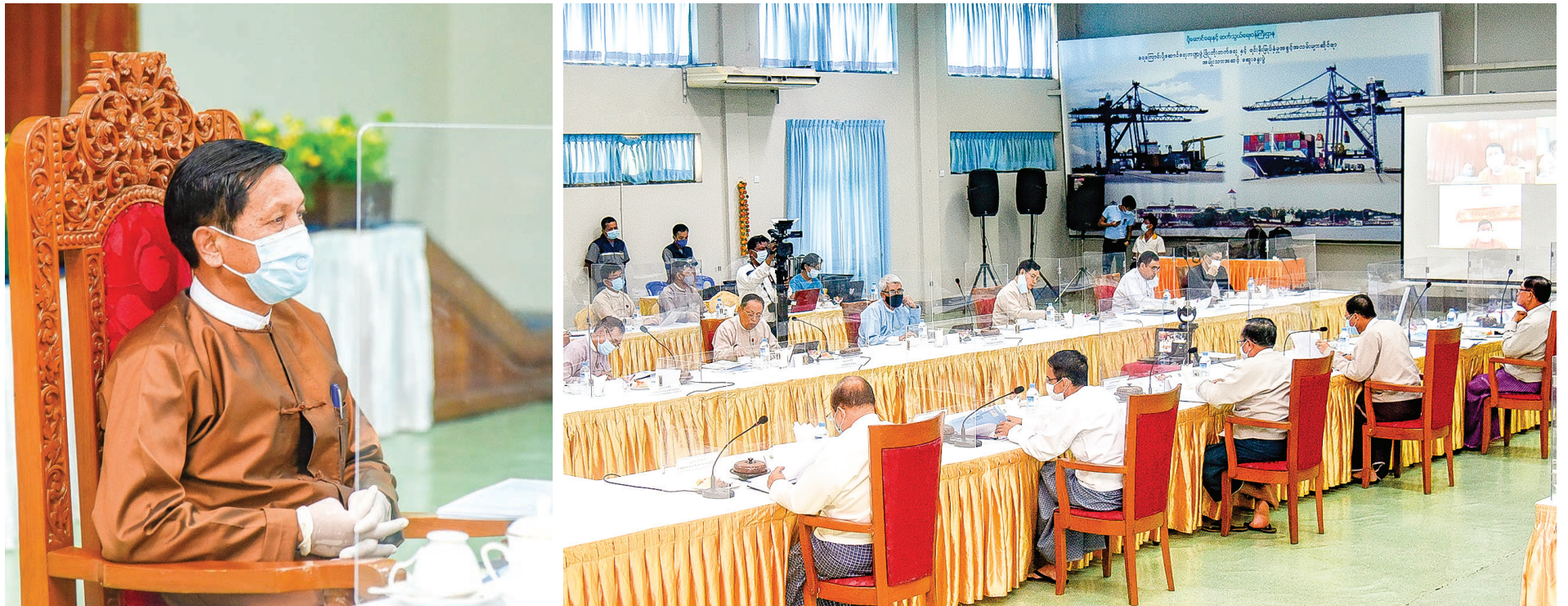
Vice President U Henry Van Thio presides over the coordination meeting on construction of Hanthawaddy International Airport on 1 September 2020.

V ICE President U Henry Van Thio presided over the 2nd coordination meeting of steering committee on Hanthawaddy International airport construction project yesterday to discuss the infrastructural works for the project.