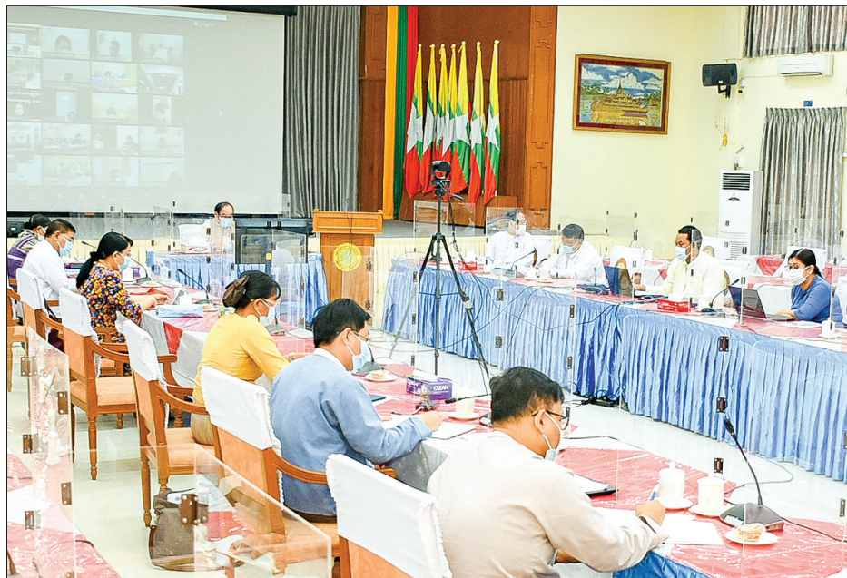
Union Minister Dr Myint Htwe presides over the meeting to increase momentum of COVID-19 control measures on 1 September.

The ministry will immediately carry out the works that can be done by the ministry alone, and the tasks that the ministry can't implement will be reported to the central committee in time. Special flights are transporting medical professionals