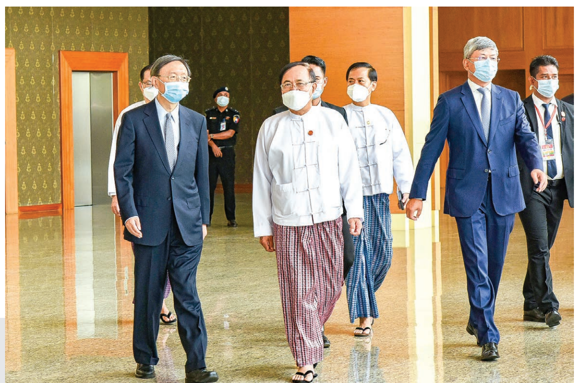
Union Minister U Kyaw Tin welcomes senior Chinese diplomat Mr Yang Jiechi at the Yangon International Airport on 1 September 2020.