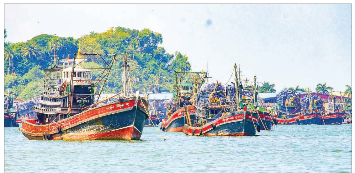
Fishing vessels are anchored near a coast in Myeik, Taninthayi Region on 31 August 2020.

We will know that there is difficulty in the sale of the fish