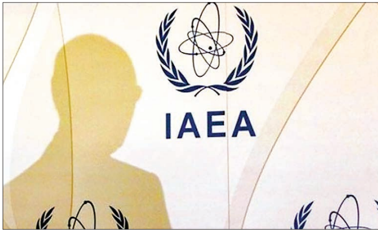
Iran has agreed to allow International Atomic Energy Agency inspectors to visit two sites suspected of hosting undeclared activity in the early 2000s.

Tehran insists it is entitled to do so under the deal – which swapped sanctions relief for Iran's agreement to scale back its nuclear programme – following the US withdrawal from the accord in 2018 and the reimposition of sanctions. In a boost to Tuesday's talks, the Iranian atomic energy last week agreed to allow inspectors of the UN nuclear watchdog to visit two sites suspected of having hosted