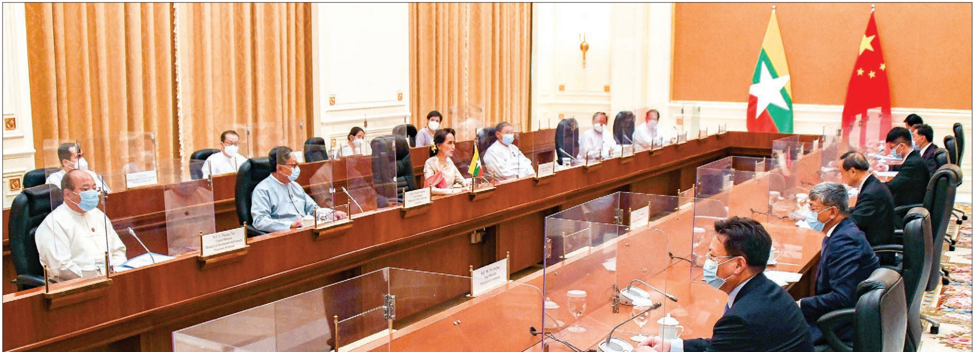
State Counsellor Daw Aung San Suu Kyi holds meeting with Mr Yang Jiechi, member of the Political Bureau of the Communist Party of China (CPC) Central Committee, in Credentials Hall of the Presidential Palace in Nay Pyi Taw on 1 September.