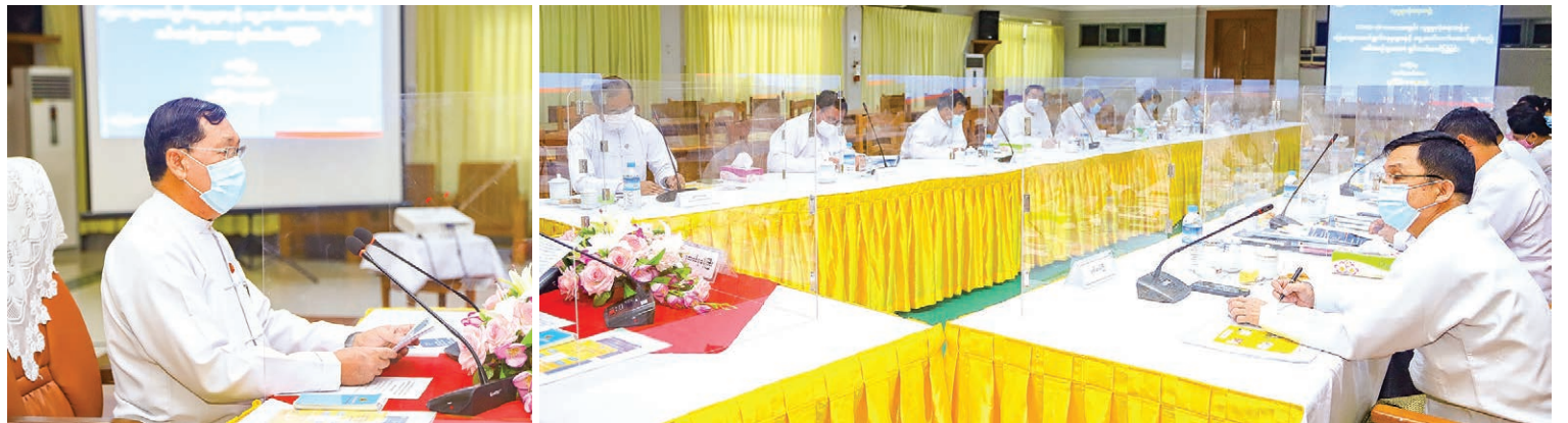
Union Minister U Thein Swe holds meeting with Social Security Board (SSB) on relief measures and further processes during in Nay Pyi Taw on 1 September 2020.

The government provided social security benefits including 40 per cent of social security fees to insured workers from the factories and workshops which are temporarily suspended for the inspections whether they are in line with the rules released by the Ministry of Health and