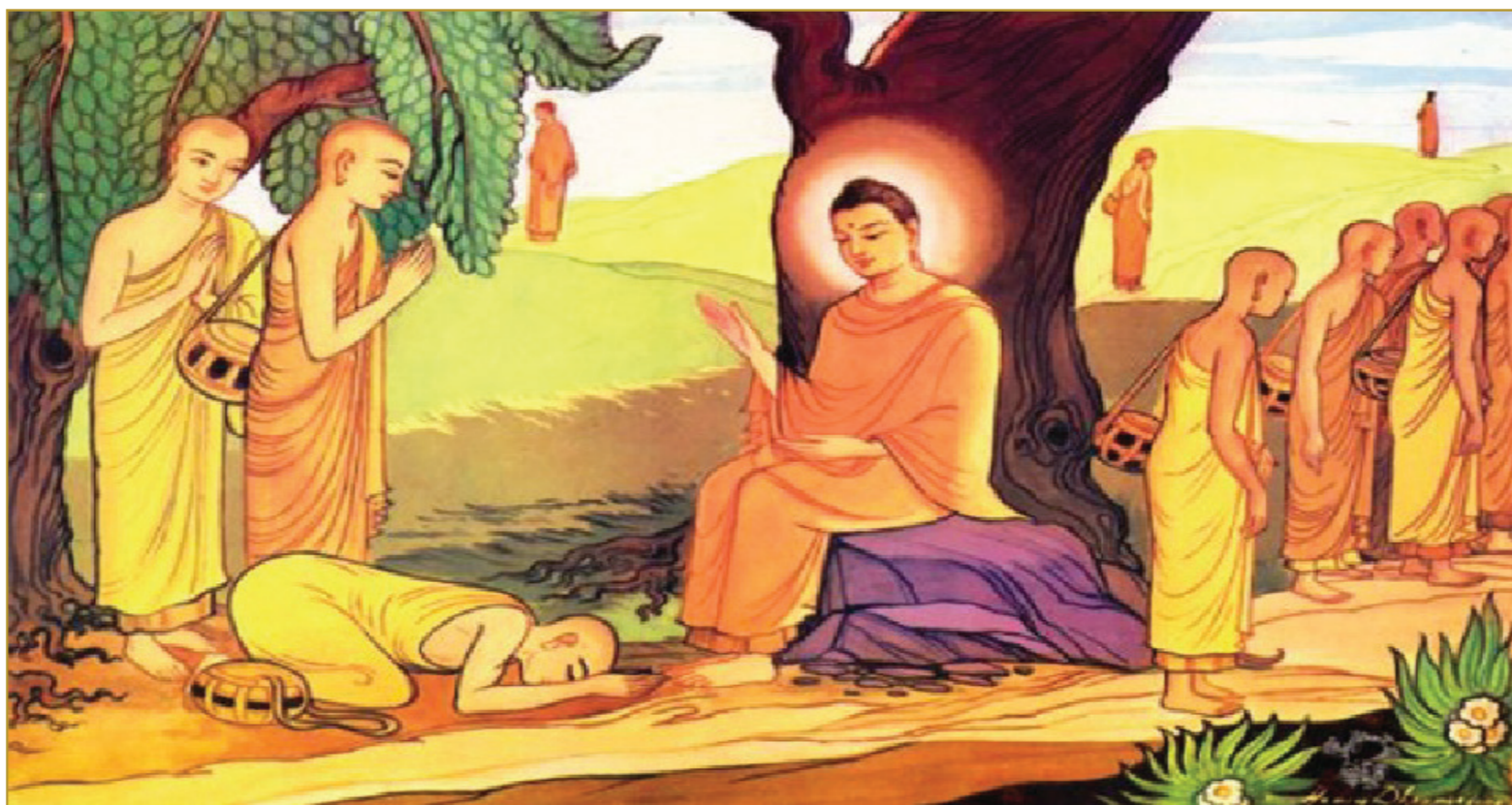
Full Moon day of Wagaung is designated as the Day of Metta Sutta and Myanmar Buddhists perform meritorious deeds across the nation on this holy day.

Sayey Tan Pwe which may best be rendered into English as "Casting lots Festival" was the traditional festival held in Wagaung in days of yore. Sayey Tans are lots to decide to choose recipient of food or gift or alms in a religious offering. The custom of casting lots in religious charity originated in the lifetime of the Lord Buddha. While the lord Buddha was residing in the Weiluwn Vihara at the Capital of Yazagyoe, famine hit the city and there was scarcity of food. Buddhist devotees could no longer provide 'hswan' (food) for all monks of the Vihara. Some wanted to select ten or twenty monks to offer food. Some preferred to cast lots so as to decide the recipient monks. Some thought of