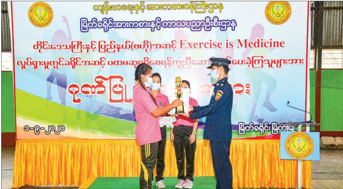
A participant from Fire Service Department in “Exercise is Medicine” Initiative (R) accepts the trophy and certificate of honour presented by Myeik District Sports & Physical Education Department (SPED) in Myeik Town on 1 September 2020.

SPORTS & Physical Education Department (SPED) of Myeik District honoured the participants in State/Region (Central) “Exercise is Medicine” Initiative at the Myeik District Sports Hall in Myeik Town, Taninthayi Region yesterday.