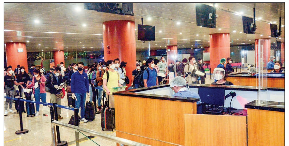
Myanmar nationals returned from foreign countries line up for immigration process at the Yangon International Airport on 1 September 2020.