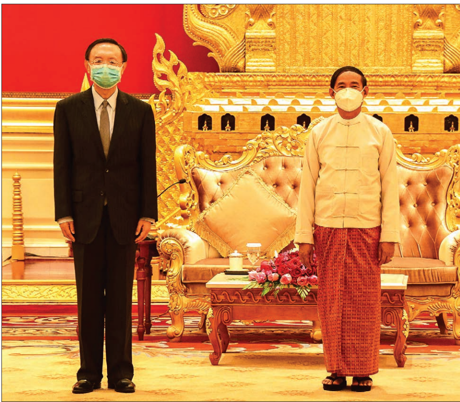
President U Win Myint (R) receives Political Bureau of the Communist Party of China Central Committee member Mr Yang Jiechi at Presidential Palace in Nay Pyi Taw on 1 September 2020.

President U Win Myint received a courtesy call from Mr Yang Jiechi, member of the Political Bureau of the Chinese Communist Party Central Committee, at the Credentials Hall of the Presidential Palace in Nay Pyi Taw yesterday afternoon.