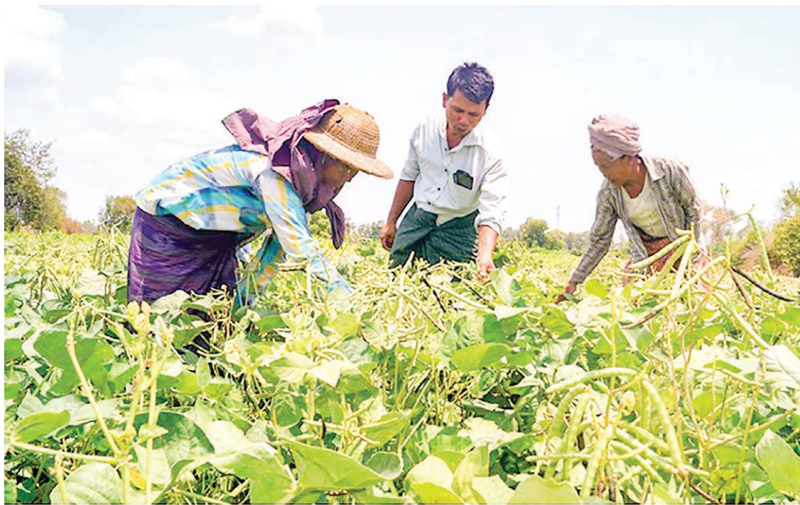
Farmers seen in a green peas farm. Myanmar earns about US$800 million from exports of beans and pulses every year.

year. Myanmar exported over 2.31 million tonnes of rice and broken rice as of July 31 this financial year 2019-2020. Myanmar freighted over 1.456 million tonnes of rice and 860,592 tonnes of broken rice, earning nearly US$700 million. Being an agricultural country, Myanmar exports a wide variety of agricultural products, ranging from rice, beans and pulses, sesame, sugarcane, onion, garlic, ginger and other kitchen crops to watermelons, bananas, mangoes, avocados, cucumbers, chili, and other profitable fruits and vegetables, and rubber.