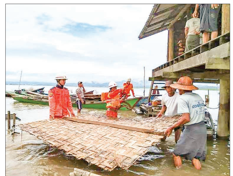
Rescue workers help locals rebuild their houses damaged by strong wind in Sagaing Region on 1 September.

The National Disaster Management Committee has provided K650 million worth rescue equipment such as vehicles, motorcycles, speed boats, fibre boats, lifejackets, motor vessels and wheel loaders for Sagaing region in cooperation with the Disaster Management Department. "We have also spent over K1,686 million for construction of one cyclone shelter facility to accommodate about 600 people in Kalay township and nine school shelters to accommodate about 500 people in Kalay, Mawlaik, Paungbyin, Homalin and Kani townships for the safety of the natural disaster-affected people. Moreover, the department has provided 4,000 raincoats, umbrellas and rain boots for the children