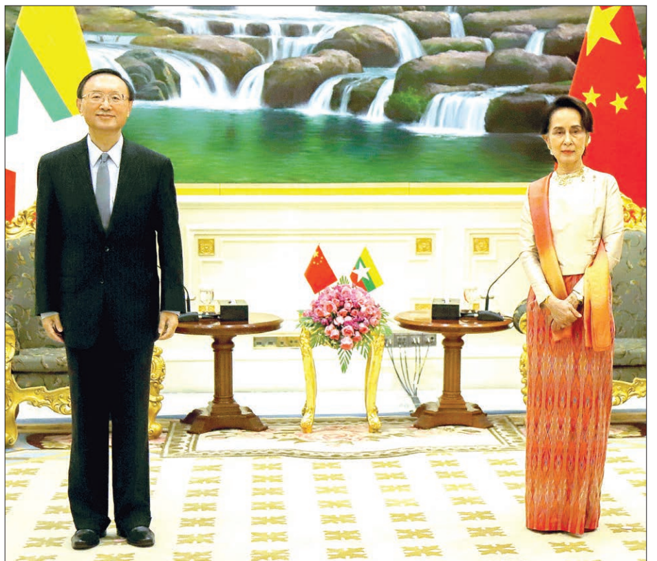
State Counsellor Daw Aung San Suu Kyi (R) receives Political Bureau of Communist Party of China Central Committee member Mr Yang Jiechi at Presidential Palace in Nay Pyi Taw on 1 September 2020.

State Counsellor Daw Aung San Suu Kyi received Mr Yang Jiechi, member of the Political Bureau of the Communist Party of China (CPC) Central Committee, in the Credentials Hall of the Presidential Palace in Nay Pyi Taw yesterday afternoon.