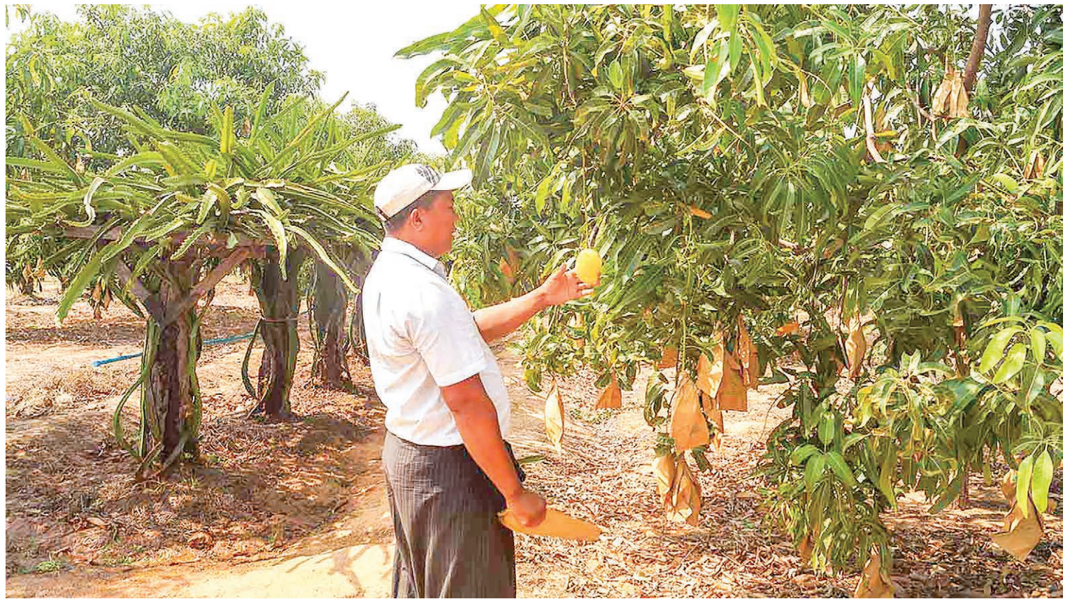
Mango stands at the top of the list of exported agricultural products. Four GAP-certified mango plantations in Kanbalu Township.