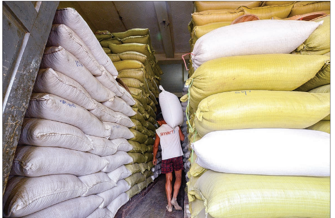
Myanmar Rice Federation said reserved rice have been sold with fair price in Yangon and other regions/states.

The Ministry of Commerce, Myanmar Inspection and Test-