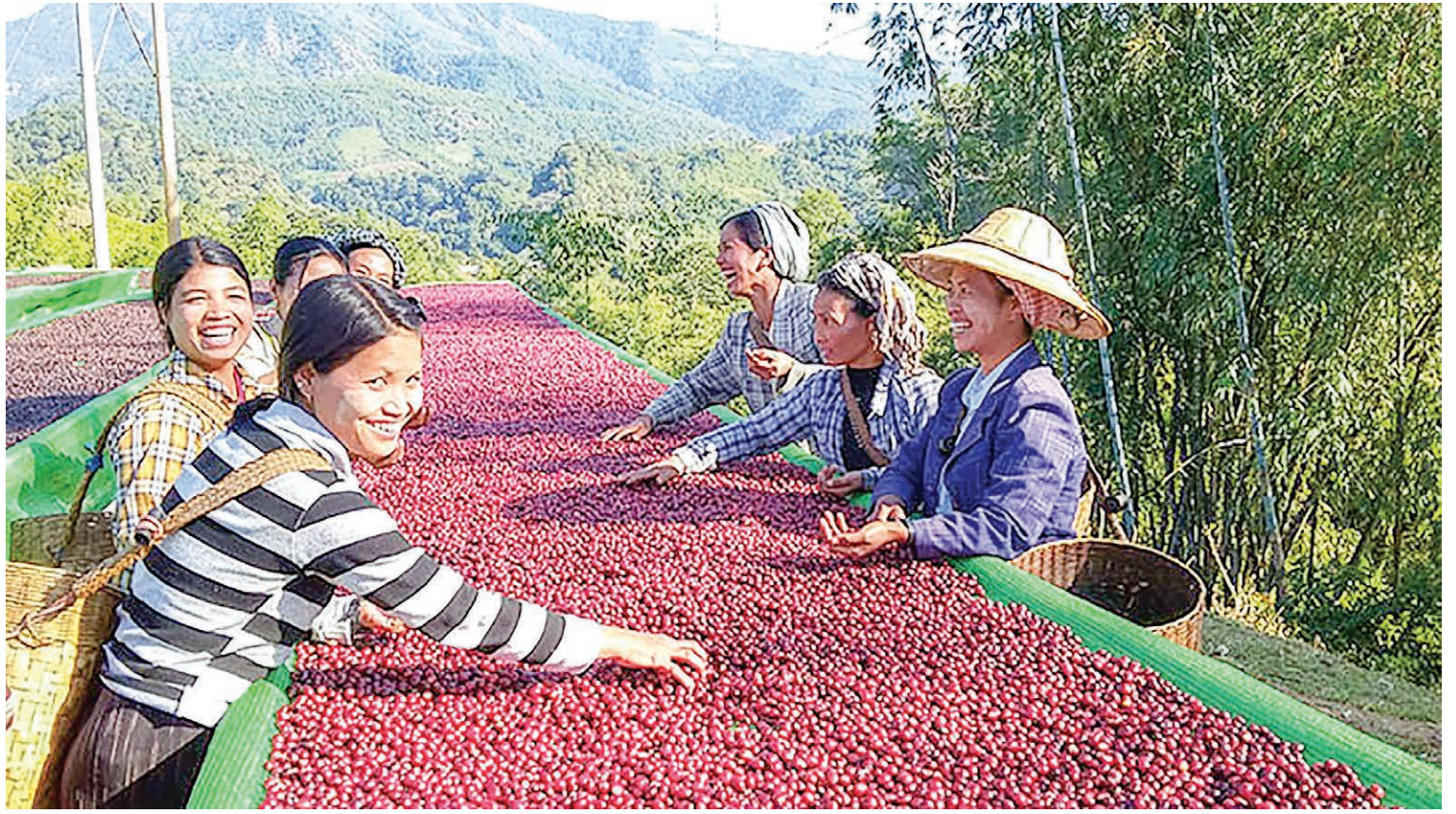
Workers dry coffee berries under the sunshine in Ywangan.

Myanmar shipped over 1.15 million tons of beans and pulses to foreign markets from 1 October 2019 to early July in the current financial year 2019-2020, fetching US$730 million, according to the figure released by the ministry. The Southeast Asian country earns about US$800 million from exports of beans and pulses every