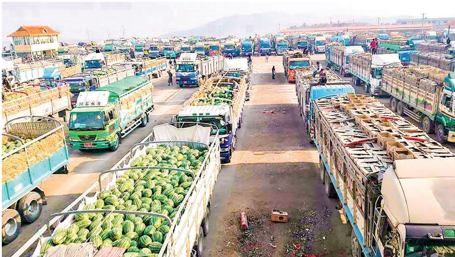
Myanmar mainly exports agricultural products to its neighbouring countries.

Myanmar agricultural products are primarily transported to Thailand, China, India, Bangladesh, Japan, Singapore, Malaysia, the Philippines, Indonesia, and Sri Lanka. However, the export market for the country's agricultural products remains uncertain due to quality and unstable global demand. The country requires specific export plans for each agro product, as they are currently exported to exter-