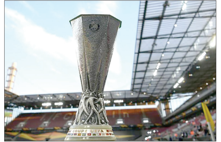
All European ties are going ahead behind closed doors.

Nine-time domestic champions, Nassr are looking to strengthen their squad having this week relinquished the Saudi Pro League title to Al Hilal. The capital club sit six points behind their city rivals with two rounds to go, but lost the crown given their inferior head-to-head record.—AFP ■