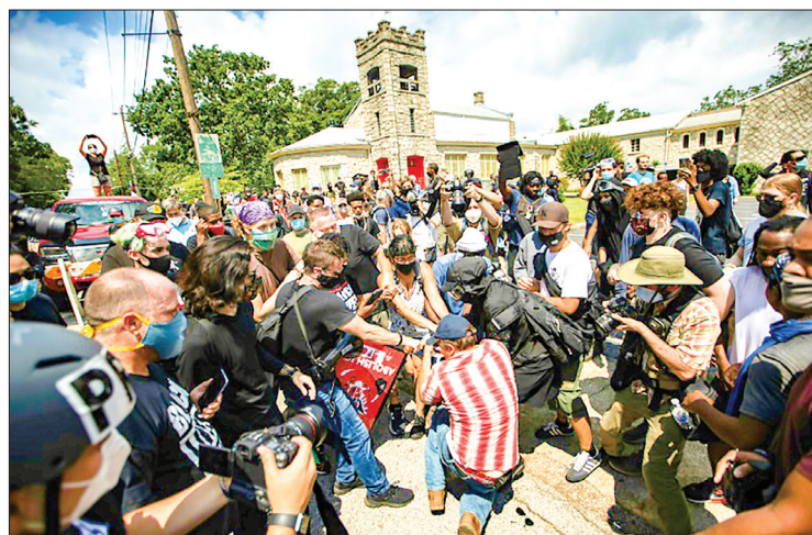
People fight around a Confederate flag during an extreme-right rally and left-wing counter-demonstration at Stone Mountain, Georgia, on August 15, 2020.

et and a pistol in his belt. In the United States, where the right to defend oneself is part of the na-