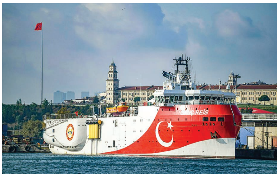
Turkey deployed the Oruc Reis research vessel and warships to the disputed waters on August 10 and prolonged the mission twice.

ANKARA — President Recep Tayyip Erdogan on Tuesday played up Turkey's military might after extending a Mediterranean gas exploration mission that has pitted it against Greece and the rest of the EU.