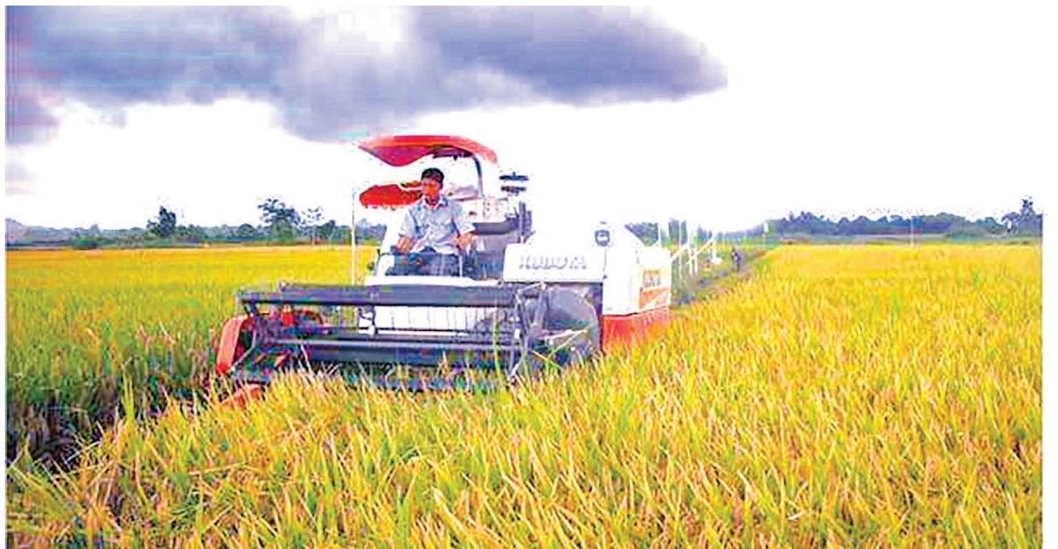
A farmer harvests ripening monsoon paddy plantation with the use of combine harvester in Loikaw, Kayah State.