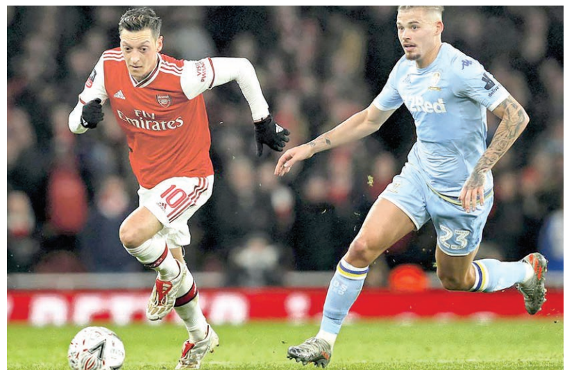
Arsenal midfielder Mesut Ozil being chased by Leeds United’s Calvin Phillips during the FA Cup third round match at the Emirates Stadium on January 6, 2020.

Complications caused by the coronavirus pandemic mean that all qualifying ties are being played as one-off matches at the home of the first team drawn from the hat, rather than over two legs.—AFP ■