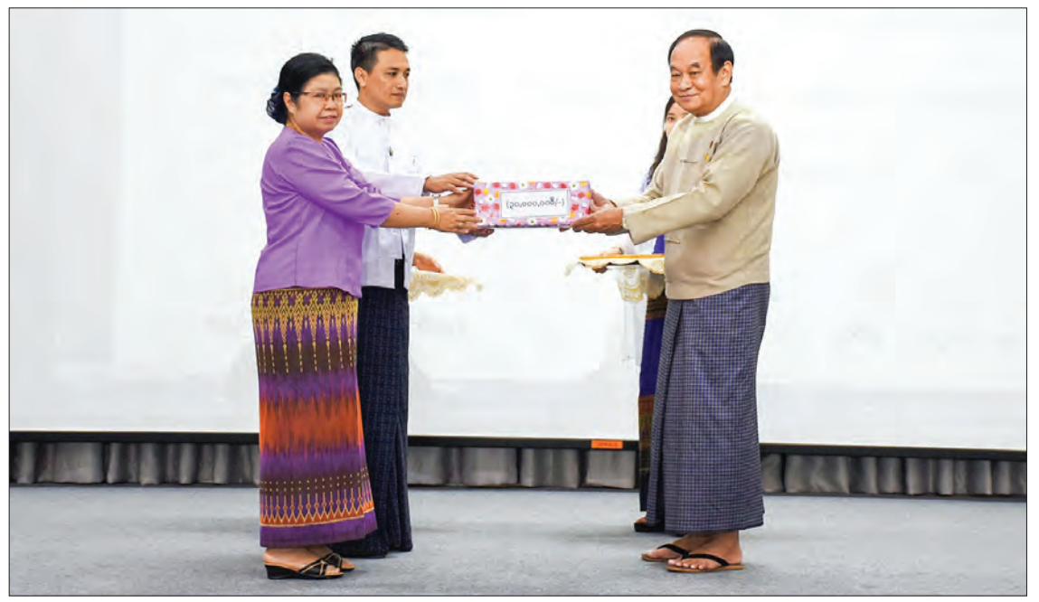
Union Minister Dr Myint Htwe receiving the cash donation from well-wishers for National-Level Central Committee on Prevention, Control and Treatment of Coronavirus 2019 (COVID-19).