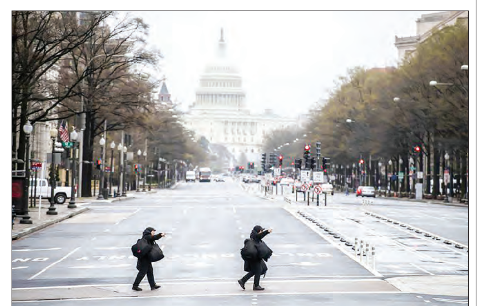
Photo taken on 23 March, 2020 shows two pedestrians walking on a nearly empty street in Washington D.C., the United States.

According to the forecast, lockdowns in Europe and North America are hitting the service sector hard, particularly indus-