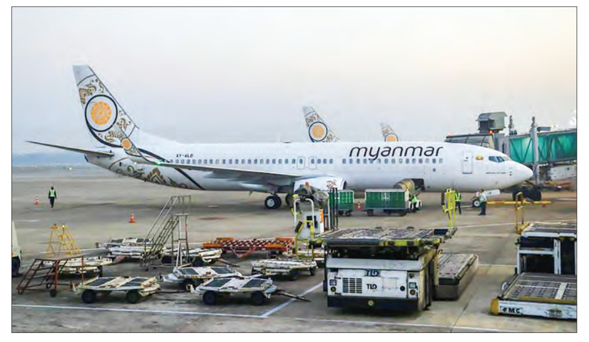
A Myanmar National Airlines aircraft sits on the termac at Yangon International Airport.