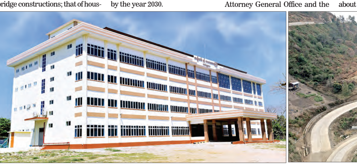
New building for the South Okkalapa Maternal and Child Hospital, built by the Ministry of Construction.

Q: Kindly explain the ongoing A: The Building Department has tasks and the fourth year's proestablished own laboratory. The gress as a whole of the Ministry laboratory examines the parts of the building structure. Now, our of Construction. A: First of all, I would like to talk laboratory has been tagged with ISO/ IEC 17025: 2017, and that about the work being implemented