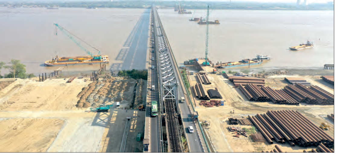
The Bago River-crossing Thanlyin Bridge No. 3 linking Yangon, Thanlyin and Thilawa Special Economic Zone is under construction.

A: The department has categorized Class (a), Class (b), and Class (c) on the rural roads that has stretched over (55,000). In the year 2030, a total of (90) per cent would come under all year round accessible rural roads. The President in his speech delivered on 17 April 2018, he promised in providing (600) miles rural roads in the country. Our Ministry of Construction fulfilled the directive of the President by paving gravel roads, laterite roads, concrete roads, asphalt roads. We