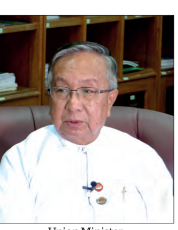
Union Minister U Han Zaw

Question: Please tell us the policy, aim and objective, tasks, strategies, and tactics of the Ministry of Construction. Answer: With multifaceted aims and objectives we are working on all round development for the social development of the entire population. The tasks included such as that of the road and bridge constructions; that of hous-