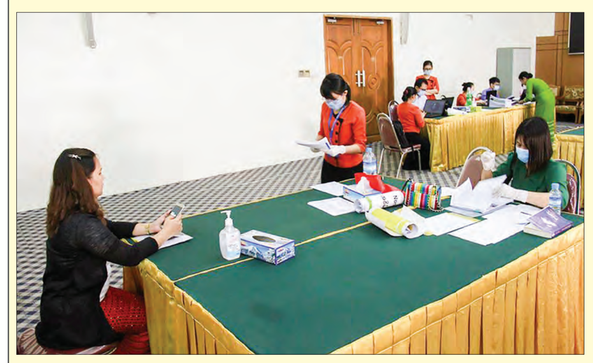
The Republic of the Union of Myanmar Federation of Chambers of Commerce and Industry's staff working for an event at the UMFCCI office.

BUSINESSES facing repercussions from COVID-19 can apply for loans from the COV-ID-19 Fund online, according to the Republic of the Union of Myanmar Federation of Chambers of Commerce and Industry (UMFCCI).