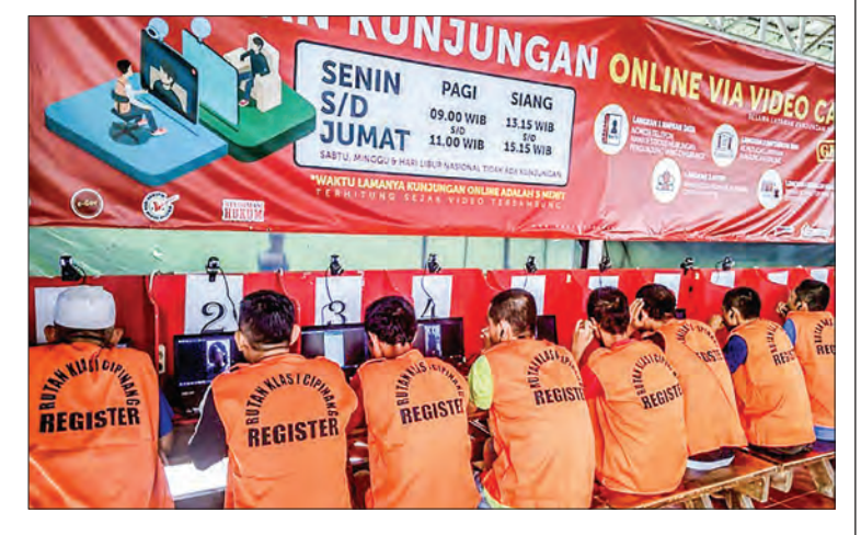
Indonesian inmates at a Jakarta prison talk via video to family members after visits were stopped because of coronavirus fears. Authorities have now gone further, and are releasing tens of thousands of prisoners in a bid to stop the spread of the virus in overcrowded jails.

contact with," said the 33-yearold, who was set for release in November. But his relief was tempered by the thought of others still inside. "I'm not that happy because I left my friends behind," he said. Indonesia's creaking prison system has just 522 institutions for some 270,000 inmates. It suffers from regular jailbreaks and criticism for its often deplorable conditions.—AFP