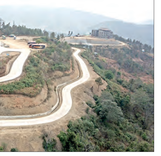
Ring roads encircling Hakha, Chin State.