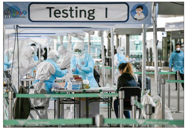
Medical staff wearing protective clothing take test samples for the COVID-19 coronavirus from a foreign passenger at a virus testing booth outside Incheon international airport near Seoul.

New figures on infection rates and virus-related deaths would show Thursday whether there were signs the epidemic could be peaking in Europe, where at least 34,000 have died.—AFP