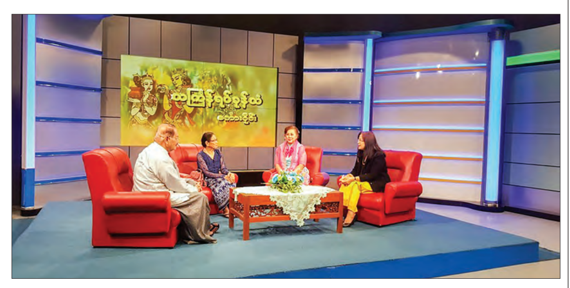
Thingyan talk is being shot at the MRTV, Yangon.

THE second part of the Thingyan talk-show of the film 'Maung Do Cherry Myay' was recorded at MRTV studio in Yangon yesterday.