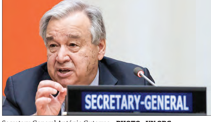
Secretary-General António Guterres.

Clearly, we must fight the virus for all of humanity, with a focus on people, especially the most affected: women, older persons, youth, low-wage workers, small and medium enterprises, the informal sector and vulner-