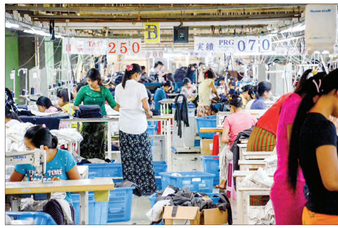
Employees work at the production line of a large garment factory in Yangon.

GARMENT factories that have closed down citing lack of raw materials because of COVID-19 need to be scrutinized to check whether they are really short of raw material supply, said U Maung Maung, chairman of the Confederation of Trade Unions of Myanmar (CTUM).