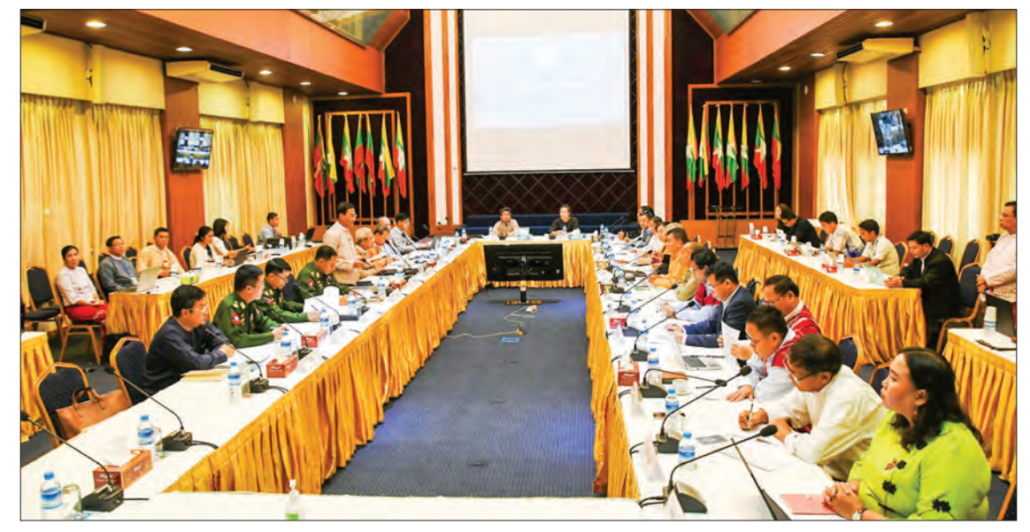
Government and ethnic armed organizations signed the Nationwide Ceasefire Agreement-NCA (NCA-S EAO) hold the work coordination meeting in Yangon yesterday.