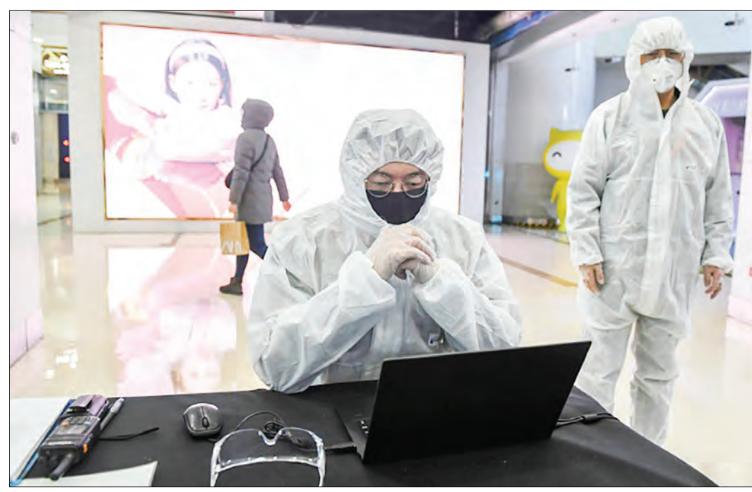
Fear of the economic impact of the virus has governments and markets on edge.

In a moderate scenario, where precautionary behaviors and restrictions such as travel bans start easing 3 months after the outbreak intensified and restrictions were imposed in late January, global losses could reach $156 billion, or 0.2% of global GDP. The People's Republic of China (PRC) would account for $103 billion of those losses—or 0.8% of its GDP. The rest of developing Asia would lose $22 billion,