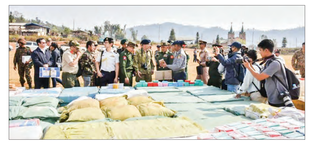
Military attaches and journalists observing the seized drugs in Kutkai yesterday.

SECURITY forces seized narcotic drugs and drugs-related materials worth over K 93 billion from 28 February to 4 March in northern Shan State, according to the Commander-in-Chief of Defence Services Office.