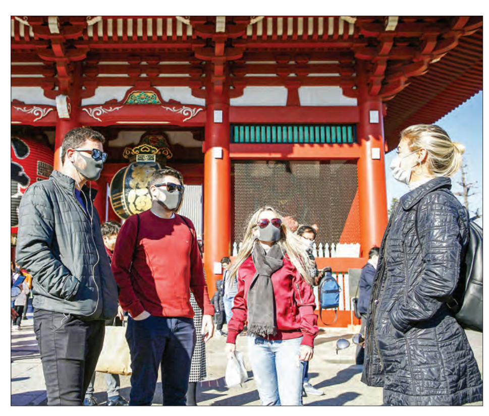
Foreign tourists wear masks in Tokyo's Asakusa district on Feb. 1, 2020, amid the spreading coronavirus.

TOKYO — Japan will temporarily nullify 2.8 million visas held by Chinese and 17,000 held by South Koreans to prevent the new coronavirus from spread-