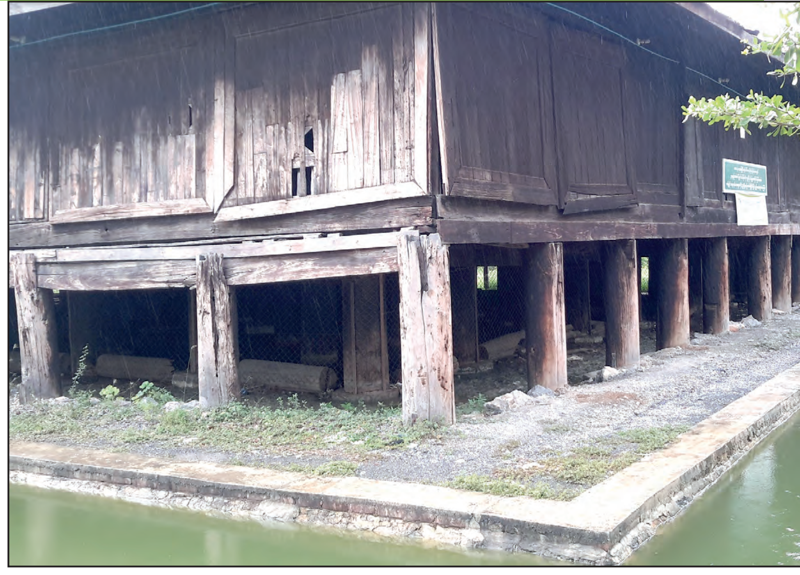
Maha Minhtin Monastery.

The Great History of Konbaung Dynasty stated kings in Konbaung era namely Alaungmintayar U Aungzeya, Naungdawgyi, Myaydu, Badon, Sagaing, Thayawady, Bagan, Mindon and Thibaw built monasteries. King Mindon and King Thibaw in Yadanabon era constructed 55 monasteries in Mandalay. King Mindon allotted monasteries in eastern, western, southern and northern wards of Mandalay but some