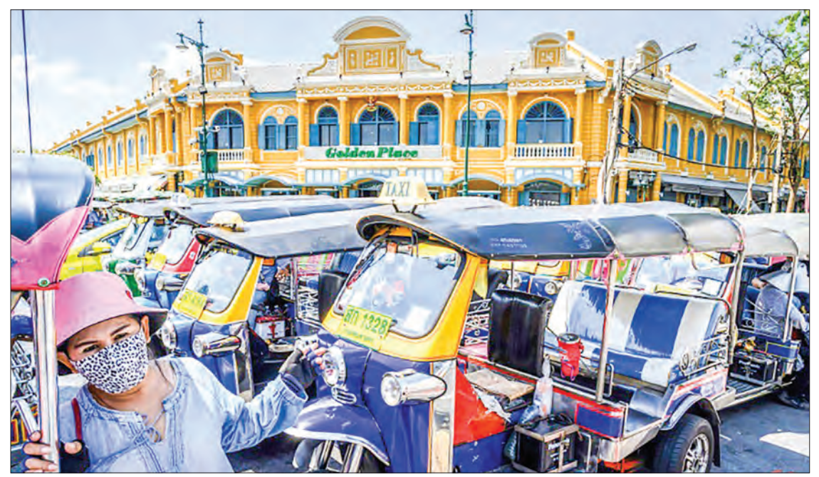
The Tourism Authority of Thailand has confirmed the country could see a loss of six million visitors in 2020.