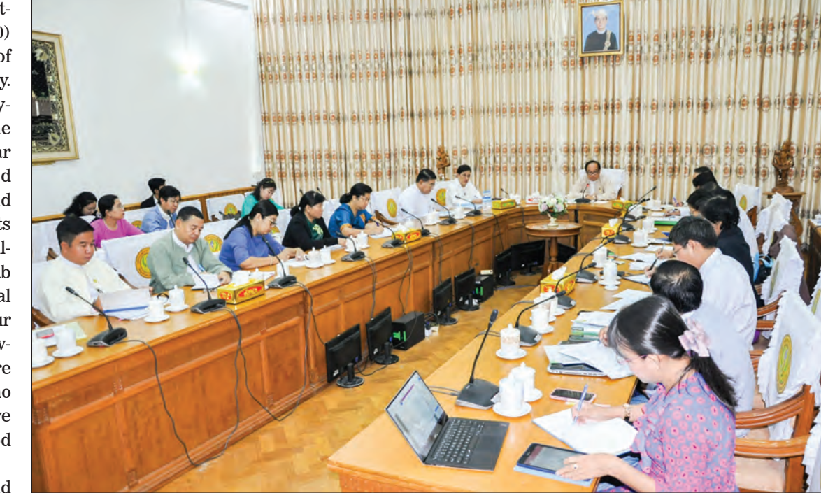
Union Minister Dr Myint Htwe addresses the central-level coordination meeting on COVID-19 yesterday.

of COVID-19 has slowly risen to 3.5 per cent, but Myanmar has made necessary preparations to contain the spread of the disease. He said the public need to be made continually aware that people with diabetes, chronic illnesses or the elderly should be swiftly sent to the hospital on signs of designated symptoms.