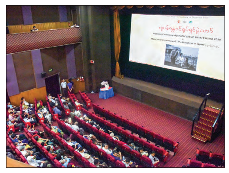
Officials and movie fans attending the opening ceremony of the Japan Classic Film Festival 2020 yesterday.

anese Embassy and Agency for Cultural Affairs, the Japan Classic Film Festival will be held for three days till 8 March.