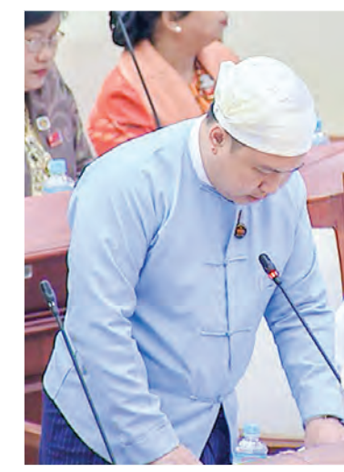
Deputy Minister Dr. Min Ye Paing Hein.

The deputy minister said the sand extraction industry established at the previous site of the village has been allowed to mine as sand from that area could be used for producing high-quality glasses.