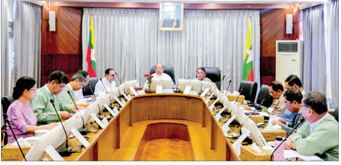
Union Minister U Thaung Tun addresses the coordination meeting of Myanmar Investment Commission in Yangon yesterday.

By the end of January, the countries with the largest investments in Myanmar were Singapore, the People's Republic of China, and Thailand. The top investment sector was oil and gas, which accounted for 26.70 per cent of the permitted foreign investment, followed by the power sector (26.45 per cent), and the manufacturing sector (14.03 per cent). — MNA