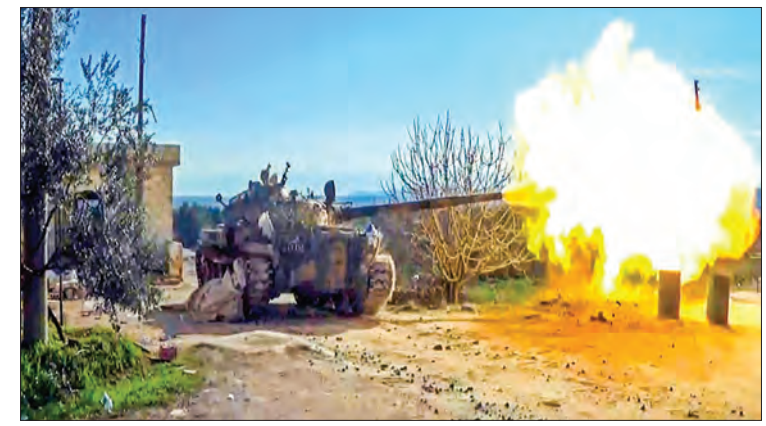
The Syrian government's attempt to take Idlib has forced close to a million civilians to flee their homes.

Meanwhile, Putin said that Russia did not always agree with its Turkish partners, but hoped the deal will serve as a good basis for ending the fighting in the Idlib de-escalation zone, put an end to the suffering of the civilian