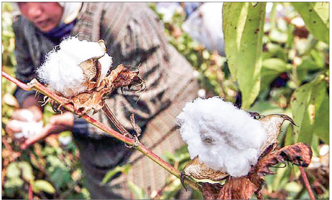
Farmer collecting cotton.

anmar’s cotton. China re-exported Myanmar’s cotton to Viet Nam and Hong Kong. However, we cannot be solely reliant on single market. We have joined hands with India’s merchants. India offers price depending on