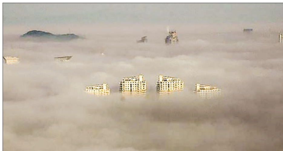
UN experts warn time is running out to stave off climate disaster.

Marseille registered 1.55 million cruise ship visitors last year, and officials hope it will surpass the numbers in Venice this year to become the fourth-largest port of call for cruise ships in the Mediterranean.—AFP ■