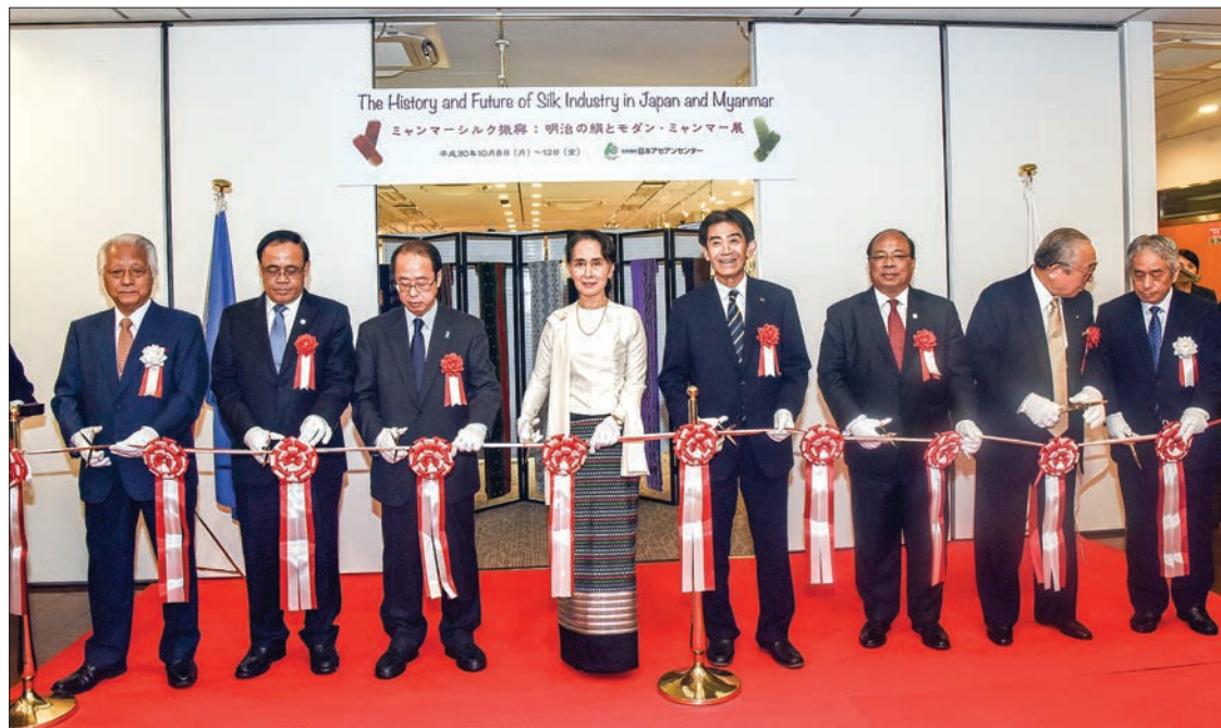
State Counsellor Daw Aung San Suu Kyi cuts the ceremonial ribbon alongside Japanese high-level officials to open the Myanmar Silk Promotion Event at the ASEAN-Japan Centre in Japan.

The State Counsellor said that since the incumbent government took office in 2016, it has been fully committed not just to the pursuit of economic development, but also to striking the right balance between development and stability – both economically and politically – and one cannot survive without the other. Striking the right balance is never easy. In Myanmar, we have boldly decided against taking a populist approach to macroeconomics and chosen to favour the less glamorous but still fundamentally important work required to reform and strengthen the management of our economy, increase resilience to shocks, and to stabilize macroeconomic foundations, such