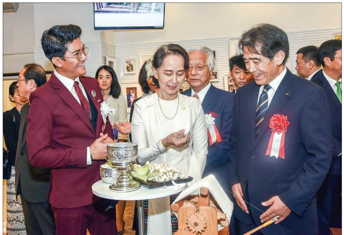
State Counsellor Daw Aung San Suu Kyi observes a silk loom and silk cocoon display at the Myanmar Silk Promotion Event held at the ASEAN-Japan Centre yesterday.