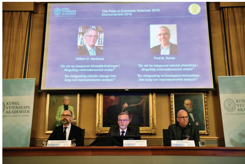
The Royal Swedish Academy of Sciences announced the winners of the Nobel Economics Prize in Stockholm.

STOCKHOLM — US economists William Nordhaus and Paul Romer on Monday shared the 2018 Nobel Economics Prize for constructing “green growth” models that show how innovation and climate policies can be integrated with economic growth.