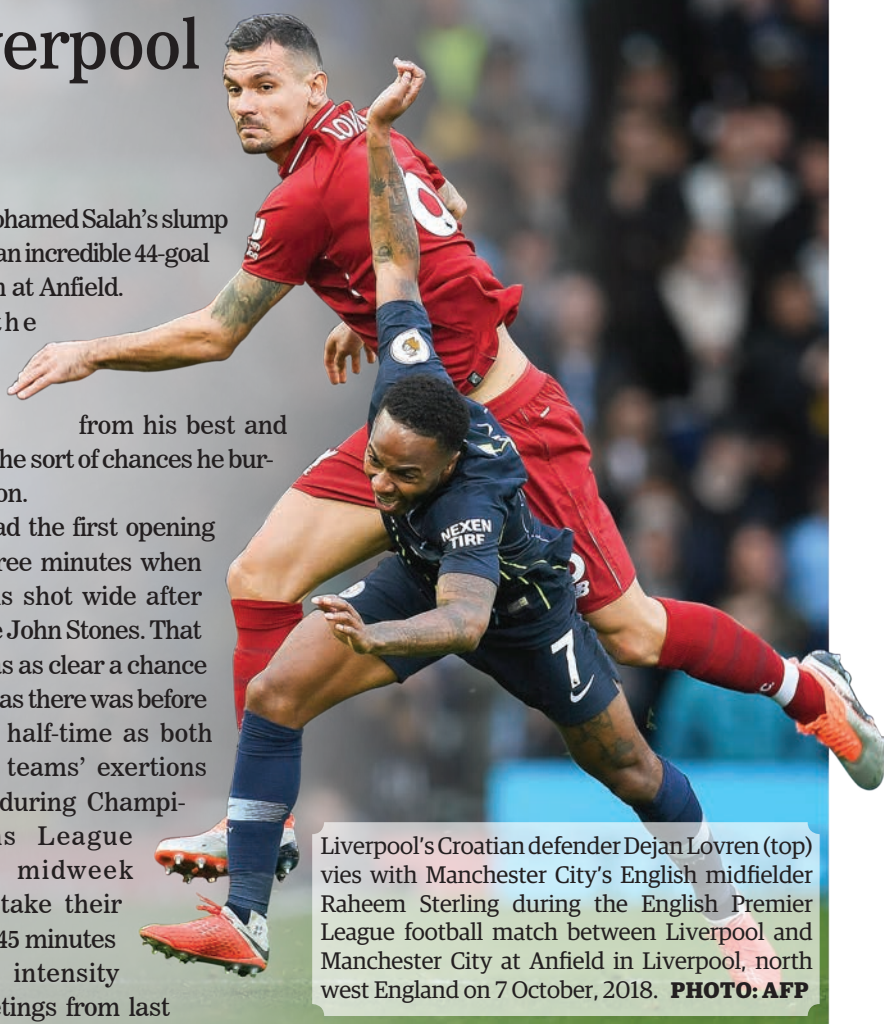
Liverpool's Croatian defender Dejan Lovren (top) vies with Manchester City's English midfielder Raheem Sterling during the English Premier League football match between Liverpool and Manchester City at Anfield in Liverpool, north west England on 7 October, 2018.