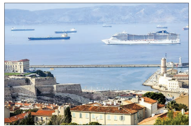
The southern French city of Marseille has been wrestling with growing air pollution as it seeks more of the lucrative cruise tourism business.

“We have only the slimmest of opportunities remaining to avoid unthinkable damage to the climate system that supports life as we know it,” said Amjad Abdulla, chief negotiator at UN climate talks for the Alliance of Small Island States (AOSIS). “Historians will look back at these findings as one of the defining moments in the course of human affairs.”—AFP ■