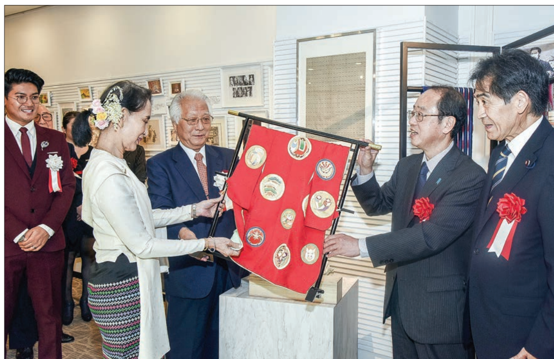
State Counsellor Daw Aung San Suu Kyi observes a piece of silk cloth woven with Japanese designs at the Myanmar Silk Promotion Event at the ASEAN-Japan Centre in Japan yesterday.