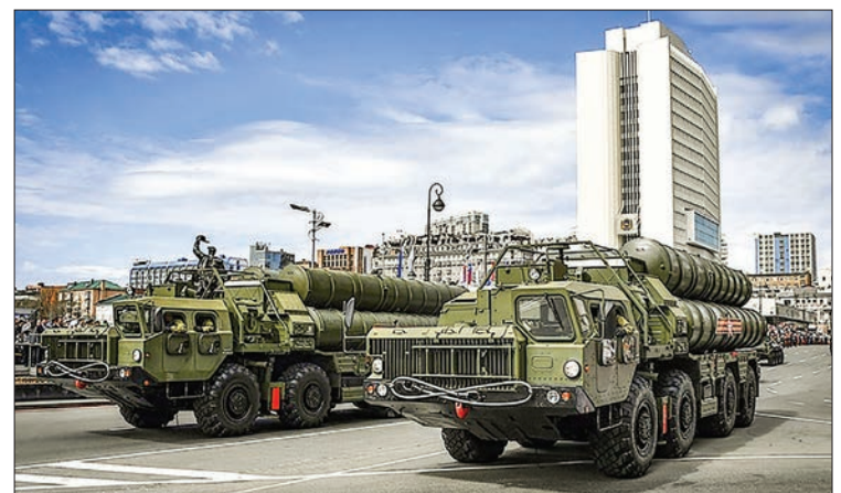
A contract for supplying S-400 air defence missile systems to India was signed on 5 October.

The Countering America's Adversaries Through Sanctions Act (CAATSA) was signed by US President Donald Trump in August 2017. The Act toughens sanctions on Russia, Iran and North Korea. It also provides for US sanctions against third countries cooperating with Russia's defence and intelligence sectors. New Delhi hopes Washington will make an exception for it, because it does not want to lose the Indian defence market. —Tass ■