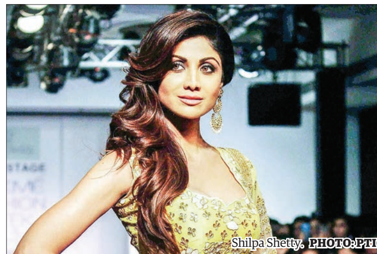
Shilpa Shetty.

MUMBAI — Actor Shilpa Shetty on Sunday said it is time women spoke about their harassment but not under the hashtag ‘MeToo’ but ‘YouToo’ as it is the men who are at fault. Shilpa applauded Tanushree Dutta for speaking up about the alleged harassment she faced from Nana Patekar on a film’s set ten years ago and said it has kick-started a movement.