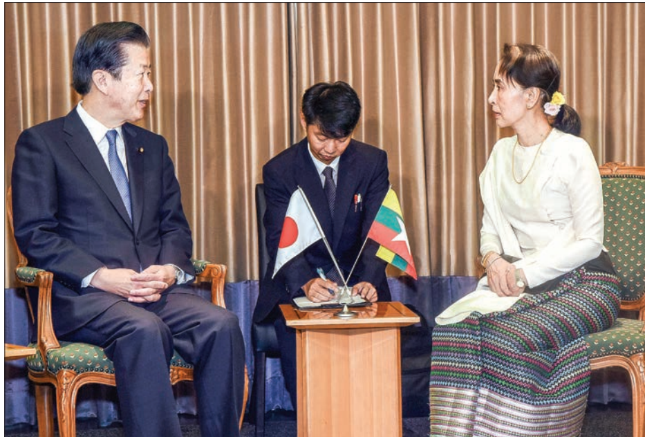
State Counsellor Daw Aung San Suu Kyi holds talks with New Komeito Party leader Mr. Yamaguchi Natsuo in Tokyo, Japan.

(Excerpt from the report on the current work of the Union Government, delivered at the Pyidaungsu Hluttaw on 19 September 2018)