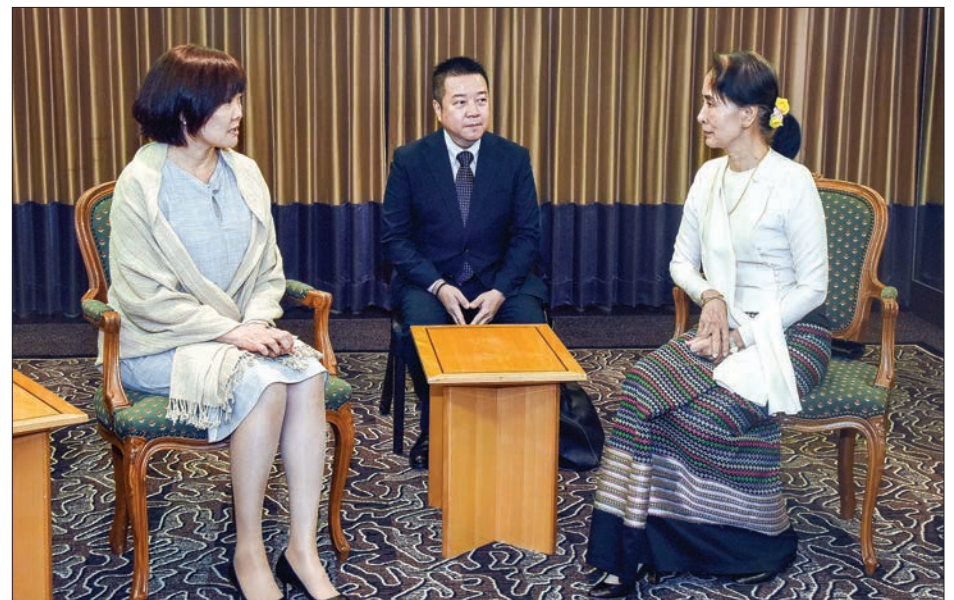
State Counsellor Daw Aung San Suu Kyi meets with Mrs. Akie Abe, wife of the Japanese PM, in Tokyo, in Japan yesterday.