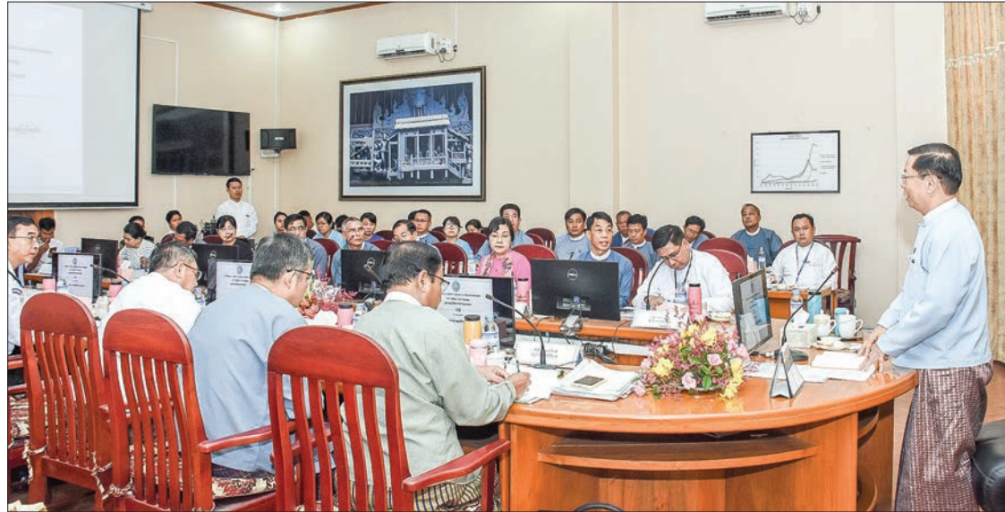
Union Minister Thura U Aung Ko gives speech at the 53 rd meeting of ASEAN-COCI organizing steering committee coordination meeting in Nay Pyi Taw yesterday.

At the meeting, 53 rd ASEAN-COCI Meeting organizing steering committee chairman Union Minister Thura U Aung Ko said the 53 rd meeting will be held in Myanmar in November and the meeting will be attended by representatives from ASEAN countries. The coordination meeting of the 53 rd ASEAN-COCI Meeting organizing steering committee was held in order to successfully hold the 53 rd ASEAN-COCI Meeting, said the Union Minister.