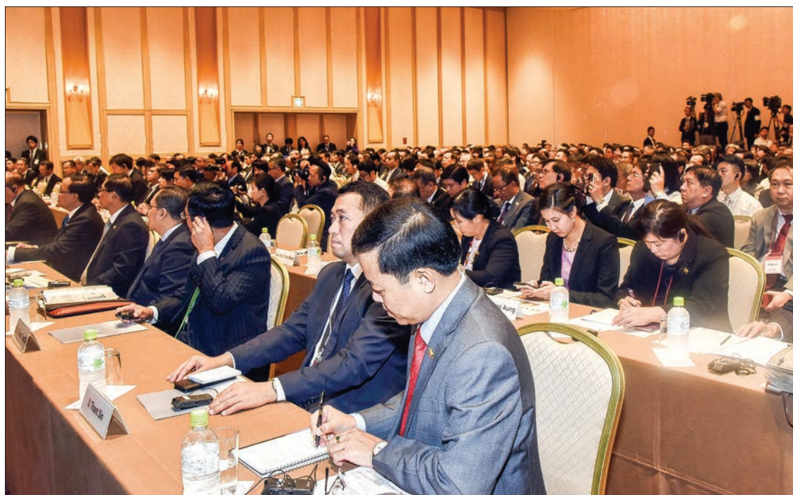
State Counsellor Daw Aung San Suu Kyi delivers the speech at the Myanmar Investment Conference in Tokyo, Japan yesterday.

STATE Counsellor Daw Aung San Suu Kyi, who is on a working visit in Tokyo, Japan, attended the Myanmar Silk Promotion Event facilitated by the ASEAN-Japan Centre and the Myanmar Investment Conference discussing under the topic 'Strengthening the Bond Between Myanmar and Japan', both held yesterday.