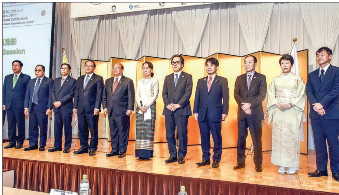
State Counsellor Daw Aung San Suu Kyi poses a documentary photo with attendees at the Myanmar Investment Conference in Japan.

The State Counsellor expressed her personal and sincere appreciation to the Government of Japan and to JICA for their instrumental support towards the development of the Myanmar Investment Promotion Plan, which will promote even greater foreign direct investment in Myanmar, and which will play a significant role in supporting the Myanmar Japan Joint Initiative (MJJI) programme, in part by identifying, and then resolving, impediments faced by investors, and providing further policy recommendations. She also thanked JICA for being very careful in coordinating their work to our development aims. It is very important that we should all coordinate and cooperate if we are to make the fastest progress possible in a