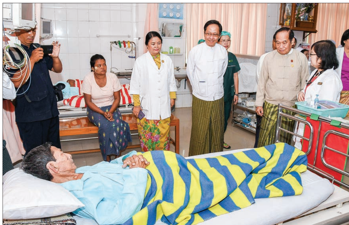
Union Minister Dr. Myint Htwe encourages a patient seeking treatment at the cardiac intensive care unit in the 1000-bed General Hospital in Nay Pyi Taw yesterday.

Speaking at the ceremony, Union Minister for Health and Sports Dr. Myint Htwe said cardiac related diseases are not like any other diseases as without timely and systematic treatment, patients can lose their lives. Hence, the opening of Cardiac Catheterization Laboratory and treating cardiovascular disease is an important occasion because it will bring huge benefits to the people. He then thanked and put on record the efforts of the superintendent, doctors, nurses, technicians and staffs of 1000-bed Nay Pyi Taw General Hospital, specialists and officials from Yangon General Hospital, University of Medicine (Mandalay) and North Okkalapa General Hospital. The Union Minister also told