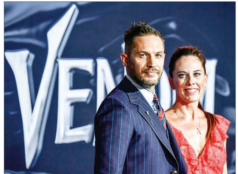
“Venom,” which stars Tom Hardy (L) was met harshly by critics, but had a record opening weekend.

Third place went to Warner Bros.’s “Smallfoot,” with earnings of $14.9 million in its second weekend. The comic family animation