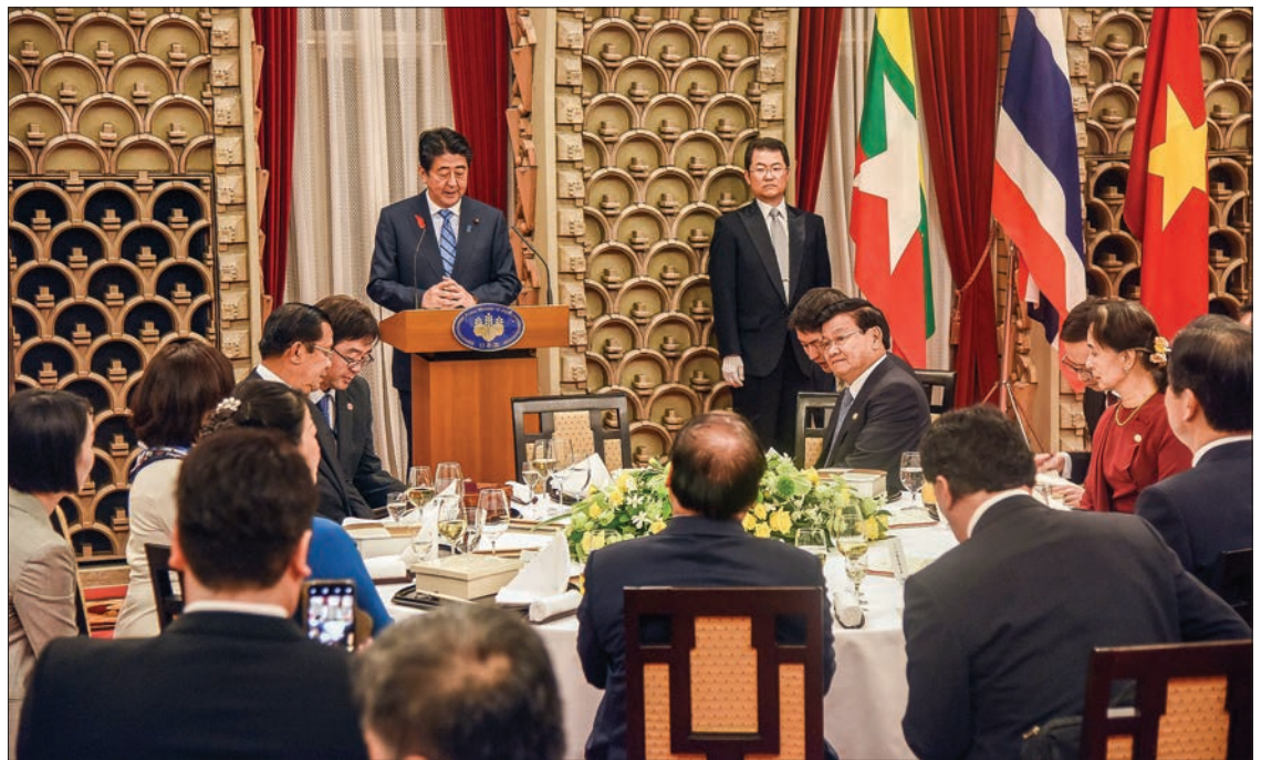
State Counsellor Daw Aung San Suu Kyi attends a banquet dinner hosted by Japanese Prime Minister Mr. Shizo Abe yesterday.

that peace, reconciliation, harmony, stability, rule of law, human rights – all these have to be taken into consideration when we are looking for more investors, for greater economic opportunities, and when we are looking to our friends to come and join us in our economic ventures. It is not simply an economic venture; it's a national venture which incorporates many, many strands – social, economic, political, she said. The State Counsellor expressed her wish to be very open and transparent with our friends. She requested that if there were any concerns or worries, to please discuss this openly with us and to please keep an open mind. Unless you keep an open mind, you will not be able to see what the true situation is like, she said. She continued, saying, and while we are prepared to discuss openly with you, I think it is also important that you are prepared to listen and to consider seriously in what way we can work together not just to make bilateral trade and investment