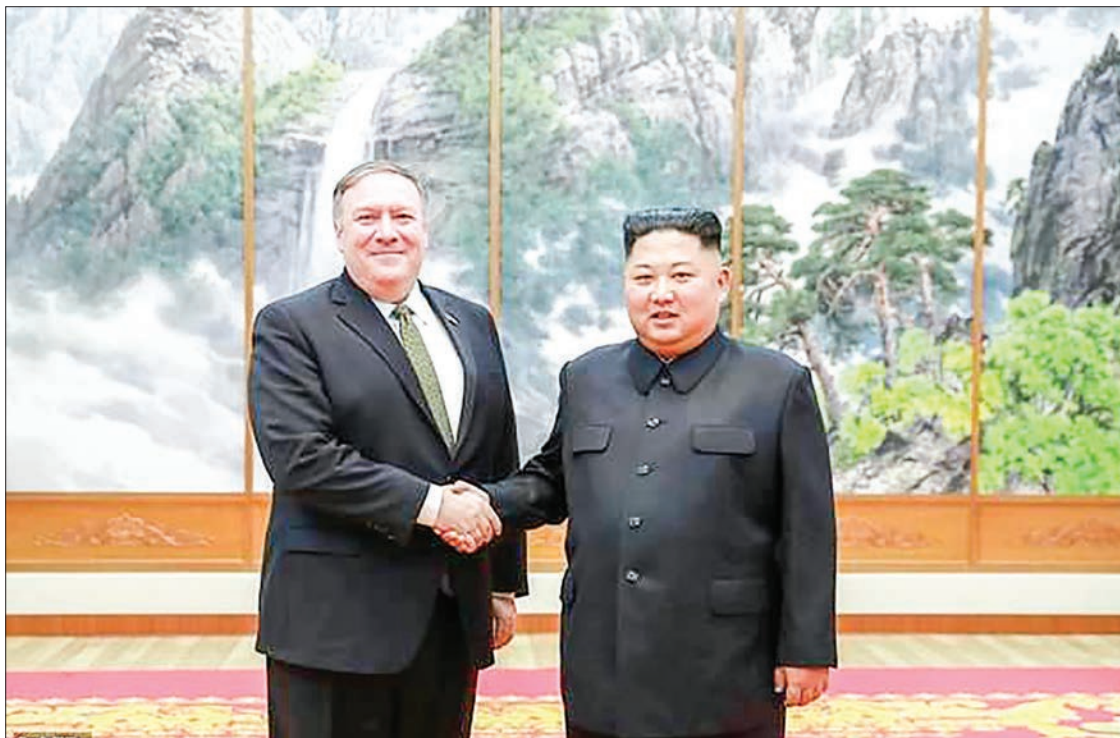
North Korea's leader Kim Jong Un is ready to allow international inspectors in to see dismantled nuclear sites, said US Secretary of State Mike Pompeo.

The facility, buried inside a mountain near the border with China, was the staging ground for all six of the North's nuclear tests.