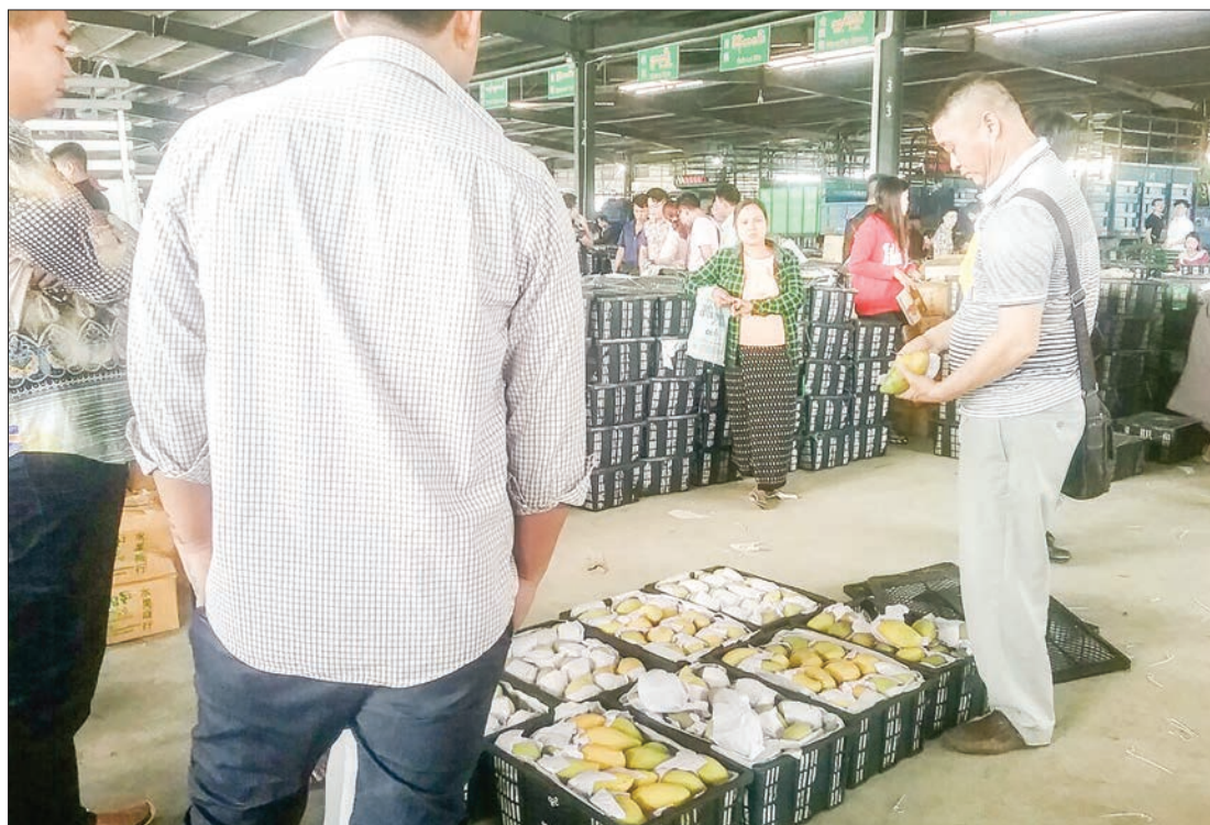
Merchants check the Myanmar’s mangoes and fruits at Muse 105 mile check-point.

cased at China-ASEAN Expo held in Nanning city. They also offered to buy dried Kayen chilli. Nevertheless, Myanmar cannot seek China’s AQSIQ registration. Therefore, MFVP called for government to government discussion for this between the two countries. Additionally, he also requested to set respective zone areas for each vegetable to produce quality vegetables and fulfill the market’s demand. —Minthit / Ko Htet ■