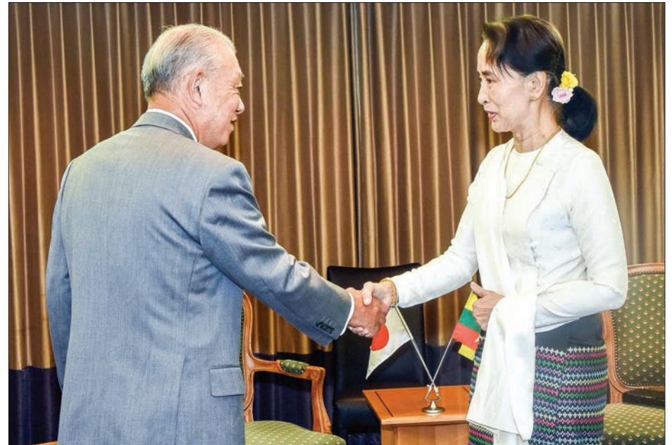
State Counsellor Daw Aung San Suu Kyi shakes hands with Mr. Yohei Sasakawa, the Special Envoy of the Japanese Government for National Reconciliation in Myanmar.