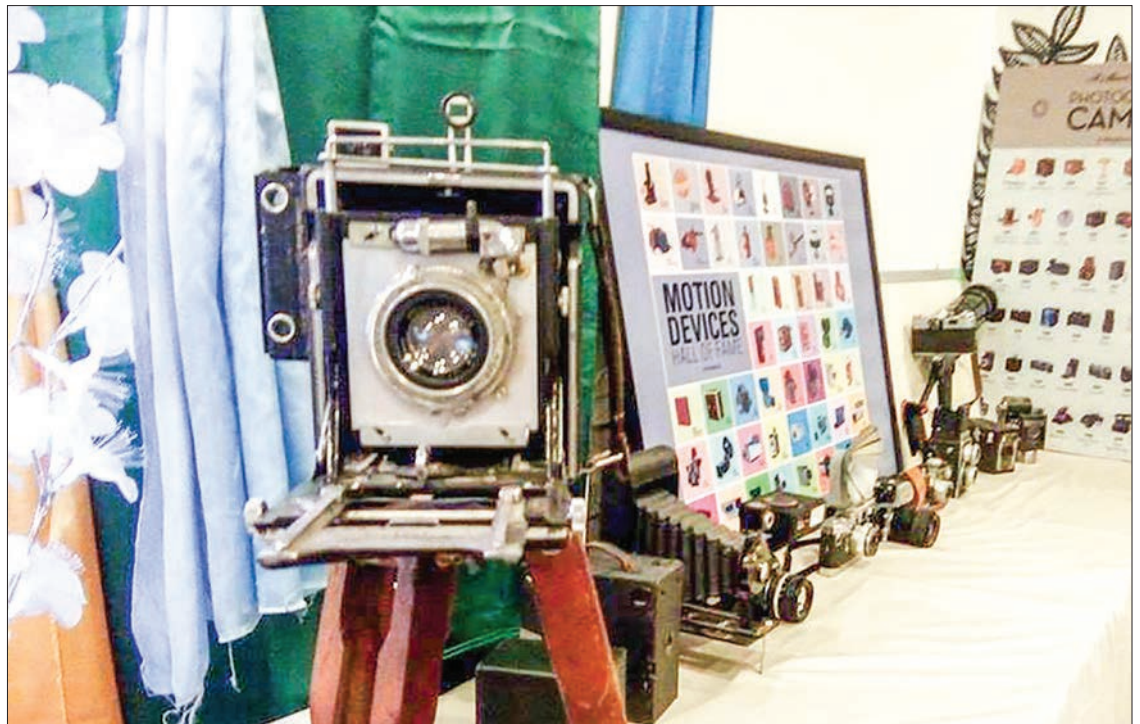
First antique cameras exhibition to be held in Yangon from 19 to 21 October.

"Actually I would like to show the cameras I collected in a small museum but there is difficulty to find even a small place in Yangon. It wouldn't be easy. That is why I'm holding this exhibition