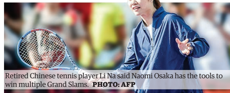
Retired Chinese tennis player Li Na said Naomi Osaka has the tools to win multiple Grand Slams.