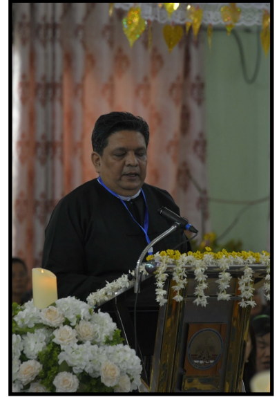
Union Minister for Religious Affairs and Culture and officials from respective religious associations reading out the messages of condolences