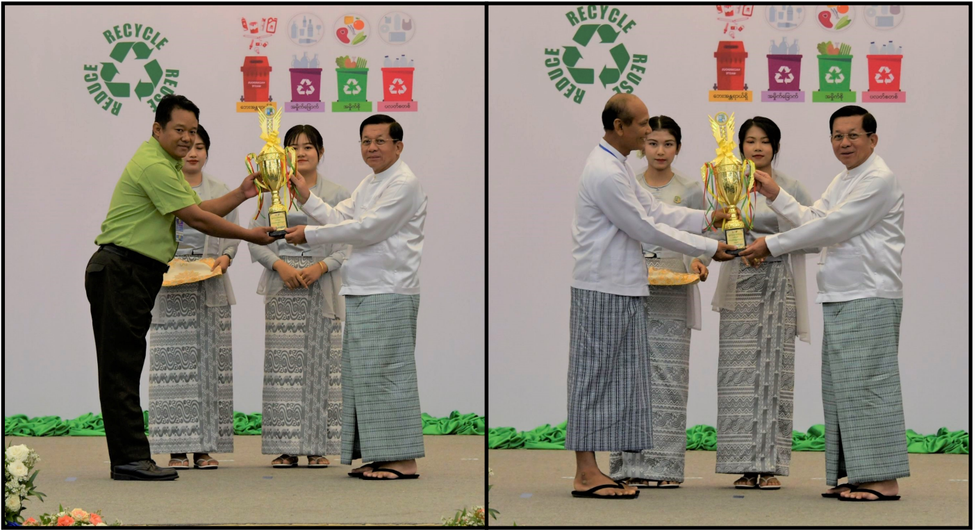
SAC Chairman Prime Minister presenting the prizes to the officials from the town and village that secured the best environmental management town award and the best environmental management village award