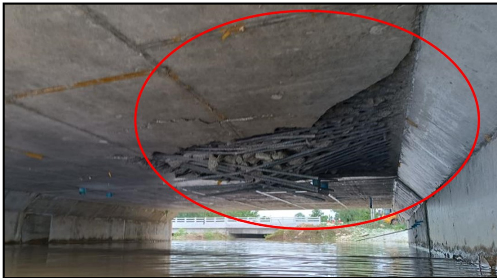
Attack of the terrorists leaving concrete slab of No (161) Railway Bridge damaged