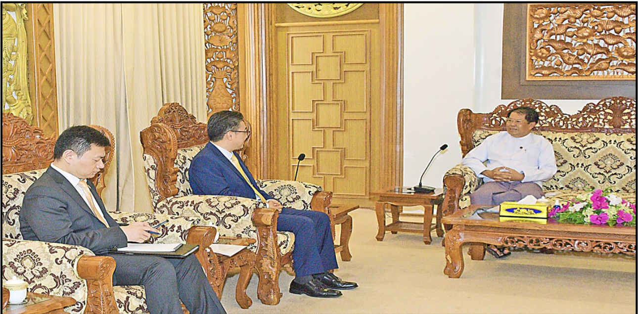
Union Minister U Than Swe receiving a delegation led by ASEAN-China Centre Secretary-General Mr. Shi Zhongjun

Union Minister for Foreign Affairs U Than Swe and Union Minister for Education Dr. Nyunt Pe received a delegation led by Mr. Shi Zhongjun, Secretary-General of the ASEAN-China Centre (ACC) at the respective ministries in Nay Pyi Taw on 20 July. Union Minister for Hotels and Tourism U Aung Thaw received a delegation led by