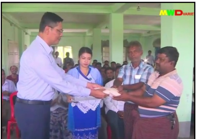
Rakhine State Chief Minister and party providing relief supplies to the displaced persons living in the IDP camps in Sittwe at the meeting with them