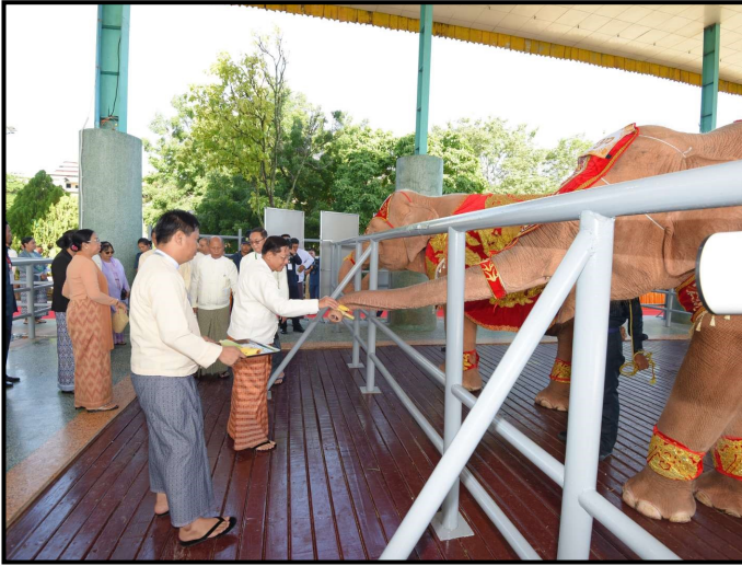
SAC Chairman Prime Minister and wife feeding precious white elephants and their companion elephants in the white elephant shed