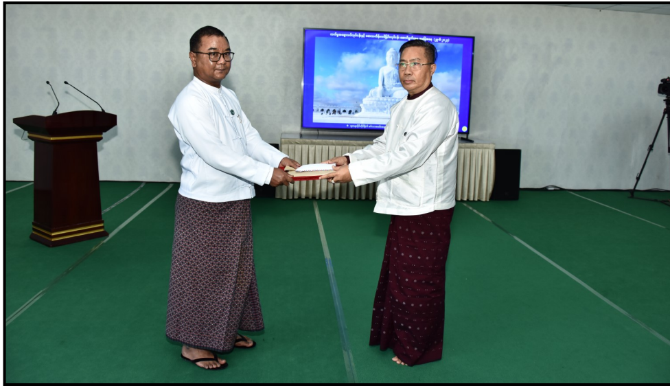
Cash for building the Maravijaya Buddha Image and the Park donated by media agencies in progress

was successfully over. Media personnel at the press conference donated cash to the fund for construction of the Buddha Image and the Park to Maj-Gen Zaw Min Tun.