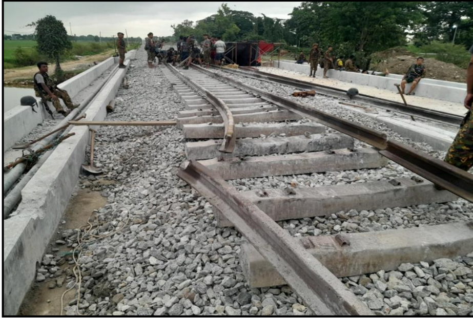
Damages of rail track in the aftermath of brutal mine attacks of the terrorists

Myanma Railways under Ministry of Transport and Communications has managed to run 18 passenger trains (express), 14 mail-trains, eight passenger and freight trains, two RBE passenger trains and 35 circular trains, totalling 77 trains and six freight trains on a daily basis, aiming to travel for passengers across the country with cheap fare and good flow of goods.