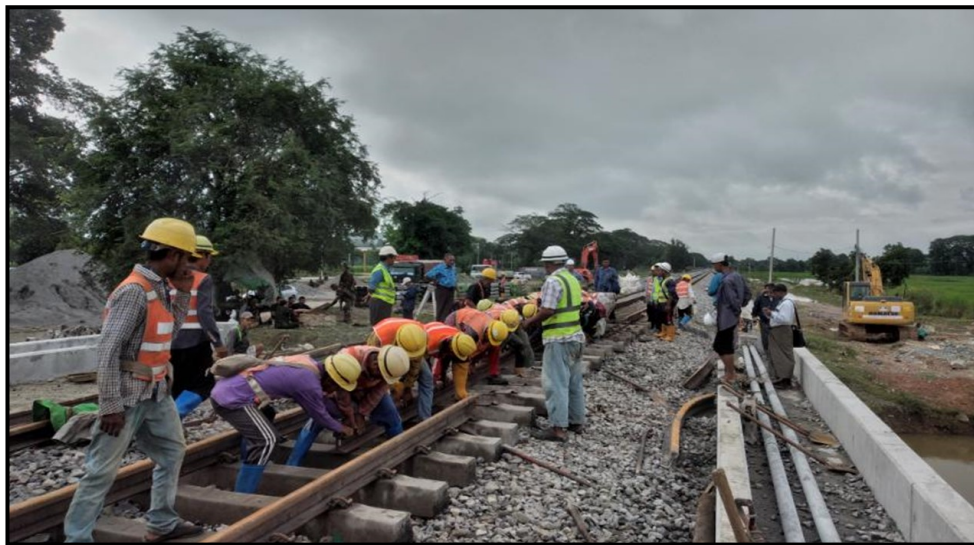
Repairing of the damaged rail track in timely manner

attacks on rail-bridges and 12 arson attacks on railway stations and family housings of civil servants, it is reported.