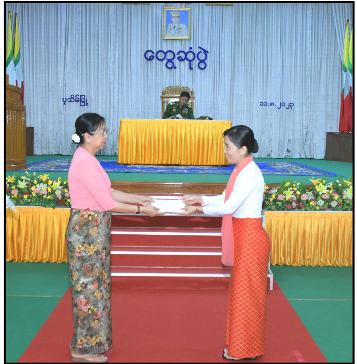
SAC Chairman Commander-in-Chief of Defence Services and wife providing foodstuffs and cash rewards for the military personnel and their families through officials

and party cordially greeted officers, other ranks and families who attended the meet-