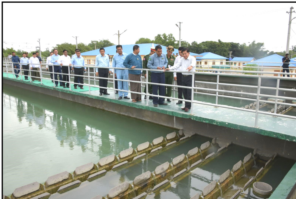
SAC Chairman Prime Minister inspecting water purification process at the plant