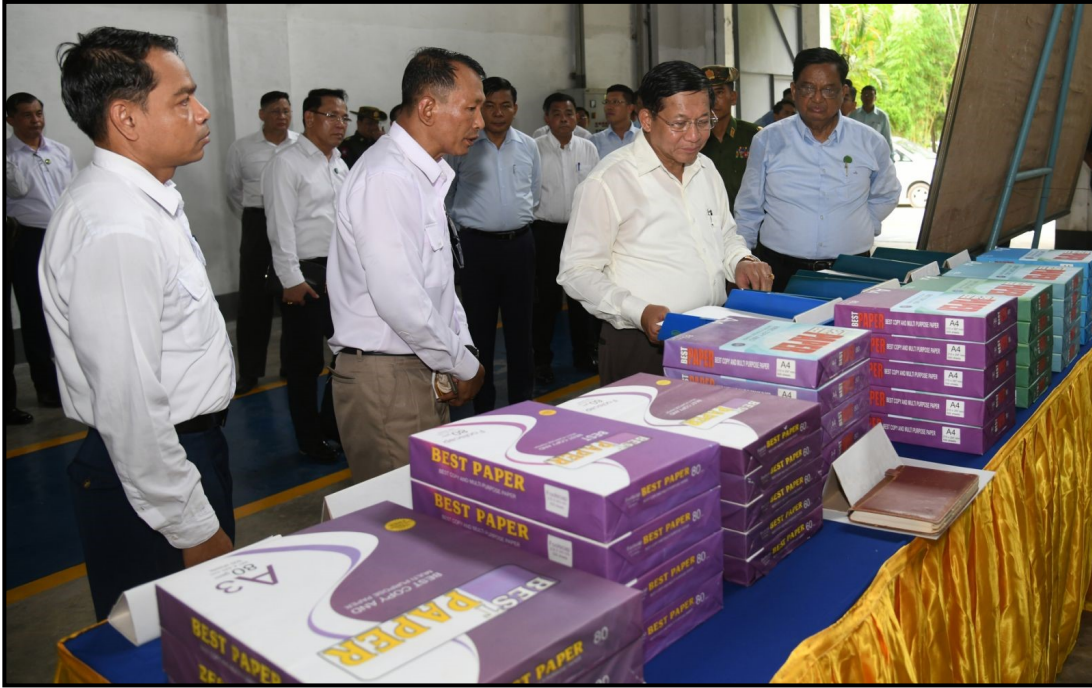
SAC Chairman Prime Minister inspecting round the Advanced Paper Mill (Thaboung)