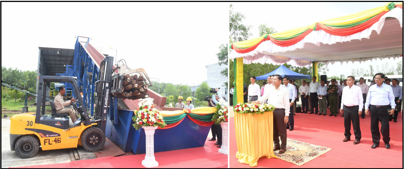
SAC Chairman Prime Minister launching the chip preparation plant for operating the Newsprint Factory (Thaboung)