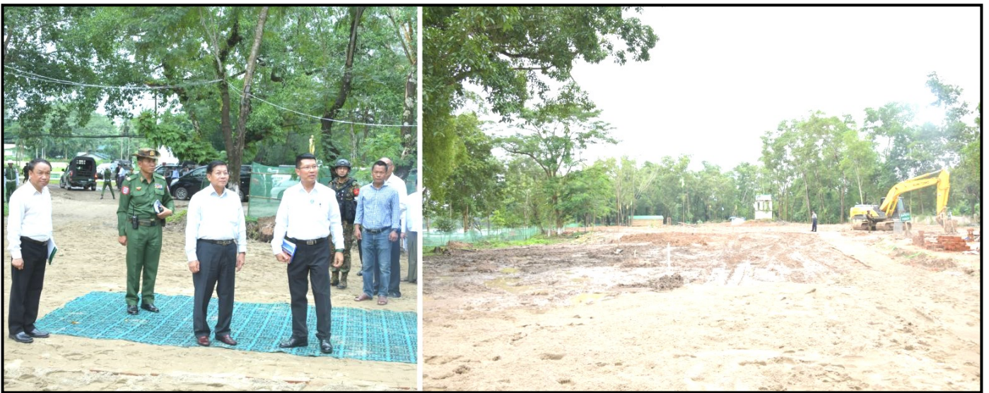
SAC Chairman Prime Minister inspecting round the construction of high-standard swimming pool in Patheingyi

The water supply project in the city can purify 4.5 million gallons of water from the Ngawun River a day. Water is now distrib-