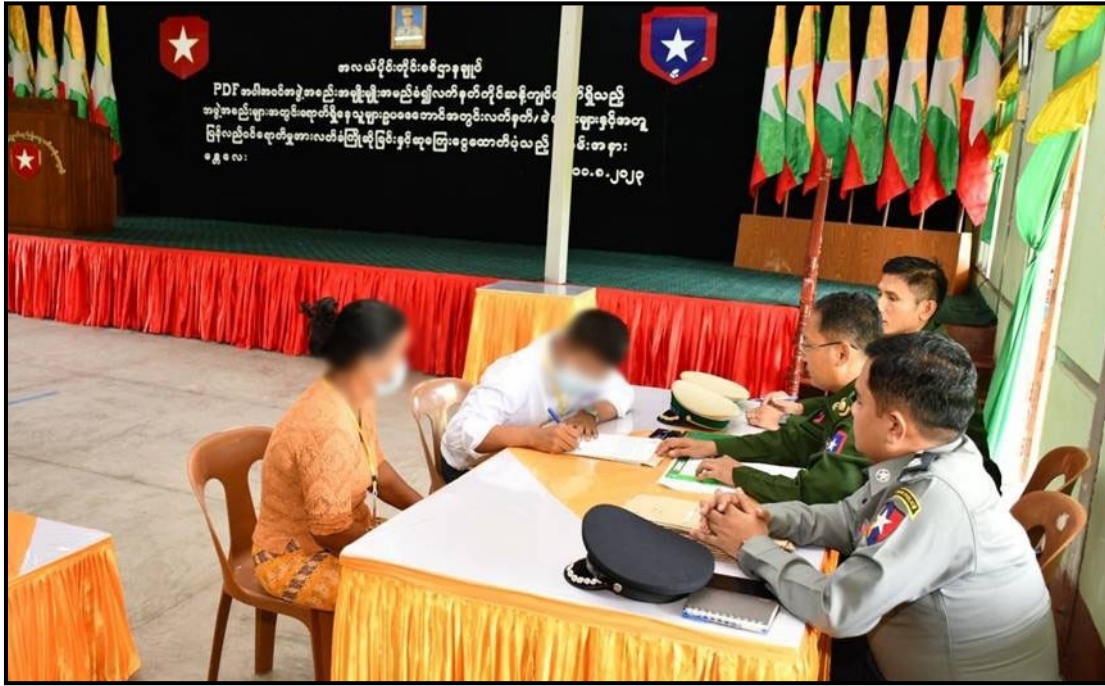
Officials entrusting PDF members with no crime records returning legal fold in Mandalay Region and Kachin State to their parents