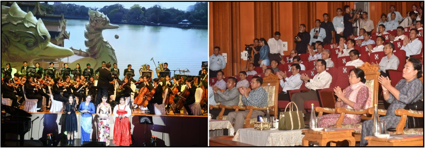
SAC Chairman Prime Minister and wife together with dignitaries enjoying excellent entertainments of the State Orchestra