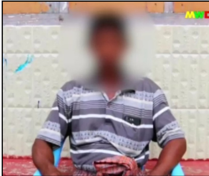
A person who were evacuated from PDF terrorists saying his experiences in the incident

eration, security personnel managed to evacuate 29 local people and a firefighter totaling 30 at 5:10 am morning. Moreover, security personnel seized three improvised mortars, 42 home-made grenades, 12 improvised rockets, four homemade guns, 16 assorted explosive mines and other related items.