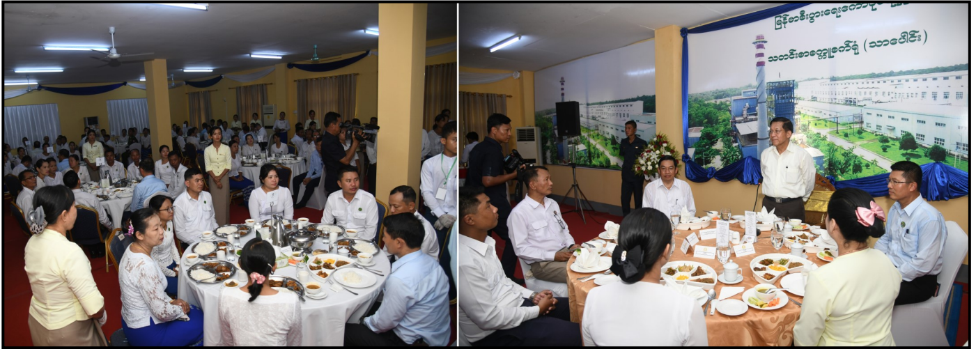
SAC Chairman Prime Minister giving instruction to the staff of the factory before the lunch