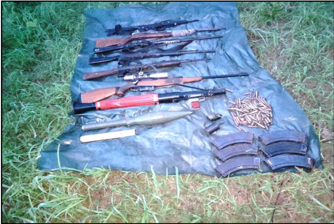
Weapons/ammunition and related items seized from CNF and so-called PDF terrorists

CNF members and terrorists of the so-called PDF launched a surprise attack on a local military battalion located in Falam township of Chin state on 12 August. They attacked the battalion at four locations using heavy weapons and small arms. However, the prompt retaliation attack of officers, soldiers and family members of the battalion well-organized and prepared for the battalion's security at high alert managed to repel the enemy's attacks. As a result, the enemy failed to capture the battalion and retreated in disarray with heavy casualties to the