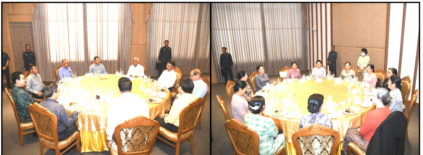
SAC Chairman Prime Minister and wife having tea party together with State dignitaries and artists