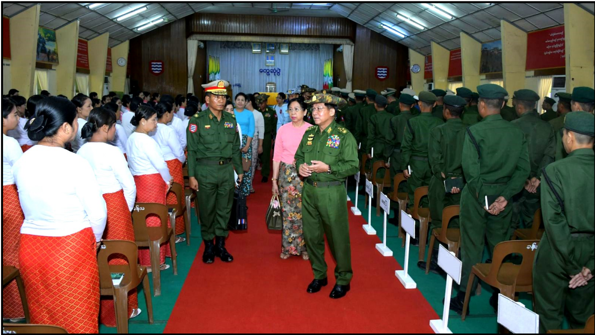
SAC Chairman Commander-in-Chief of Defence Services and wife cordially greeting the officers, other ranks and their families