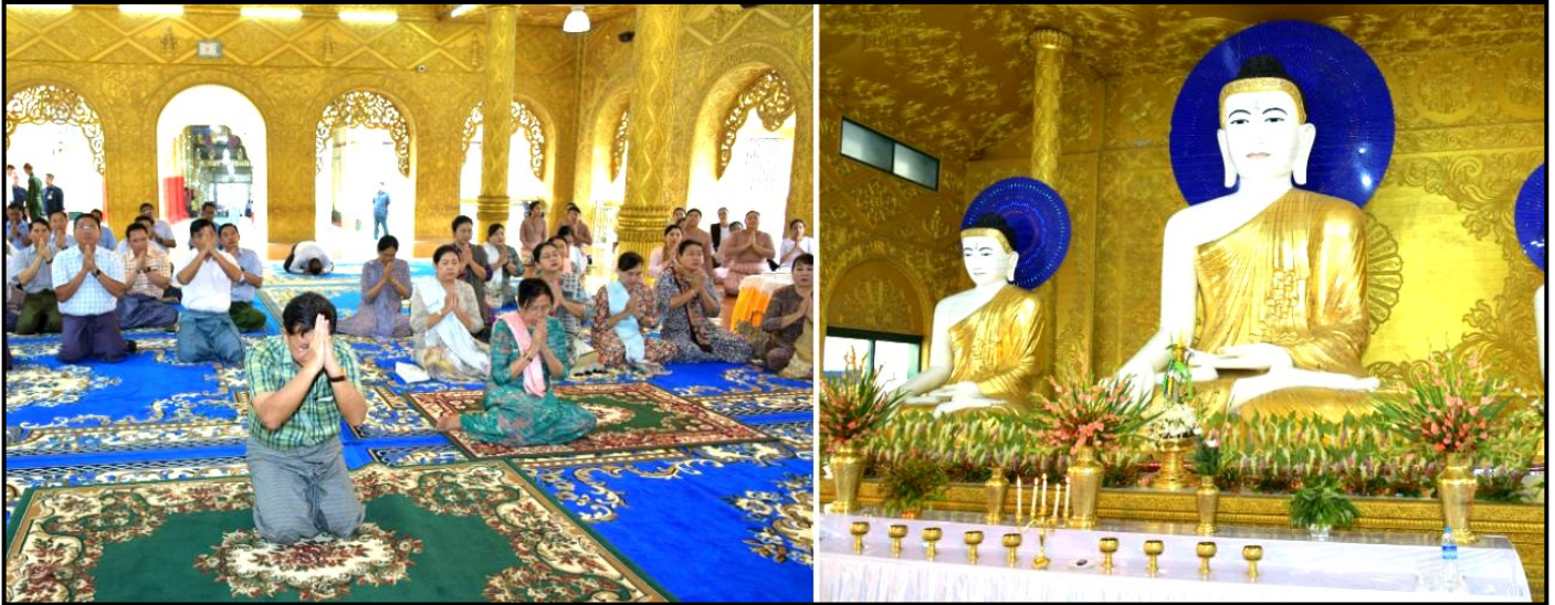
SAC Chairman Prime Minister and wife paying homage to Shwemuhtaw Pagoda in Pathein City