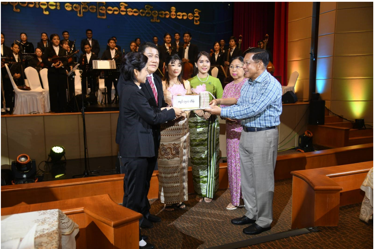
SAC Chairman Prime Minister and wife presenting bouquets and cash awards to the State Orchestra and vocalists who performed entertainments