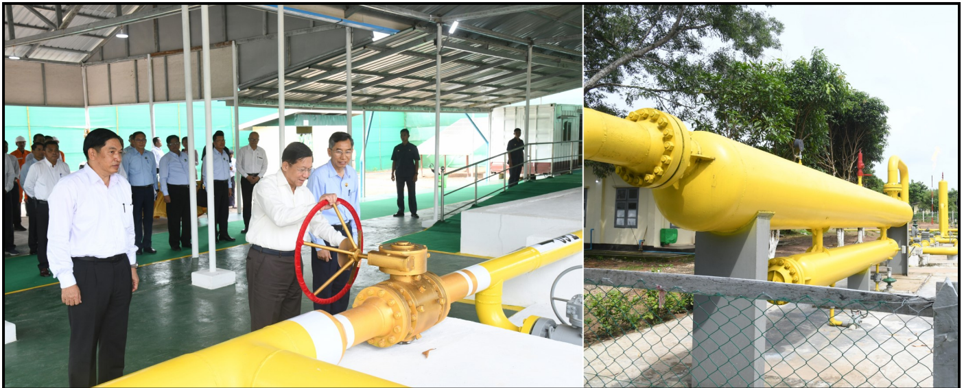
SAC Chairman Prime Minister launching the gas station at the Thaboung Natural Gas Distribution Camp by switching on the gas pipeline bar