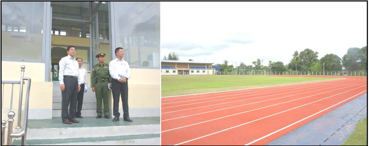
SAC Chairman Prime Minister inspecting Kothein Stadium in Patheingyi