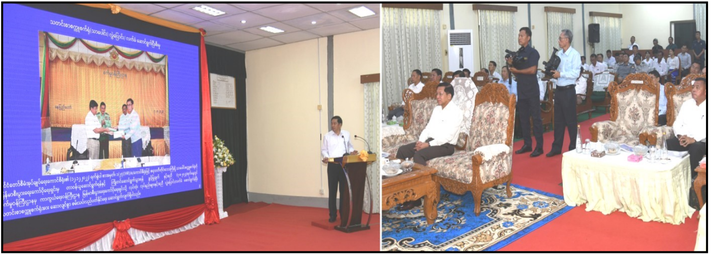
SAC Chairman Prime Minister hearing reports on the functions of the factory presented by an official