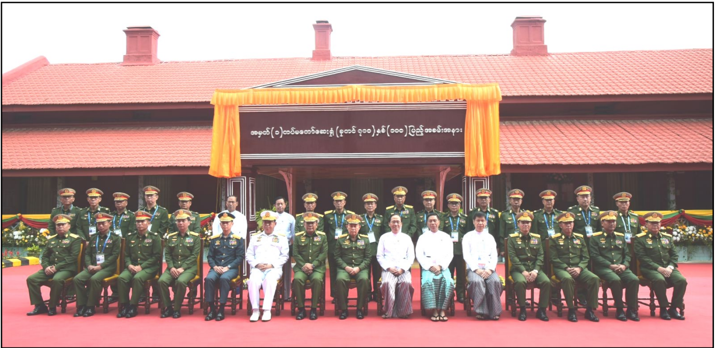
SAC Vice-Chairman Deputy Commander-in-Chief of Defence Services taking a commemorative photo together with dignitaries

for cardiac surgery and five more for gastro-intestinal treatment.