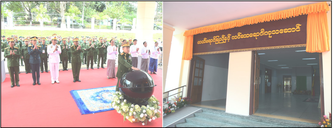
SAC Vice-Chairman Deputy Commander-in-Chief of Defence Services pressing the button to unveil the signboard of the Cancer Radiation Treatment Ward

The SAC Vice-Chairman Deputy Commander-in-Chief of Defence Services Commander-in-Chief (Army) Vice-Senior General Soe Win delivered honourable remarks at the Opening Ceremony of the Cancer Radiation Treatment Ward Marking Centennial Celebration of No.1 Military Hospital (700-Bed), and the 30 th Myanmar Tatmadaw Medical Conference as follows: