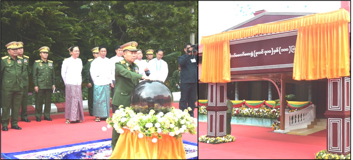
SAC Vice-Chairman Deputy Commander-in-Chief of Defence Services pressing the button to unveil the signboard marking the centenary ceremony of No.1 Military Hospital (700-bed)

The Opening Ceremony of the Cancer Radiation Treatment Ward Marking Centennial Celebration of No.1 Military Hospital (700-Bed), and the 30 th Myanmar Tatmadaw Medical Conference took place at the hospital in PyinOoLwin on 2 October. The Vice-Chairman of the State Administration Council (SAC) Deputy Commander-in-Chief of Defence Services Commander-in-Chief (Army) Vice-Senior General Soe Win attended the event.