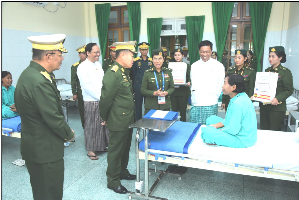
SAC Vice-Chairman Deputy Commander-in-Chief of Defence Services comforting the patients receiving medical treatments at the cancer radiation treatment ward and providing foodstuff to them