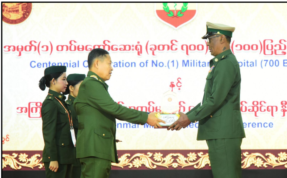
SAC Vice-Chairman Deputy Commander-in-Chief of Defence Services presenting prize to a commemorative award-winning officer