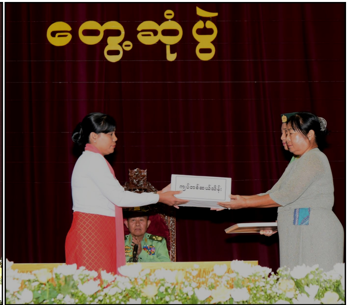
SAC Vice-Chairman Deputy Commander-in-Chief of Defence Services and wife providing cash assistance and foodstuff for the military personnel and families of the PyinOoLwin Station through officials