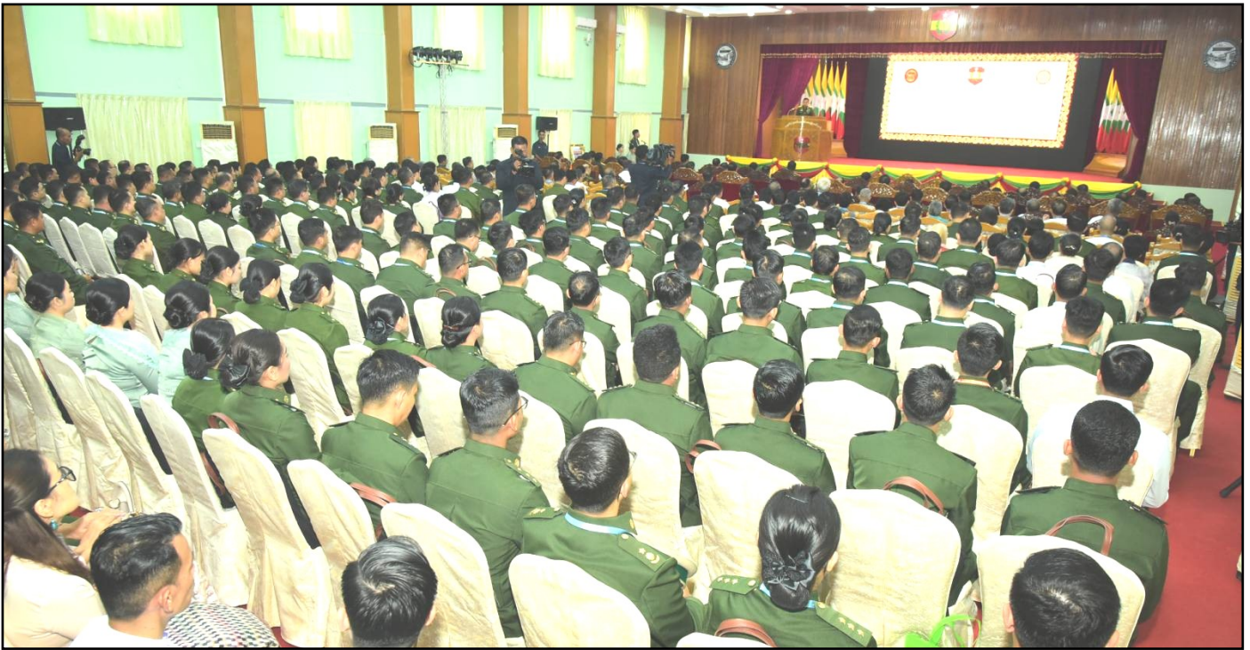
SAC Vice-Chairman Deputy Commander-in-Chief of Defence Services delivering honourable speech

tions on 781 patients successfully. The injury and orthopedic department has conducted surgical operations on 6,153 patients successfully including 2,684 major surgeries and 3,469 minor surgeries.