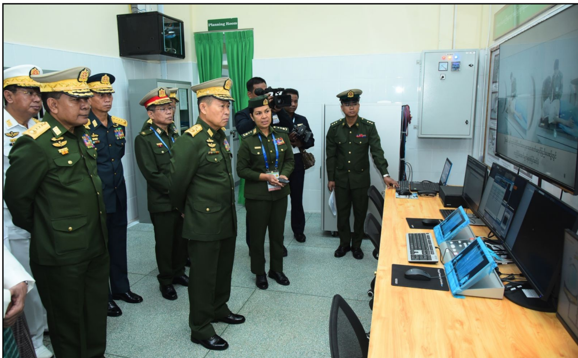
SAC Vice-Chairman Deputy Commander-in-Chief of Defence Services and party viewing round the Cancer Radiation Treatment Ward