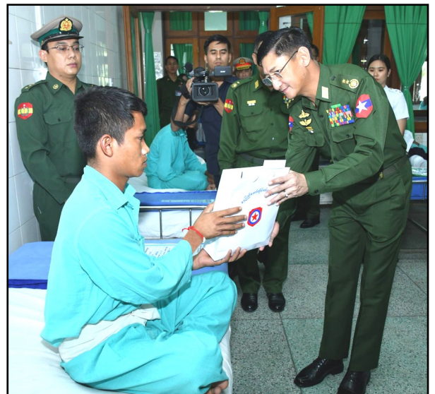
Commander-in-Chief (Air) and Adjutant-General presenting cash assistance and gifts to the officers and other ranks patients