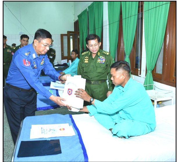
Chief of the General Staff (Army, Navy and Air) and Commander-in-Chief (Navy) presenting cash assistance and gifts to the officers and other ranks patients