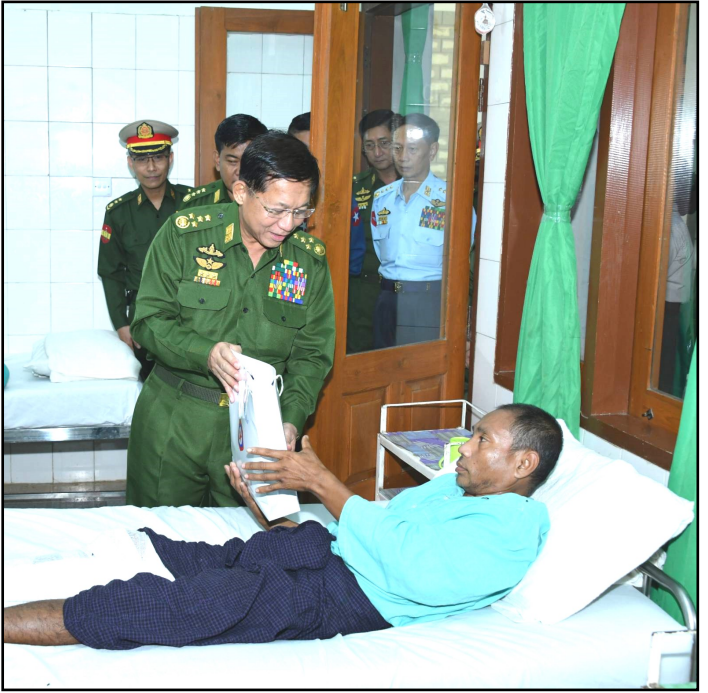
SAC Chairman Commander-in-Chief of Defence Services presenting cash assistance and gifts to the officers and other ranks patients