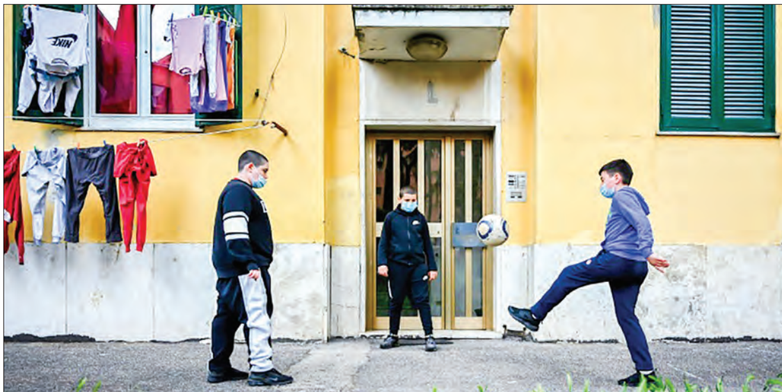
Italy is full of rumours and speculation about when people will finally be allowed to walk the streets freely for the first time since early March.

He said some activities will be allowed to resume “according to a well-structured programme that balances the need to protect people’s health with the need to resume production”.— AFP ■