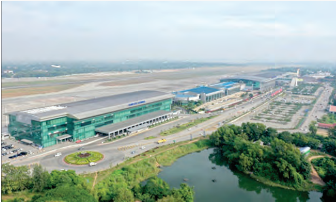
Yangon International Airport is the primary international airport of Myanmar.