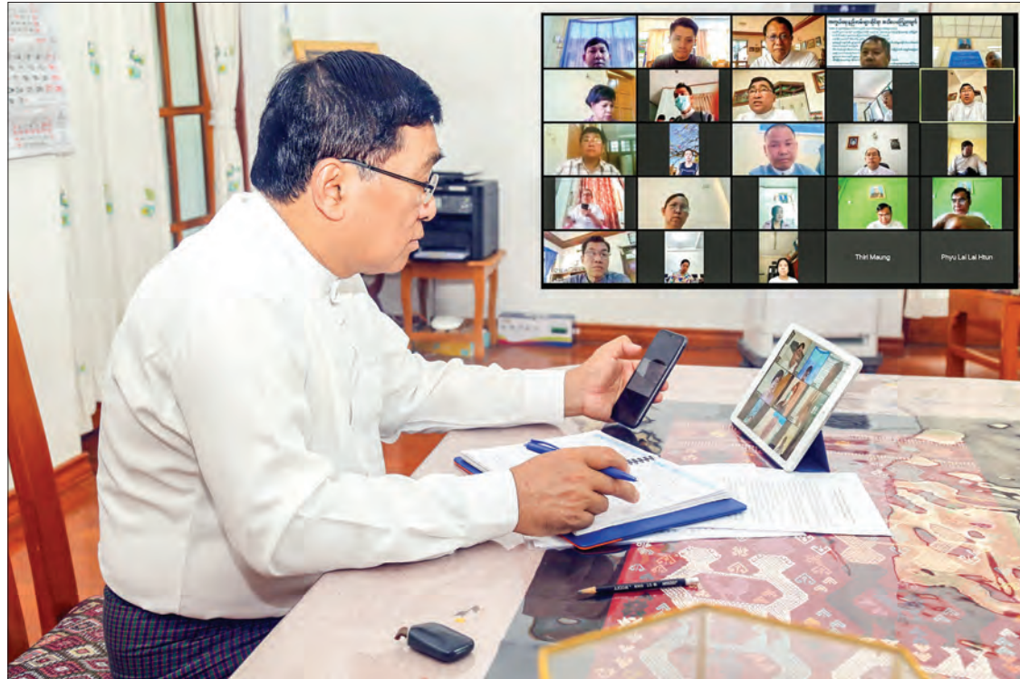
Union Minister Dr Win Myat Aye discusses on video conference with Rakhine State Chief Minister U Nyi Pu, Deputy Minister U Soe Aung and officials from local government and the ministry.

UNION MINISTER for Social Welfare, Relief and Resettlement Dr Win Myat Aye discussed implementation of the COVID-19 prevention plans at the camps and the conflict shelters in Rakhine State and other areas. The meeting on video conferencing yesterday was taken part by Rakhine State Chief Minister U Nyi Pu, Deputy Minister U Soe Aung and officials from local government and the ministry.