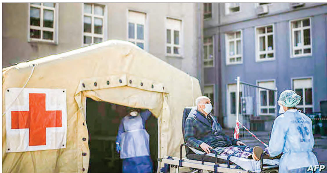
A health worker pushes a man on a stretcher towards a triage tent for suspected COVID-19 patients, outside the Santa Maria Hospital in Lisbon, Portugal, 2 April, 2020.