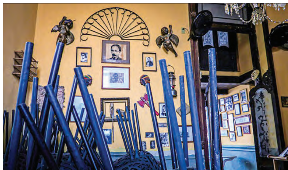
Cuba's most famous privately-owned restaurant, La Guarida, has been closed for more than a month due to the coronavirus pandemic.

"Many private enterprises were built on tourists, because no Cuban is going to go to a restaurant and spend $100 on a meal," said economist Omar Everleny Perez.—AFP ■