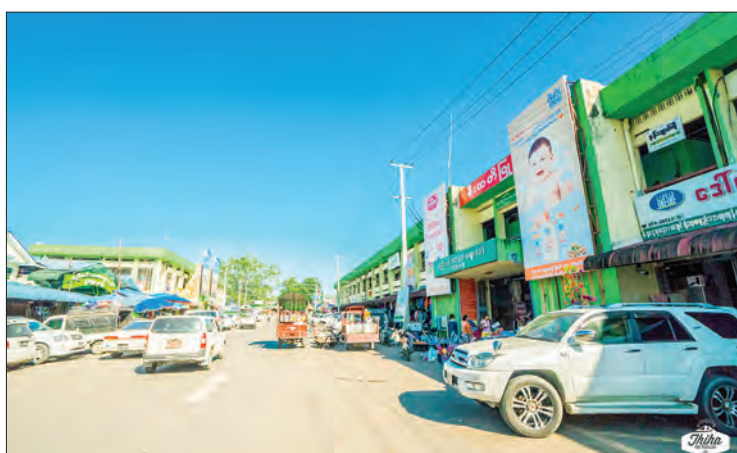
Myoma Market (1).

they can visit all parts of Myitkyina by hiring a car. If you go by Travels & Tours, you can make friends while you are taking a highway bus. You can visit most of worth-visiting places together with the guide. It can bring savings not only in time but also in cost. Going to Myitkyina of own plan can cost more. Well, let's see where to visit across Myitkyina.