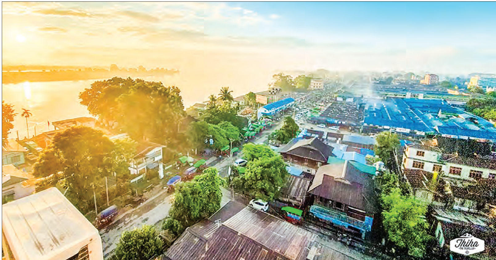
The photo shows an aerial view of Myitkyina.