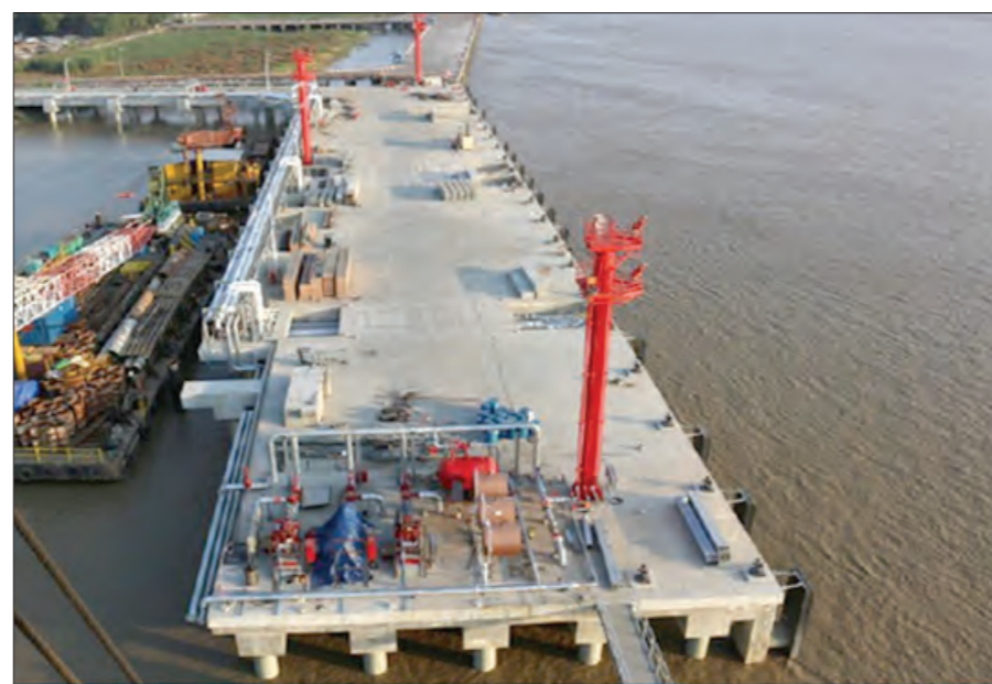
Puma Energy Asia Sun, a joint venture between Puma Energy and local firm Asia Sun Energy, is looking to move beyond storage services in Myanmar to include oil products distribution in the country.

"Telephone density was 86.5% in 2015-2016 financial year but has since reached 147.46%", said the U Thant Sin Maung. "In a population of 52 million, there are 79 million active SIM cards meaning teledensity is 47% over compared to the active population. Essentially, it means 94 out of every 100 people are able to