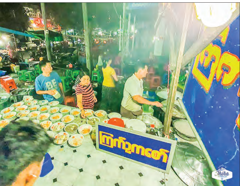
Egg with sticky rice brew at the Night Market.