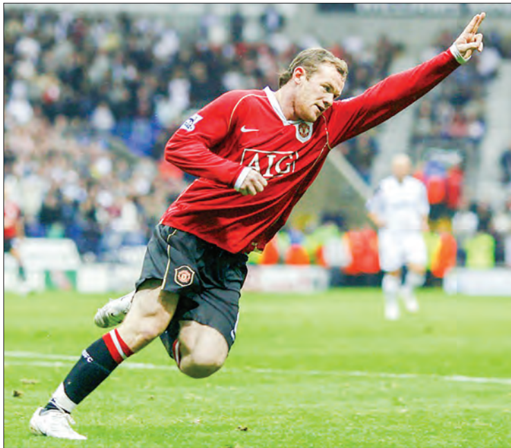
Wayne Rooney is Manchester United’s record scorer but says he should have hit more goals.

“How did I become a record-breaker if I wasn’t a natural scorer? Time,” Rooney explained. “I played for United for 13 years, England for 15 years. I had time to break those records — and looking back I should have scored more.”