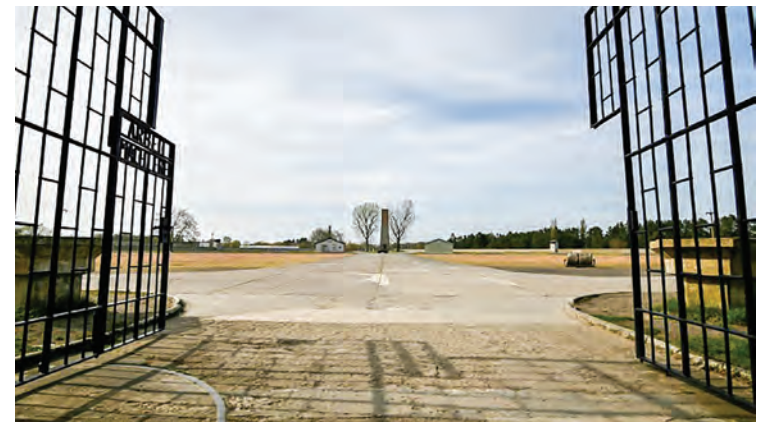
Sachsenhausen, just north of Berlin, is one of several former camps which were liberated by Allied forces 75 years ago.