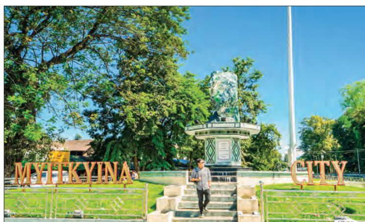
The photo shows the downtown scene of Myitkyina.