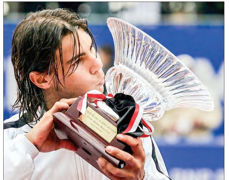
Teenage kicks: An 18-year-old Rafael Nadal wins his first Monte Carlo title in 2005. Ten more have followed since.

Among his 85-trophy career haul, 11 have come in Monte Carlo including a record eight in a row from 2005-2012 and three more between 2016-2018.—AFP