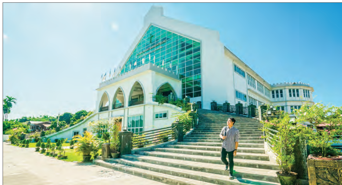
Ja Jubilimasat Nawkuhting Nu Church, one of the largest churches in Myitkyina, Kachin State.

mous MMA boxer, the pride of Myanmar, whose statue is set up in Manaw Sports Ground where the visitors can take photographs of impressive views. There is a restaurant at the back side of Manaw Grounds and it has won the support of the customers. The name of the restaurant is Lung Ga Pa. It faces Ayeyawady River.