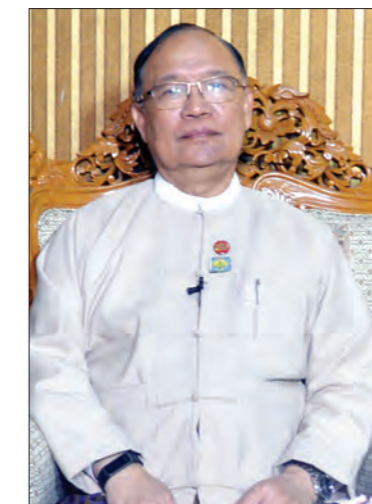
U Thant Sin Maung (Union Minister for Transport and Communications)