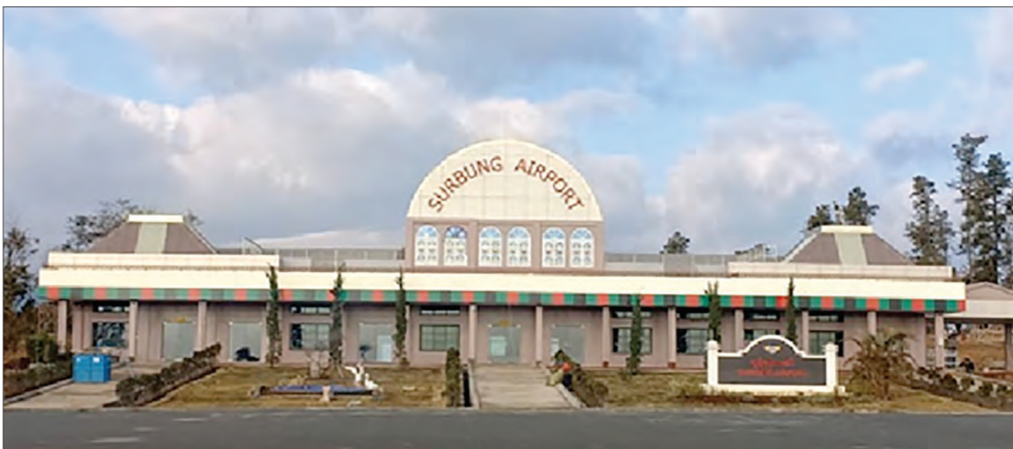
Located at the northern Chin of Falam, Surbung Airport sits on the Surbung mountain range, 1830 meters above the sea level.