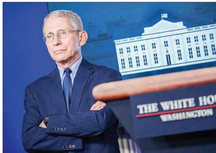
Director of the National Institute of Allergy and Infectious Diseases Anthony Fauci looks on during the daily briefing on the coronavirus in the White House briefing room on 1 April.

The original is made with vodka, lemonade, elderflower and grapefruit juice.