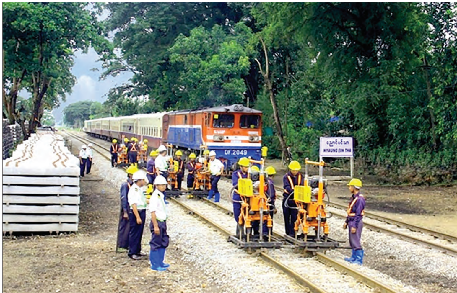
Work is underway on the Yangon-Mandalay Railways to upgrade the route to ensure quick and smooth transportation.

The ministry operates under the motto, 'Establishing an effective, modern and affordable Transport system' and designed the National Transport Master Plan (2015-2040) to realize that goal.