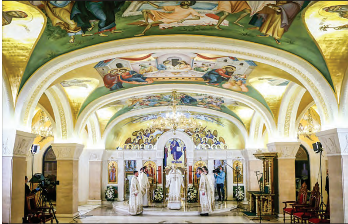
Serbian Orthodox Christian priests hold a morning Easter liturgy in the crypt of the cavernous Saint Sava Temple, one of the world’s largest Orthodox houses of worship, in Belgrade.

In Georgia, several hundred took part in a midnight mass at Tbilisi’s Holy Trinity Cathedral after the government allowed churches to open despite a cur-