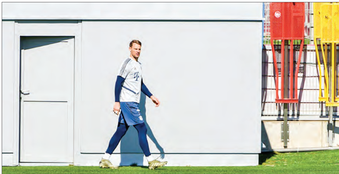
Bayern Munich goalkeeper Manuel Neuer is frustrated by stalling negotiations over a contract extension.

BERLIN (Germany) — Bayern Munich captain and goalkeeper Manuel Neuer told German media Sunday he has become “irritated” with negotiations to extend his contract, which have reportedly stalled in recent weeks.