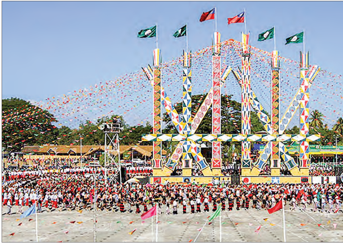
Kachin Manaw Festival.

Travel & Tours specially arrange for travel to Myitkyina. Those who are willing to go to Myitkyina can go there of their own plan. On arrival at Myitkyina,