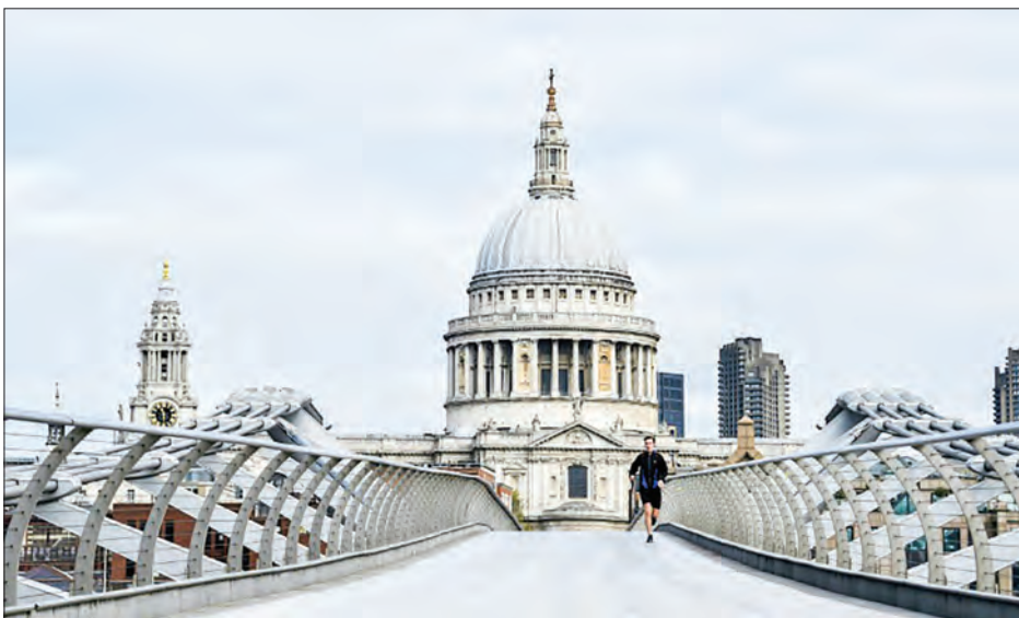
The British government has warned it is still past the peak of the country's coronavirus outbreak.

He explained that the estimates of the scale of