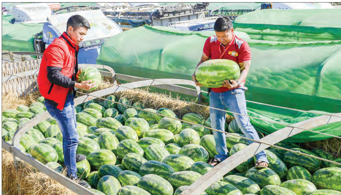
Merchants are evaluating the quality of watermelons on a lorry at the Muse 105 th Mile border trade zone.

"The transport delay can cause damage to watermelons.