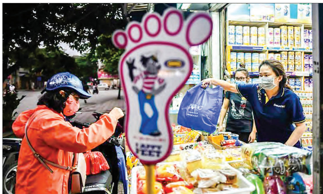
A woman (left) wearing a face mask practises social distancing amid Vietnam's nationwide social isolation effort as a preventive measure against the spread of the coronavirus at a grocery store in Hanoi on Saturday (April 18).