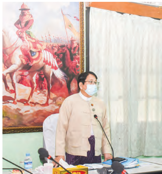
Union Minister Dr Pe Myint addresses the first online coordination meeting of the 2019 National Literary Award Selection Committee yesterday.

The National Literary Award is a valuable honour bestowed by the nation and is respected by both the literary circle and members of the public. International writers acknowledge the award and this value depends on the foresight and