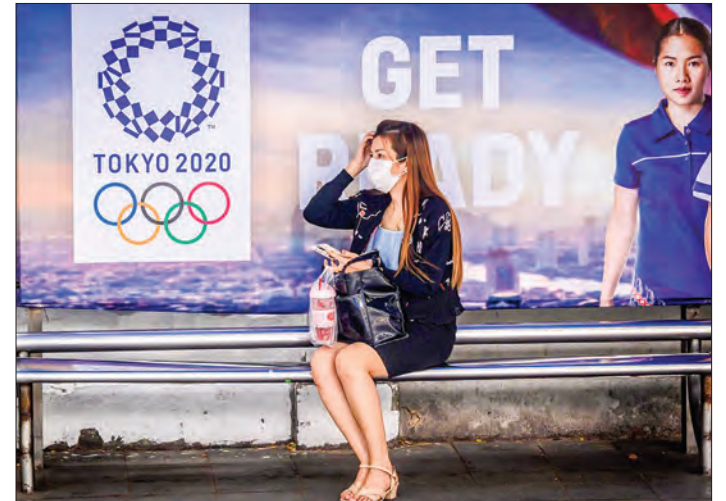
A woman wearing a facemask, amid concerns over the spread of the COVID-19 coronavirus, sits at a bus stop in front of a Tokyo 2020 Olympics advertisement.

TOKYO — Tokyo 2020 officials are looking at ways to scale back next year's postponed Olympics, the city's governor said Thursday, amid reports the opening ceremony could be streamlined and spectator numbers cut. Yuriko Koike told reporters that organizers were weighing up what could be "rationalized and simplified" as costs spiral for holding the first postponed Games in history. The International Olympic Committee announced in March the Games would be delayed due to the coronavirus pandemic that has killed hundreds of thousands and brought