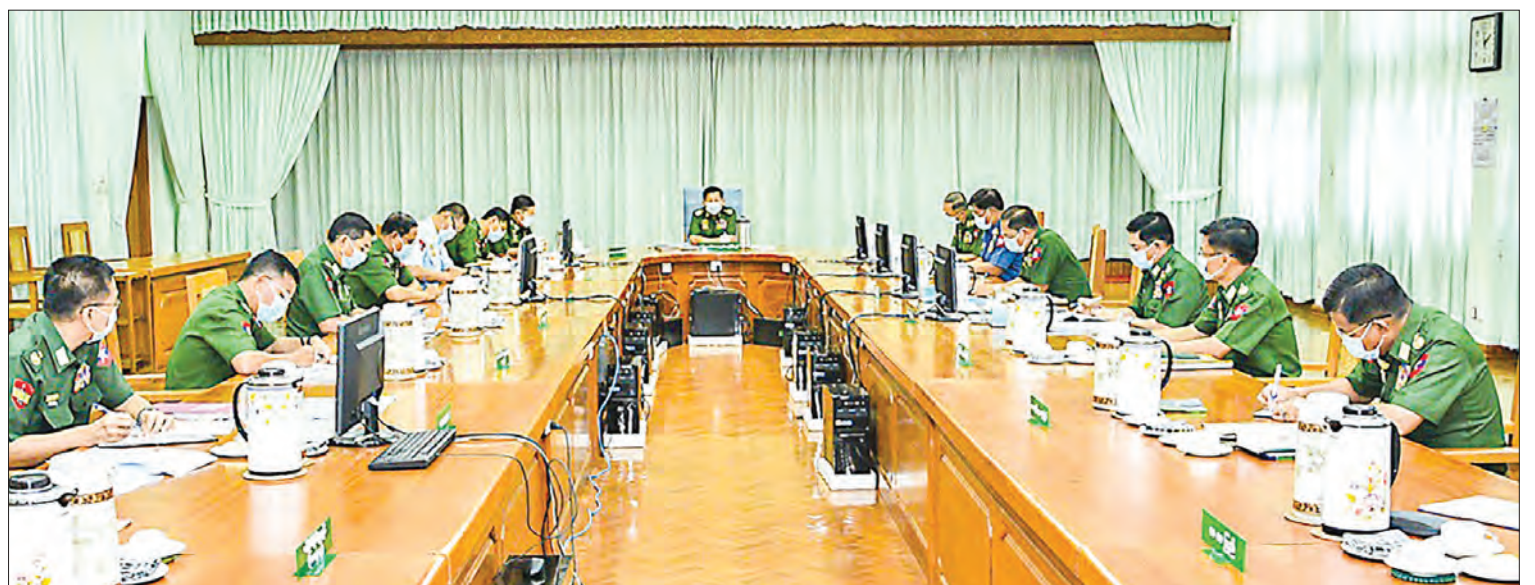
Commander-in-Chief of Defence Services Senior General Min Aung Hlaing holds the 8 th coordination meeting for fighting against COVID-19 pandemic at the Office of Commander-in-Chief (Army) on 3 June.

The senior Tatmadaw officers discussed the works of emergency response committees for COVID-19 measures in regions and states, 3,437 persons tested at military hospitals and battalions by rapid test kit, 803 by the Real-Time PCR Detection System, and 1,494 by Cobas 6800.