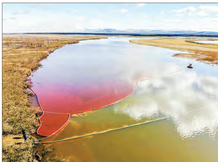
Russian President Vladimir Putin has ordered a state of emergency to deal with the fuel spill.