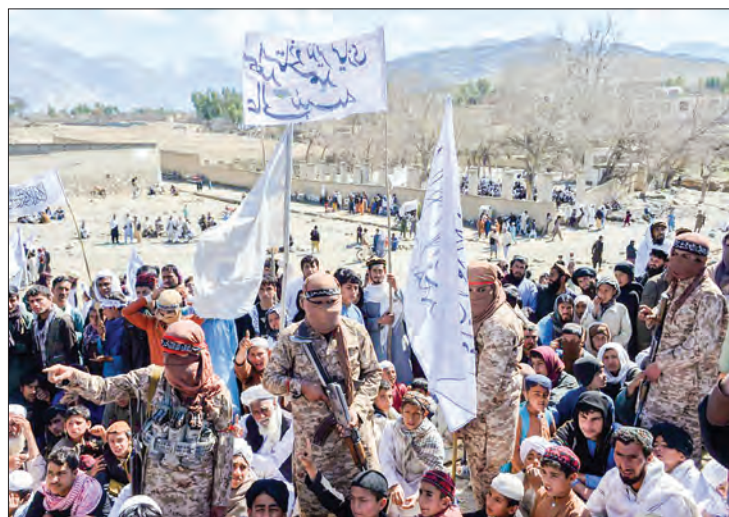
Afghan Taliban militants.