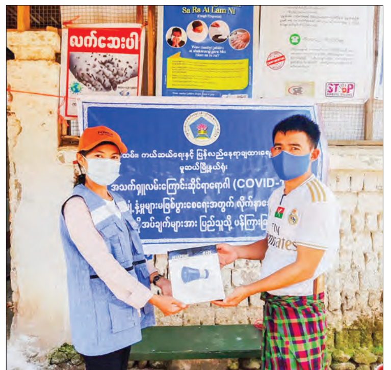
Staff from Ministry of Social Welfare, Relief and Resettlement handing over the COVID-19 medical equipment to an internally displaced person in Muse, Shan State.