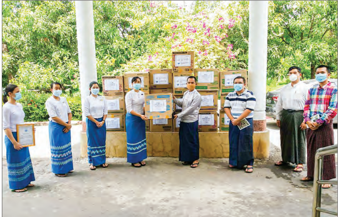
National University of Singapore Myanmar Society hands over the 10,000 reusable face masks to the National Volunteer Steering Group for people in quarantine and volunteers.