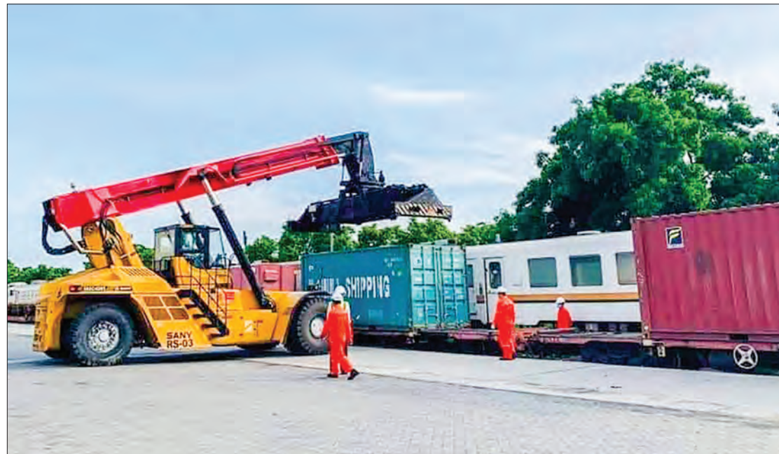
The RGL dry port directly connects with maritime ports by cars or trains.

The dry port of RG Logistics opened its Ywarthargi dry port on 11 November 2018, and the company spent K32,757.29 million for Ywarthargi dry port on 40 acres of land and K33,417.93 million for Myitnge dry port on 32 acres of land.—GNLM