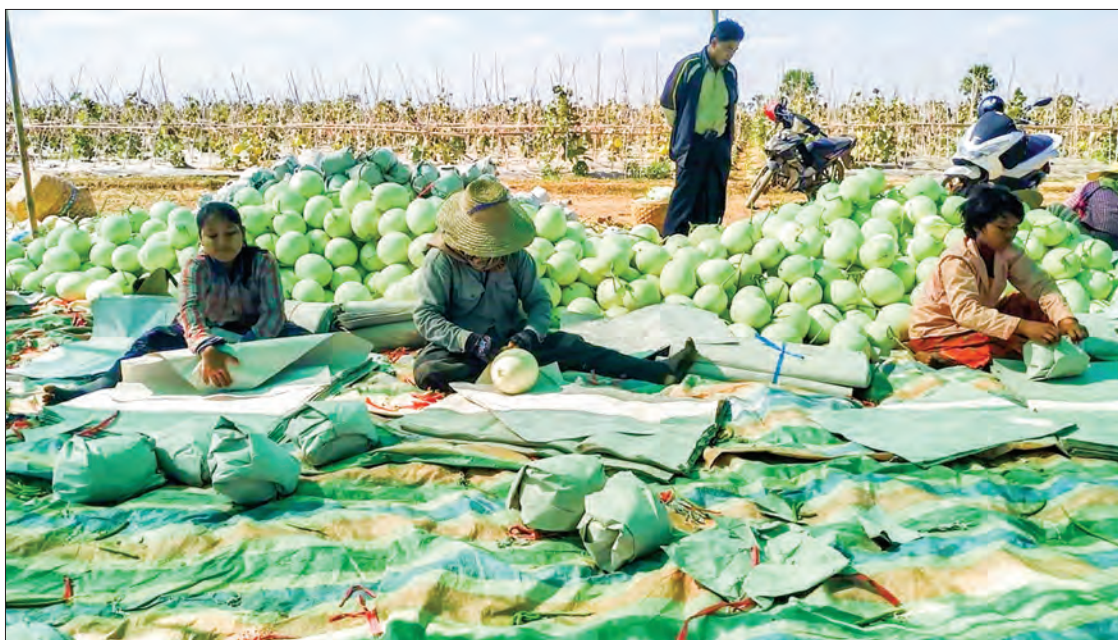
Farmers harvesting the muskmelons from their farms for sale in markets.

“So, some are selling their property such as cattle and plots of land to get back the capital for the next season. Now, there are no watermelon and muskmelon growers in Chaung U township. If there is no longer coronavirus spreading, we will prepare to grow watermelons