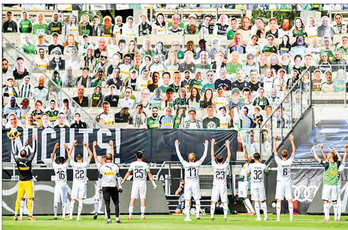
Bundesliga side Moenchengladbach celebrate in front of cardboard cutouts of fans.