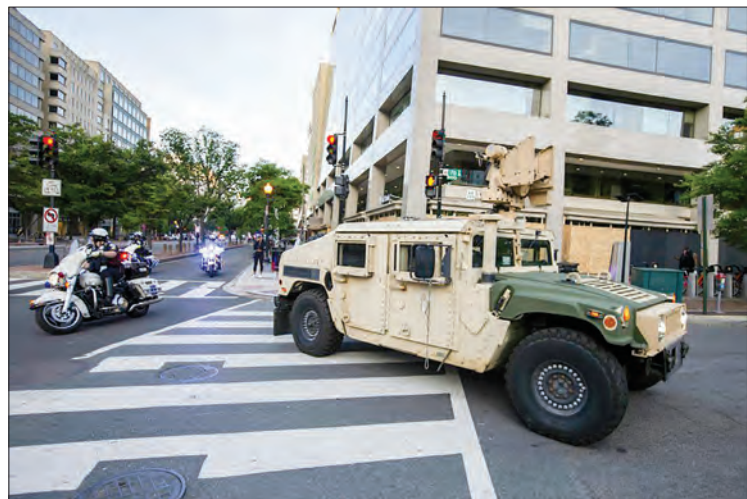
A military police Humvee blocks the street in downtown as demonstrators protest during a protest over the death of George Floyd on June 1, 2020, in Washington D.C.

States cited the need to keep their Guards in the state, a discomfort that the Guards would report to Attorney General William Barr and not local authorities as well as with Trump’s call for force to be used in a “dominating” response to protestors, the officials told CNN.—ANI ■