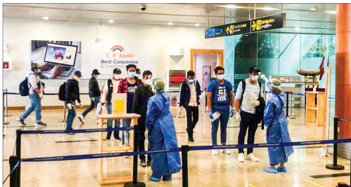
Staff testing body temperature of the Myanmar returnees from Germany at the Yangon International Airport yesterday.