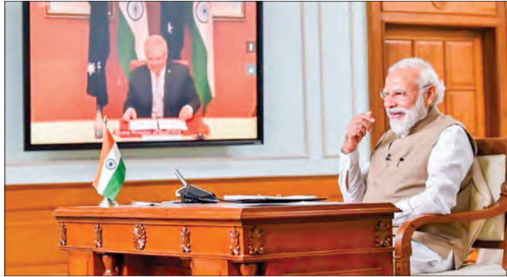
Prime Minister Narendra Modi with his Australian counterpart Scott Morrison during the virtual summit on Thursday.

Both countries also announced upgrading a key dialogue—till now held between the foreign secretaries and defence secretaries of the two countries—to the level of foreign and defence ministers. Speaking ahead of the start of delegation level talks at the virtual summit with his Australian counterpart Scott Morrison, Prime Minister Naren-