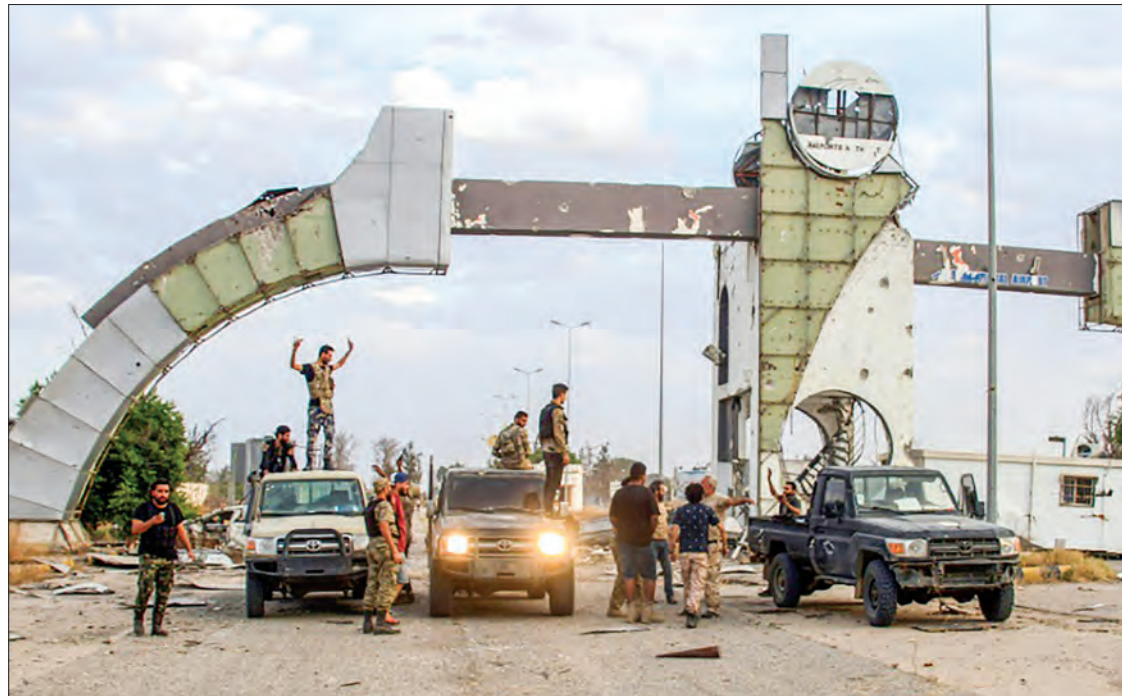
Fighters loyal to the UN-recognized Libyan Government of National Accord recapture Tripoli International Airport after clashes with strongman Khalifa Haftar.

German ambassador, said there needed to be a political rather than military solution.