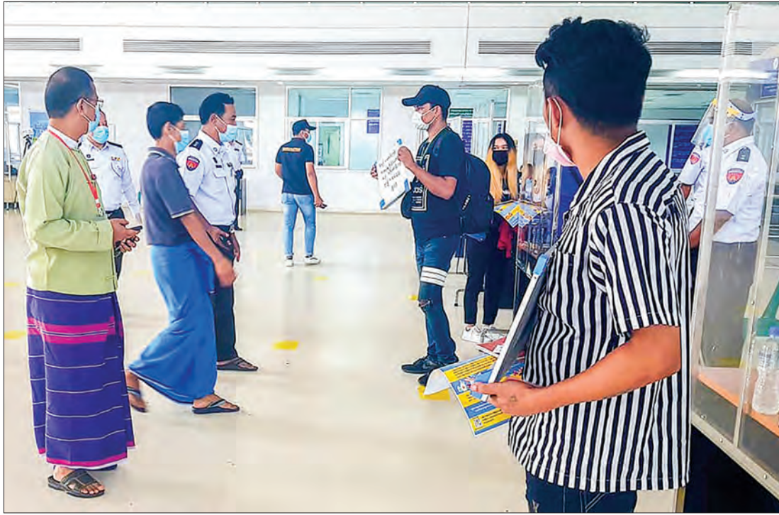
Officials helping Myanmar migrant workers from Thailand at Myawady border crossing yesterday.

MYANMAR has been making systematic arrangement for the return of migrant workers from Thailand since 1 May. The total number of returnees through Myanmar-Thai Friendship Bridge (2) of Myawady border town in Kayin State yesterday was 1,204. Among them, the 217 persons were brought back by 9 buses from Mo Chit Bus Ter-