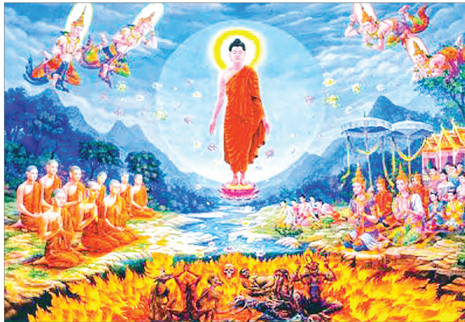
The Lord Buddha delivered the famous Maha Thamaya Sutta to the Devas and Brahmas of all universes.

Nayon is important in Myanmar culture on three counts. Firstly it is the month during which Myanmar farmers begin ploughing their fields. It is the first month of wet cultivation. In the time of Myanmar Kings, Le Htun Mingala (လယ်ထွန်းမင်္ဂလာ) or royal ploughing ceremony was held in this month so that there would be good rain and good harvest. Secondly it was on the full moon day of Nayon that