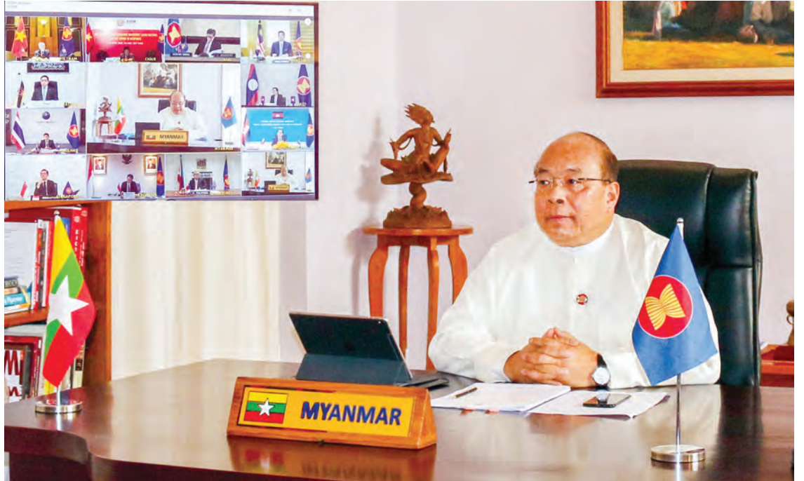
Union Minister U Thaung Tun attends the Special ASEAN Economic Ministers Meeting on COVID-19 and a Special ASEAN Plus Three Economic Ministers Meeting on COVID-19 consecutively via videoconference.

The Union Minister apprised all participants of various measures being undertaken by the Government of Myanmar in the fight against COVID-19, including implementation of the COVID-19 Economic Relief Plan (CERP) and updates on COVID-19 Fund disbursements to vulnerable businesses affected by the COVID-19. The Union Minister noted