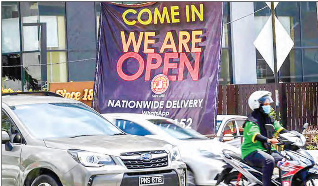
Motorists drive pass a shop during reopening of some business establishments in Penang on 10 May, 2020 as Malaysia relaxes partial lockdown measures to combat the spread of the Covid-19 coronavirus.

He emphasized that new local transmissions involving Malaysians were only single digit as only four cases reported on Thursday were local transmission involving Malaysian citizens.—Xinhua ■