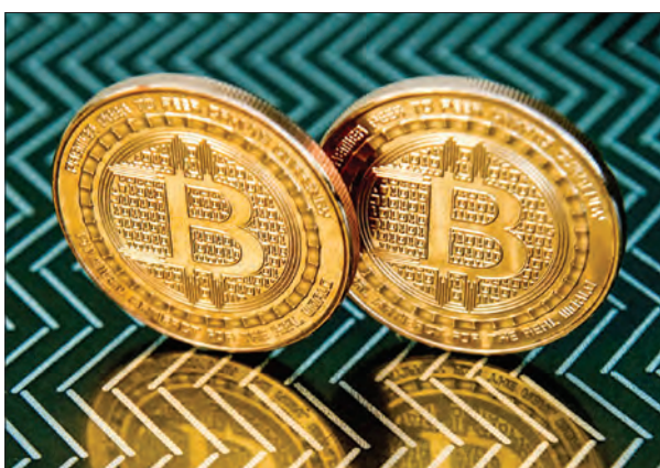
The world’s most popular cryptocurrency has gained over 30 per cent in value in almost three weeks.