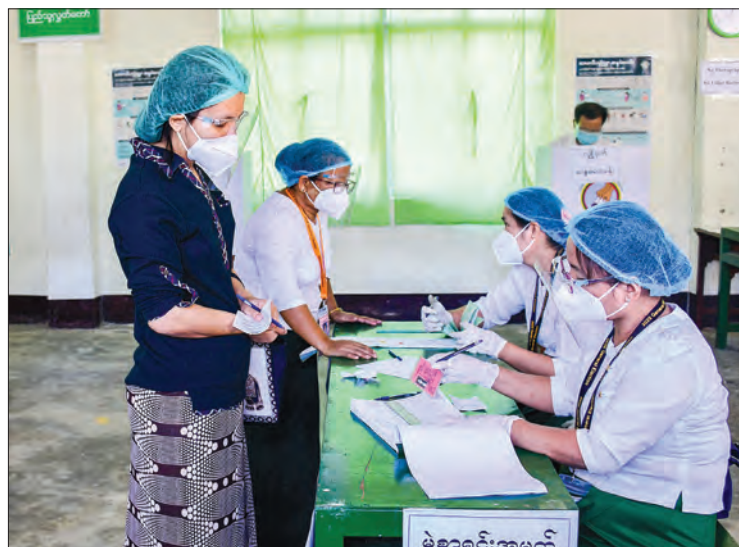
A polling station staff (R) is proofing a voter’s ID card with voter list inside a polling station in Zebuthiri on 8 November.