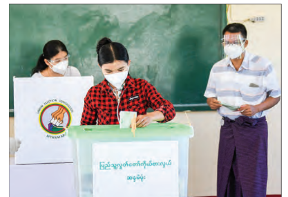
A voter casts her ballots at a polling station in Ottarathiri yesterday.