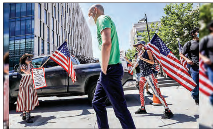
Protesters rally against a shelter-at-home order at Los Angeles City Hall, California.