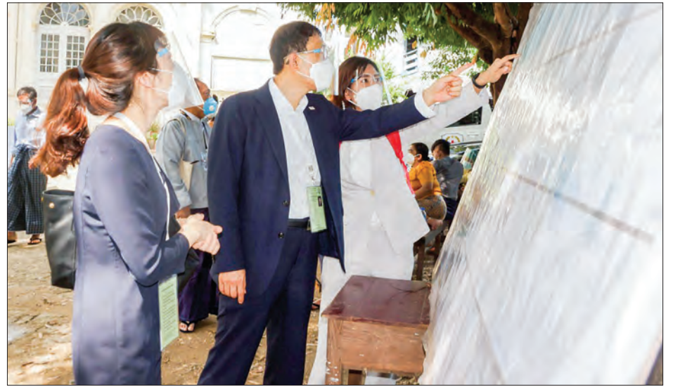
Officials from the Embassy of the Republic of Korea observe the voting processes at a polling station on Dhammazedi Road in Bahan Township on 8 November.