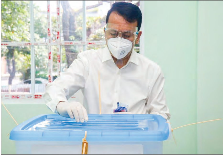
Yangon Region Chief Minister U Phyo Min Thein casts votes at a polling station on Dhammazedi Road in Bahan Township on 8 November 2020.