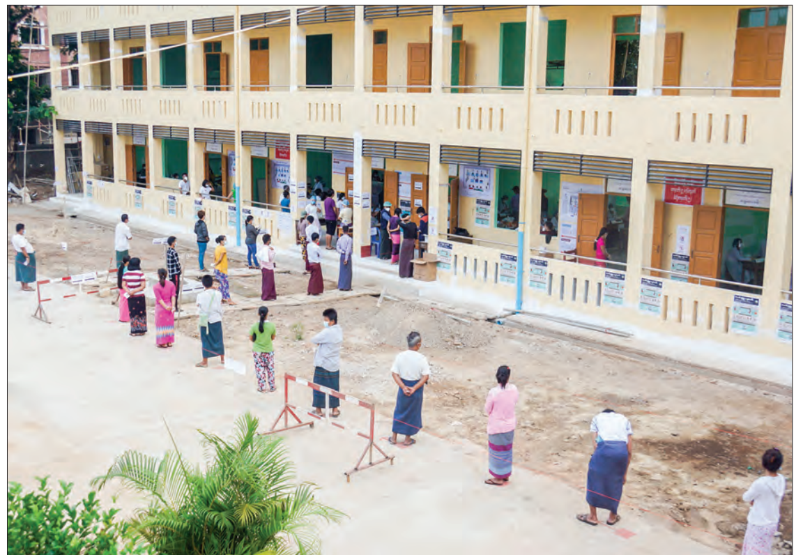
People queue for casting votes at polling station in Myawady Township.