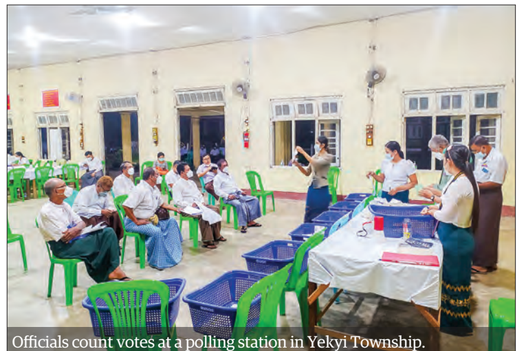
Officials count votes at a polling station in Yekyi Township.