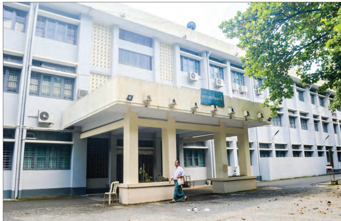
The Department of History was founded in 1920 as the name of the Department of Chronicle (Yazawin) while Yangon University was emerged.