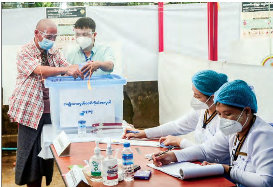
A visually-impaired voter casts his votes at a polling station in Yangon on 8 November 2020.

VISUALLY-impaired voters in Yangon Region cast their ballots at polling stations yesterday.