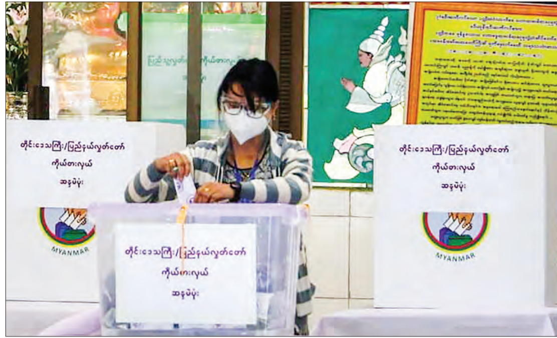
A woman in Mandalay casts votes for 2020 General Election on 8 November 2020.

ELIGIBLE voters in Mandalay cast their ballots for 2020 General Election in accordance with COVID-19 guidelines yesterday.