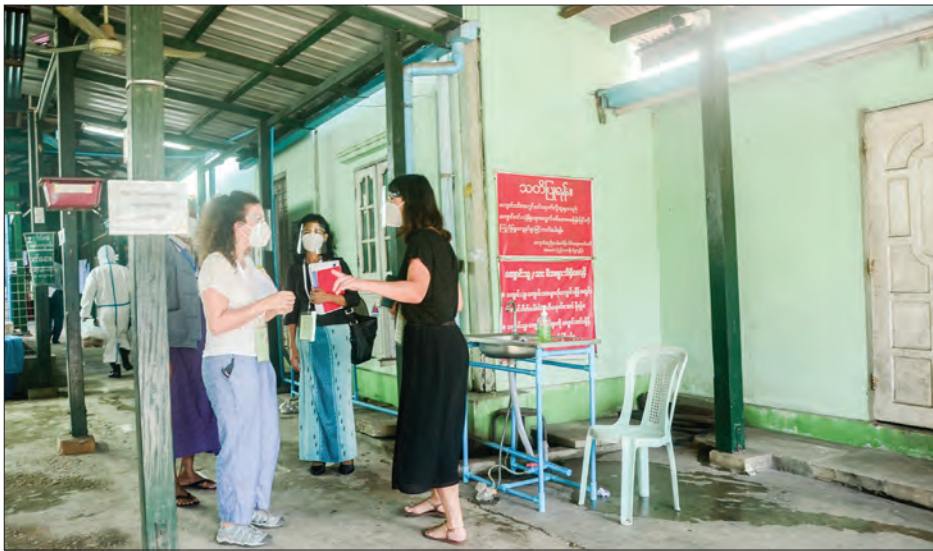
Officials from the Embassy of France observe the voting processes at the polling station at No 3 BEPPS in Bahan Township on 8 November 2020.