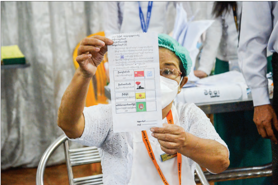
An official shows a ballot paper as ballot papers are being counted at a polling station in Thakayta Township.