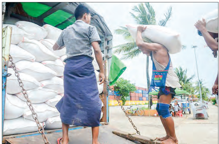
Workers load a vehicle with rice bags at a port in Yangon.