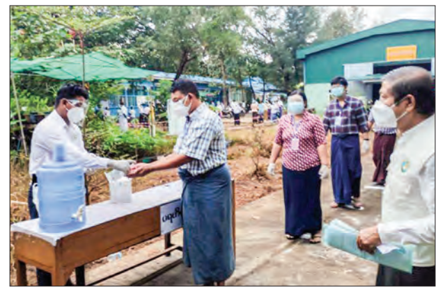
A man gets his hands washed outside a polling station in Thanlyin Township on 8 November 2020.