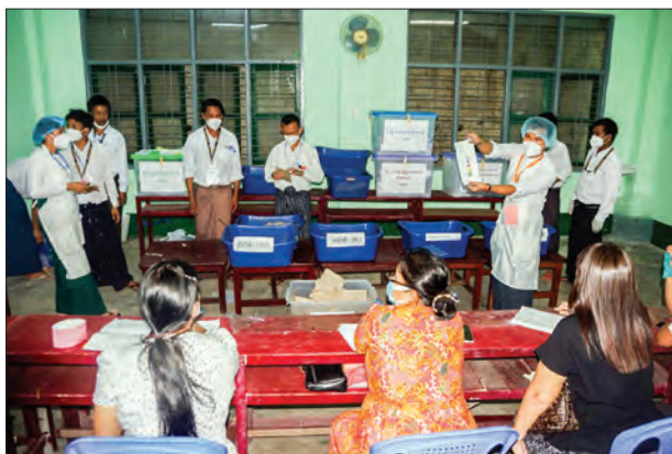
Polling station heads and officials count votes at a polling station in Bahan Township on 8 November.