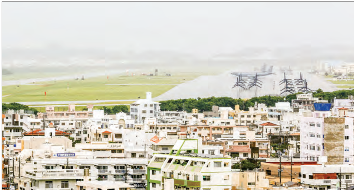
Photo shows U.S. Marine Corps Air Station Futenma in Ginowan in Japan's southern island prefecture of Okinawa on June 22, 2020, a day before the 60 th anniversary of the enforcement of the revised Japan-U.S. security treaty.

PEOPLE in Okinawa have expressed little hope that Joe Biden, elected Saturday as the next U.S. president, will review a controversial Japan-U.S. plan to