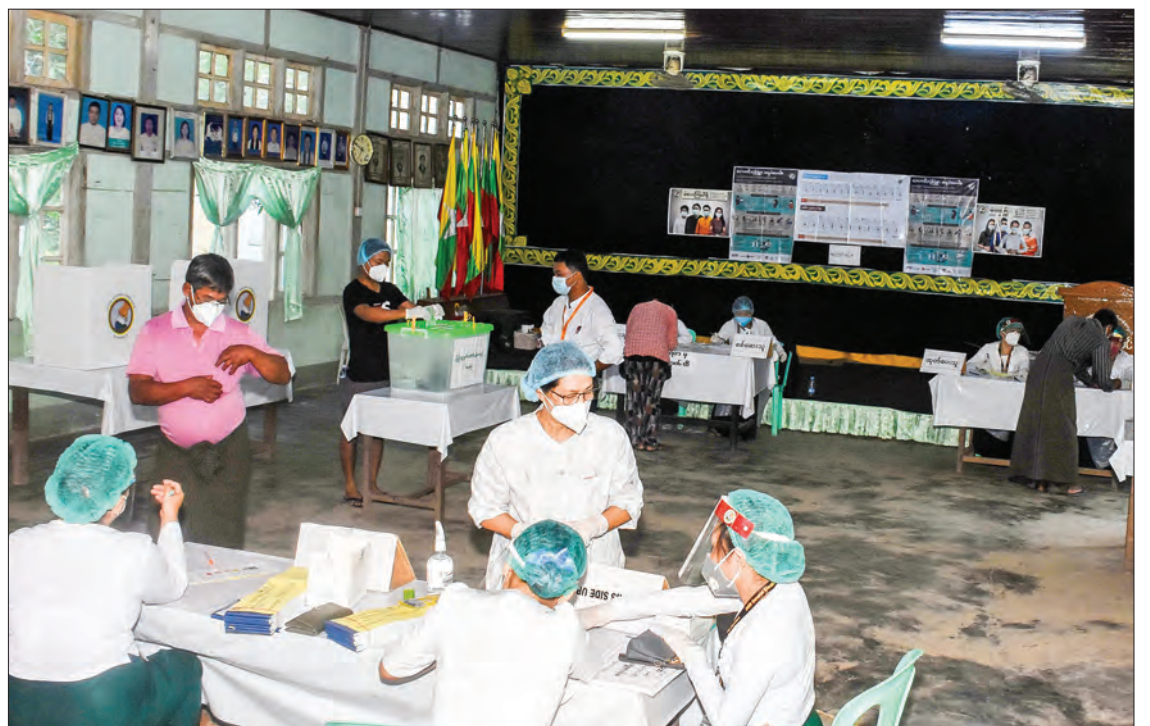
Voters and polling station staff are seen inside a polling station in Lewe on 8 November 2020.