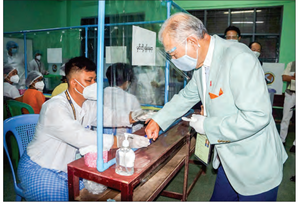
Chairman of The Nippon Foundation Mr Yohei Sasakawa observes the election process at a polling station on Ko Min Ko Chin Road in Bahan on 8 November 2020.