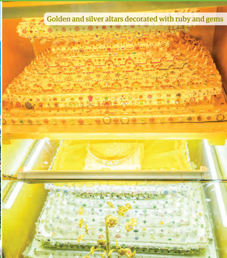
Golden and silver altars decorated with ruby and gems

Htar Pwe is a traditional market where locals trade gems. So, you should go there as it is called old Htar Pwe. What I notice is that the people hold Htar Pwe in many places of Mogok and Kyat Pyin. The people trade gems under the big umbrellas at Pan Chan Htar Pwe.