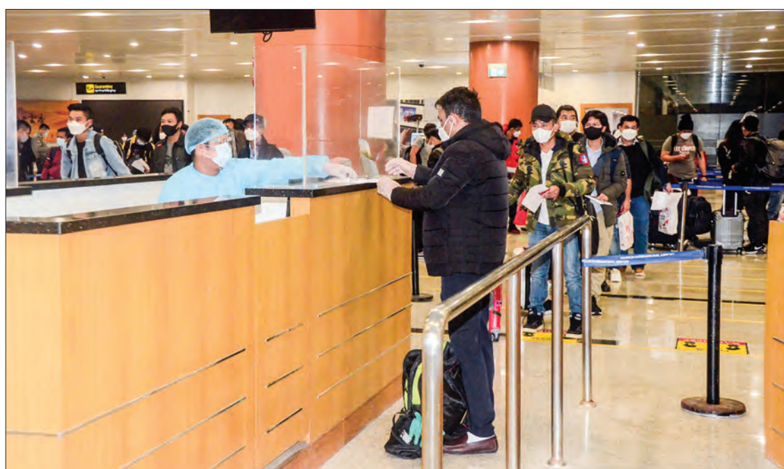
Returnees from the Republic of Korea are seen queuing for immigration process at Yangon International Airport.