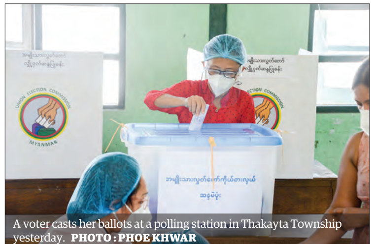
A voter casts her ballots at a polling station in Thakayta Township yesterday.