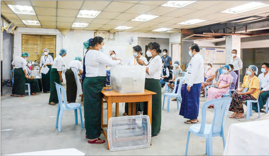
Officials count votes at polling station No 1 of No 9 Ward in Botahtaung Township.