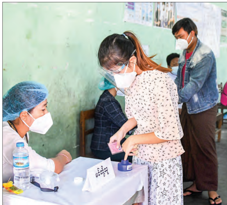
A voter gets her little finger inked after voting in Zayathiri on the election day.