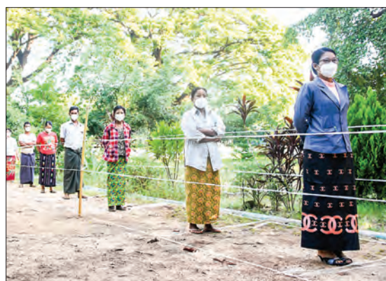
People line up for casting their votes at polling station in Pinyinana.