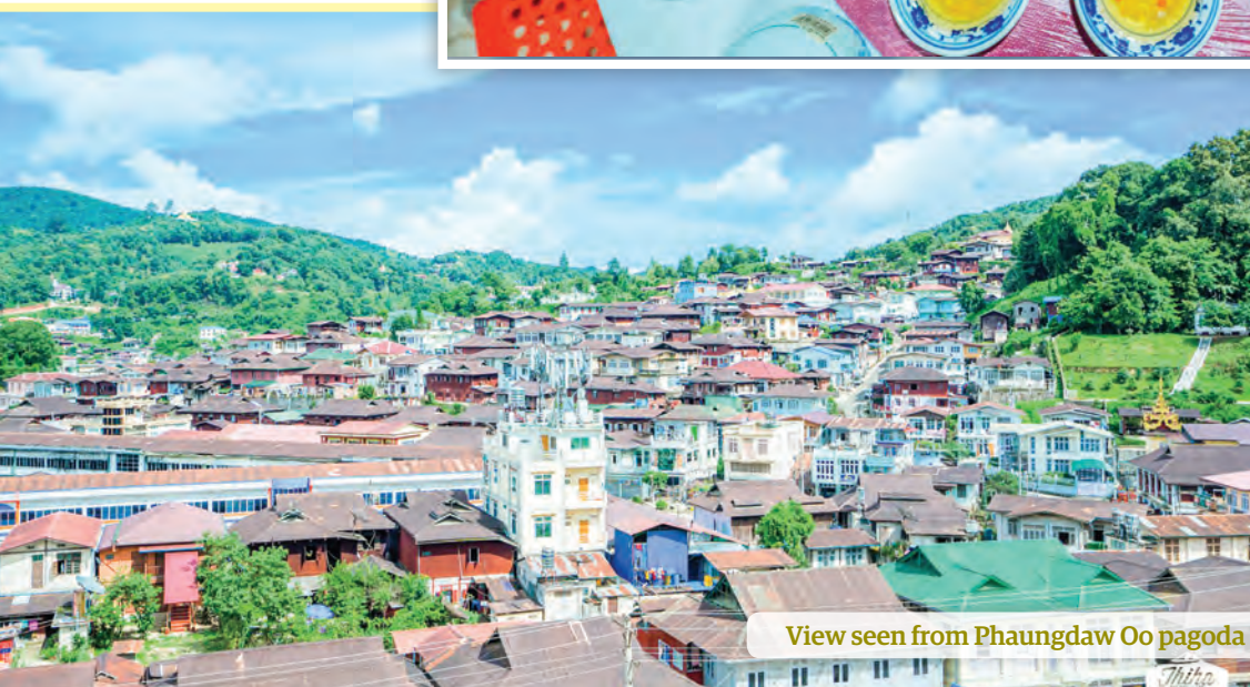
View seen from Phaungdaw Oo pagoda

If you go down the stairs near the view point, you will get to the natural caves. You will see a small case firstly and then many Buddha images in multiple sizes. There is no man-made thing. Some of the big caves are sometimes closed with iron doors. But