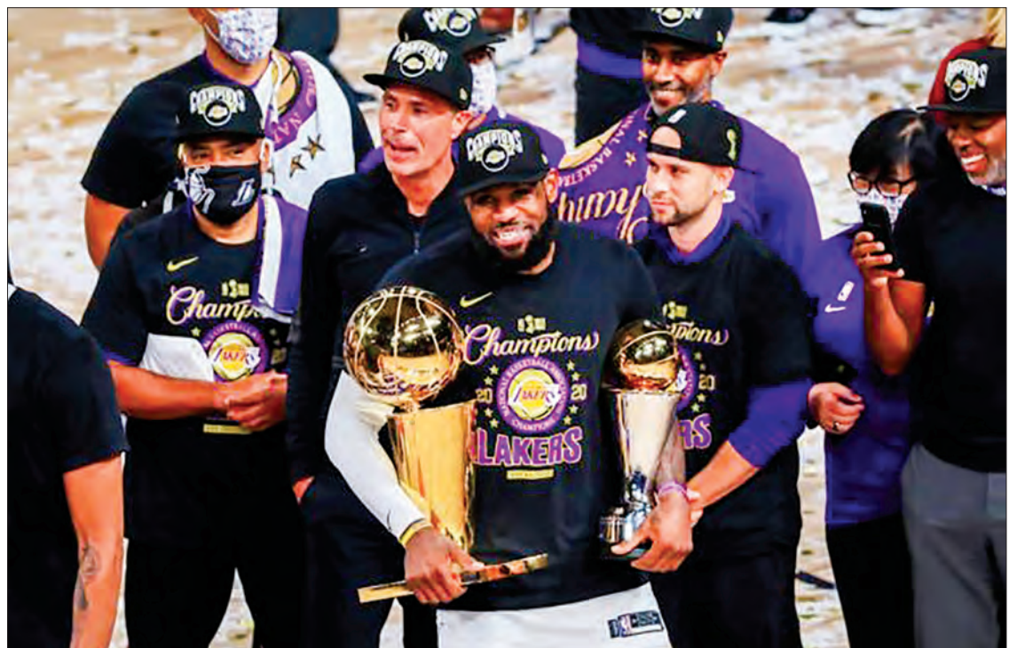
Los Angeles Lakers forward LeBron James (23) holds up four fingers after winning his fourth NBA championship after game six of the 2020 NBA Finals at AdventHealth Arena. The Los Angeles Lakers won 106-93 to win the series.

"Today I completed my trifecta: the Lakers, the Dodgers, and now #BidenHarris!! It's been a fantastic 30 days!" Johnson wrote.—AFP