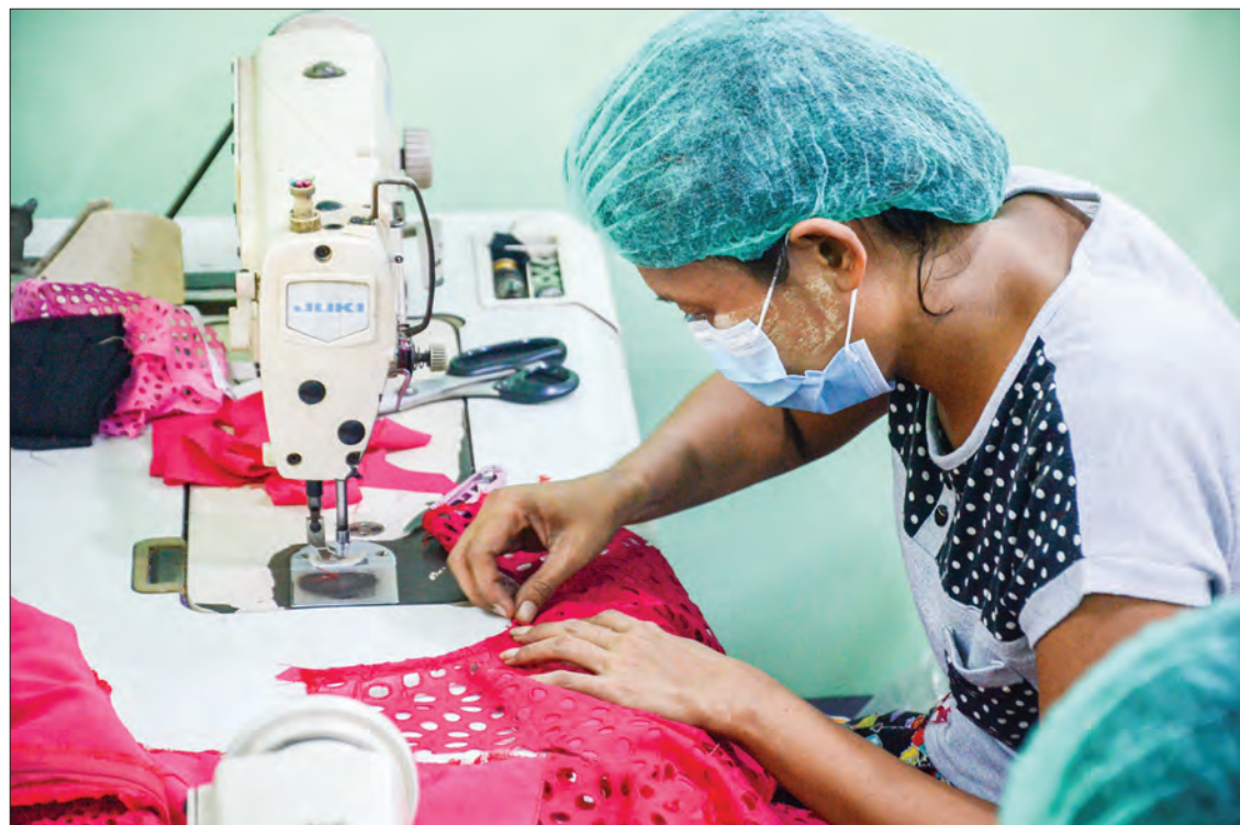
A woman sewing on the production line at a garment factory in Yangon.

Myanmar Investment Commission is endeavouring to accept investment projects in manufacturing masks, pharmaceuticals and others which can contribute to the fight against the coronavirus in the country