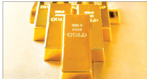
Global gold prices have surged more than 30 per cent this year, topping a record $2,000 (1,700 euros) an ounce in August, as the precious metal became a safe haven for investors in the face of Covid-induced volatility.

and tackle the upshots of rampant hyperinflation, corruption and coronavirus restrictions.