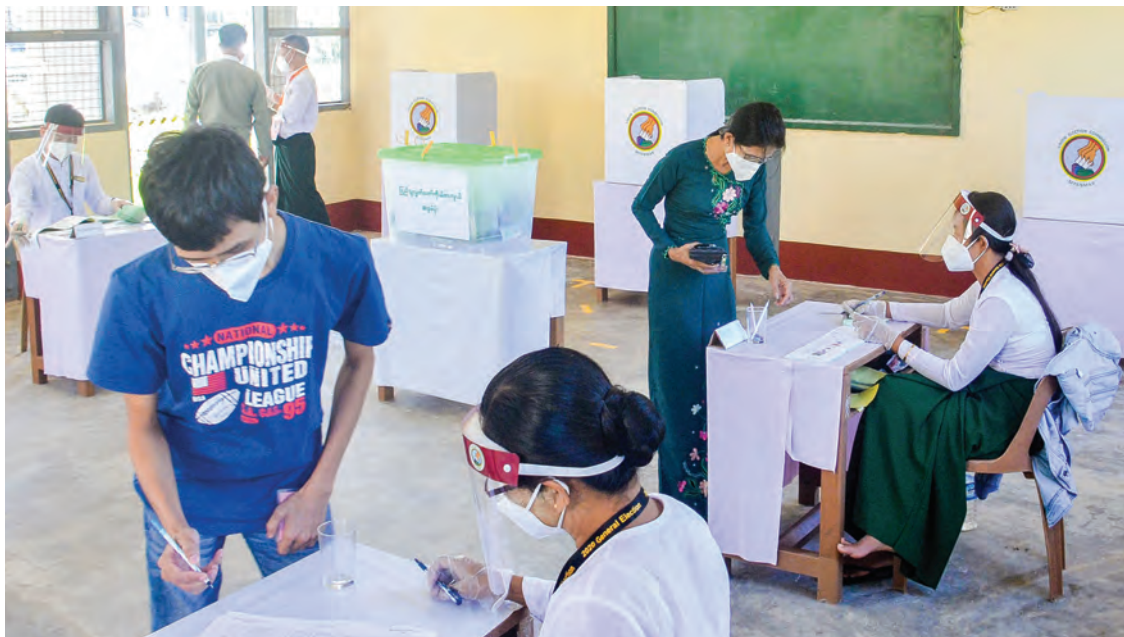
Union Election Commission Chairman U Hla Thein inspects the voting processes at the Polling Station No 1 at BEMS (Chin Village) in Ottarathiri Ward, Ottarathiri Township in Nay Pyi Taw on 8 November 2020.