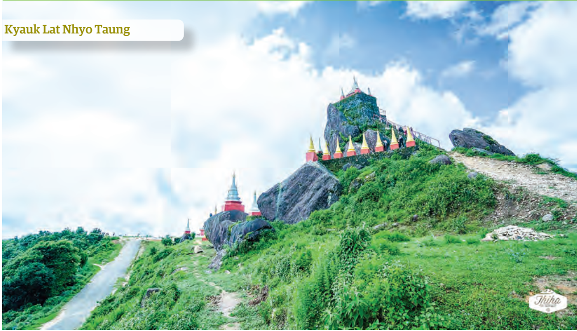
Kyauk Lat Nhyo Taung