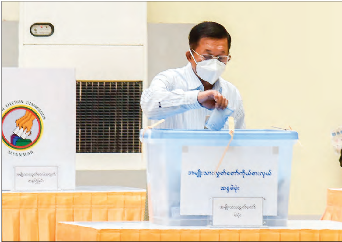
Senior General Min Aung Hlaing casts votes at the Zeyathiri Polling Station No 1 in Zeyathiri Township on 8 November 2020.