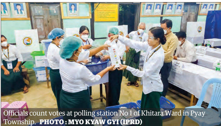
Officials count votes at polling station No 1 of Khitara Ward in Pyay Township.