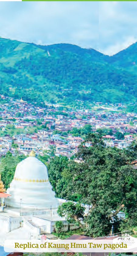
Replica of Kaung Hmu Taw pagoda