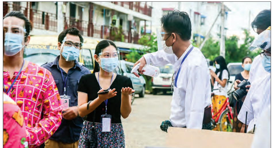
A woman voter gets her hands washed with hand sanitizer outside the polling station at the No 9 BEPPS in Dagon Seikan Township on 8 November 2020.