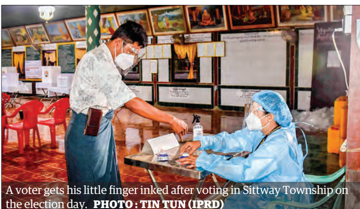
A voter gets his little finger inked after voting in Sittway Township on the election day.