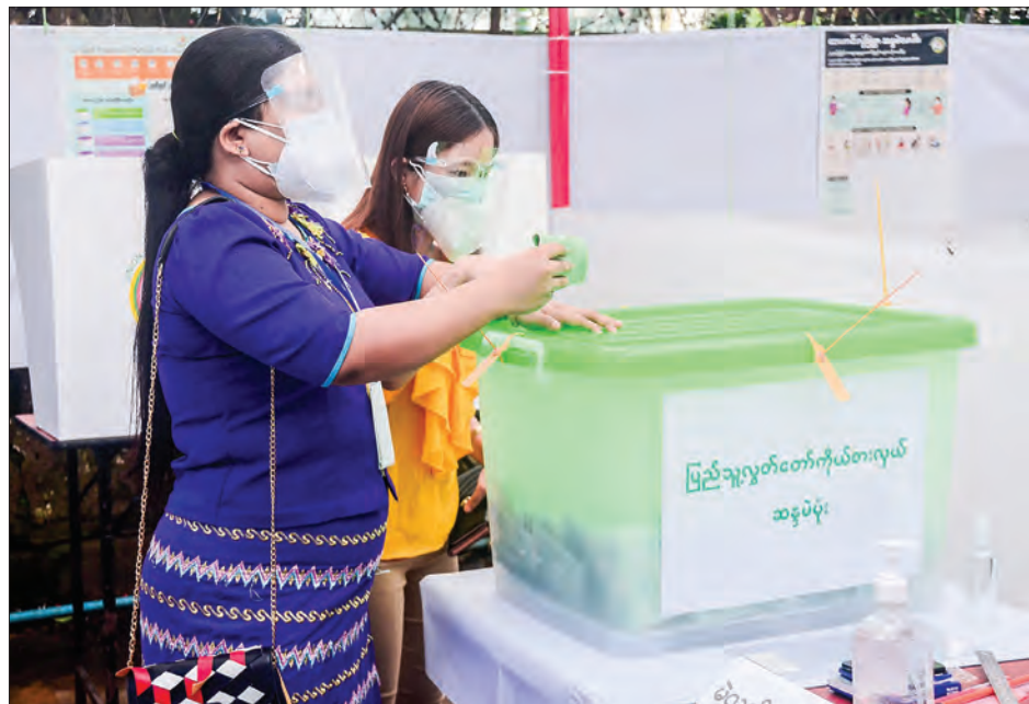
A visually-impaired voter casts her votes at a polling station in Yangon on 8 November 2020.