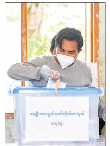
A voter casts his ballots at a polling station in Pobbathiri yesterday.