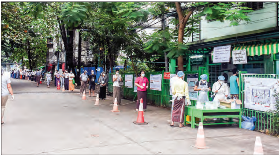
Citizens queue for casting votes outside the Polling Station No 2 of Ma Hlwa Gone Street and Kyauk Myaung Street on 8 November 2020.