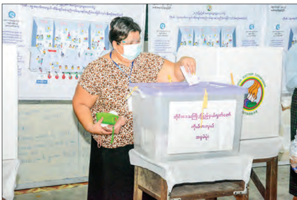
A woman casts her votes at the polling station at No 4 BEHS in Insein Township on 8 November 2020.