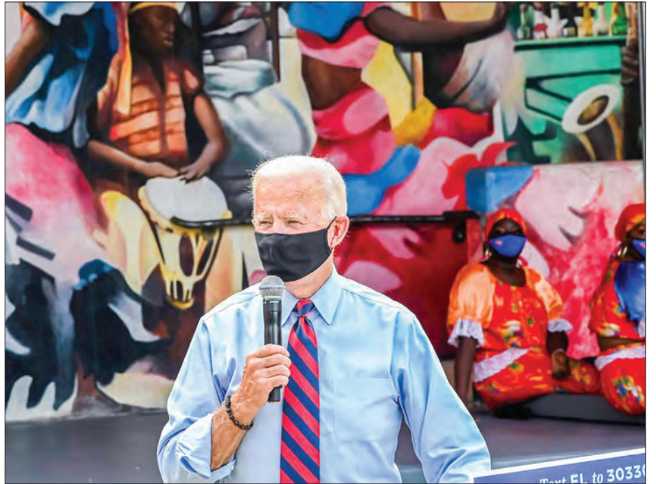
Democratic presidential nominee and former Vice President Joe Biden speaks at the Little Haiti Cultural Complex in Miami, Fla. on Oct. 5.