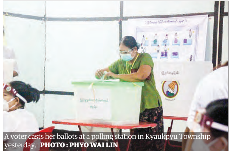
A voter casts her ballots at a polling station in Kyaukpyu Township yesterday.