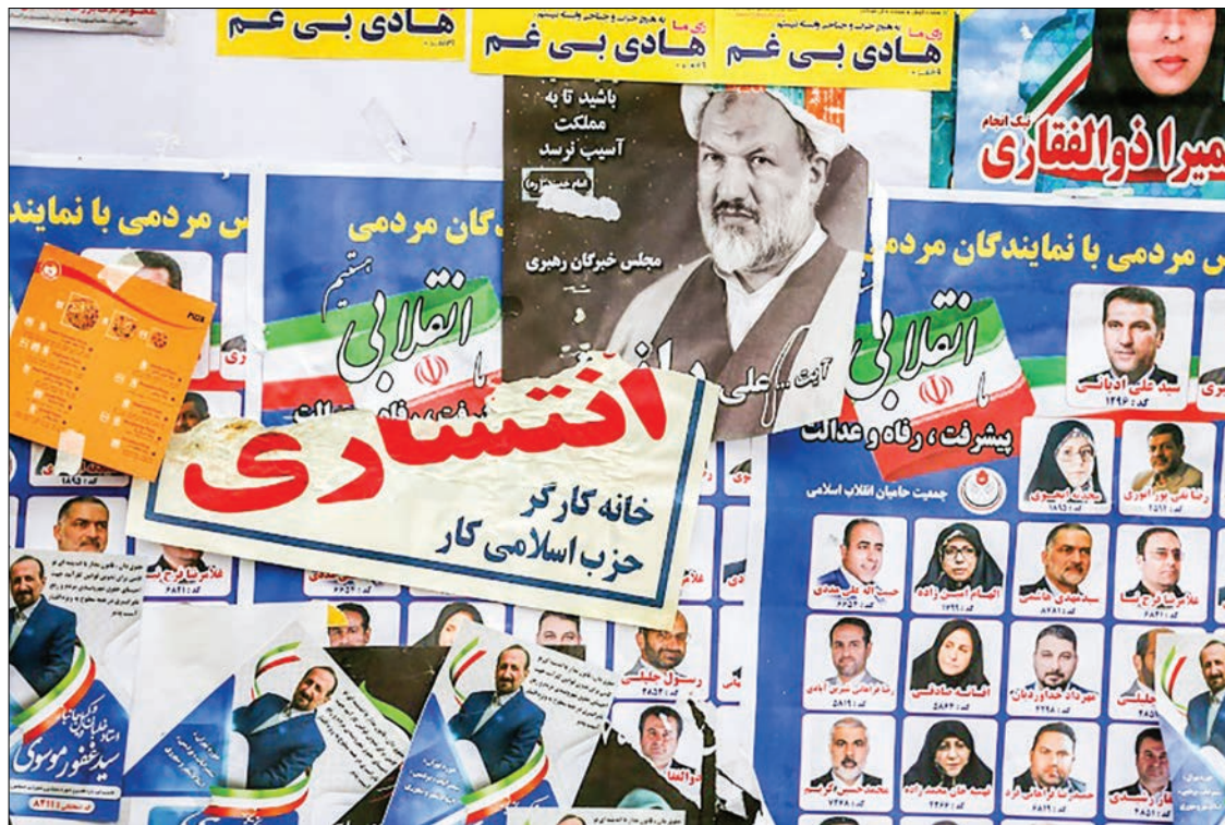
Iranians voted in a parliamentary election on Friday, two days after the announcement of an outbreak of the new coronavirus in the country.

A low turnout had already been expected after a conservative-dominated electoral watch-