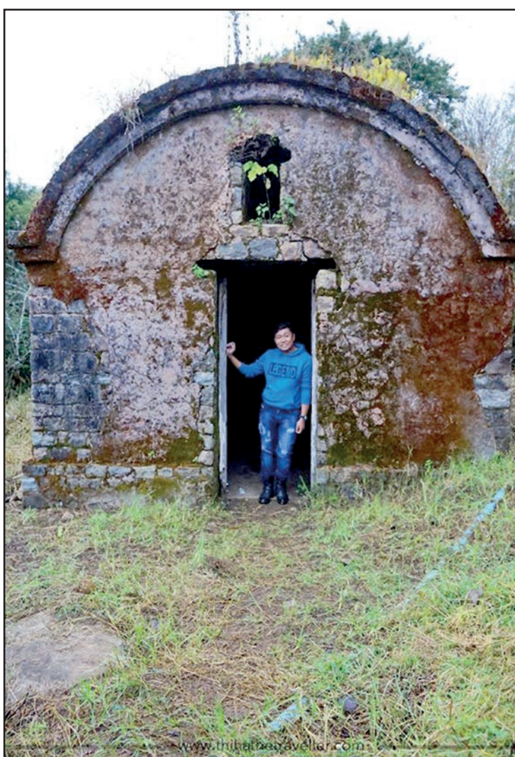
Over 100 years old Munitions Dump in Bernard Village.

When I started my trip from Mogok in the morning, I saw icy