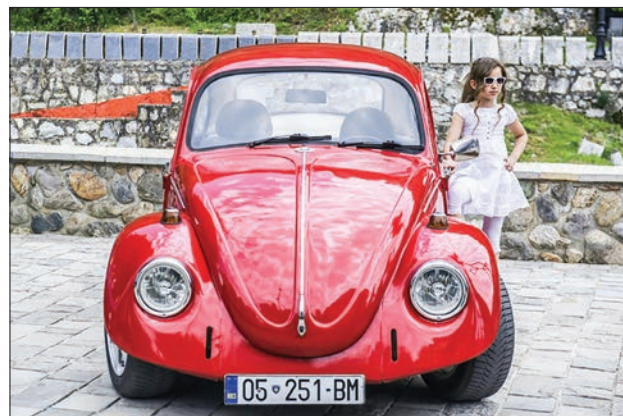
Prime Minister Kurti's proposal for reciprocity with Serbia would mean for example a ban on Serbian license plates in Kosovo, as Kosovar plates are prohibited in Serbia. PHOTO: AFP

US envoy for Belgrade-Prishtina talks Richard Grenell urged Prishtina to abolish tariffs as "it hurts Kosovo and chases businesses away from creating jobs".—AFP