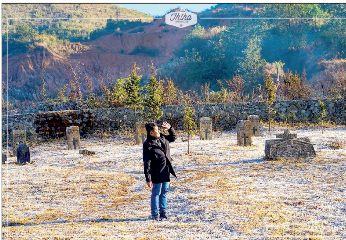
War Cemetery of British soldiers seen in Bernard Village.