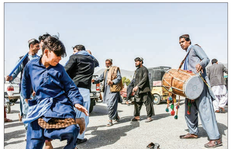
Afghans dance as they celebrate the first day of a "reduction in violence" agreement between the Taliban, US and Afghan forces in Kandahar.

Two separate officials with knowledge of the country's telecoms industry in northern Afghanistan also confirmed that mobile networks were being restored in insurgent-hit areas.—AFP