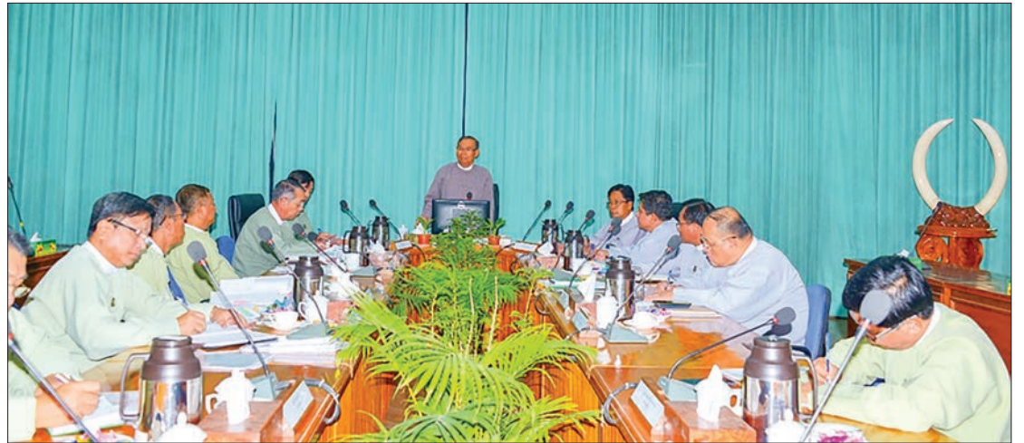
Union Minister U Ohn Win addresses the coordination meeting for conserving the watershed areas around Inle Lake in Shan State yesterday.

Speaking at the meeting, the Union minister stressed the need for the first 10-year project, which is planned from the 2020-2021 fiscal year to the 2029-2030 fiscal year, to link with existing environmental conservation