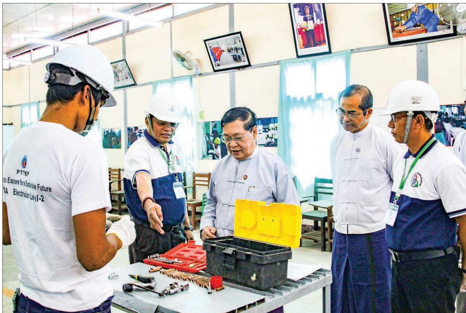
room and the skill development centre.—MNA (Translated by Aung Khin)

The Union Minister also witnessed training session for young trainees who will take part in assembling contests of ASEAN countries, and level -1 assessment of assembling air con before he inspected renovations of a meeting