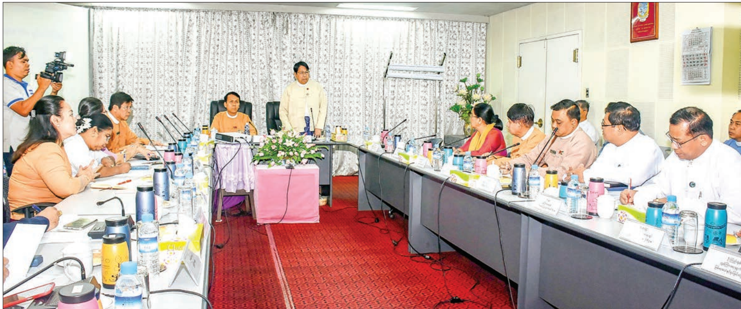
Union Minister Dr Pe Myint addresses the meeting to launch a broadcast media City Channel in Yangon yesterday.

He also remarked the City Channel would become an ef-