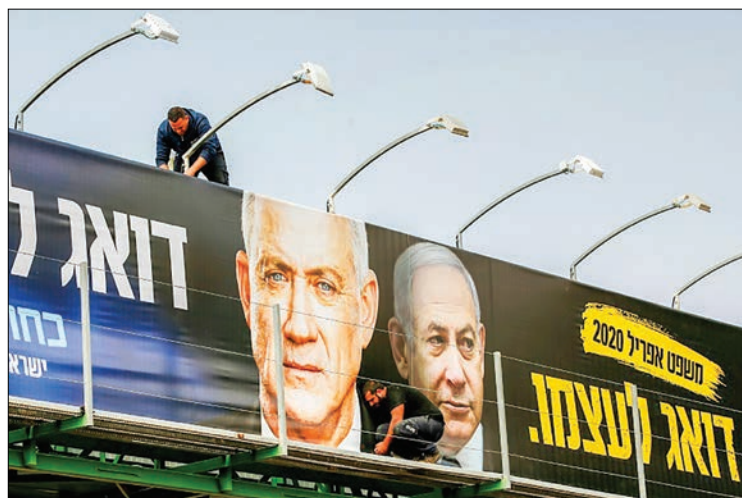
The head of one community organisation said he was not willing to cut services because “some crazy members of the Knesset” were incapable of forming a government.

JERUSALEM — Israel’s grinding political deadlock has squeezed funding for programmes helping troubled youths, disadvantaged communities and the disabled, forcing state-backed social organisations to rely on crowd-funding to get by.