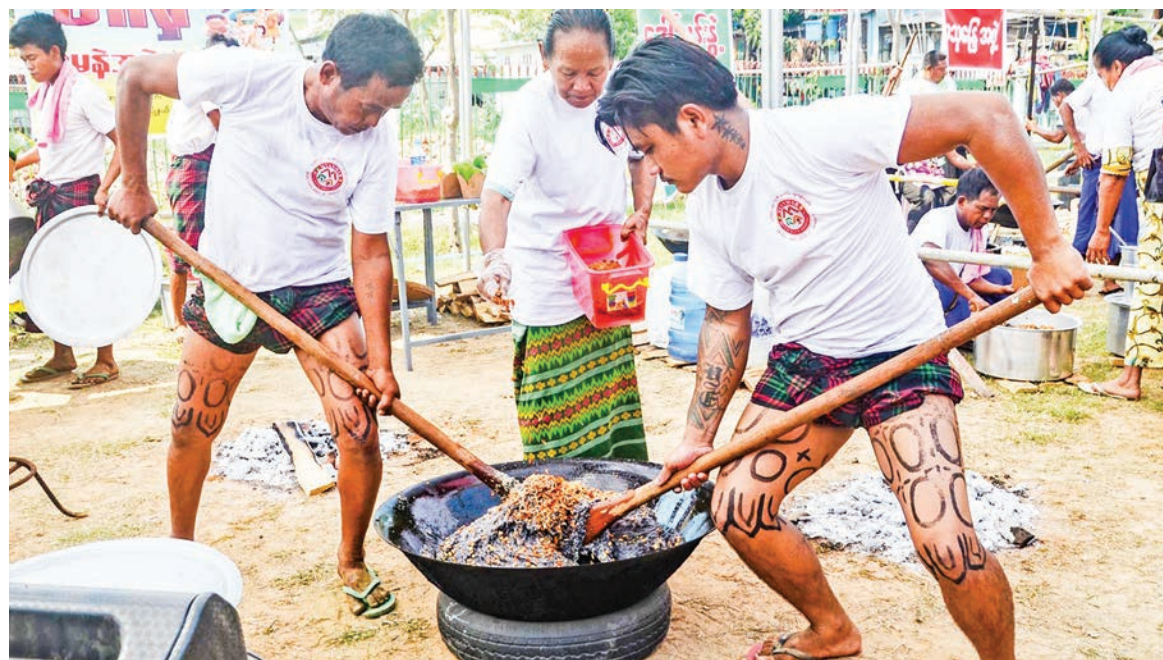
Preparation of Htamane provides a social occasion for a Myanmar community. It is an activity in which all involved. Men are making Htamane in the festive activity in Mandalay.

Htamane or Myanmar Delicacy There are many old saying such as nar ye yo tay Tabodwe (နာရယ်ယိုတဲ တပို့တဲ) we have runny nose in Tabodwe, ze win byet pyay Tabotwe (ဇိဝင်းပေါက်တဲ တပို့တဲ) in February, wild plum ripe open and Htamane tyoe pyay Tabodwe (ထမနဲတပို့တဲ တပို့တဲ). In Myanmar traditional medicine men recommend eating Htamane or Myanmar Delicacy to give oil for dried skin of our bodies.