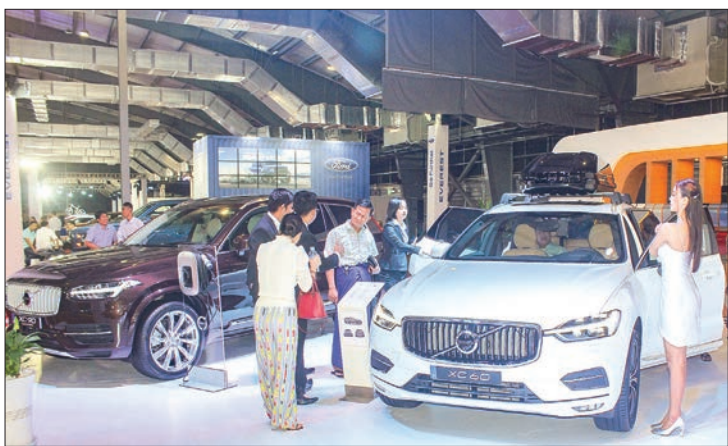
Visitors make inquiry about Volvo at the 2 nd Yangon International Motor Show featuring several international car brands. The company's larger XC 90 model was also named Myanmar's car of the year for 2017.

The show features latest car models, cutting-edge technology, and innovations.—Lynn Thit (Tgi)