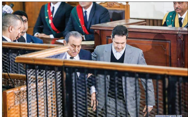
File photo taken on Dec. 26, 2018 shows Alaa Mubarak (2 nd R) and his father, ousted Egyptian president Mohamed Hosni Mubarak (C), in a court in Cairo, Egypt.

After Mubarak’s ouster in early 2011, Gamal and Alaa were in custody for a number of alleged corruption crimes.—Xinhua