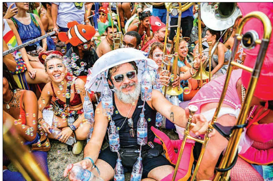
The Amigos da Onca street party heats up Rio de Janeiro ahead of the city’s famous carnival parades. PHOTO: AFP

The most successful school in the history of the contest, Portela, will pay tribute to Brazil’s indigenous Tupinamba people, who lived in Rio de Janeiro before the Portuguese colonizers arrived.—AFP