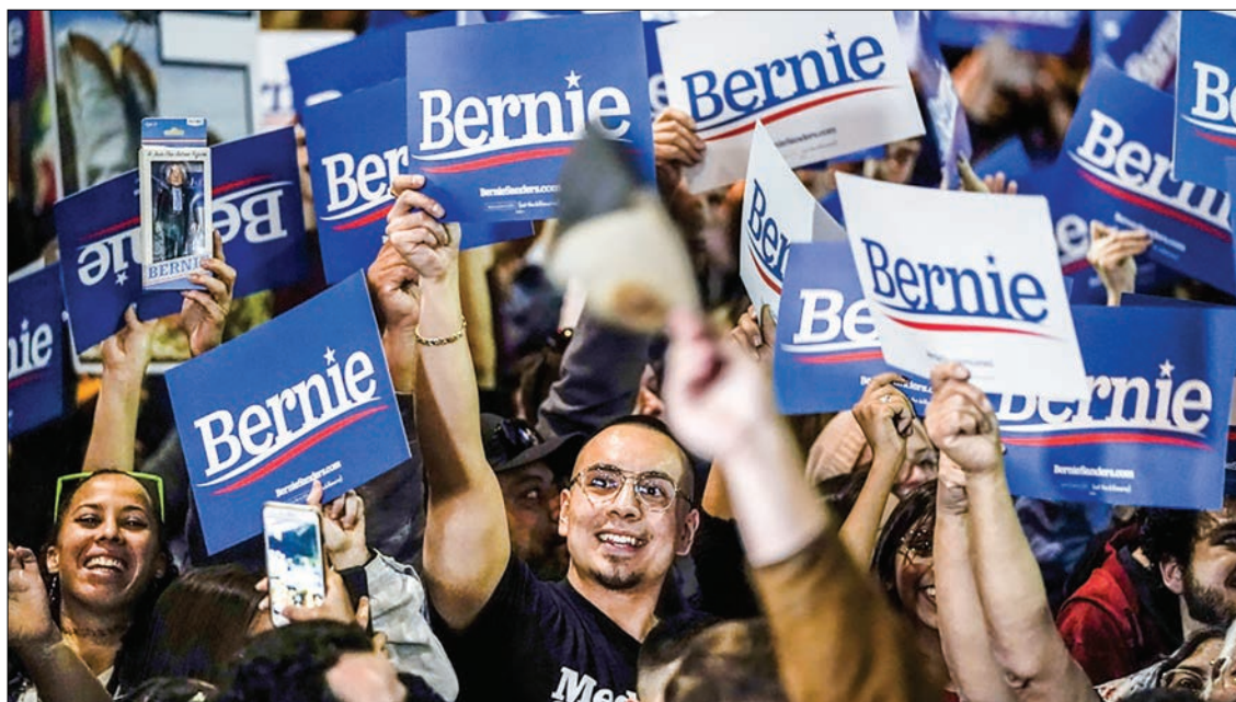
Supporters cheer as they watch returns from the Nevada caucuses while waiting for Bernie Sanders to arrive for a campaign rally at Cowboys Dancehall on February 22, 2020, in San Antonio, Texas

WASHINGTON — US President Donald Trump has congratulated US Senator Bernie Sanders who is coming ahead in the Saturday Nevada caucuses, according to early results.