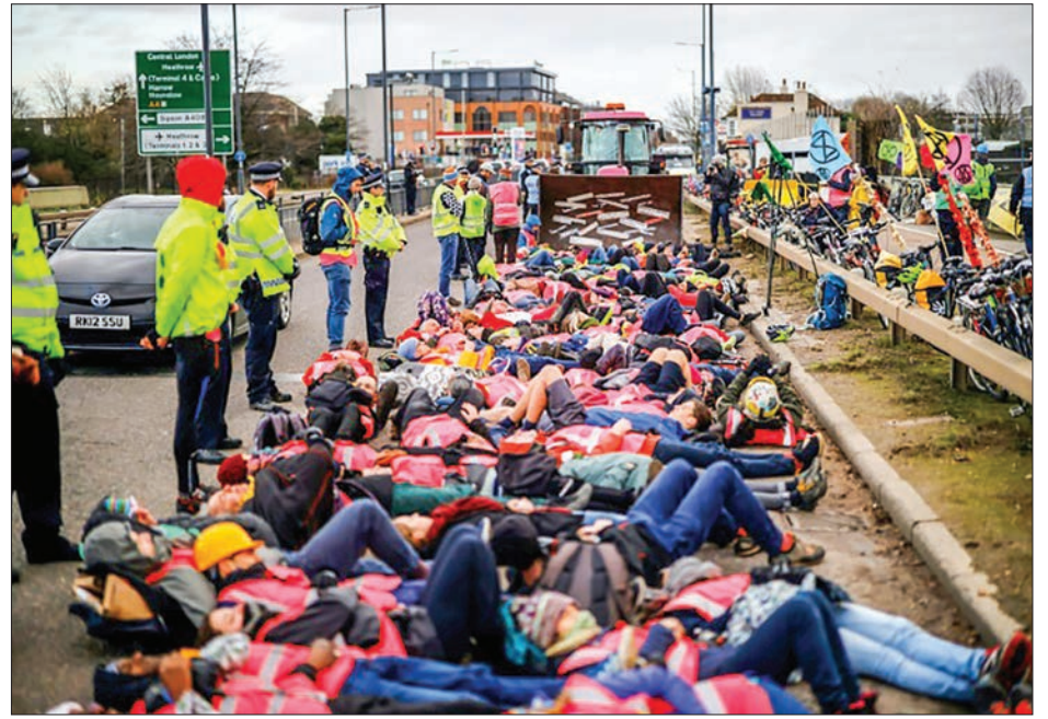
Activists from climate action group Extinction Rebellion perform a symbolic 'bulldozer lie-in' as they demonstrate against the building of a third runway at Heathrow Airport in west London last month.

Johnson's predecessor Theresa May in 2018 approved a new runway at Heathrow, Europe's busiest airport, three years after Johnson had promised to "lie down in front of... bulldozers and stop the construction", citing environmental as well as aesthetic concerns.—AFP