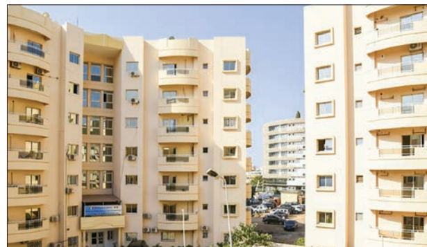
Housing boom: New apartment blocks are being built in Dakar, but spiralling rents make living there a distant dream for many.

Dakar's poorest residents, however, are paying for the price of the boom. In a country where some 40 percent of people live in poverty, Senegal passed legislation in 2014 to ease pressure on tenants.—AFP