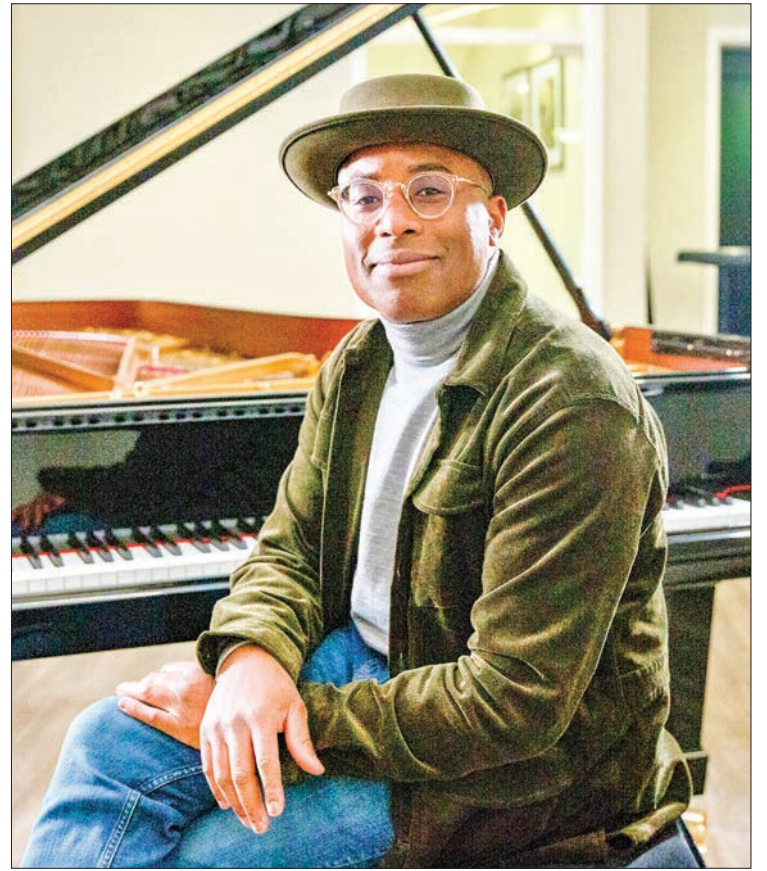
British pianist and composer Alexis Ffrench poses for a photograph after giving an interview at Steinway & Sons in London on 19 February 2020.

“I think my duty is to change the narrative.” —AFP