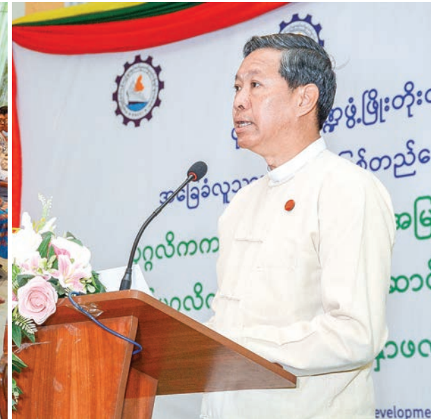
Union Minister Dr Myo Thein Gyi delivers the speech at the seminar held to develop coordination programmes between the government and private sectors for human resource development.

and intensive engineering courses for vocational training programmes at the government technical institutes and schools and other short term training courses.