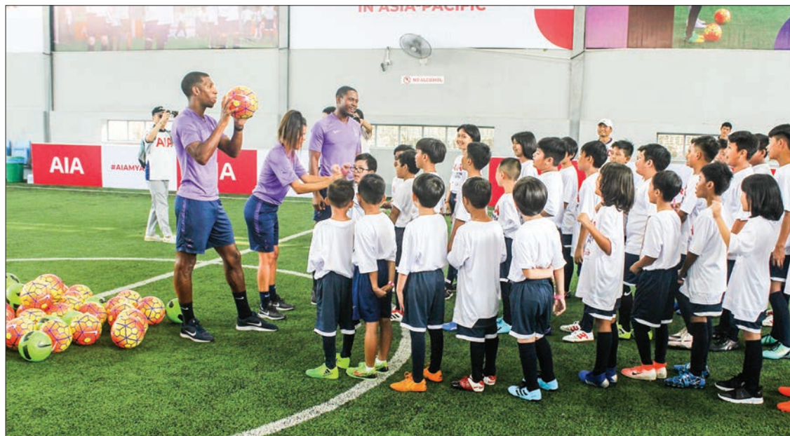
Three Tottenham Hotspur coaches (front) teaching basic football skills to children in Yangon yesterday.