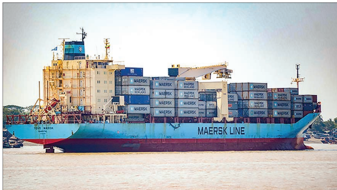
A container ship crossing the Yangon River.

The government is trying to cut the trade deficit by screening luxury import items and boosting exports. Myanmar's trade deficit was pegged at $1.14 billion in the 2018-2019 fiscal year, $1.3 billion in the last mini-budget period (April-September, 2018), $3.9 billion in the 2017-2018FY, $5.3