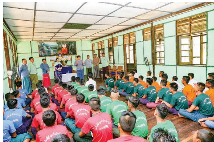
Union Minister Dr Win Myat Aye meets with youths at the youth training school in Mawlamyine yesterday.