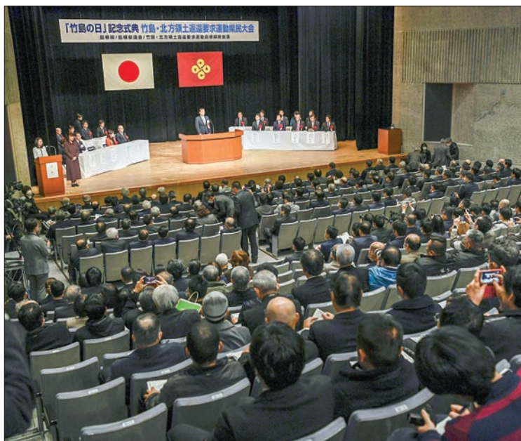
A ceremony to mark Shimane Prefecture-designated "Takeshima Day" is held in Matsue, western Japan, on Feb. 22, 2020.

MATSUE— Japan pressed on Saturday its claim to a pair of South Korea-controlled islets at an annual ceremony amid lingering tensions between the two countries over wartime issues.