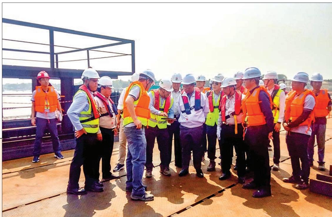
Deputy Minister U Kyaw Lin visits the construction site of Myanmar-Korea Friendship Bridge in Yangon yesterday.