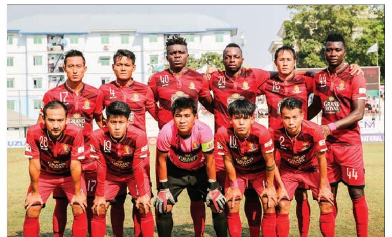
Hantharwady United F.C. players pose for a group photo before an earlier MNL match against Sagaing United.