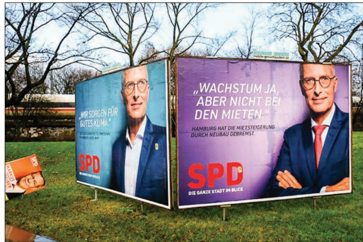
The lead candidate for the centre-left SPD, Peter Tschentscher, is currently Hamburg’s mayor. PHOTO: AFP

In part, the centre left has done so by adopting policies with a distinctly “green” feel, including a proposal to convert a massive coal power plant to natural gas so as to slash greenhouse emissions.—AFP