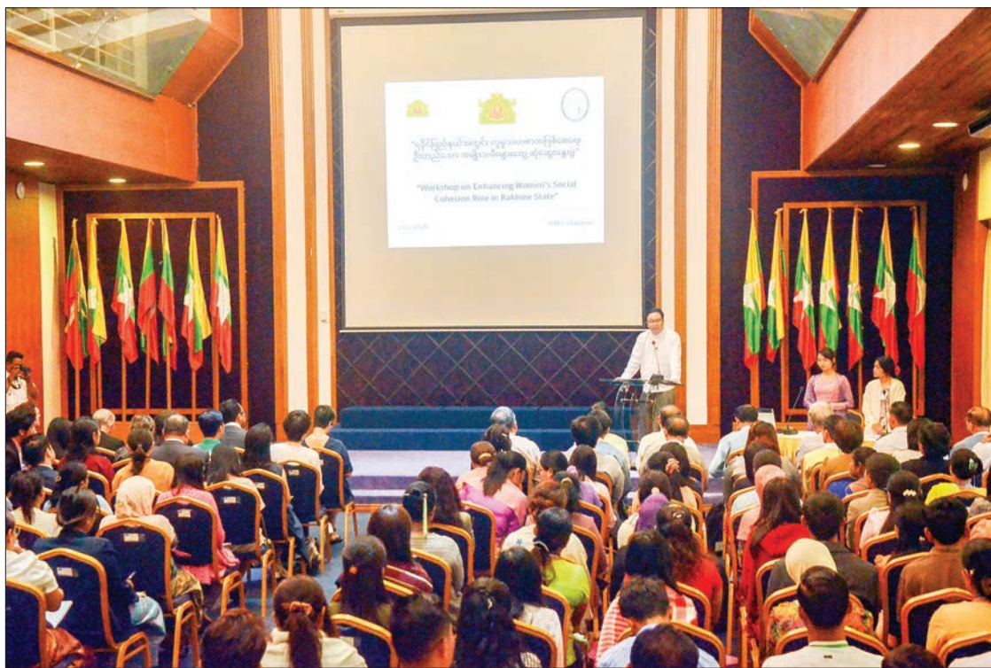
Deputy Minister U Min Lwin delivers the speech at the opening ceremony of the Workshop on Enhancing Women's Social Cohesion Roles in Rakhine State yesterday.

He further stressed the need and urgency of peace and reconciliation efforts in Rakh-