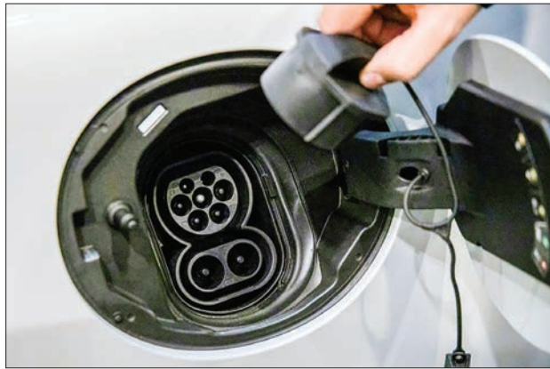
European officials have unleashed billions of euros in subsidies to develop homegrown electric batteries, not least to supply the continent's automotive giants.