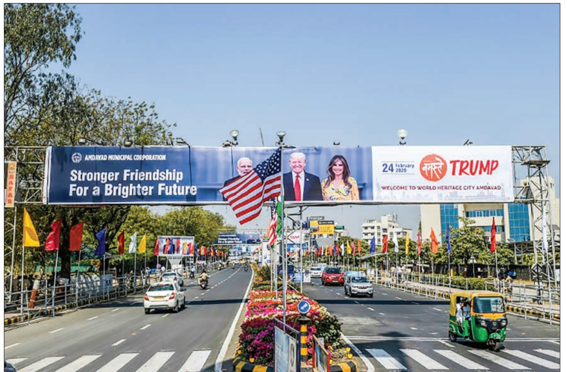
Scores of banners and hoardings with pictures of Donald Trump and Indian Prime Minister Narendra Modi have been put up across Ahmedabad in western India.

The route will be lined with thousands of people — well short of the 6-10 million Trump says he has been told will attend — as