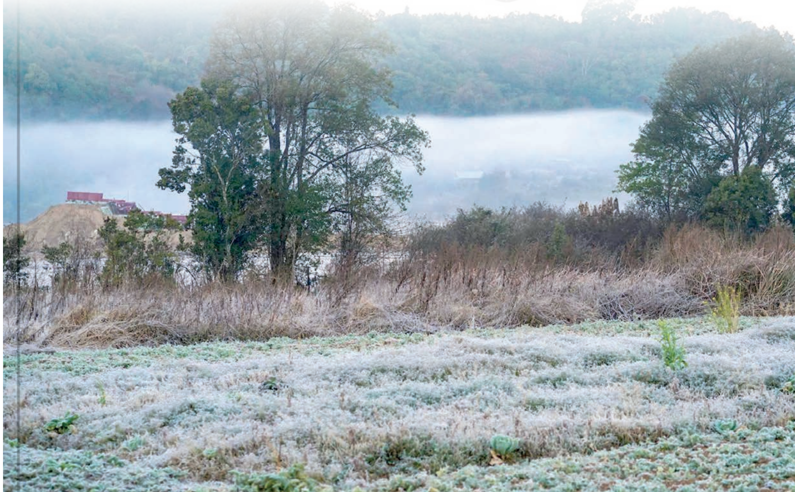
A scene captures icy dusts covering crops and all parts in Bernard Village.

Villagers look like Chinese. Their clothes and behaviors are similar to that of Chinese. They are honesty and frank. When I