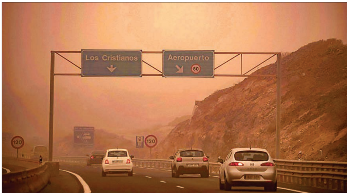
Cars drive on the TF-1 highway during a sandstorm in Santa Cruz de Tenerife, Spain, on February 23, 2020; airports on Spain’s Canary Islands were closed after strong winds carrying red sand from the Sahara shrouded the tourist hotspot.

Strong winds also prevented water-dropping aircraft from putting out fires near Tasarte village in southwest Gran Canaria, which have scorched around 300 hectares of land and forced 500 people to be evacuated, as well as in the neighbouring island of Tenerife.—AFP