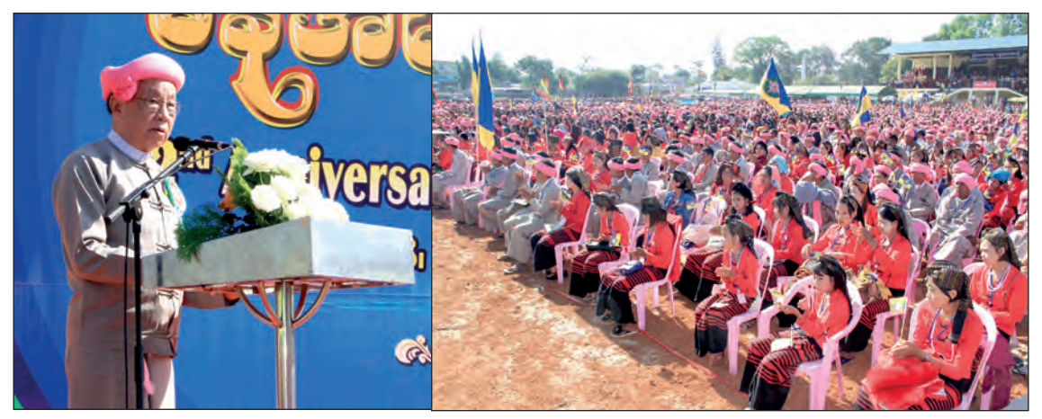
Union Minister Nai Thet Lwin delivers the speech at the celebration for 2<sup>nd</sup> Anniversary of Danu National Day in Nawnghkio, Shan State yesterday.

THE 2<sup>nd</sup> Danu National Day was commemorated in Shan State's Nawnghkio Town yesterday morning.