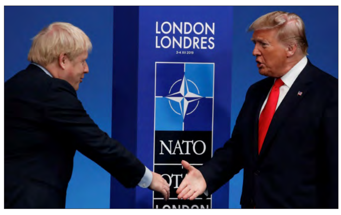
Arriving for the formal NATO talks on Wednesday, Boris Johnson denied he was trying to avoid being seen with Donald Trump.

In a press conference on Tuesday, the president promised to "stay out" of the election cam-