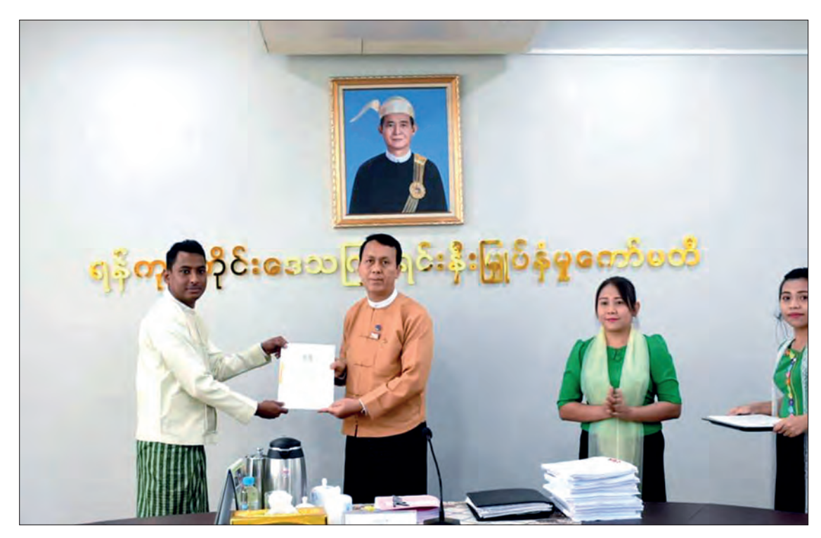
Yangon Region Chief Minister U Phyo Min Thein presents the permission to a responsible person of the FDI projects.