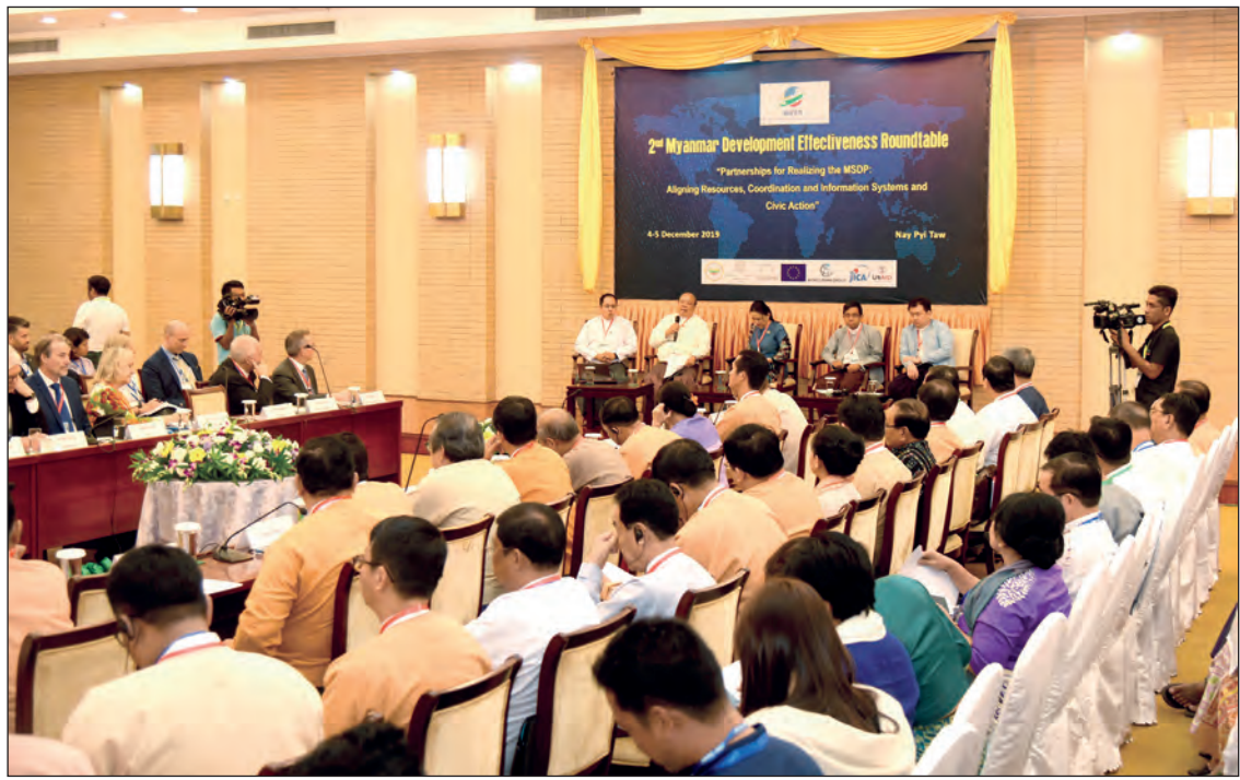
Union Minister U Thaung Tun participates in the 2^{nd} Myanmar Development Effectiveness Roundtable discussion in Nay Pyi Taw on 4 December 2019.

Tun, in his capacity as the vice chairman of Development Assistance Coordination Unit (DACU), reaffirmed that Myanmar government will con-