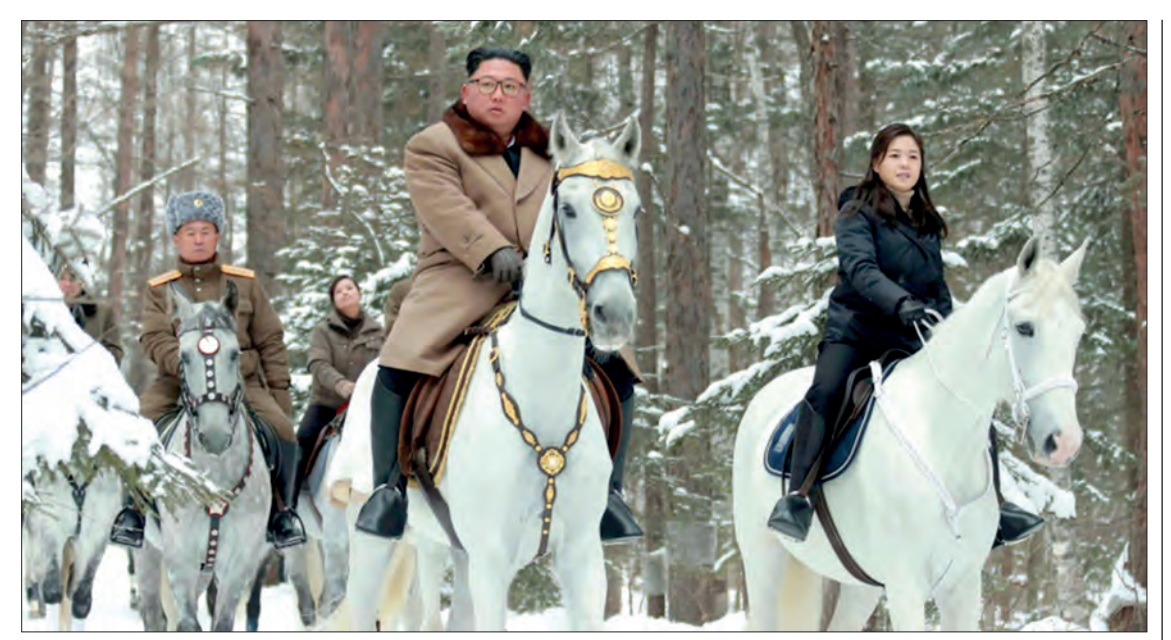
Mt Paektu has great symbolic significance in the North as both the spiritual birthplace of the Korean nation and, according to Pyongyang's orthodoxy, the birthplace of Kim's father Kim Jong Il.