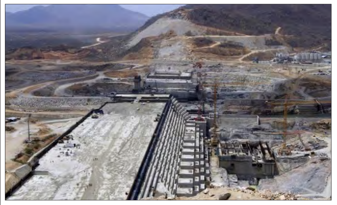
A general view of Ethiopia's Grand Renaissance Dam is seen during a media tour along the river Nile in Benishangul Gumuz Region, Guba Woreda, in Ethiopia 31 March, 2015 - AFP.

Ethiopia started building the GERD in 2011, but Egypt, a downstream country that relies heavily on the Nile for water, is concerned that the dam might affect its share of the water resources.—Xinhua