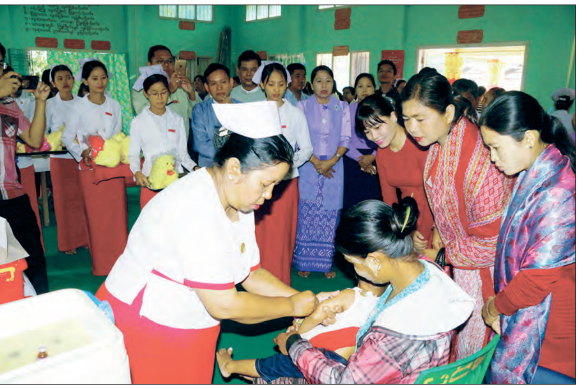
The vaccination program has been a major factor in the improvement of health standards.

gon, the rate of inborn German measles is 0.1 per one thousand. So, measles plus German measles vaccination program was launched in Myanmar in January 2015 and it lasted till February. The program was integrated into the regular national vaccination project in March 2016. After three years have passed, the program to provide extra dose of inactivated polio vaccine (IPV) was