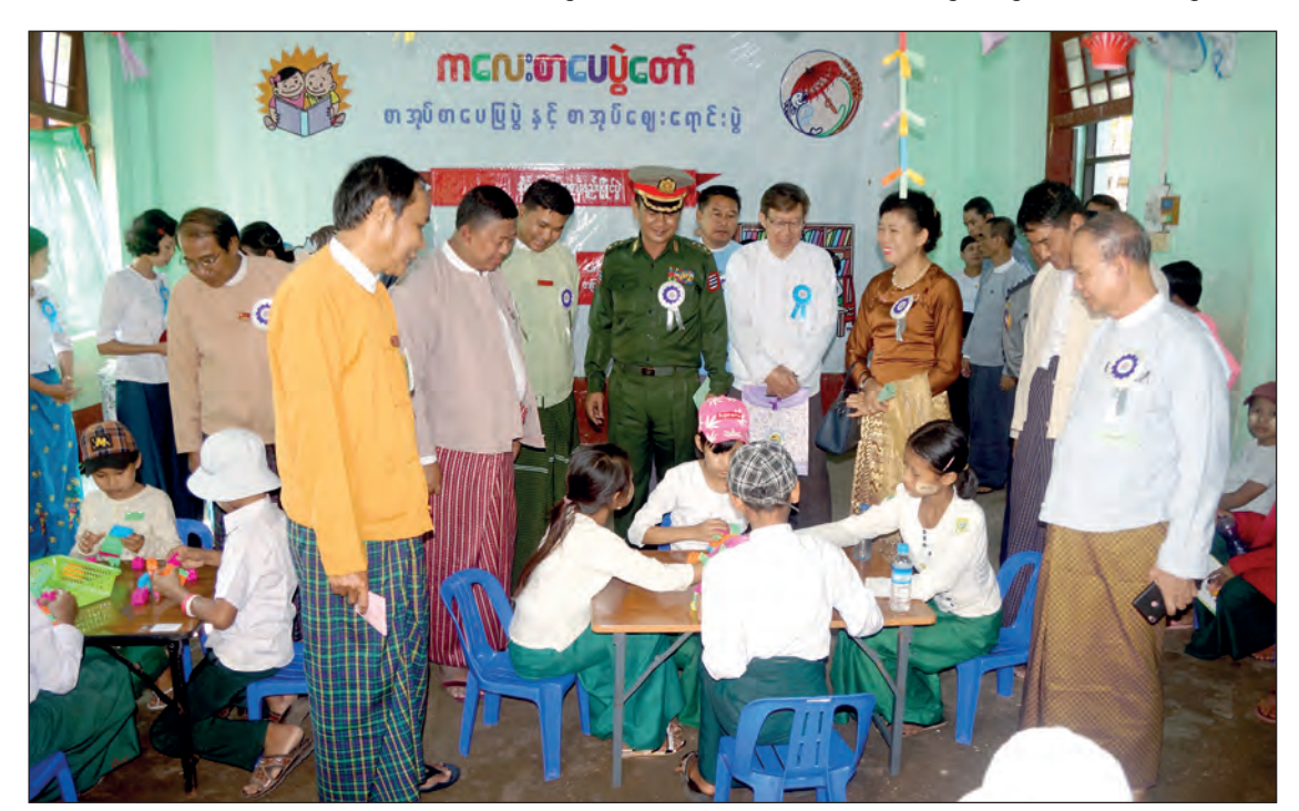
Ayeyawady Region Government officials observe children participating in the competitions during children literary festival in Myaungmya yesterday.

ORGANIZED by the Ayeyawady Region Government, the ninth Children Literary Festival of the Region was opened at the Basic Education High School No.1 (Myaungmya) in Myaungmya