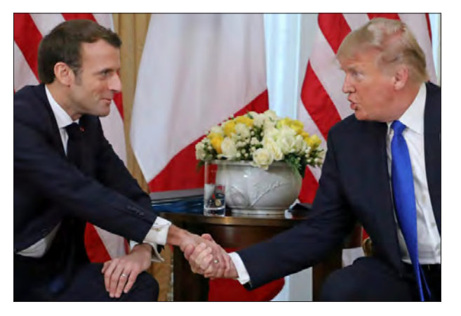
US President Donald Trump and France's Emmanuel Macron held a meeting ahead of a NATO summit in London.

The French president has called for a renewed strategic dialogue with Moscow and demanded that Turkey explain itself over its assault — backed by Syrian rebels Paris sees as extremists — on Kurdish forces and its purchase