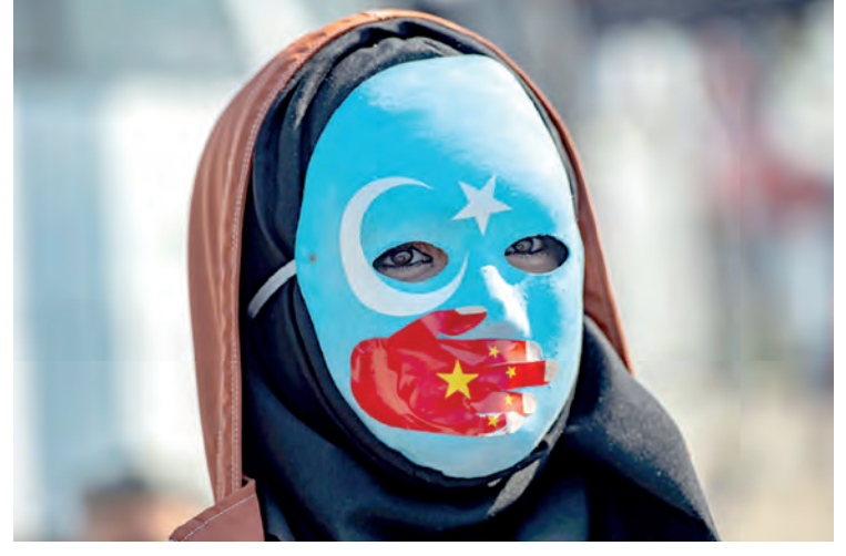
The legislation condemns Beijing's 'gross human rights violations' linked to the crackdown on mainly Muslim Uighurs in Xinjiang.

"If you look beneath that, at the Democrat view and the fact that this was bi-partisan, it seems the only thing the people in politics in Washington can agree on is that China is, somehow, an evil empire," he added.—ANI