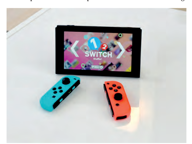
The Nintendo Switch is a hugely popular console around the world, helped by family-friendly games.

Expectations for the console's launch in the world's larg-