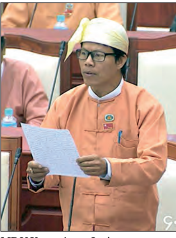
MP U Kyaw Aung Lwin.