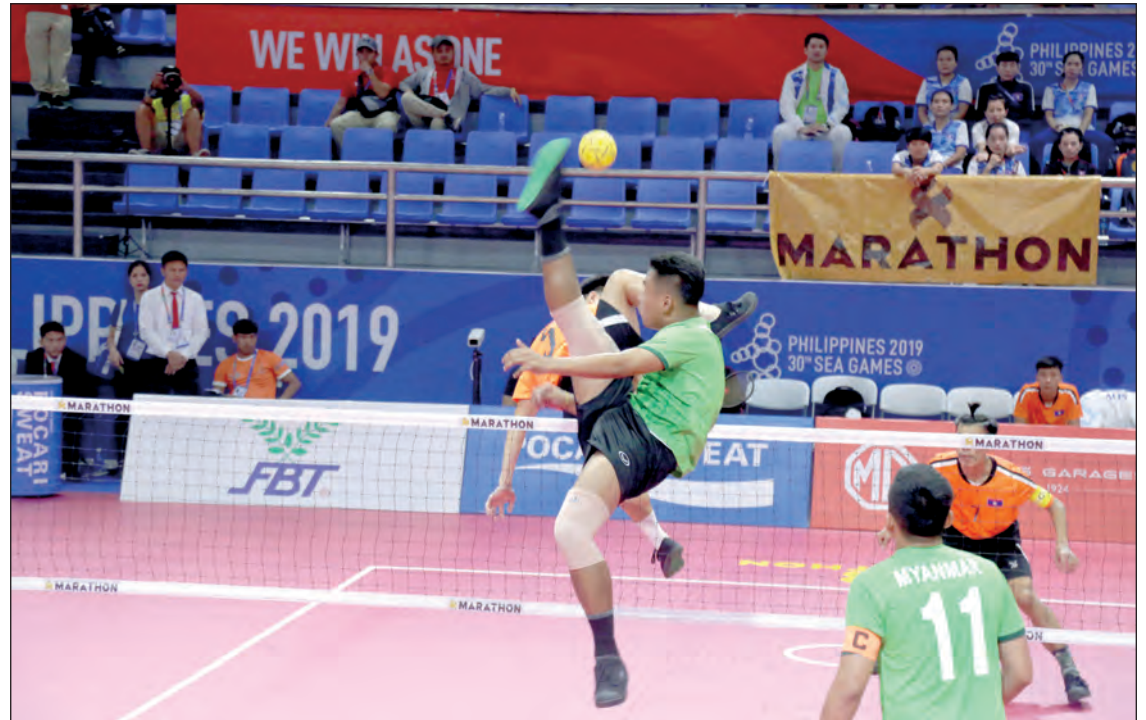
Myanmar and Laos players compete in the men's doubles Sepak takraw competition at the 30<sup>th</sup> SEA Games yesterday at the Subic Bay Gymnasium in the Philippines.