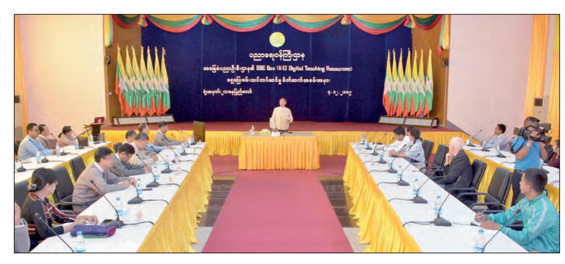
Union Minister Dr Myo Thein Gyi delivers the speech at the launching ceremony of the pilot phase of installation of DBE Boxes (K-12 Digital Teaching Resources) in Nay Pyi Taw yesterday.

"The installation of DBE Boxes is among the reforms based on technology being introduced by the Ministry of Education, and it can be said that the plan will develop educational