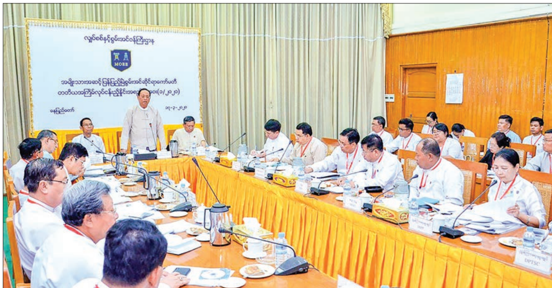
Union Minister U Win Khaing discusses promotion of renewable energy sector at the meeting with National Renewable Energy Committee in Nay Pyi Taw yesterday.

THE National Renewable Energy Committee organized its 3 rd coordination meeting (1/2020) in Nay Pyi Taw yesterday. Chairman of the committee and Union Minister for Electricity and Energy U Win Khaing, its deputy Chairmen Union Minister for Agriculture, Livestock and Irrigation Dr Aung Thu and Union Minister for Education Dr Myo Thein Gyi; and committee members. Union Minister U Win Khaing discussed promotion of renewable energy sector, its resources, raising awareness on energy saving through increasing electricity bill beginning 1 July 2019 and more interesting investors in electricity generation from hydro and thermal powers.