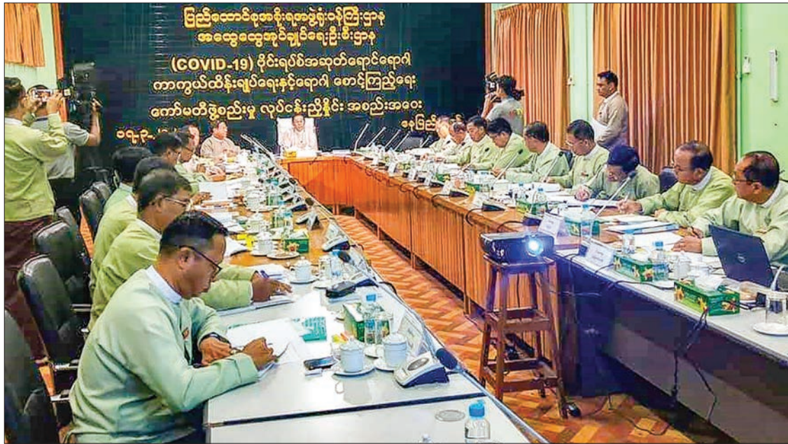
Union Minister U Min Thu delivers the speech at coordination meeting with officials from Region/State General Administration Departments in Nay Pyi Taw yesterday.

A COORDINATION meeting of officials from Region/State General Administration Departments was held to discuss measures on prevention, control and