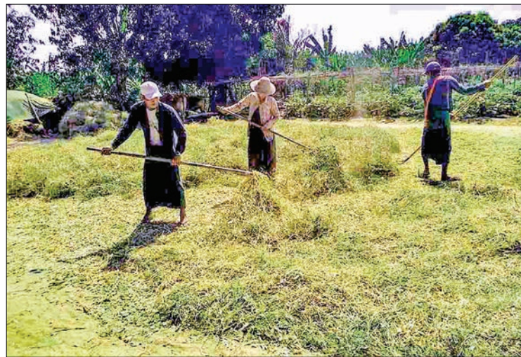
Farmers work in the farm in Pwintbyu Township.

Last year, it fetched a good price of K37,000 per basket. In light of this, they mainly cultivate butter beans this year’s winter. At the harvest time, it is priced at K20,000 per basket only, resulting in losses to the growers. Now, some growers rush to grow bitter melon to cover the cultivation losses of butter beans, and some are preparing for sesame cultivation as summer crop, he added.