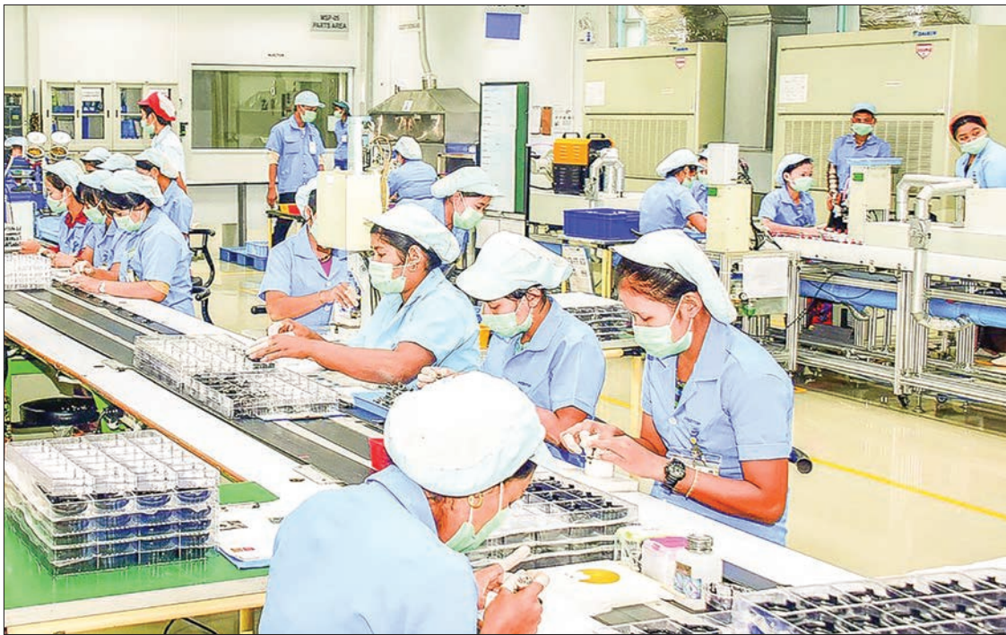
Workers at work in the production line of the Foster Electric Thilawa Co Ltd in Thilawa SEZ.