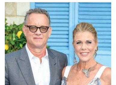
Multiple Oscar-winning actor Tom Hanks was on the Gold Coast near Brisbane to film an Elvis Presley biopic when he came down with coronavirus.

social media about their run-in with COVID-19, thanking their Australian carers and urging their fans to follow the advice of experts on avoiding the disease.