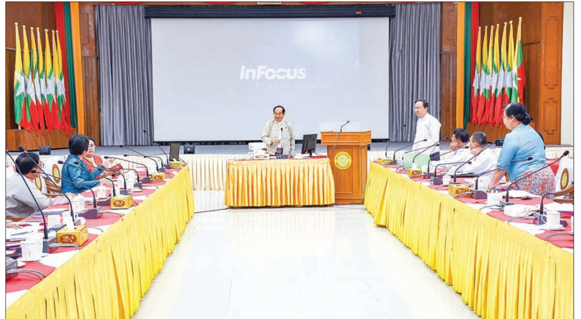
Union Minister Dr Myint Htwe delivers the speech at the central-level daily meeting 36/2020 on COVID-19 virus prevention, control and treatment in Nay Pyi Taw yesterday.

He also stressed the need to immediately scale up current efforts of surveillance with non-contact thermometers to the MPs at the Pyithu Hluttaw and