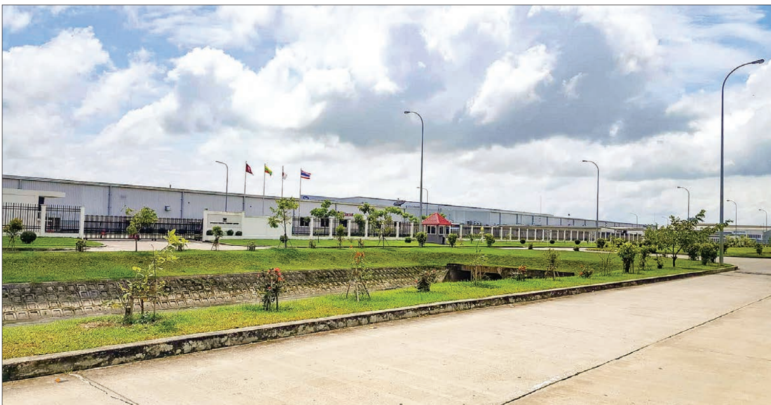
Myanmar Wacoal Company Limited in Thilawa Special Economic zone.

Singapore is the largest foreign investor in Myanmar, pouring more than US$ 22 billion into 312 projects of the Asia's last frontier market between 1988 to date. The majority of the foreign investment from Singapore, China, Thailand, Hong Kong, Viet Nam, Malaysia and United Kingdom came to manufacturing, mining, communications, transport, tourism, agriculture, livestock, electricity generation, real estate and industrial sectors. Myanmar drew up the MIPP with the aim of attracting US$ 221 billion of FDI within 20