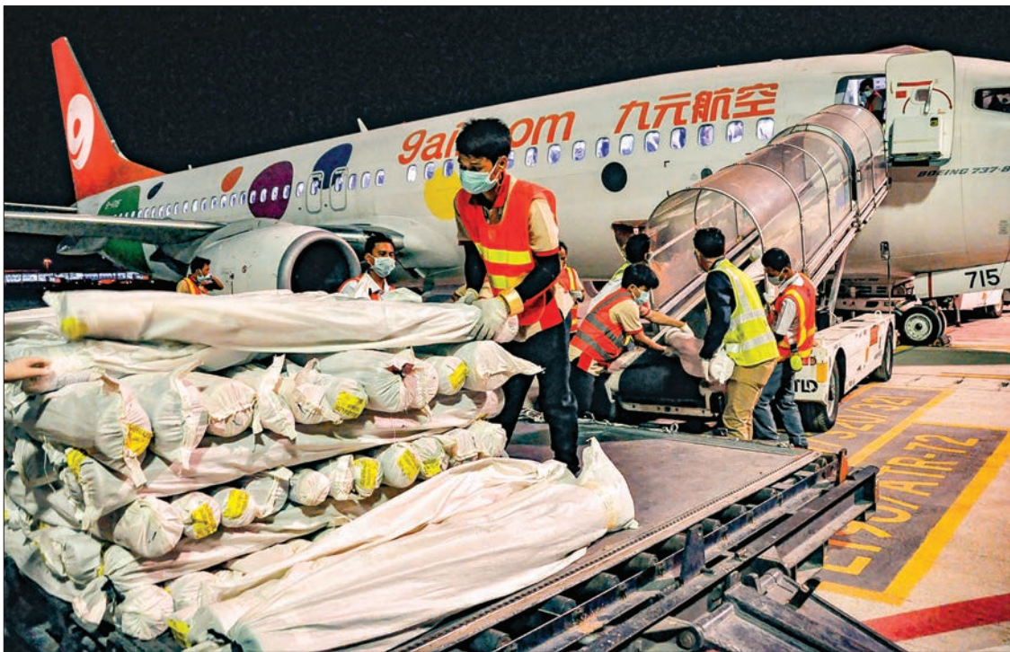
Workers conveying raw materials from the Chinese cargo plane.