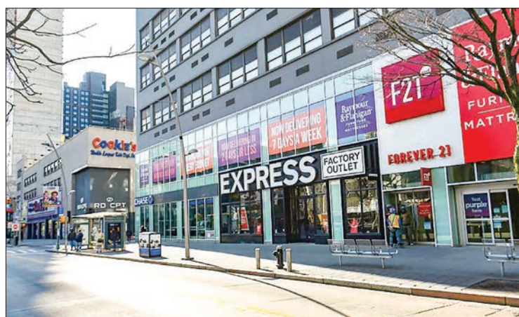
More businesses are expected to need relief from banks as the economic effects of the coronavirus deepen.

The eight largest US banks announced they will suspend share repurchases in order to keep funds that can be used to extend credit to households and businesses hammered by the downturn. "The COVID-19 pandemic is an unprecedented challenge for the world and the global economy and the largest US banks have an unquestioned ability and commitment to supporting our customers, clients and the nation," the Financial Services Forum, which represents the companies, said Sunday. The group — which comprises JPMorgan Chase, Citigroup, Bank of America, Wells Fargo, Goldman Sachs, Morgan Stanley, Bank of New York Mellon and State Street — has amassed more than $914 billion in capital buffers over the last decade. — AFP ■