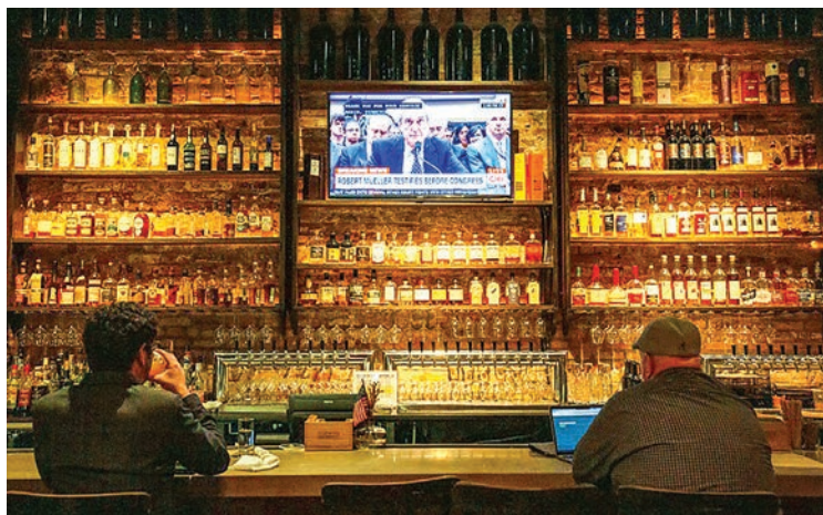
Concord was the only one of 25 Russians and three Russian companies charged by Special Prosecutor Robert Mueller to be brought to trial.

“The government has concluded that further proceedings as to Concord, a Russian company with no presence in the United States and no exposure to meaningful punishment in the event of conviction, promotes neither the interests of justice nor the nation’s security,” it said.— AFP ■