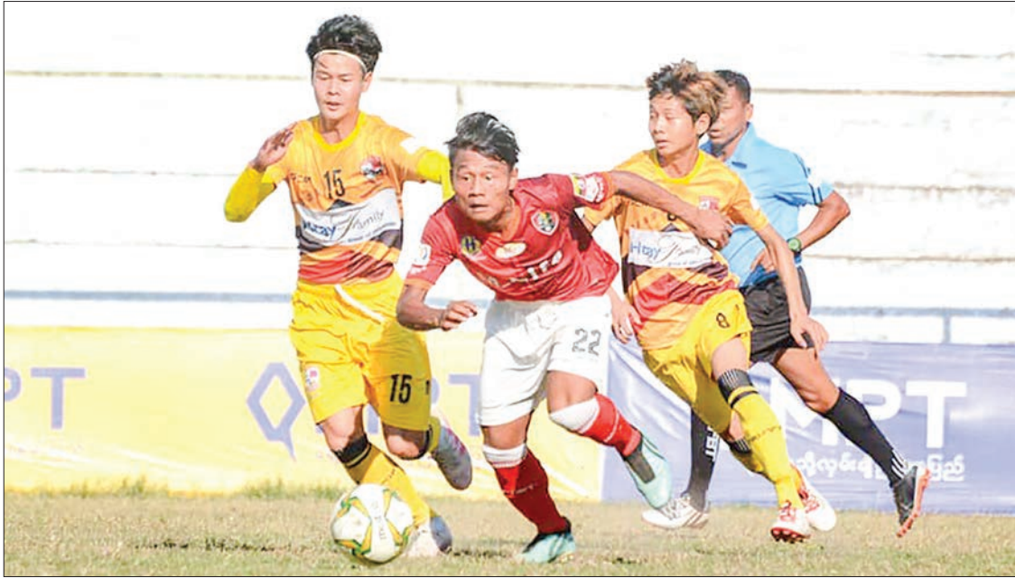
Players of Chinland FC and Silver Stars FC vie for the ball in the Week-10 of MPT Myanmar National League Youth (U-21) 2020 at the Padonmar Stadium in Yangon yesterday.