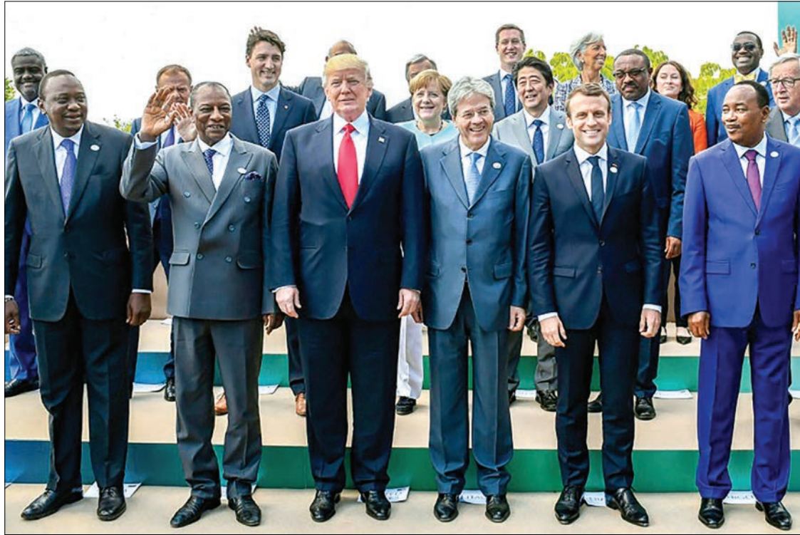
G7 leaders, pictured in 2017, say their finance ministers will talk to each other weekly as the coronavirus ravages the global economy.

port immediately and as much as necessary the workers, companies and sectors most affected,” the statement said.