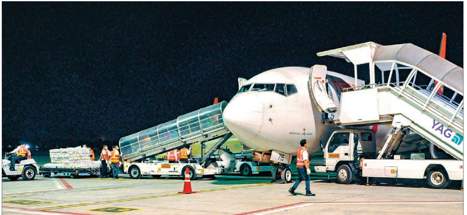
A cargo plane carrying raw materials for garments in Myanmar lands at Yangon International Airport.

the Joint Secretary General of UMFCCI and the Myanmar Garment Manufacturers Association, said, "The raw commodities will be sent to the factories after Customs clearance process tomorrow. It is expected more raw