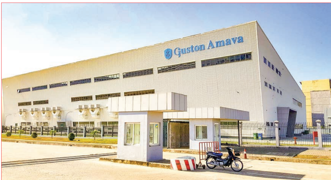
Guston Amava Ltd in the Thilawa SEZ.