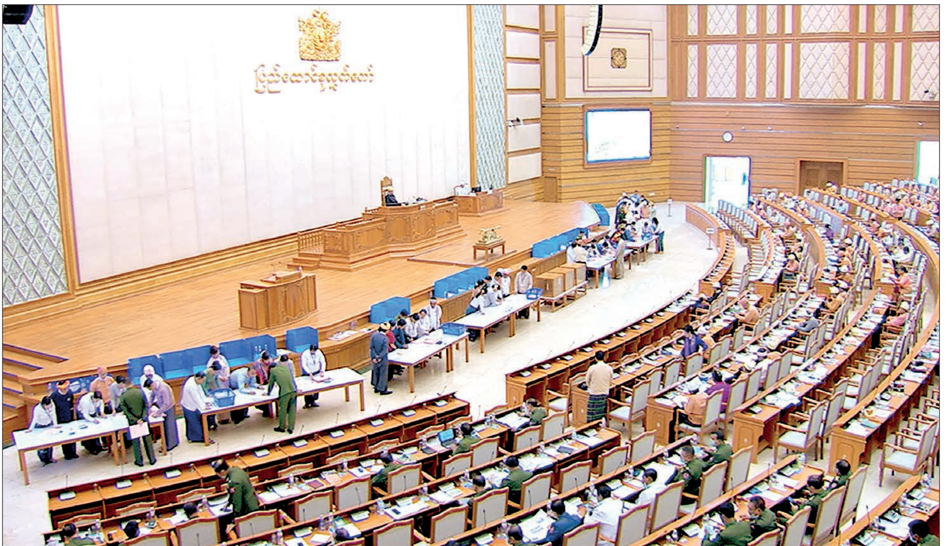
Pyidaungsu Hluttaw convenes its 24 th day meeting of 15 th regular session yesterday.

T HE second Pyidaungsu Hluttaw held its 24 th day meeting of the 15 th regular session yesterday, attended by 631 MPs, out of 654 total representatives, while 23 lawmakers were on leave.