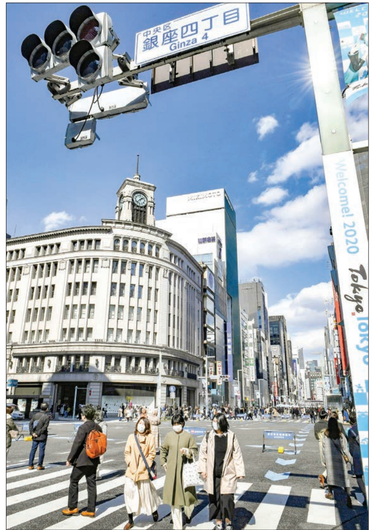
A smaller-than-usual number of people walk in Tokyo's Ginza shopping district on 15 March 2020, amid concerns over the new coronavirus.