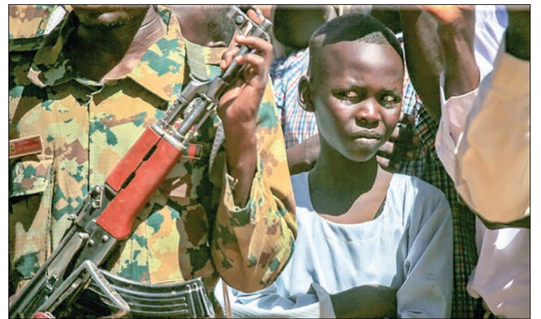
UN says the conflict in Darfur between Sudanese forces and ethnic minority rebels has resulted in about 300,000 deaths and more than 2.5 million displaced people since 2003.

When UNAMID last expired at the end of October 2019, the Security Council unanimously extended its mission for one year with unchanged numbers until the end of March 2020.— AFP ■