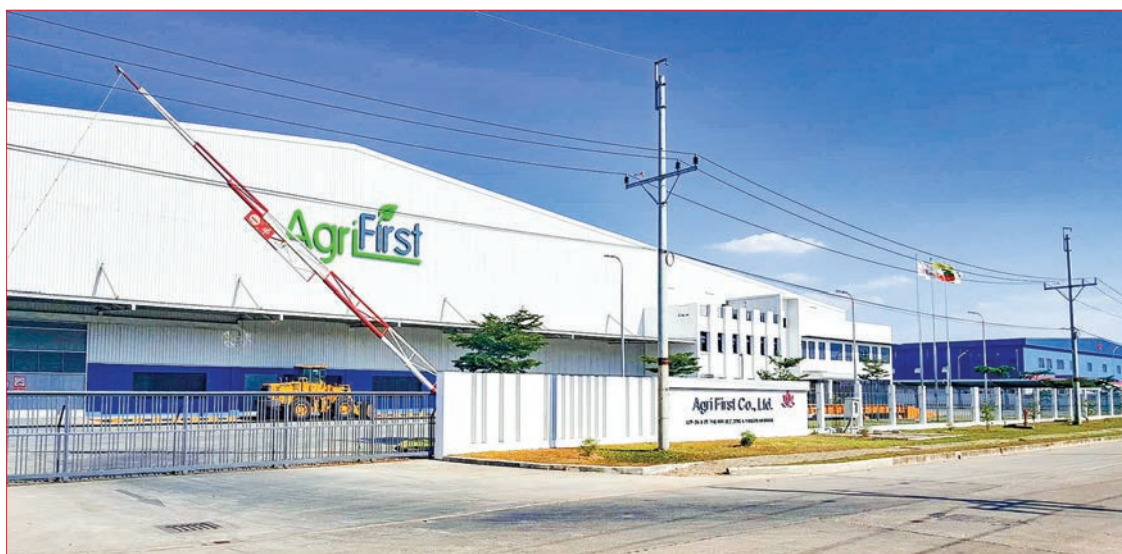
Agri First Co Ltd in the Thilawa SEZ.