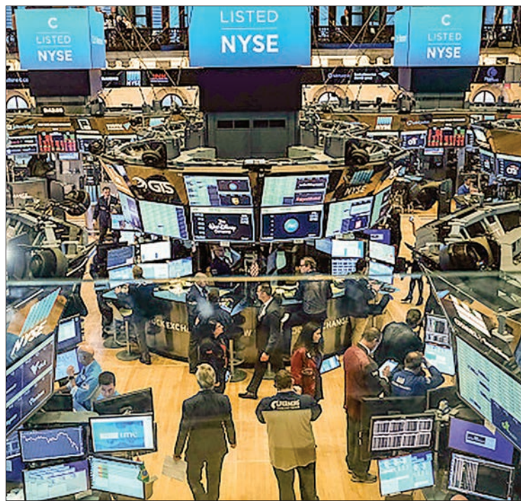
Traders work on the floor of the New York Stock Exchange on 9 March 2020 in New York City.