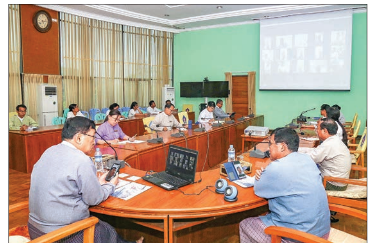
Union Minister Dr Win Myat Aye attends the video conferencing with the ministry's team in closing Kyauktalone IDP Camp in Nay Pyi Taw yesterday.

and health sector. The new place for the IDPs are located about two furlongs from the Kyauktalone IDP Camp. The team also held a negotiation with the IDPs at the camp. In the afternoon, the team reported on the negotiation with seven townselders from Kyaukpyu, and the Union minister gave necessary instructions. The team will also meet with the Rakhine State government and departmental officials in efforts to close the IDP Camp.—MNA (Translated by TTN)