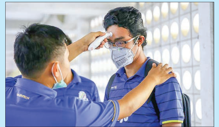
An official checks the body temperature of a training attendee at the basic life-support course at the Thuwunna Stadium in Yangon yesterday.

“This course is aimed to ensure the safety of life for people, especially football players, when their hearts suddenly stop they need to be provided with emergency medical care.” explained