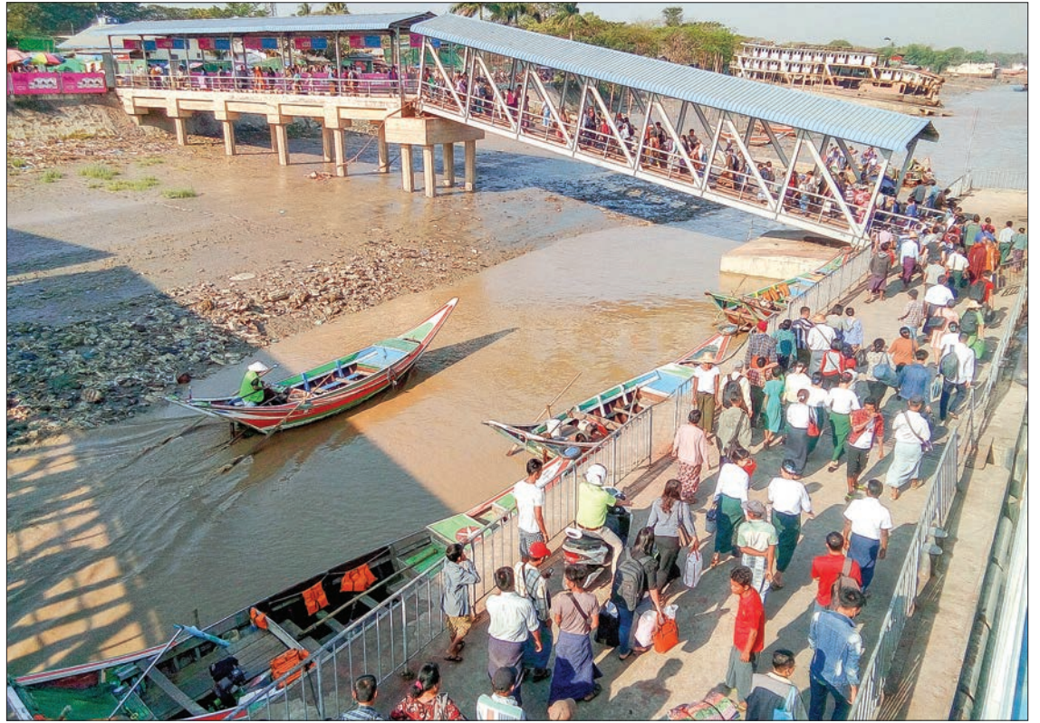
Passengers are seen at the Dala Port.

is the only gateway for the local people in southern Yangon - Dala, Twantay, Kawhmu, Kungyangon townships and some townships in Ayeyawady Region to link with commercial city hub of Yangon. Three motor vessels named Cherry 1, 2 and 3, donated by Japan, have been running 46 times