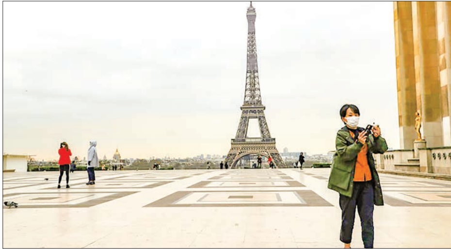
France has ordered most people to stay home from midday Tuesday.

With French President Emmanuel Macron describing the battle against COVID-19 as a “war”, governments around the world are scrambling to keep the public safe with measures rarely seen in peacetime, slamming borders shut and forcing citizens to stay home. The crisis is infecting every sector of the