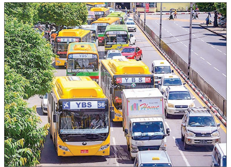
YBS buses in the downtown Yangon.