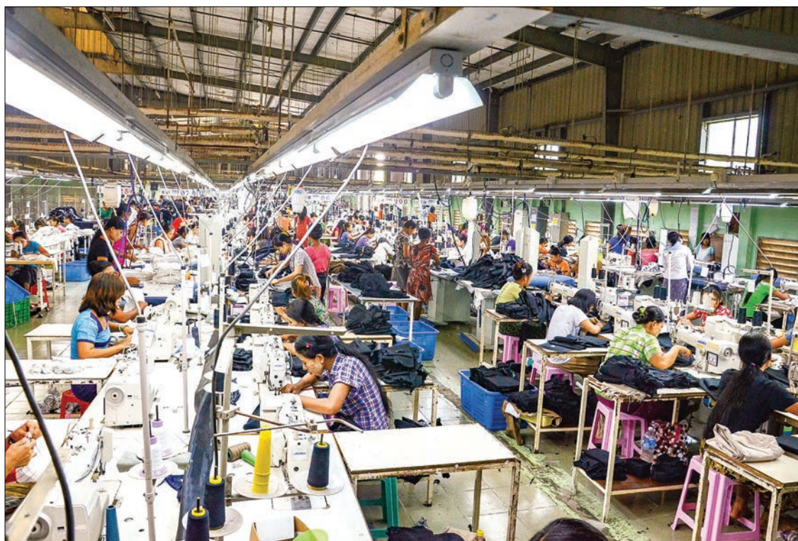
Workers sew garment at a factory in Yangon.